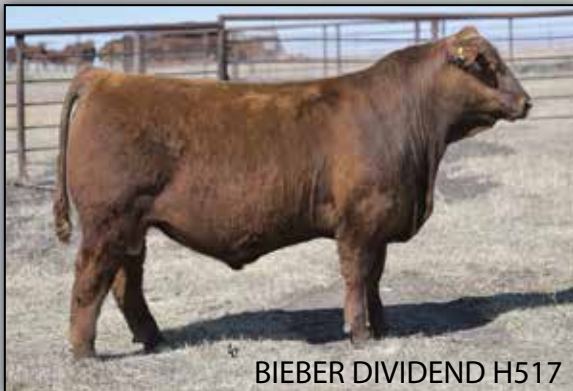
BIEBER DIVIDEND H517