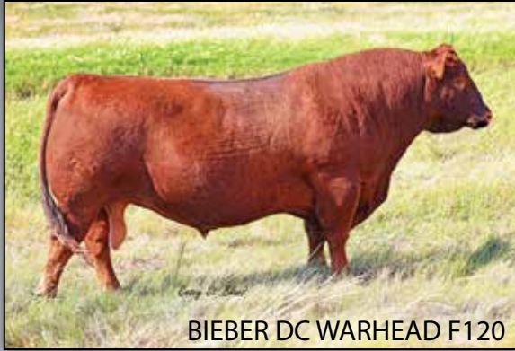
BIEBER DC WARHEAD F120