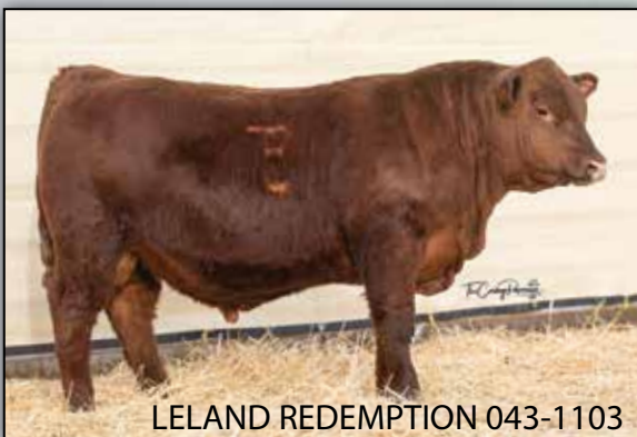
LELAND REDEMPTION 043-1103