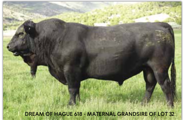
DREAM OF HAGUE 618 - MATERNAL GRANDSIRE OF LOT 32

Purebred Angus. Low input cost, maternal efficient cows are lined up for generations here. Do you like cows that wean a high % of body weight? Dam's production 2 @ 99, Grand dam's production 5 @ 103.