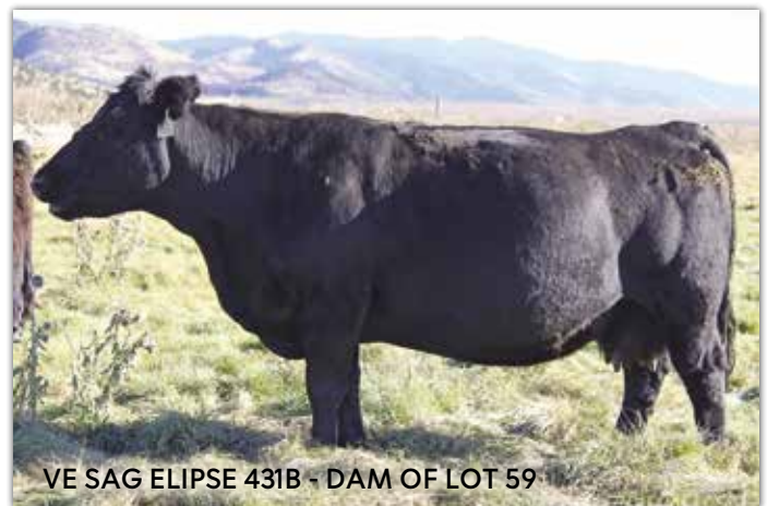
VE SAG ELIPSE 431B - DAM OF LOT 59

Homozygous Polled, Solid Black, 3/4 SM 1/4 AN. A maternal brother to Eclipse and is the natural calf of the 431B donor. Single bull breeding pastures and a lame bull...but don't hold that against him. Highly recommended! Dam's production 6 @ 90, Grand dam's production 9 @ 102. Retaining 1/3 semen interest. NEOGEN GGP