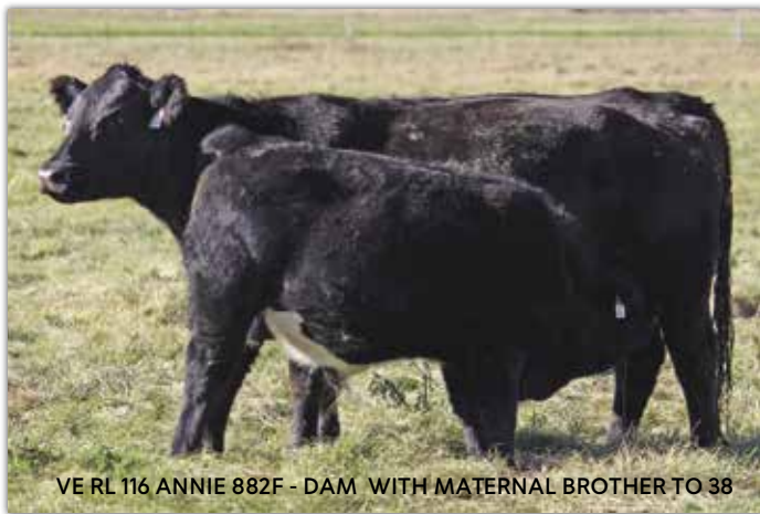
VE RL 116 ANNIE 882F - DAM WITH MATERNAL BROTHER TO 38

Purebred Angus. The Auto offspring have served us well with quietness, hard feet and they have been intelligent calves. Dam's production 3 @ 107, Grand dam's production 6 @ 103.