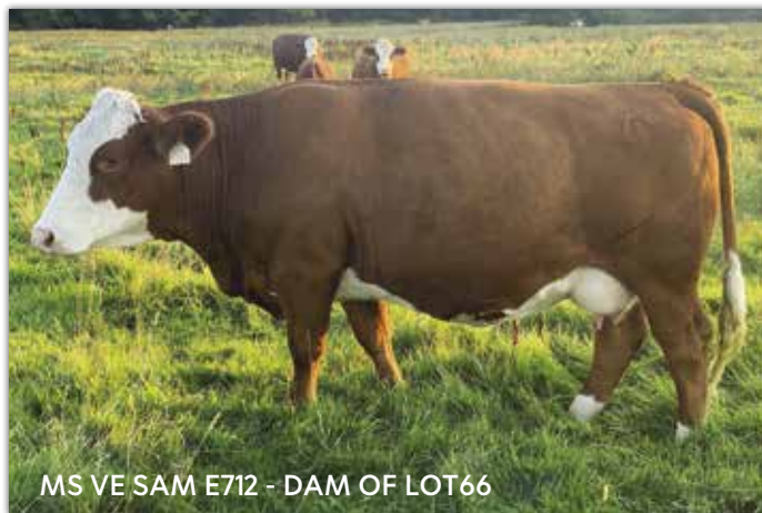
MS VE SAM E712 - DAM OF LOT66

Polled, 100% Fullblood Fleckvieh. Hard to find polled Fleckvieh heifers like this. Her dam has a great udder. Dam's production 4 @ 116. Sells open.