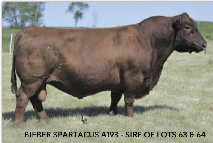
BIEBER SPARTACUS A193 - SIRE OF LOTS 63 & 64