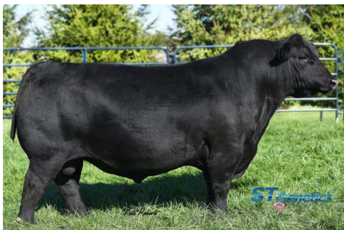
S Powerpoint WS 5503

Powerpoint is the go-to sire for growth, eye-appeal and muscle expression. His sons are big middle, expansive designed bulls. Powerpoint is a sire whose progeny will excel across all facets of the beef industry from birth to the plate.