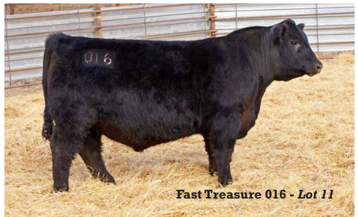
Fast Treasure 016 - Lot 11