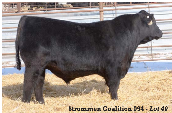
Strommen Coalition 094 - Lot 40

A phenotypically correct, powerful son of Coalition. He's thick, has a monster hip and has great feet. The dam and granddam are both very good producers with great temperament. Dam has a NR of 3/105 and is the most gentle cow we have. The Pathfinder Tiger grand dam is a whopping 4/108 NR and 4/109 for YW. Great potential in this one!