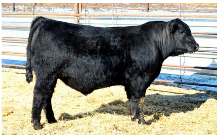
Fast-Strommen Summitt 915 , sired by ZWT Summitt 6507, sold to Mike Pitner, Minot, ND, in our 2020 sale.

Suitable for heifers or cows. This is the first calf out of the first natural daughter of the great Erica 24 cow who has grossed over $110,000 in revenue. This Bismarck herd sire prospect has showed very good growth for being a low birth weight heifer bull.