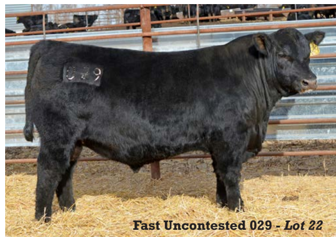
Fast Uncontested 029 - Lot 22

This super attractive, structural correct and long-bodied bull combines the great maternal trait sires AAR Ten X and Connealy Consensus with our Matilda cow family that has produced three generations of Pathfinder cows. A larger frame bull that moves with a long stride. Dam's ratio: 5/102.