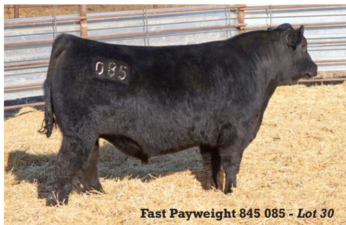
Fast Payweight 845 085 - Lot 30

Suitable for heifers or cows. This deep sided, wide built bull ranks in the top 25% of the breed for $B and top 10% of the breed for $C. He is an ideal calving ease prospect with two generations of low birth weight bulls in Connealy Onward 4124 and Connealy Power Pro 370. Dam's ratio: 4/102.