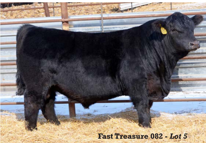
Fast Treasure 082 - Lot 5

This flush brother should be an ideal choice for use on heifers. A little more moderate framed bull than his brothers, he also has the extra thickness, depth of rib and growth performance that his dam, Fast Primrose Conf 370, consistently stamps in her progeny. Dam's ratio: 6/105.