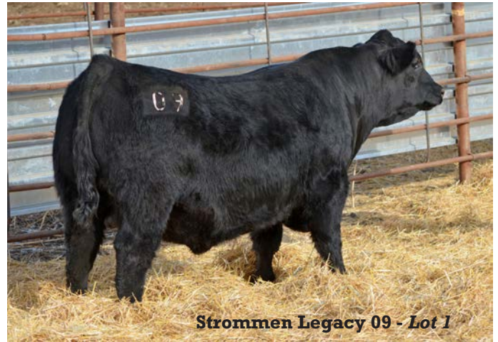
Strommen Legacy 09 - Lot 1

Starting out the sale offering is this super deep sided, super attractive, well-balanced and long-bodied bull that combines weaning performance and carcass quality. The 837 sire group had a 106 average weaning ratio in the 2020 calf crop. We weighed this guy at an impressive 996# at just shy of 8 months old. Could very well be one of the best bulls to sell anywhere this year! Retaining a 1/3 interest.