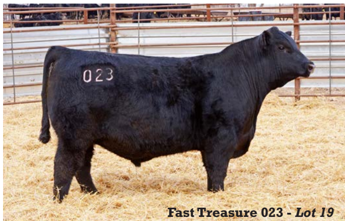
Fast Treasure 023 - Lot 19

Another Coalition son that is gentle and easy to handle! His dam is a grand daughter of the great maternal sire Soo Line Alternative and is a Patherfinder cow, likewise his great grand dam. A long bodied, deep sided bull, with a super wide top and rump. Dam's ratio: 3/107.