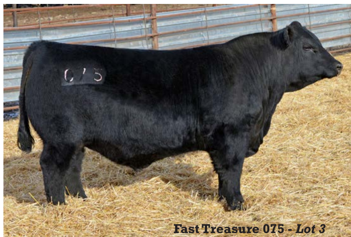
Fast Treasure 075 - Lot 3

Suitable for heifers or cows. An elite herd sire prospect that checks just about every box! A bull stacked with muscle, depth and good looks that combines the calving ease genetics of Treasure and superb maternal traits of Confidence. He ranks in the top 10% of breed for WW and top 15% for YW. He posts a Marb: +.84 and $G: +59, and meets CAB acceptance standards. Dam's ratio: 6/105. Retaining a 1/4 semen interest.