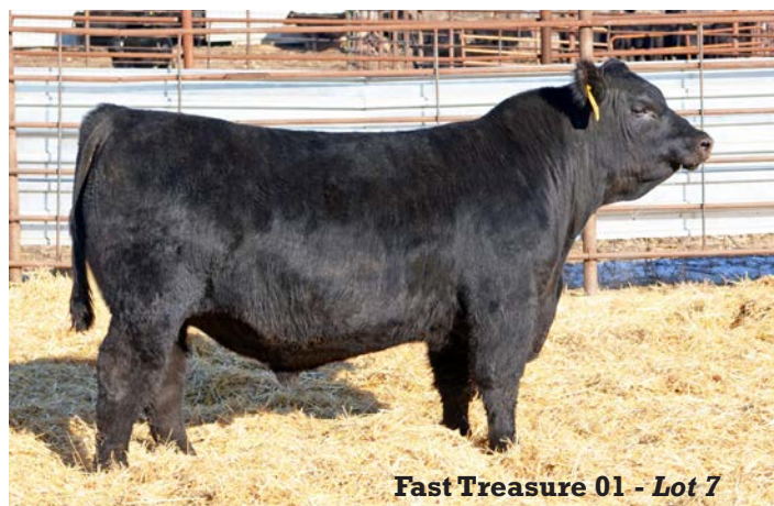
Fast Foundation 013 - Lot 7

Suitable for heifers or cows. A long bodied, smooth made, well-balanced bull that combines the calving ease genetics of Carter Foundation with the maternal advantage traits of Fast Capitalist 414. He ranks in the top 10% of the breed for $B and top 3% of the breed for $C. Like a lot of the Foundation sons, he has a good temperament. Dam's ratio: 1/100.