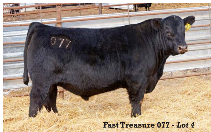
Fast Treasure 077 - Lot 4

His low birth genomics suggests that he could be used on heifers as well as cows. Don't miss this smooth made, long-body and well balanced flush brother, who ranks in the top 20% of the breed for CED, top 30% for BW, top 10% for WW, and top 10% for YW. He has a super gentle disposition and loves to get scratched! Dam's ratio: 6/105.