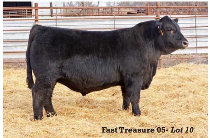
Fast Treasure 05- Lot 10

He is a super attractive bull with loads of muscle expression and a quiet disposition. He ranks in the top 1% of the breed for WW and top 2% for YW. In addition, he posts a +1.13 for Marb and +74 for $G, ranking him in the top 5% for those traits. He qualifies and meets CAB acceptance standards. Dam's ratio: 1/109.