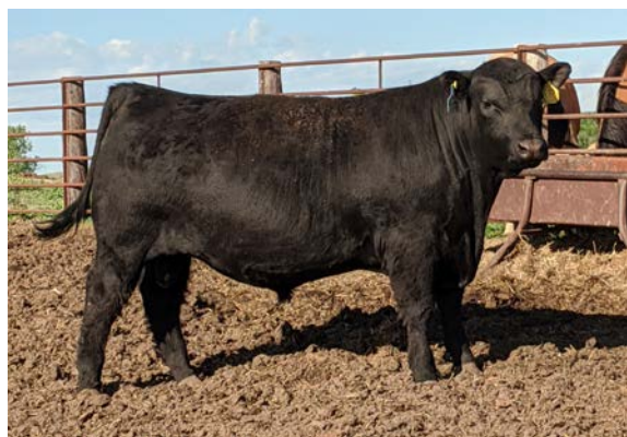
Fast Cha-Ching 97 on the Joseph Angus Ranch, Winner, SD.

Suitable for heifers or cows. A calving ease bull, plus high growth performance, plus ideal carcass traits for CAB, plus a good looking scamp...you could drive the wheels off your truck looking for this combination! His dam is a first-calf heifer and a daughter of Fast Capitalist who is turning out tremendous females. Dam's ratio: 1/110.