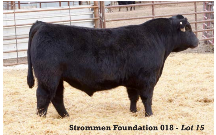
Strommen Foundation 018 - Lot 15

Suitable for heifers or cows. If you are looking for something to do a good job on both sides of the alley, this guy is one to look at! He has an incredibly maternal bred sire and a powerful, pound producing. He's moderate and is the type and kind to make great females! Dam's Ratio: 3/108.