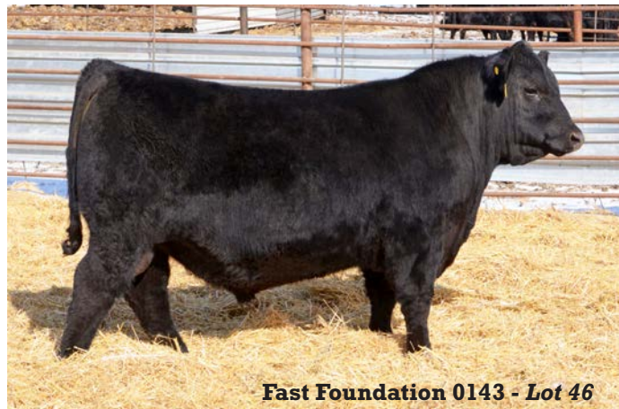
Fast Foundation 0143 - Lot 46

Suitable for larger heifers or cows. Super attractive with loads of eye appeal, this bull is sure to catch your eye! His dam is an easy-fleshing Resolute daughter and his grand dam is sired by the calving ease specialist Power Pro. Dam's ratio: 2/103.