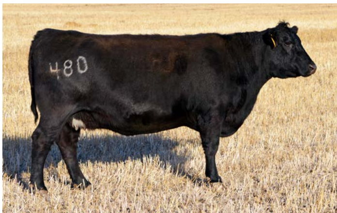
Fast Matilda SB 480, Pathfinder dam of flush brothers, Lots 22-24.

Phenotypically, he is a bit like his flush brother 029, Lot 22, and presents a long bodied, stylish look. His genomics and EPDs suggest that he'll produce beautiful females and scale crushing males. Dam's ratio: 5/102.