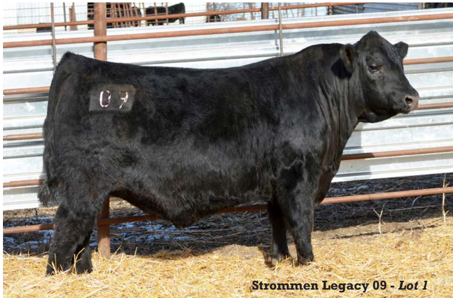
Strommen Legacy 09 - Lot 1