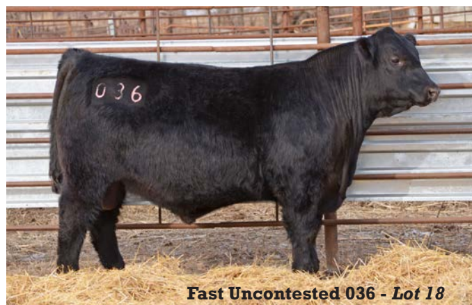
Fast Uncontested 036 - Lot 18

She produced another good one! He is a half brother to Fast Cha-Ching 97, the high selling bull in our 2020 sale. A structural correct, deep sided bull with a long spine, a clean front and good feet and legs. He posts a +.85 for Marb and +57 for $G which gives him genomics for added carcass value. Dam's ratio: 2/120.