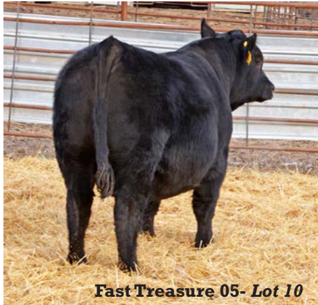
Fast Treasure 05- Lot 10

Nearly as wide as he is deep, with a wide base and a stout foot under each corner. His dam, a first-calf heifer, comes from the super maternal, high performance Primrose cow family. Both his grand dam and great grand dam are Pathfinder cows. He ranks in the top 3% of the breed for WW and YW. Dam's ratio: 1/117. Retaining a 1/4 semen interest.