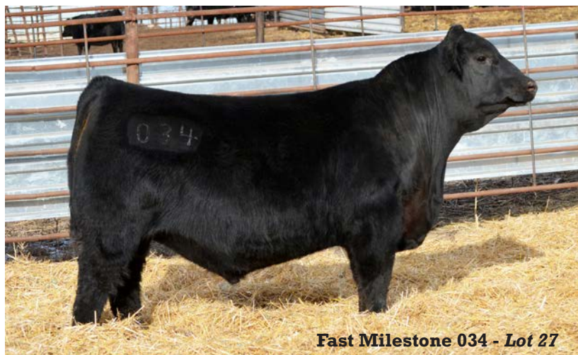
Fast Milestone 034 - Lot 27

"He has the ideal claw set and foot angle as well as structural soundness" Jeremy Strommen.