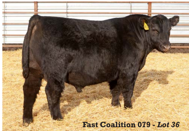
Fast Coalition 079 - Lot 36

A larger framed bull with tremendous length of body along with the eye appeal and structural correctness that U-2 Coalition consistently sires. His Pathfinder dam who produces a good one every year, is also the dam of Fast Payweight 794 981, purchased by Kevin Sailer, Dodge, ND, in our 2020 sale. Lot 36 also has a great disposition and likes to be scratched. Dam's ratio: 4/107.