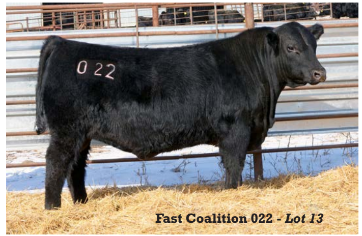
Fast Coalition 022 - Lot 13

Visit us at the ranch and attend our sale to learn why our customers are happy with their bulls!