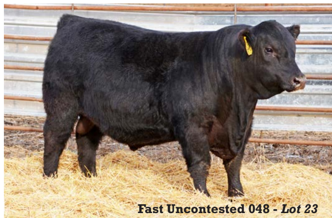
Fast Uncontested 048 - Lot 23

The deeper bodied, wider made brother of the flush with loads of muscle expression over his top and through his rump. A product of the our Matilda cow family know for their longevity as well as sound feet and udders. He really crushed the scale at weaning time! Dam's ratio: 5/102