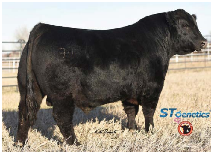
C Bar Uncontested 6209

Uncontested's first progeny are setting the bar high for performance cattle in the right package. He is wide-based with expansive rib shape and an expressive muscle pattern. Uncontested is a balance trait sire that has important traits like CED, YW, RADG, HP, CW, RE and $B all at the top of the breed.