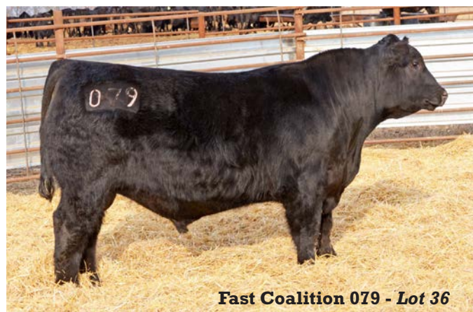
Fast Coalition 079 - Lot 36

This big testicled bull is thick and easy-fleshing with good depth of rib as well as spring of rib. He's got a great disposition and is among the first waiting at the gate in the morning to be scratched! His 11-year-old, Pathfinder dam, maintained a sound udder well into her prime. Dam's ratio: 10/99.