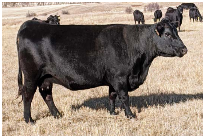
Fast Primrose Conf 370, Pathfinder dam of Lots 3-5

"If you're looking to put uniformity and growth performance in your calves, keep these flush brothers together," - Jamie and Richard Fast.