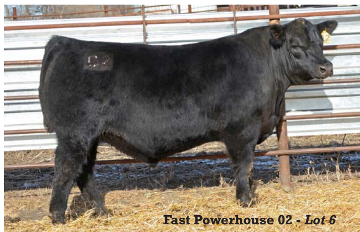
Fast Powerhouse 02 - Lot 6

A powerhouse bull that is wide from top to bottom with loads of muscle expression. His proud carriage and eye-appeal always catches the attention of visitors to the ranch. He ranks in the top 2% of the breed for WW and YW. Dam's ratio: 1/115. Retaining a 1/4 semen interest.