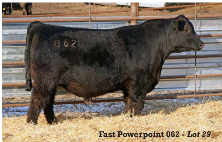
Fast Powerpoint 062 - Lot 29

Generation after generation, the good ones keep producing good ones! His Pathfinder dam has been a top producer as well as his maternal grand dam that produced 13 progeny for a ratio of 104 which included three sets of twins. His overall quality and structural correctness will catch your eye! Plenty of growth performance, he is an out-cross bloodline for repeat customers. Dam's ratio: 6/108. Retaining a 1/4 semen interest.