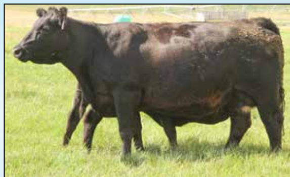
Dam of 126X