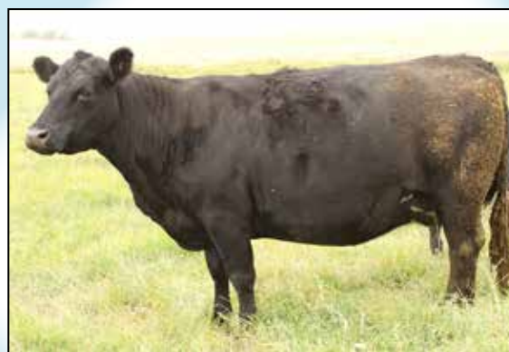
Dam of 137X