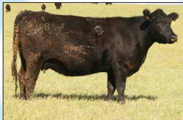
Dam of 70X