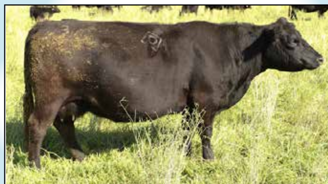
Dam of 25X