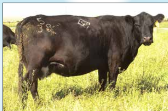
Dam of 85X