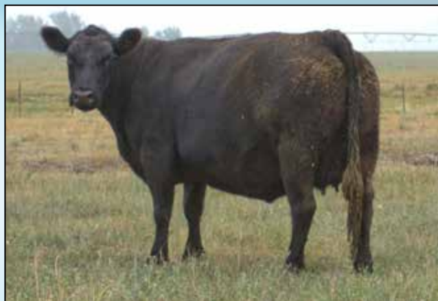
Mother to 77U

N Bar Emulation EXT # Emulation N Bar 5522 # O C C Great Plains 943G # + N Bar Primrose 2424 Dixie Erica of C H 1019 DDA Emblazon 27C # Dixie Erica of C H 615 Lodge of Wye Career of Wye DDA Melisa E808 Lorena of Wye D D A Melisa 824 Shoshone 130-6357 D D A Melisa 545