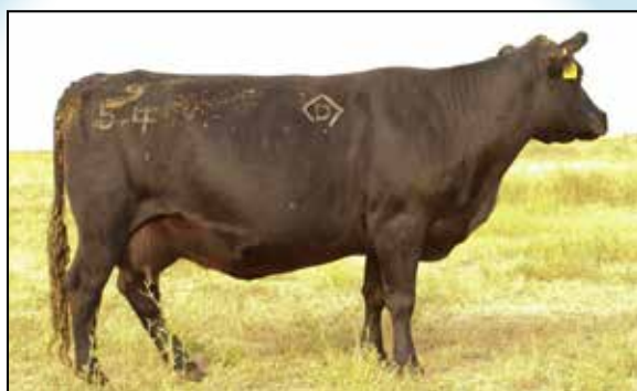
Dam of 63X