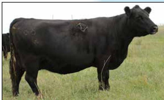
Dam of 57X