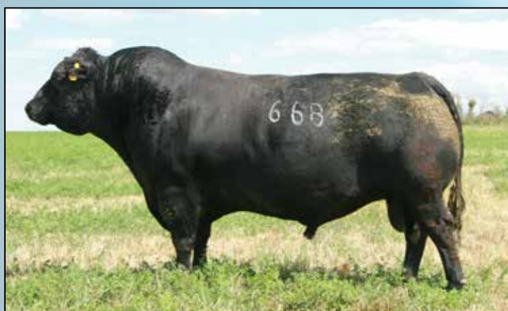
Sire to DDA Pondera 10U

The Pinebank SE 9D and 10D are \frac{3}{4} brothers, they are out of a flawless old cow that stayed in production for many years. She was my favorite cow when I visited the Pinebank herd in New Zealand. You see the cream rises to the top with time. I believe that even when people are uncertain about what bull or cow to concentrate on, just by looking at a pedigree and knowing the number of good proven cows and bulls in it, it is a good yard stick on what the offspring will do. Both the Pinebank SE 9D and 10D both look fantastic with great structure. Average birth weight on 8 sons is 81 pounds out of mature cows. The 10D is sire to sale bulls, 20X, 28X, 36X, 53X, 59X, 94X, 118X, and 137X.