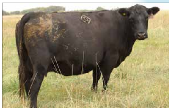
Dam of 161X