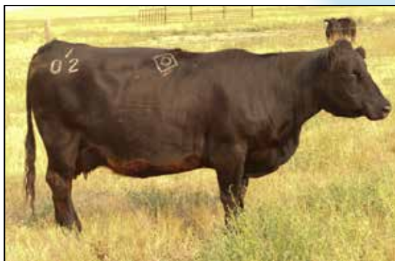
Dam of 96X

Grandmothers on both sides of this pedigree are model cows. The DDA Holly 102 is ten years old and a paternal sister to our DDA B&T 18K. Like most pedigrees here at Diamond D Angus, I find a ton of function and longevity. Our DDA Fahren 5Z traces to our 580/368 cow family. The Miss Diamond Jumbo 587 is a paternal sister to the 580 cow on bottom. The Sandy 404 is the mother to Sandy 308, and a daughter of the 587. She stayed in production for 22 years. We also have Banjo, and Fahren. No question this good bull will sire outstanding daughters.