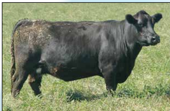
Dam of 11X