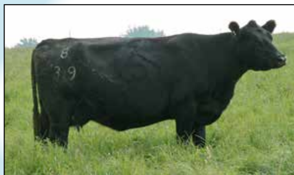
Mother to 51X