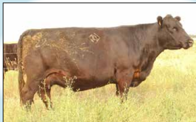
Mother to 47X

When I think about the DDA Bar Lad 177U, there is no doubt about the function and longevity in this great pedigree. DDA Hana 940 cow did her job for 20 years, her mother did her job for 22 years. This does not happen unless you select for function and longevity. In fact most traits that EPD numbers measure are antagonist to function and longevity. We also wrote "very, very" soft temperament on this young bull and you will want to save every daughter he produces.