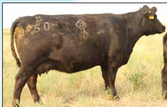
Dam of 131X