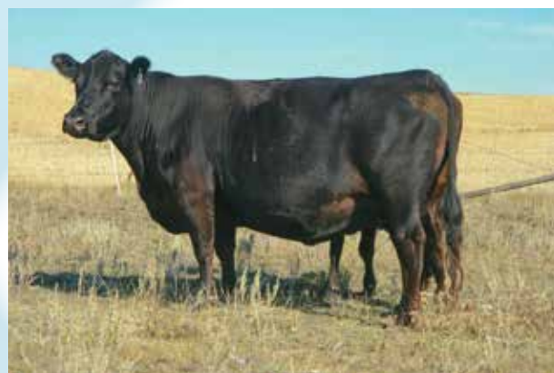
DDA Melisa 824