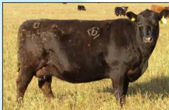
Mother to 77X

Wow, Hyland BC 0668 is the grandsire on both sides of this great pedigree. The DDA Surgeon 77X traces to Lodge of Wye too many times for me to count. He also traces to our DDA Melisa 824, several times. Buy this bull with confidence! He will produce some of your favorite mother cows. Due to his intense line breeding, he will sire calves that perform much better than himself. That is if you use him on unrelated females.