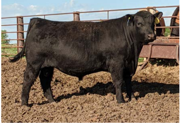
Fast Cha-Ching 97 on the Joseph Angus Ranch, Winner, SD. Cha-Ching sold in our 2020 sale and has been used quite heavily in our herd.

A very good Raindance bull out of our great 3128. He is a big middled, big capacity bull that should put big pounds on the ground. His dam is a 6 frame cow with loads of capacity and superior maternal abilities. Use him on any type of cattle and produce nice replacement females. Dam's ratio: 3/104.