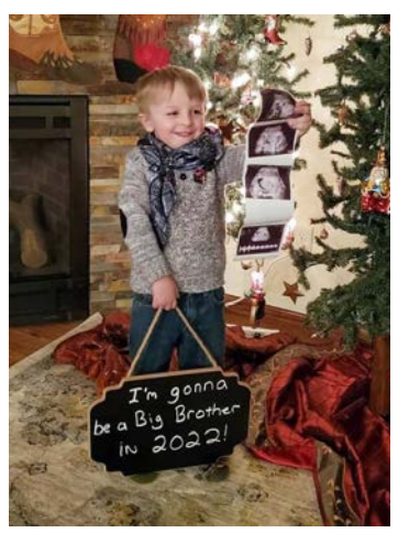
Rowdy is looking forward to becoming a big brother in May!

The last natural calf from the great Fast Primrose Conf 370 cow and among the youngest bulls in our sale offering. In spite of his youth, he has good growth performance which his dam is known for producing time after time. Dam's ratio: 7/104.