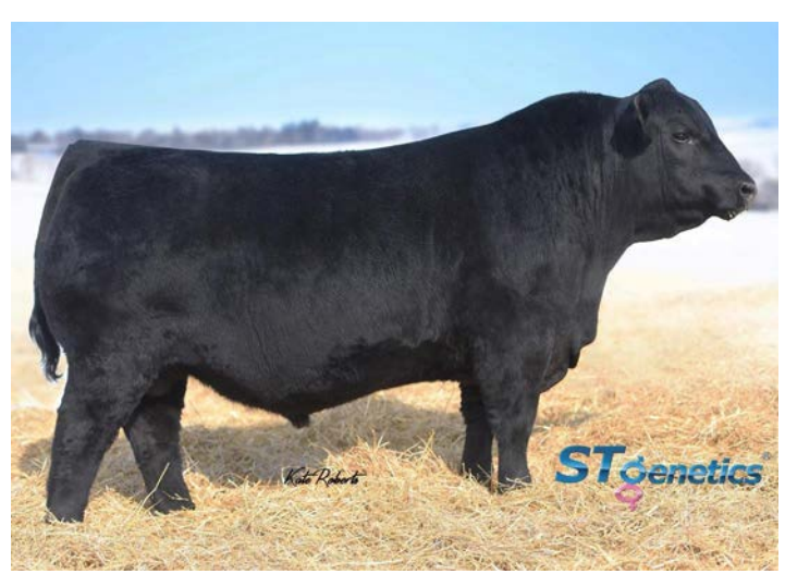
SAV Renew 8132