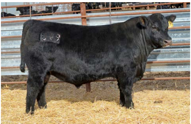
Fast Uncontest 029 in our 2021 sale sold to Tracey Hoherz, Mandan, ND. He is a flush full brother to Lot 18.