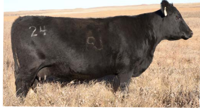
Fast Erica Alt 24 is the all time highest grossing cow in Fast Angus and SCC history! Having only been flushed twice, she averaged over $8700 per bull and raised some of the elite sires we use today at the ranch. Sires such as Fast Capitalist 414, Strommen Platinum 683 and Fast-Strommen Payweight 845 who are the maternal grandsires and sire to over 1/4 of the bulls in this sale Along with the $15,000 second high seller, to Larsen Angus Ranch, a future sire, Fast-Strommen Reno 987, they make up a large part of our herd.

Suitable for heifers or cows. She produced another good one! A structural correct, deep sided bull with a long spine, a clean front and good feet and legs. His Power Pro dam has produced several high performing sons in previous sales. Dam's ratio: 5/108.