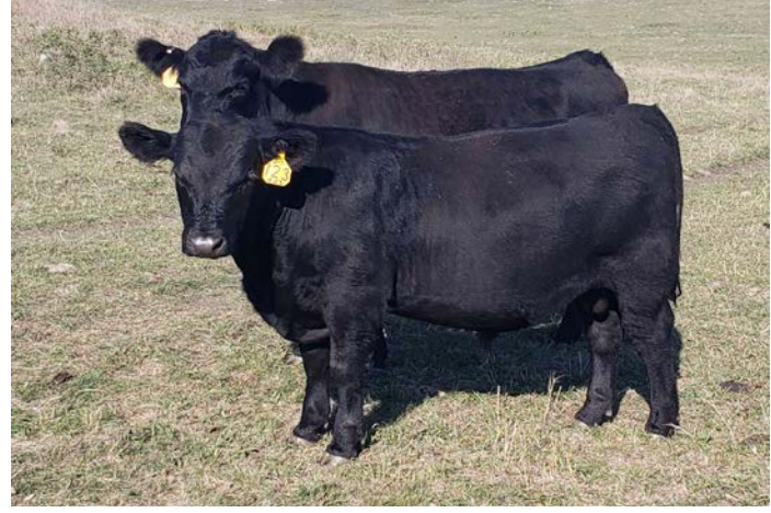
Fast Homesteader 123, Lot 1 with his dam, Fast Blackcap TR 923. She is a first-calf heifer.