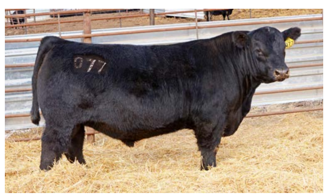
Fast Treasure 077 sold to Kerry Slaughter, Tappen, in our 2021 sale. He is a full flush brother to Lot 45.

You will instantly like this bull for his length of body, good muscle expression as well as wide topline and rump. A smaller framed bull, but very well put together. Yet another good one that goes back to the 734 and 24 cows. This bull should be the ideal type and kind you are looking for if you like moderacy and great maternal abilities! Dam's ratio: 4/101