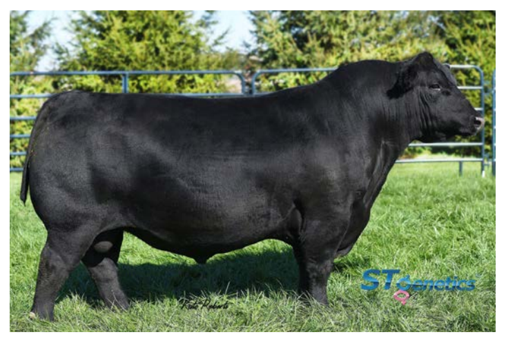
S Powerpoint WS 5503

Renew was the top selling Renown son in the 2019 SAV sale and a crowd favorite for his massive build and gentle disposition. His calves are powerhouses with outstanding performance and eye-appeal. Renew is deceased and there is limited semen available. Take advantage of this sale where some of his best sons are offered!