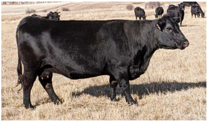
Fast Primrose Conf 370, the Pathfinder dam of Lot 45 and donor dam of Kerry Slaughter's bull as well as two other flush brothers that sold in 2021.