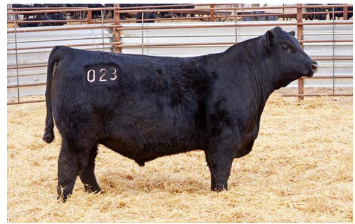
Fast Treasure 023 sold to Kevin Sailer, Dodge, ND, in our 2021 sale. He is out of a highly productive Fast Capitalist 414 daughter, as is Lots 30, 42, 46, 47 and 54.

A rugged, rancher type bull with a long spine and good depth of rib. With a pedigree packed with six Patherfinder ancestors, this bull should sire highly maternal and fertile replacement females. Dam's ratio: 4/106