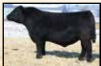
Full brother to Dam Mc Cumber Fortunate 213