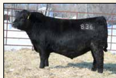
Maternal brother Mc Cumber Emulation XXP 836