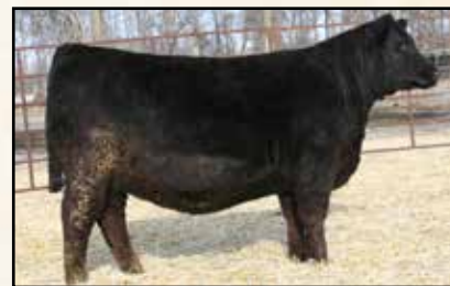
Maternal sister to dam Miss Wix 585 of Mc Cumber