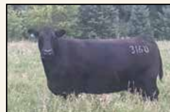
Maternal sister to dam B Pride 3160 of Mc Cumber