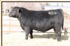
Full brother Mc Cumber 5005 Titanium 954

Recommended for use on heifers- A moderate, masculine, thick rumped Tribute son with added capacity and natural thickness. 0101 is big middled, wide tracking bull with an easy going disposition and the look of a cow-maker. His moderate, big bodied, thick-made dam is perfect uddered and one of my favorite cows of her age group. She fleshes with ease and has the extra width and rib shape to thrive in harsh conditions. Her dam is a maternal sister to Miss Wix 7126 of Mc Cumber and is an impressive, quiet, neat uddered daughter of Unmistakable with a WWR 3@103. Real good Tribute son late in the sale order.