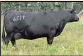
Donor Dam Miss Wix 7126 of Mc Cumber

Selling 2/3 interest and full possession- Recommended for use on heifers- There aren't very many OCC Tremendous 619T sons selling this year, but all are out of current donors here at Mc Cumber. 0198 is the natural born bull calf off one of my all-time favorite 4X13 daughters. He is a moderate framed, deep ribbed, naturally thick bull that weaned off his 12 year old dam at 740 lbs. without creep. He is wide based, easy going, and bred to be a cow-maker. His dam is a favorite of mine. She is a perfect uddered, feminine fronted, good footed daughter of 4X13 that made her way to the donor pen because of the traits not easily measured she excels at. She is produced from a pathfinder 004 daughter that was in production to the age of 14. 0198 is designed to get your cowherd on the right track and is backed by the maternal heritage to do it.