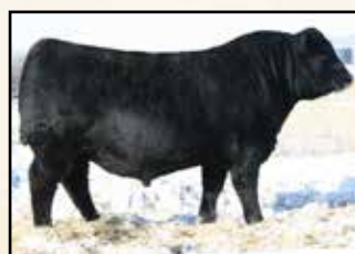
Maternal brother to dam Mc Cumber Fortunate 306