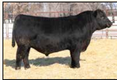
Paternal brother Mc Cumber Shadow Rider 983

A beautiful, feminine fronted, long bodied daughter of Sinclair Shadow Rider 1741. 012 combines femininity and extension, with extra body dimension and impeccable soundness. She is the front pasture kind. Her sire has worked well for use adding body length and maintaining the capacity and thickness we desire. We only had heifer calves from Shadow Rider last year, so no bulls are in the sale, but we continue to keep him as part of our AI sire group and along with his outstanding son Mc Cumber Shadow Rider 983 we have a larger group of calves on the ground this spring.