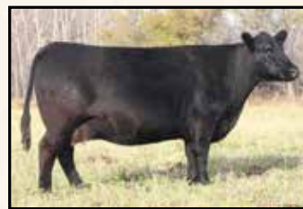
Miss Wix 175 of Mc Cumber