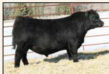
Flush brother Mc Cumber Zodiac 098

Selling ½ interest and full possession- A maternal brother to Mc Cumber Tribute 702 and sired by the popular Ohlde sire OCC Zodiac 655Z. 083 is loaded with meat, muscle and thickness. He has a big, square top and large expressive rear quarter. He is wide based, big scrotaled and easy going. He is moderate framed with extra rib shape and displays the qualities of a forage converter. His dam is one of the top females ever in our program and her influence through sons and daughters will provide the steps to our continued evolution to building a highly efficient, forage converting, fertile, productive cow herd. 083 can be a key to that progression. The first Zodiac daughters here calved this spring and are the real deal in terms of udder quality, mothering instinct, fleshing ease. They possess extra rib shape, natural thickness and are built the way low maintenance, forage efficient females should be. 083 is a herd bull prospect combining the best of the Lassie and Dixie Erica cow families.