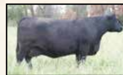
Maternal great grand dam Miss Wix 8225 of Mc Cumber