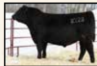
Maternal brother Mc Cumber Emulation 8223