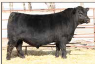
Maternal brother Mc Cumber Unmistakable 944

A beautiful, long bodied, extended fronted Steadfast daughter with femininity and balance. She combines an attractive, well-balanced package with performance, body thickness and rib dimension. Her dam is a pathfinder daughter of Sitz JLS Emulation EXT 536P. She consistently brings in a good one with a WWR of 8@102. At the age of 10 she calved again to the AI service and displays exceptional hoof shape, udder quality and fleshing ability. One of the top heifers in the offering and bred that way too.