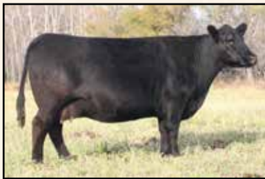
Maternal grand dam Miss Wix 175 of Mc Cumber

Recommended for use on heifers- A sleep all night heifer bull by Tribute with just a 72 lb birth weight a CED of +13 and BW EPD of -1.6 should ensure his ability as a true calving ease bull. 0209 is moderate framed, deep ribbed and wide based. He moves with ease as he travels the pen and earned a WWR of 101 as his dam's first calf. He has a REA of 14 sq. in. and has a REA/CWT of 1.27. His dam is a moderate, tight uddered, small teated daughter of Mc Cumber Steadfast 635. She is big bodied, wide made, and easy fleshing. She is a maternal sister to past sale topper Mc Cumber Unmistakable 524 and a daughter of the donor dam Miss Wix 175 of Mc Cumber. Calving ease bull with the extra body mass to sire forage efficient, easy fleshing females.