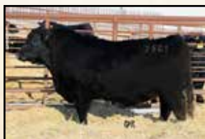
Sire Chapman Memento 7601E

Here is one stout, rugged built, masculine, muscular beef bull. 0179 is impressive in terms of muscle mass, traditional Angus character and stoutness of bone. He has a big, expressive rear quarter and tracks wide as he travels the pen. He has performed outstanding with WW and YW ratios of 104 and 105, respectively. His dam is a quiet, big bodied, easy fleshing daughter of OCC Big Time 746Z and is easy to handle even with a newborn calf. He would be a great fit for some long-time customers looking for a little bit of an outcross. Solid like a rock and ready to get cows bred. He is always catching my eye.