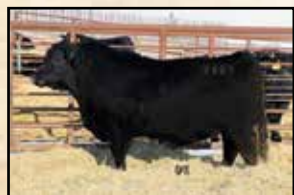
Sire Chapman Memento 7601

Selling 2/3 interest and full possession- A powerful bull with body mass, length, and muscle. 0224 is impressive and has been since the day he was born. He has never looked back and is the heaviest 205-day weight bull of the calf crop with a 205-day weight of 889 lbs for a WWR of 116. He didn't back off on test with an ADG of 3.80 lbs/day and a 365-day weight of nearly 1500 lbs. for a YWR of 112. He has outstanding breed character and carries a lot of weight in a moderate package. His dam is a heavy milking, beautiful, neat uddered daughter of Fortunate Son and produced from a high volume, perfect uddered 4X13 daughter. His sire was our selection and high-selling bull from the 2019 Chapman Cattle Company sale in Alberta Canada. He is produced by a highly productive, fertile dam who not only produced more than 10 calves, but her dam and grand dam both did as well. Herd bull prospect that will add pounds to a calf crop and sire easy fleshing, moderate framed females with longevity bred in.