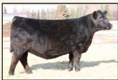
Maternal sister to dam Miss Wix 994 of Mc Cumber

Selling 2/3 interest and full possession- Recommended for use on heifers- 0032 may just be my favorite member of the 619T x Lassie 935 flush. He is a moderate, thick, masculine, calving ease prospect with added capacity and natural thickness. He is a masculine, good fronted bull with base width and muscle shape. He combines REA and IMF for ratios of 104 and 101 respectively. His pathfinder donor dam is a visitor favorite with that wedge-shape build, femininity and length. She is still in production at the age of 12. Her daughter Lassie 113 of Mc Cumber is the dam of Mc Cumber Tribute 702 and the flush sisters to 0032 look to have a bright future in our program. The females this set of flush brothers should sire, will put a cowherd on track in terms of fertility, productivity, longevity and forage efficiency.