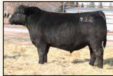
Maternal brothers Mc Cumber 5005 Titanium 972

Selling 2/3 interest and full possession- Muscle shape, body depth, extra stout and exceptional performance describe this herd bull prospect by Mc Cumber Armour 7148. This powerful, masculine, performance bull has been a standout since birth. He weaned of his pathfinder dam at 890 lbs. to rank as the second heaviest actual weaning weight bull of the calf crop and has not looked back. He came off test at 1425 lbs. and carries his weight in a sound, well-balanced package. His 4th consecutive pathfinder dam is no stranger to producing powerful herd bulls. She is a powerful cow with abundant capacity, natural thickness and ruggedness. She fleshes with ease and combines this with fertility, productivity and consistency. Her 5005 son from last year renamed to Mc Cumber Carbon 972 was a sale highlight and sold to Juan Debernardi SRL in Argentina and Eaglehawk Angus in Australia. 075 is a herd bull prospect with power, performance and maternal quality bred in for many generations.