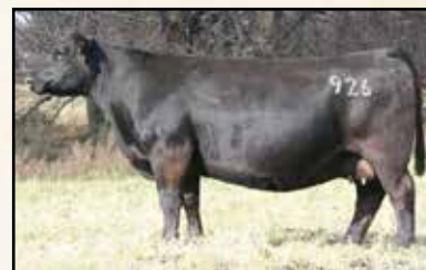
Maternal grand dam Miss Wix 926 of Mc Cumber

Selling 2/3 interest and full possession- Recommended for use on heifers- A calving-ease herd bull prospect by Tribute that started at just 67 lbs. as his dam's second calf and has not look back since. 036 is a masculine, proud fronted bull with extra extension through his neck. He has a big, wide square hip and carries out into an expressive rear quarter. He can really get out and move well with a long, powerful stride. He combines this with the masculinity and muscle shape not often found in a true heifer bull. 036 is another nearly 4 lb/day gainer on test by Tribute and earned a 365-day weight of 1395 lbs. for a ratio of 105. His dam is a moderate framed, neat uddered, easy fleshing daughter of Mc Cumber Fortunate 307 and a maternal sister to Mc Cumber Titanium 3127. She is off to a great start with a WWR 2@103 and never has missed to the AI service. A full sister to 036 is one of the top heifers from last year's calf crop and displays the extra rib shape, natural thickness and udder quality the first Tribute daughters consistently possess. There are many really good Tribute sons to sort through, but 036 will find his way near the top, not only because of the type of bull he is, but because of the cows that he descends from.