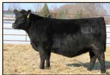
Produced from cow family Enchantress 791 of Mc Cumber