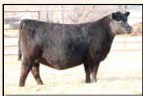
Maternal sister B Pride 945 of Mc Cumber

A top cow prospect with the capacity, natural thickness and base width to work in any environment. 099 combines the body type of an efficient forage converter with one of the top IMF scores of the entire contemporary group. She earned an IMF of 6.6 for a ratio of 182 to rank in the top 5 IMF heifers. Her dam is a maternal sister to Mc Cumber Rito Rolette 1108 and traces back to B Pride 463 of Mc Cumber.