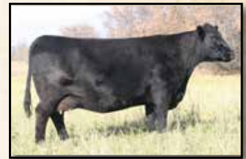
Full sisters Miss Wix 9122 of Mc Cumber