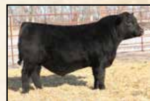
Maternal brother Mc Cumber 5005 Titanium 9136