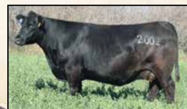
Dam Miss Wix 2002 of Mc Cumber