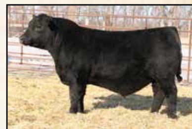
Maternal brother Mc Cumber 5005 Titanium 9136