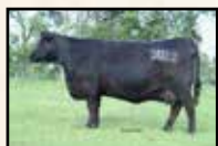
Maternal great grand dam Miss Wix 2022 of Mc Cumber