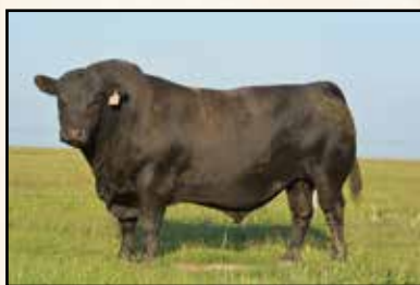
Paternal grand Sire Chapman Memento 0513X