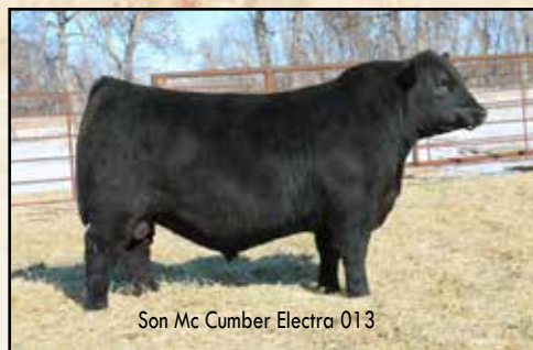
Son Mc Cumber Electra 013