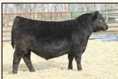
Maternal brother to dam Mc Cumber Steadfast 0030