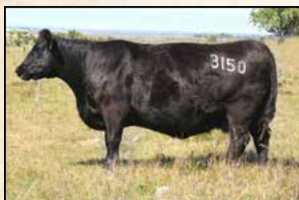
Dam B Pride 3150 of Mc Cumber

Selling 2/3 interest and full possession- ET Tribute son bred to sire forage efficient, easy fleshing, perfect uddered females. 0149 is a well-balanced, eye-catching son of Tribute with extra length and stoutness. He is square hipped and moves with ease as he travels. He has an excellent disposition and a large scrotal. He nearly gained 4 lbs/day on test and combines this with an IMF ratio of 140. He is a member of a large flush of these full brothers, most of which will be fine on heifers, but because of his extra birth weight this good bull should go on cows first. His dam is a herd favorite and with incredible udder structure and fleshing ability. She is feminine fronted and displays added rib shape and capacity. Every daughter she has produced has been retained here at Mc Cumber and 3 of them have son's selling in this sale.