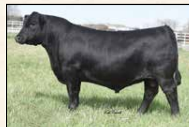
Sire Mc Cumber Steadfast 635

A real complete, sound structured, well-balanced daughter of Mc Cumber Steadfast 635 with top cows through out her pedigree. 0185 is a good performing, deep ribbed heifer that earned an IMF score of 4.03 for a ratio of 111. Her dam is a neat-uddered, easy going daughter of Resolution with a neat udder. Her dam is a top producing maternal sister to Mc Cumber Fortunate 213. The Steadfast daughters are making some top young cows that flesh easily, have neat, well-attached udders and are built to last.