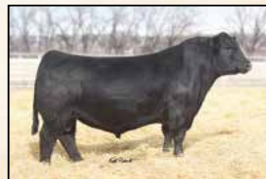
Maternal brother to dam Mc Cumber Titanium 3127