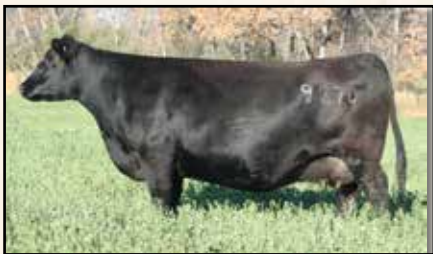
Maternal great grand dam Rosetta 9270 of Mc Cumber

0053 is one well-built, big middled, wide based son of Mc Cumber Titanium 5005. 0053 has that cow-maker look with extra capacity and natural thickness. He weaned off at 750 lbs. and is produced from a moderate framed, easy fleshing, neat uddered member of the Rosetta cow family. The 5005 daughters are the right kind, with fleshing ability, udder quality, excellent hoof shape, and maternal quality.