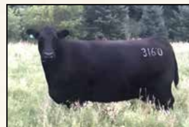
Maternal grand dam B Pride 3160 of Mc Cumber