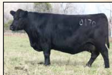
Dam Miss Wix 0170 of Mc Cumber