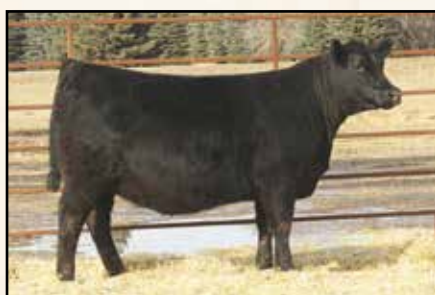
Flush sister Miss Wix 0148 of Mc Cumber