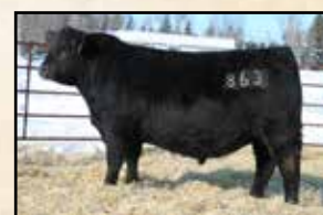
Maternal brother Mc Cumber Steadfast 863