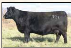
Maternal grand dam Miss Wix 921 of Mc Cumber

Recommended for use on heifers- A moderate, easy fleshing, deep ribbed son of Steadfast with extra shape to his to and rear quarter. 096 has a masculine, beef bull look to him and stands down on a wide base. His dam easy fleshing, near perfect uddered dam is near ideal in body type in my mind. She is moderate framed, feminine fronted, and naturally thick. She maintains her flesh well year round and has an excellent record for fertility.