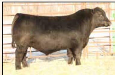
Maternal brother Mc Cumber Armour 9191

A Steadfast daughter loaded with power, performance and the maternal heritage to make a positive impact. 0138 is a load, with extra width, rib shape, and base. She is one of the top weaning heifers of the calf crop and it didn't stop there. She combines performance in a sound, well-balanced package with maternal quality bred in for generations. The line of cows that produced her including her dam excel for udder quality, hoof shape, fertility, and productivity. A sale highlight and one of the top heifers of the calf crop.