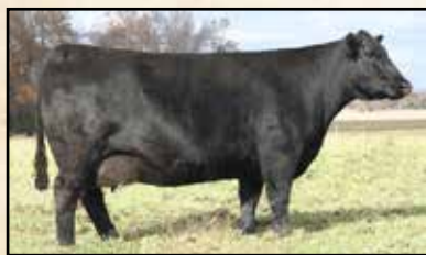
Dam Lassie 935 of Mc Cumber

Right from the ET program and only offered because the large group of flush sisters we were fortunate enough to retain. 0024 is the result of a mating combination that never fails. OCC Tremendous 619T on the Sinclair Extra 4X13 daughters produces fertile, productive, problem free females that consistently produce top calves and are built to last. 0024 is a moderate, wide made, female with plenty of capacity. She is sound structured and designed like one that is forage efficient, low maintenance and easy fleshing. A maternal sister to Lassie 113 of Mc Cumber, the dam of Tribute, and poised to make an impactful contribution to any program.