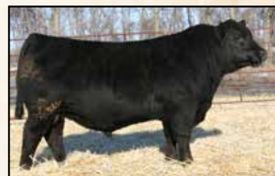
Maternal brother Mc Cumber Titanium 598