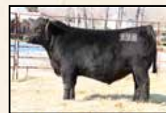
Maternal brother Mc Cumber 5005 Titanium 998

A long-bodied, smooth made, son of Mc Cumber Trademark 4203. 0174 is a well-balanced, sound structured bull with excellent hoof shape and heel depth. He has performed well from the start and is free moving, wide based, and sound. He earned an IMF ratio of 152 while limiting the amount of BF he put on. His dam is a beautiful, perfect uddered daughter of Mc Cumber Tremendous 2008. She is long bodied, feminine fronted and possesses extra rib depth and dimension. She maintains her flesh well and is off to a good start. She has a perfect record for fertility and is one of the top 2008 daughters on the Ranch. Real complete bull by Trademark.