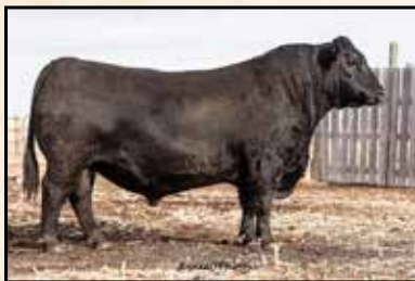
Maternal brothers Mc Cumber Influence 7121

Selling 2/3 interest and full possession- An OCC Big Time son with muscle shape, masculinity, and a good disposition. This heavy weaning bull could possibly work on heifers, but should be tried out on the cows first. He packs a large REA and is big scrotaled and free moving. His easy fleshing, perfect uddered dam is a productive, fertile daughter of Mc Cumber Tremendous 2008. She has one son working in the Master Angus herd in MT and another in NE. She consistently brings in a good one. The Big Time daughters are big bodied, neat uddered females with an excellent disposition, all the time. They are attentive, easy going mothers and are easily handled if needed. Only direct Big Time son this and a good one.