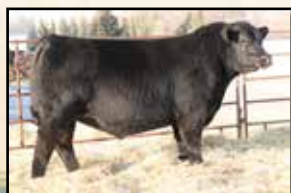
Maternal brother to dam Mc Cumber 7188 Big Time 9172

The Tribute daughters possess the capacity, thickness and design to convert forage and flesh easily. 0190 is cut from this mold. A big bodied, easy going female with top performance. 0190 earned weaning and yearling ratios of 101 and 103 respectively and combines this with an IMF ratio of 117. Her dam has a well-attached udder with small well-placed teats and is produced from a maternal sister to Lassie 935 of Mc Cumber