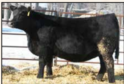
Full sister to Dam Miss Wix 617 of Mc Cumber

A big-topped, thick-rumped Tribute son with masculinity, stoutness and maternal quality bred in. 072 is a wide-tracking, free moving bull with solid performance from start to finish. One for the cows with added muscle dimension. His dam is a favorite of mine. She is a moderate, high volume, sound structured easy fleshing daughter of Mc Cumber Titanium 3127. She displays excellent udder quality, hoof shape and a easy going disposition. She is a full sister to the 2017 Sale topping heifer Miss Wix 617 of Mc Cumber. Produced from 3 consecutive generation of pathfinder, Miss Wix 743 is bred leave an impact here at Mc Cumber.