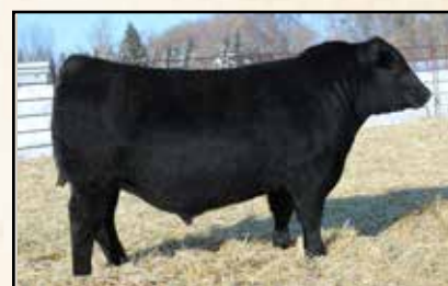
Maternal brother Mc Cumber 5005 Titanium 806