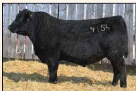
Maternal grand sire Mc Cumber 235 Fortunate 4154

Selling 2/3 interest and full possession- Recommended for use on heifers- Phenotypically one of the most complete bulls in the entire offering. 057 is a stud. He combines incredible balance, style and soundness with abundant muscle shape and capacity. In addition, he is a wide based, free moving bull with masculinity and Angus character. He did not disappoint from a performance standpoint either, gaining 3.87 lbs/day and earning a YWR of 104. His dam is a moderate, heavy milking daughter of Mc Cumber 235 Fortunate 4154 with a beautiful, feminine front end and plenty of capacity. 057 has been catching my eye all winter and is built like one ought to be.