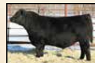
Mc Cumber Tribute 0020