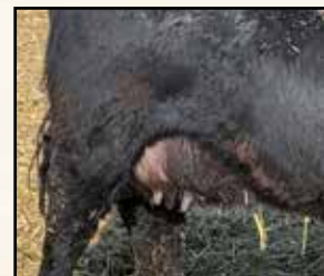
Dam's udder Miss Wix 8004 of Mc Cumber