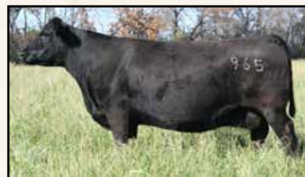
Maternal grand dam Bemndful Maid 965 Mc Cumber