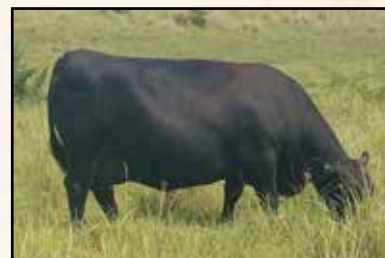
Paternal grand dam OCC Dixie Erica 628W