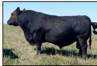
Sire OCC Zodiac 655Z