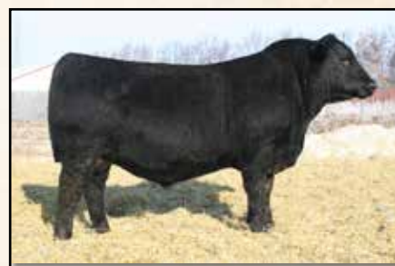
Maternal brother Mc Cumber 248 Fortunate 4166

or contact Superior Productions at 1-800-431-4452 to pre-register for a buyer's number and gain access to the bid line number