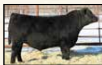
Flush brothers Mc Cumber Tribute 0020

Selling 2/3 interest and full possession- Recommended for use on heifers- I know I am sounding very repetitive when describing this Tribute X B Pride 3150 of Mc Cumber flush. They truly are very much alike and in my opinion that is a good thing. You could put a group of these flush brothers on a set of cows and reap the added consistency and predictability of the daughters that would result. Long, smooth, deep ribbed and sound, just like his flush mates. In addition he has a REA ratio of 104 and like his brothers is an easy going bull. Their dam is a herd favorite that does so many things right.