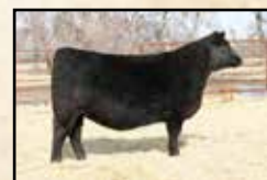
Maternal sister to dam B Pride 012 of Mc Cumber

An absolute tank with moderation, muscle and rib shape. 022 offers a unique pedigree combining the new sire Manzano Electra 0214 with a moderate, neat uddered, easy fleshing daughter of OCC Bonus 802B. 022 has the extra base width, rib shape, and right size to thrive in the toughest environments.