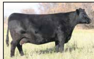
Maternal great grand dam Miss Wix 9122 of Mc Cumber

Selling 2/3 interest and full possession- An Armour son with impeccable style, extension, stoutness and muscle. 014 is a big, stout bull with added length and eye-catching presence that is common among the Mc Cumber Armour sire group. He is one of the top performing sons of Armour in the offering with top ratios at every measure. His pedigree is loaded with top cows tracing twice to Miss Wix 7126 of Mc Cumber the dam of Mc Cumber Titanium 5005 and Miss Wix 9122 of Mc Cumber. 9122 is the dam of Mc Cumber Fortunate 307 and Mc Cumber Trademark 4203, both past top selling bulls through our sale and both used back successfully within our program. A lot larger group of Armour son's in this year's offering and they will not disappoint. He consistently sires an outstanding look and soundness to his progeny and the first daughters in production are what we hoped they would be. It won't be hard to spot 014, he combines a ton of muscle shape, thickness and soundness into an impressive, eye-catching package.