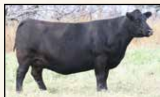
Donor Dam Miss Wix 9102 of Mc Cumber