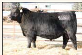
Maternal brother Mc Cumber Tribute 9180

A well-balanced, big ribbed, square hipped son of Mc Cumber Big Time 7188. A March born bull with base width, large scrotal and plenty of performance. The first 7188 daughters calved this year and excel for rib shape, udder quality, docility and mothering ability. The dam of 0257 is a big, stout, thick-made daughter of Mc Cumber Fortunate 307. She is good footed, neat uddered and a daughter of B Pride 463 of Mc Cumber. We have many daughters of 463 in the cowherd and they all are fertile, productive and problem free.