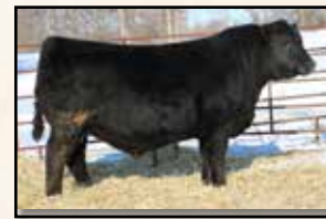
Maternal brother to dam Mc Cumber Steadfast 8175

Selling 2/3 interest and full possession- You would never guess this performance powerhouse started with just an 83 lb. birth weight when you see him. This big, massive, stout made Tribute son would rival any bull in our history for performance. The heaviest actual weaning weight of the calf crop coming off his dam at 900 lbs. without creep and earning a WWR of 111. He didn't stop there, he gained 4.05 lbs/day over a 142-day test on a 45 Mcal ration and came off test weighing 1475 lbs. to nearly match his sire as the all-time heaviest bull in our 57 year history. In addition, he combines REA and IMF with ratios of 108 and 133 respectively. His powerful dam is massive in terms of body dimension and natural thickness. She has a tight, well attached udder with small well-placed teats. She is docile, easy fleshing and fertile. She has never missed to the AI service. She is produced from 2 consecutive generations of pathfinders and is well on her way to pathfinder status as well. Big time performance combined with the maternal qualities of the cows that produced him.