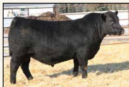
Maternal brother to dam Mc Cumber Steadfast 912

Selling 2/3 interest and full possession- Recommended for use on heifers- The mating of Tribute on the OCC Bonus 802B daughters really works. 0140 is a light birth, high performing result of that mating. He is long bodied, deep ribbed, and free moving. He has top performance earning a WWR of 108 and a YWR of 107 as his dam's first calf. He gained nearly 4 lbs/day and has a REA of 14.4 for a ratio of 107. His dam is a moderate framed, thick made, deep ribbed daughter of OCC Bonus 802B. She is neat uddered, good footed and bred back and is raising a set of twins this year. Well balanced, complete bull that will work in many scenarios.