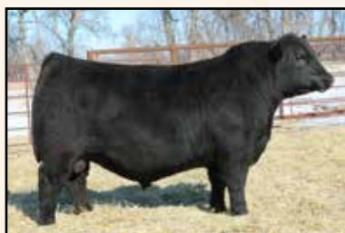
Paternal brother Mc Cumber Electra 013