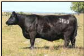
Donor Dam B Pride 3150 of Mc Cumber

Selling 2/3 interest and full possession- Recommended for use on heifers- A look alike set of flush brother from the mating of Tribute to B Pride 3150 of Mc Cumber. 0020 is a long, smooth made bull with abundant capacity. He is a sound structured bull with excellent hoof shape and heel depth. He has performed well on test and earned a REA ratio of 102. Is a quiet, easy to get along with Tribute son as well. His donor dam is a fertile, neat uddered, easy fleshing female that earned her way to the donor pen by consistently producing the type of females we demand. She has never raised a natural bull calf and every daughter she has produced has been retained as a replacement and all are still production to this point. Granted they are not all that old yet but show no signs of falling out anytime soon.