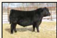
Maternal brother to dam Mc Cumber Electra 092

Moderate, thick, deep ribbed bull with added base width and masculinity so common among the Tribute sire group. He just misses qualifying as a heifer bull, will sire forage efficient, easy fleshing progeny built to handle any environment. His dam is a real nice Mc Cumber Titanium 5005 daughter with a neat, well-attached udder perfect hoof shape and an excellent disposition. She is produced from a 12 year old 4X13 daughter that is still going strong.