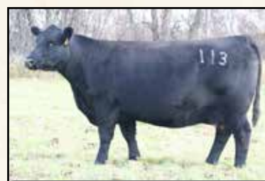
Dam Lassie 113 of Mc Cumber