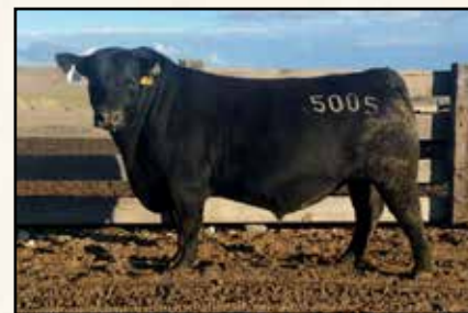
Sire Mc Cumber Titanium 5005