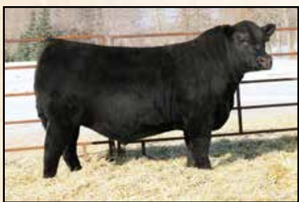
Sire Mc Cumber Armour 7148

Selling 2/3 interest and full possession-Recommended for use on heifers- An extremely attractive, well-balanced bull that is big middled, square hiped, and has that soft cow-maker look to him. He is long fronted and carries that length throughout. He is long-striding and excellent on his feet and legs. He is one of the top gaining sons of Armour in the offering and has been favorite of mine all winter. He never seems to have a bad day. His dam could be the mold for how an Angus cow should look. She is a moderate framed, big bodied, feminine fronted female with natural thickness and a near perfect udder. Building a cowherd is never ending, there is always a way to improve, 058 is the kind of herd sire prospect to keep you headed in the right direction.