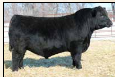
Maternal brother Mc Cumber Unmistakable 712