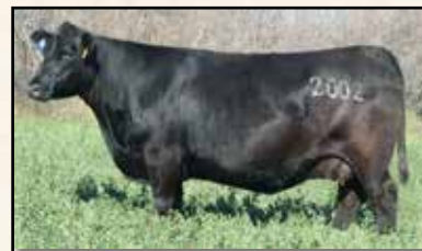
Maternal grand dam Miss Wix 2002 of Mc Cumber

Don't assume that because there are a large number of Tribute daughters in the offering that for some reason we don't like them. That is the furthest from the truth, he has by far the largest sire group, and thus we are retaining nearly 30 Tribute daughters as replacement. The first daughters to calve have exceeded our expectations. Everyone of them is easy going, near perfect uddered and possess all the characteristics we expect at this point. 0223 has a royal pedigree combining both Lassie 113 of Mc Cumber and Miss Wix 2002 of Mc Cumber. She is a moderate, extra thick, deep bodied female that tracks wide and puts a foot down in the corners. Her dam by Mc Cumber Titanium 3127 is a moderate framed, deep ribbed female and was one of the top indexing heifers of her calf crop. Backed by top cows 0223 is bred to get the job done.