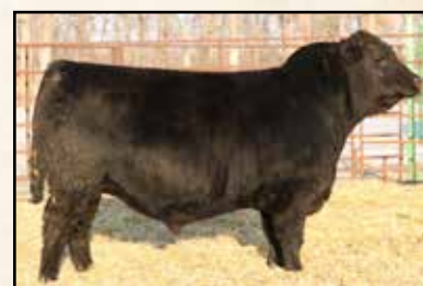
Maternal brother Mc Cumber Tremendous 966

The Armour daughters are built like you would expect. He passes on that beautiful, extended front end and the softness and capacity that you see in not only him, but both his sons and daughters alike. 028 possesses the Armour look and is produced from a highly productive, fertile, easy going daughter of OCC Big Time 746Z. She has never missed to the AI service and has calved right at the front of the calving season all three times. She is nursing a standout Manzano Electra 0214 heifer calf already this year.