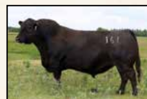
Maternal brother to dam Mc Cumber 8R101 Rito 161

Maternal brother Mc Cumber 5005 Titanium 938