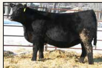
Maternal sister to dam Miss Wix 617 of Mc Cumber