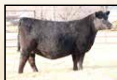
Maternal sister to dam B Pride 945 of Mc Cumber

A Memento son with muscle, capacity, base width and soundness. 0203 is a wide hipped, thick rumped bull with masculinity and impeccable hoof shape. This sire group is particularly strong for foot shape and heel depth. In addition 0203 earned a 205-day weight of 810 lbs. for a WWR of 106 as his dam's 2nd calf. His moderate, neat uddered, dam by OCC Bonus 802B is easy fleshing and earning an excellent record to this point. I really like our Bonus daughters they are moderate, productive females with fleshing ability and fertility. They will have reduced mature size, but they seem to pack a punch when it comes to raising their calf. Some new genes for long-time customers here.