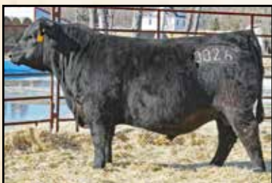
Flush brother Mc Cumber Zodiac 0026