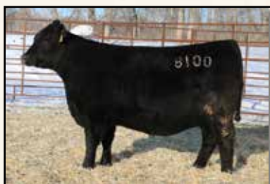
Maternal sister Miss Wix 8100 of Mc Cumber