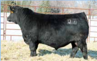
MC CUMBER GLOBAL 07

Selling 130 yearling bulls, 40 yearling heifers and 30 commercial yearling Angus heifers