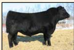
Maternal brothers Mc Cumber Fortunate 4165

A top daughter of Armour with added performance and produced from a proven, time-tested dam that gets it done every year. 0141 is a fancy fronted, big bodied, naturally thick heifer with weaning and yearling ratios of 102 and 103 respectively. She is a free-moving, well-balanced heifer with maternal quality bred in. Her dam never misses and is a top daughter of OCC Missing Link 830M. She has never missed to the AI service and boost a WWR of 8@102.