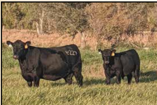
Dam Lassie 8229 of Mc Cumber and 05 last summer

Selling 2/3 interest and full possession- Recommended for use on heifers - Long, smooth, clean made son of Tribute with masculinity, depth of rib and natural thickness. He is real sound structured and good footed. His young dam is fast becoming a favorite. Lassie 8229 of Mc Cumber is a gorgeous young cow that combines thickness and power with femininity and style. She calved first service AI again this year. One of the top Tribute sons in the sale.