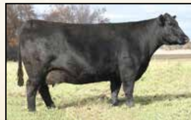
Maternal grand dam Lassie 935 of Mc Cumber