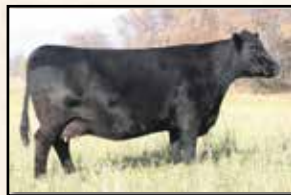
full sister Miss Wix 9122 of Mc Cumber