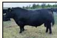
Sire OCC Bonus 802B

Recommended for use on heifers- The only son of OCC Bonus 802B in this year's offering, but a real good, well-bred son that will work well on heifers. 0280 is a deep ribbed, naturally thick bull with excellent hoof shape, and heel depth. He is square topped, with a long, level hip and moves with ease as he travels the pen. His dam is a feminine fronted, deep ribbed, near perfect uddered daughter of Mc Cumber Tremendous 2008 and produced from the BT Right Time 24J daughter of Miss Wix 7111 of Mc Cumber, Miss Wix 5139 of Mc Cumber, making her double bred up close to Miss Wix 7111 of Mc Cumber. A well-bred, sound structured, calving ease bull bred to sire moderate, easy fleshing females that will convert forage and thrive in a harsh environment.