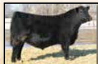
Maternal brother to dam Mc Cumber 4154 Fortunate 6161

An Armour son with balance and style. He combines it with stoutness, body depth and impeccable structure. He is a free moving, wide tracking bull with extra length and front-end extension. He has excellent hoof shape and heel depth. He earned a 205-day weight of 801 lbs. for a WWR of 105 as his dam's second calf and was an active bull all winter preparing to cover a bunch of cows. His dam is a gorgeous young cow and one everybody spots when touring the cowherd. She is a feminine fronted, big bodied female with extra length and a perfect udder. She has never missed to the AI service and is nursing a standout full brother to 043 again this year. A legitimate cow-maker.