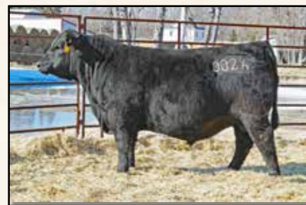
Maternal brother Mc Cumber Zodiac 0026