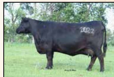
Maternal grand dam Miss Wix 2022 of Mc Cumber