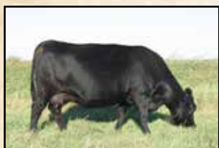
Maternal grand dam Miss Wix 6145 of Mc Cumber.

Selling 2/3 interest and full possession- Recommended for use on heifers- Starting with just a 70 lb. birth weight this performance powerhouse never looked back. 010 is a big bodied, deep ribbed, wide made son of Tribute that pushed the scale down at every measure and combines it with an easy going disposition, and maternal backing second to none. His young dam by Titanium is produced by the oldest cow on the Ranch Miss Wix 6145 of Mc