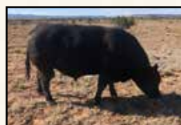
Sire OCC Edge of Glory 841E

A long bodied, extended front, thick rumped son of OCC Edge of Glory 841E. The Edge of Glory bull was our selection along with Diamond 7 Angus Ranch in New Mexico from the 2019 Ohlde sale. We did not have possession of the bull, so this first calf crop has a limited number of progeny because we didn't get semen until the end of our AI season. However, we have a large group of calves on the ground this spring and they are impressive. The 3 replacement yearling heifers look excellent at this point. 0049 is an easy going, good footed, free moving bull that performed well across the board. He has an on-test ADG of 4.47 lbs/day and earned a YWR of 110. He combines this with an IMF ratio of 121. Look for more from this sire group down the road, but for long-time customers 0049 offers a new sire group for you.