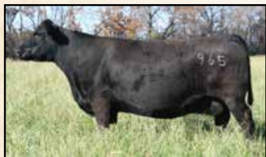
Dam Bemindful Maid 965 of Mc Cumber

Selling 2/3 interest and full possession- Recommended for use on heifers- Never before have we been able to offer so many quality ET sons of our top donors. When we flush these donor cows the main objective is to produce top females for replacements within our cowherd. So the resulting bulls from these flushes should be some of the most predictable cow-makers we can offer. 0033 is a calving ease bull with cow-maker genetics bred in.