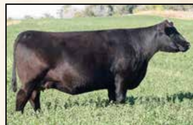
Dam Rosetta 277 of Mc Cumber

Selling 2/3 interest and full possession- A real sale highlight here. This thick, deep bodied, wide tracking son of Mc Cumber Armour 7148 has jumped through all the hoops. He is a moderate, easy going, big topped thick rumped bull with added performance in a moderate, forage efficient package. He earned weaning and yearling ratios of 106 and 106 respectively. He gained 3.73 lbs/day on test and scanned a large REA for a ratio of 102. His OCC Tremendous 619T sired dam is a favorite of mine with impeccable udder quality, hoof shape, fleshing ease and fertility. I sound like a broken record talking about these Tremendous daughters, but they are very much a like and the type of female that is fits our ideal. 0239 is actually double bred to two top OCC Tremendous 619T daughters, combining his dam Rosetta 277 of Mc Cumber and Armour's dam Miss Wix 2003 of Mc Cumber. The predictability bred into 0239 takes the guess work out of how he will sire. Herd bull candidate with a balance of traits and the type of cows behind him that help ensure profit at the cow-calf level.