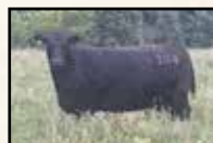
Dam B Pride 3160 of Mc Cumber

Selling 2/3 interest and full possession-Recommended for use on heifers- Produced by 2 consecutive generations of pathfinder, donor dams. 08 is backed by top of the line maternal genetics. He is a long bodied, clean made, smooth fronted son of Tribute with an excellent disposition and large scrotal circumference. His dam is a powerful daughter of Fortunate Son who does not miss. She is the grand dam to the top herd sire prospect selling as Lot 1 in this sale Mc Cumber Global 07 and the dam of a past sale highlight Mc Cumber 5005 Titanium 7175 working for the Harris Ranch at Killdeer. A Tribute son backed by an outstanding cow family.