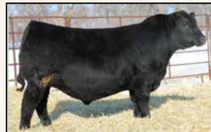
Maternal brothers Mc Cumber Titanium 8121