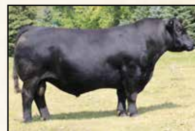
Maternal brother to dam Mc Cumber Tribute 702