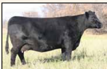
Dam Miss Wix 9122 of Mc Cumber

Selling 2/3 interest and full possession- Recommended for use on heifers- One good looking, well-balanced, good fronted, big bodied, thick made Steadfast son. 0111 is a real eye catcher with extra capacity and a wide, square hip. He is wide based and puts a foot down in the corners. He has performed well this winter and is the type of bull that will catch your eye. His dam is an impressive daughter of Unmistakable with impeccable hoof structure and shape. She is moderate framed, deep ribbed and easy fleshing. She has a neat, well-attached udder and has a perfect record for fertility to this point. 0111 will sire the forage efficient, easy fleshing females that can thrive in any environment.