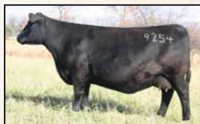
Maternal grand dam Rosetta 9254 of Mc Cumber

Masculine, muscular, well-made son of Mc Cumber Trademark 4203. 0104 has the added base width, rib shape and bone to sire hardy, low maintenance females that will work in any environment. His feminine fronted, big bodied dam is docile and easy fleshing. She is produced from one of the top pathfinder 4X13 dam's to ever reside here.