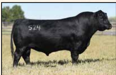
Maternal brother to dam Mc Cumber Unmistakable 524