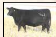
Maternal grand dam B Pride 463 of Mc Cumber