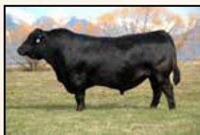
Sire of Dam Coleman Emblazon 780

0046 is a heavy muscled, big topped, thick butted son of Mc Cumber Titanium 5005. He has performed well at every measure with a WWR of 104 and a YWR of 102. He gained 3.82 lbs/day on test and sports a REA of 14.5 sq. in. for a ratio of 113. He has a REA/CWT of 1.29 to confirm the extra muscle shape and expression he displays. His dam is an easy fleshing, neat uddered daughter of Coleman Emblazon 780. He has a pedigree combination that should leave a set of thick, sound structured, easy fleshing progeny.