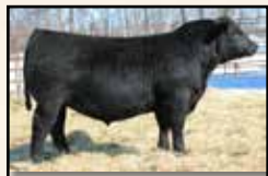
Maternal brother Mc Cumber 5005 Titanium 7205

A stock bull with masculinity, natural width and traditional breed character common among the Memento sire group. This stout, big bodied, thick made bull has excellent hoof shape and heel depth. He earned a 205-day weight of 806 lbs. for a WWR of 105 and is produced from a highly productive daughter of Mc Cumber Tremendous 2008. His big bodied, perfect uddered dam is easy fleshing, easy to get along with and a top producer. She never fails to bring in a good one and is nursing an excellent 5005 heifer calf this year. Early growth, combined with muscle shape, extra capacity and soundness describe this good bull well.