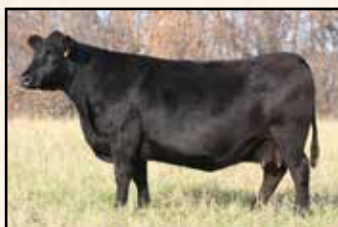
Maternal grand dam Gale 805 of Mc Cumber