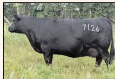
Maternal great grand dam Miss Wix 7126 of Mc Cumber