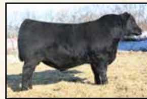
Maternal brother to dam Mc Cumber 2008 Tremendous 4115

Selling 2/3 interest and full possession- Recommended for use on heifers- A real standout sired by Tribute with extra length, masculinity and muscle shape. 0163 is a long bodied, smooth made bull with a big, square top and shape to his rear quarter. He is free-moving, docile and large scrotaled. He has performed well from the start among some stiff competition and combines this with a REA ratio of 109. His dam by Mc Cumber Titanium 3127 is a powerful, big bodied, wide made cow with excellent udder structure and a super disposition. She bred back early and is nursing a standout full brother to 0163. She is produced by a highly productive, fertile, long lasting 4X13 daughter who just recently calved with her 12th calf. She has a WWR of 11@102 and YWR 10@105. 0163 is a top end Tribute son with performance, calving ease, and maternal bred in.