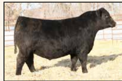
Full brother to Dam Mc Cumber 5005 Titanium 930

Recommended for use on heifers- It's gonna get repetitive talking about these Tribute sons, but he consistently makes them very much alike. 033 is no exception. A light birth, high performing bull that is big bodied, naturally thick and wide tracking. His dam is a moderate framed, high volume daughter of Mc Cumber Titanium 5005, with a neat, well-attached udder and is produced from 3 consecutive generations of Miss Wix pathfinders. Her dam produced the lead-off and top selling female from our 2017 production sale to Carlson Angus Ranch where she has gone on to be a productive member of their embryo transplant program. Well-bred, complete son of Tribute that is bred to add profit to a cattleman's operation.