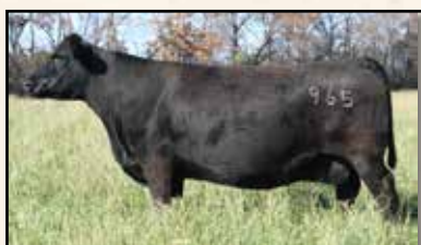
Maternal grand dam Bemindful Maid 965 of Mc Cumber

Selling 2/3 interest and full possession- A standout from the day he was born, this masculine, thick topped heavy muscled son of Chapman Memento 7601 has been on my radar. He has not disappointed. He weaned off his dam with a 205-day weight of 849 lbs. for a ratio of 111 to rank among the top 10 bulls at weaning time. He has not backed off and came off test weighing 1300 lbs and earned a YWR of 104. His dam is an easy going, deep bodied, neat uddered daughter of Big Time. She is quiet all the time and is off to a great start with a WWR of 2@106. She calved again early this year and is nursing a stud 5005 bull calf. She is a daughter of the donor Bemindful Maid 965 of Mc Cumber, who excels for hoof shape, udder quality, fertility and fleshing ease. If you like stout, expressively muscled bulls with early growth, you will like the Memento sire group.