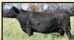
Donor Dam Bemindful Maid 965 of Mc Cumber

Selling 2/3 interest and full possession- Recommended for use on heifers- The Steadfast X Bemindful Maid 965 is consistent from top to bottom. They are moderate, thick-made calving ease bulls with maternal quality bred in for generations. 0017 is a long bodied, smooth bull with a big top and square hip. He moves with ease as he travels the pen and puts a foot down in the corners. His donor dam is a herd favorite and excels for udder quality, hoof shape, fertility and fleshing ease. These flush brothers would be a good choice for a group of heifers to sire a consistent set of calves with maternal superiority bred in.