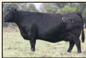
Maternal grand dam Lassie 0101 of Mc Cumber