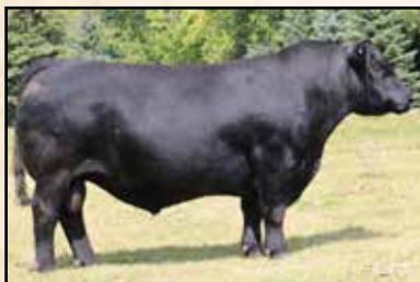
Sire Mc Cumber Tribute 702

Selling 2/3 interest and full possession- Recommended for use on heifers- Tribute strikes again. 064 has an incredible birth to yearling spread. He started with just a 64 lb. birth weight. He weaned off his dam with a 205-day weight of 742 lbs. without creep as his dam's first calf and then gained 3.87 lbs./day on test and earned a 365-day weight of 1361 lbs. for a ratio of 104. In addition to his spread he is a moderate framed, big bodied, thick made beef bull with base width and soundness. His dam is an easy-going, moderate framed, deep ribbed daughter of Mc Cumber 1108 Rito 3200 with a near perfect udder. She bred back AI again this year and calved early. Calving ease bull without sacrificing performance and maternal quality.