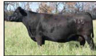
Dam Bemindful Maid 965 of Mc Cumber