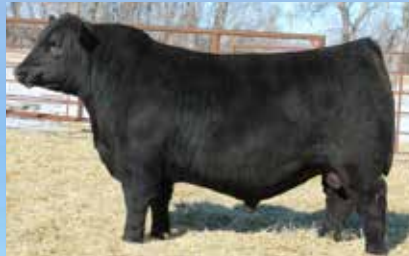
MC CUMBER ELECTRA 013