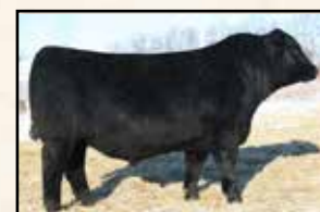
Maternal brother to dam Mc Cumber Fortunate 307