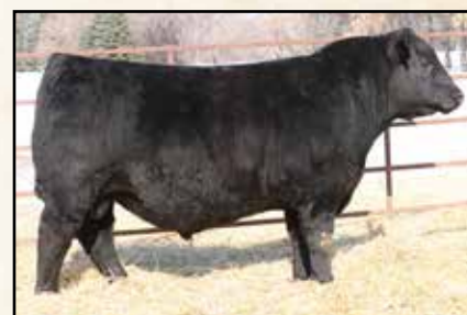
Maternal brother Mc Cumber Tremendous 9135