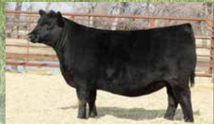
MISS WIX 09 OF MC CUMBER