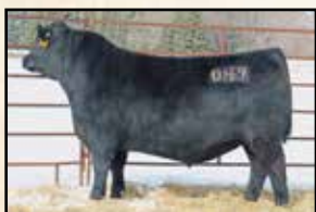
Maternal brother to dam Mc Cumber 5005 Titanium 049

Selling 2/3 interest and full possession- A thick, meaty, masculine son of Mc Cumber Trademark 4203. 0109 is a docile, wide based, big rumped beef bull with added stoutness and capacity. He travels well with a long, loose stride and puts a foot down in the corner. His dam is an impressive, moderate framed, big ribbed neat uddered daughter of Mc Cumber Fortunate 213. She is produced from the herd favorite B Pride 2143 of Mc Cumber, the dam of the powerful herd bull prospect Mc Cumber 5005 Titanium 049. 0109 is a complete bull with a cowman's look and the performance and maternal quality to make a positive impact to any herd.