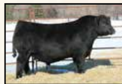
Maternal brother to dam Mc Cumber Remington 031

A moderate framed, wide made female with abundant rib shape and capacity. She is a wide-based, wide tracking heifer with cow written all over her. A heavy weaning heifer with a WWR of 104 and a combination of both REA and IMF with ratios of 106 and 103 respectively. In my opinion one of the best parts about here are the cows from which she is produced. Her dam is a maternal sister to the Lot 2 and sale feature Mc Cumber Remington 031. She has her own top record for production and fertility and comes from a line of cows that have left an impact.