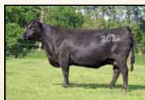
Maternal grand dam Miss Wix 2027 of Mc Cumber

Selling 2/3 interest and full possession- A masculine, muscular, long bodied son of Tribute that is free moving, sound structured, and large scrotaled. One of the more active bulls in the pen, which affected his gain, but he will be hard and fit, ready to cover a large group of cows. Statistically he would qualify as a heifer bull, but his dam has produced a bit of birth weight in the past so should go on cows to start with. His dam is a long bodied, feminine fronted daughter of Fortunate Son with impeccable udder quality. She is produced by the 6th generation pathfinder Miss Wix 2027 of Mc Cumber and she maintains an excellent calving interval as well with 4@353 and another early born bull calf nursing her this year. 023 is bred to sire fertile, productive, long lasting females, enforced by the top cows from which he descends.