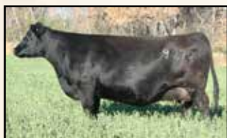
Maternal grand dam Rosetta 9270 of Mc Cumber