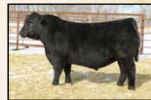
Maternal brother to dam Mc Cumber Electra 092