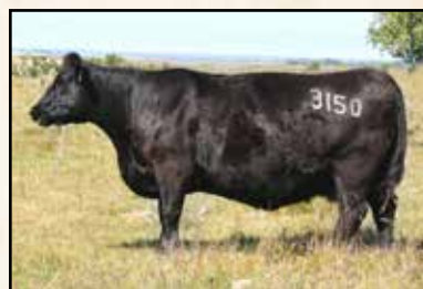
Maternal grand dam B Pride 3150 of Mc Cumber

Recommended for use on heifers- A Tribute son with length, muscle shape, and masculinity. Another Tribute son that real performed on test. 0102 is a smooth fronted, sound structured bull with a large scrotal and well-shaped hoof. His dam is moderate, feminine, near perfect uddered daughter of Mc Cumber Titanium 3127. She is produced from a herd favorite B Pride 3150 of Mc Cumber, who excels for fertility, udder quality, fleshing ease, and hoof shape. Her impressive set of Tribute ET sons are highlighted through out this sale.