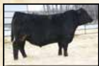
Maternal brothers Mc Cumber Unmistakable 531

Selling 2/3 interest and full possession- A Tribute son to use on cows and reap the benefits of his added performance, length and stature. 076 is one of the top weaning weight bulls of the calf crop earning a WWR of 110 as the 12th calf produced from his 12 year old pathfinder dam. He is a masculine, extended front, long bodied bull with loads of performance. His pathfinder dam, who still qualifies as a 12 year old always brings in a good one and is one of the most fertile, productive cows on the Ranch. She has never missed to the AI service, even while raising two sets of twins. She is currently nursing her 13th calf and is a standout bull calf by Manzano Electra 0214.