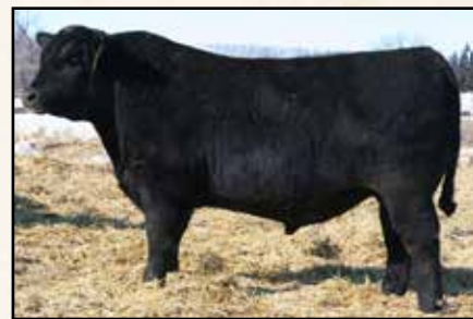
Full brother to Dam Mc Cumber Fortunate 367