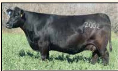
Dam Miss Wix 2002 of Mc Cumber

Selling ½ interest and full possession- A Zodiac son bred to adaptable, low maintenance and problem free. 0037 is a big bodied, wide made son of Zodiac and produced from Miss Wix 2002 of Mc Cumber. He is a wide based, easy going bull with natural width and dimension. His impressive dam is a member of the Tremendous X Miss Wix 2022 flush and ranks right up there on my list of favorite females on the Ranch. She produced the top-selling bull in our 2019 Production sale by XXP and her natural born bull by Zodiac last year was retained as a herd sire here. We will get his first calves this spring. By stacking generations of like cattle the outcome becomes pretty predictable and leads to positive outcomes.