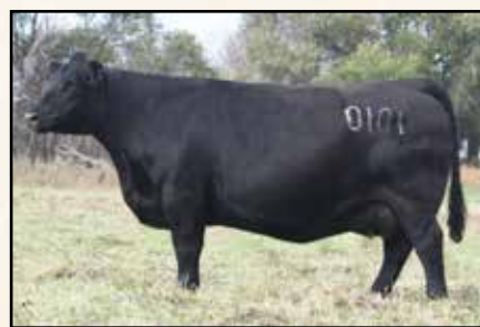
Maternal great grand dam Lassie 0101 of Mc Cumber

Selling 2/3 interest and full possession- Recommended for use on heifers- A moderate framed, deep ribbed, thick made calving ease herd bull prospect that displays muscle mass, base width and expression to hip and hind quarter. He is a soft made, sound structured Armour son that has been a favorite of mine all winter. He combines good performance with an actual REA of 14.6. His dam is a high volume, feminine fronted daughter of Unmistakable and traces back to the donor dam Lassie 0101 of Mc Cumber, whose sons have been top selling sale features of past production sales. Not only should he calve easy, but sire those beautiful fronted, big bodied females that work in any environment.