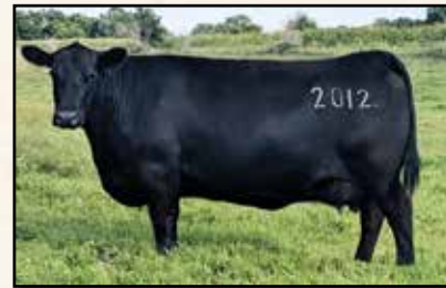
Dam Miss Wix 2012 of Mc Cumber

Selling ½ interest and full possession- An ET bull produced from the mating of Mc Cumber Trademark 4203 and Miss Wix 2012 of Mc Cumber. 0012 is the more moderate of the pair and possesses incredible soundness, softness and structure. He is a free-moving big middled bull with cow-maker written all over him. He has a big, wide square hip and is very balanced in his overall design. He weaned off his recipient dam over 800 lbs. and combines plenty of performance with an excellent disposition, large scrotal and hoof shape. His pathfinder, donor dam Miss Wix 2012 of Mc Cumber is a member of the famous OCC Tremendous 619T X Miss Wix 2022 of Mc Cumber flush that has and will continue to leave a large influence on our program. The 3 sisters have not only played a large role to this point but are the kind we will continue to build our program around. The flush mate sisters are outstanding and we will anxiously wait to get them into production. A pair of flush brothers with as much maternal quality as we can breed into one.