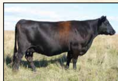
Maternal grand dam Miss Wix 7176 of Mc Cumber

An April born bull that has really gotten it done. This big bodied, wide-made bull is moderate, heavy muscled and wide based. He is a wide tracking, big rumped beef bull that earned nearly a 800 lb. 205-day weight to ratio 102. His dam is beautiful, deep ribbed, near perfect uddered daughter of Mc Cumber Titanium 5005 and is produced from 2 consecutive generations of pathfinders. She is good footed, easy fleshing and easy going. Although the youngest bull in the offering, 0298 has performed at every measure and is a heavy muscled, big bodied bull that will sire efficient, easy fleshing females.