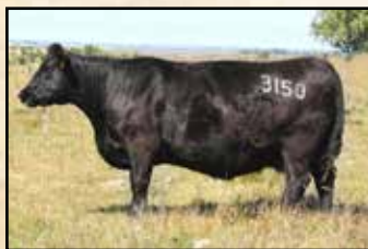
Maternal grand dam B Pride 3150 of Mc Cumber

Selling 2/3 interest and full possession- A Tribute son for use on cows with added width, depth and stoutness. 016 pounds down the scale. He is wide based, big bodied, and square hipped. He has a perfect disposition, large scrotal and base width. He has been a standout since birth and jumps through every hoop in front of him. His beautiful, feminine, perfect uddered dam by Unmistakable is produced from one of the top cows on the Ranch in terms of fleshing ease, udder quality and fertility. She has never missed to the AI service. 016 will sire those, big bodied, easy fleshing females that will convert on forage and leave male progeny that will fit any segment of the industry. One of the top Tribute sons in the sale with the added performance and maternal quality you can expect from Tribute.