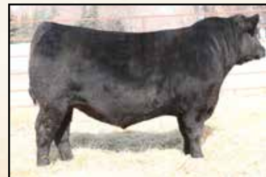
Mc Cumber 5005 Titanium 9142