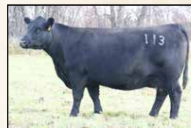
Maternal grand dam Lassie 113 of Mc Cumber