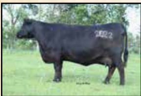
Maternal grand dam Miss Wix 2022 of Mc Cumber

Selling 1/2 interest and full possession- The flush brother to Mc Cumber Trademark 0012. 0013 is a bigger framed, longer bodied bull with extra extension to his neck. He is an extremely free moving, long strided bull with masculinity and soundness. He was a heavy weaning bull, coming off his recipient dam at 850 lbs. in September. His pathfinder, donor dam will rank among the all-time top cows in our program and her influence within our program will be appreciated for many generations. In addition to her fertility and productivity, she excels for hoof shape, udder quality and disposition. As more of her daughters come into production we can see the positive impact she will leave. 0013 should sire those beautiful, feminine fronted females with plenty of capacity and natural thickness, the kind everybody wants.