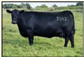
Dam Miss Wix 2012 of Mc Cumber