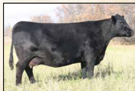
Miss Wix 9122 of Mc Cumber

Selling 2/3 interest and full possession- Recommended for use on heifers- A royally bred Tribute son that started with just a 62 lb birth weight and then weaned off with a 205 day weight of 736 lbs. for a WWR of 104 as his dam's first calf. He exploded on test with an ADG of 4.11 lbs/day and has a 365 day weight of 1400 lbs. for a YWR of 107. 021 is a masculine, long bodied, thick-made son of Tribute with an outstanding disposition, large scrotal, and maternal quality bred in for generations. His dam is a highly productive, neat uddered, easy going daughter of Unmistakable and is produced from an outstanding Mc Cumber Tremendous 2008 daughter out of the herd bull producing Miss Wix 9122 of Mc Cumber. This set of Tribute sons have exceeded our expectations, we have never used a bull that is consistently light birth and then have the added performance and power his son's possess. 021 ranks near the top of this strong group of Tribute sons combining calving ease, performance and cow power together.