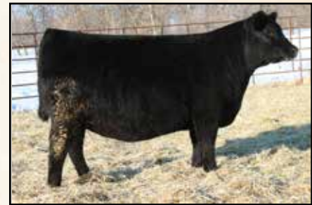
Maternal sister Gale 867 of Mc Cumber

Selling 2/3 interest and full possession- Recommended for use on heifers- What a chunk. 0187 is a moderated, extra wide, big middled Armour son with added base width and dimension. He is built like one that can thrive in a low input environment and convert forage efficiently. To go along with this he is one of the top IMF bulls of the offering with an IMF score of 5.45 for a ratio of 211, which along with his body type could make him a logical choice for a grass finishing program. His moderate, deep ribbed, neat uddered dam by OCC Tremendous 619T is a highly productive, fertile cow with an excellent disposition. She is also the dam to the 2019 popular and high selling heifer Miss Wix 867 of Mc Cumber that sold to 5L Red Angus in MT, where she entered their ET program. He may not be for everybody, but in the right situation will thrive.