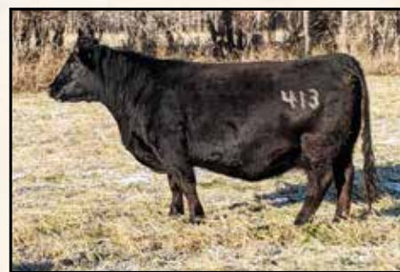
Dam Bemndful Maid 413 Mc Cumber