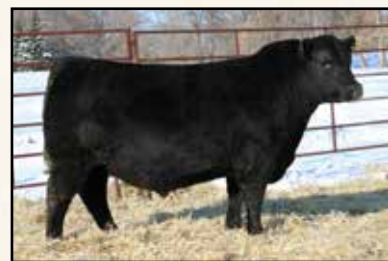
Maternal brother to dam Mc Cumber 5005 Titanium 899

Recommended for use on heifers- A well-balanced, good looking son of Tribute that catches your eye when going through the pen. He is a big bodied, wide based, square hipped bull with plenty of muscle and natural thickness. His dam is a picture-perfect daughter of Mc Cumber Titanium 3127 with impeccable udder structure. She is naturally thick, deep ribbed and feminine fronted. A moderate milking, easy fleshing female that is built to last a long time. She has a perfect record for fertility to this point and traces back to the influential B Pride 463 of Mc Cumber. Built to handle the rough country and bred to leave fertile, easy fleshing, forage converting females.