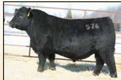
Mc Cumber Unmistakable 576