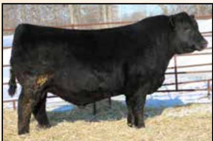
Maternal brother Mc Cumber Steadfast 8175

Selling 2/3 interest and full possession- 032 is the type of bull to take home and build a cow herd out of. He is a well-made, big bodied, naturally thick son of Armour that weaned off his 12 year-old dam at 850 lbs. in mid-September. He is a wide based, easy moving bull with a wide, square hip and puts his feet down in the corners. His pathfinder dam has never missed and is nursing a standout heifer calf again this year. She is a deep bodied, neat uddered daughter of 4X13 that never fails to bring in a good one and her highly productive daughter by Titanium 3127 is the dam of the powerful Tribute son 0116 selling in this sale. Fertility, productivity, low maintenance, problem free genetics bred in this good bull for generations.