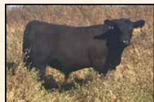
Lot 29 just prior to weaning

Selling 2/3 interest and full possession- A bit of an outcross on the top side of his pedigree, 092 is a well-balanced, long bodied, high performing son of Manzano Electra 0214. He has excelled from birth with top weaning and yearling performance. He is a long striding, sound structured bull with added shape and dimension to his rear quarter. His time-tested, long lasting dam is an outstanding daughter of 4X13 and produced by Miss Wix 2022 of Mc Cumber. Not nearly as famous as her maternal sisters sired by Tremendous, 9259 has excelled in her own right. She sports a WWR of 10@103 and is currently nursing a top full sister to 092 already this year. She has never missed to the AI service and at the age of 12 this year looks and acts like a cow half her age. 0214's dam produced to the age of 15. Longevity and Fertility bred in on both sides of 092's pedigree. Two of the main drivers of profit for cattlemen.