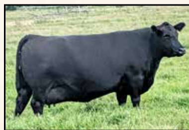
Maternal grand dam Holly 411 of Mc Cumber

Recommended for use on heifers- 0212 is the result of a mating combination I really like. Tribute on these 5005 daughters really seems to work well. They are thick, masculine, wide hiped bulls with base width and body depth. 0212 is built how I described. He earned a WWR of 101 as his dam's first calf and has a REA of 14.1 sq. in. for a ratio of 105. His dam is very nice with abundant capacity, femininity and impeccable udder quality. She is produced by a powerful 2008 daughter with extra mass and thickness. She is an impressive cow. These younger Tribute sons out of the first calf heifers are really a good bunch of bulls with the same masculinity, muscle shape and rib shape as their older contemporaries out of the cows.