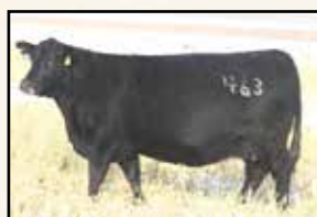
Maternal grand dam B Pride 463 of Mc Cumber

Selling 2/3 interest and full possession- 0176 is another son of the Manzano Electra 0214 bull that offers some new genetics to our gene pool. They look like they are going to fit in well. 0176 is a big, long bodied, heavy muscled bull with an excellent disposition and the soundness and structure to cover a large group of cows. He has performed outstanding from the start and was a standout of the calf crop all summer. His dam is a bigger framed, feminine fronted perfect uddered daughter of Mc Cumber Tremendous 2008 and is produced by the pathfinder, donor dam B Pride 463 of Mc Cumber. She has never missed to the AI service and is nursing her 4th AI sired calf already this spring. This stout, high performing bull is sure to add some length and pounds to a calf crop and you won't have to sacrifice the maternal quality that has been bred in for generations.