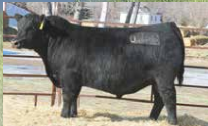
MC CUMBER TRIBUTE 0145