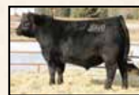
Mc Cumber Tribute 0040