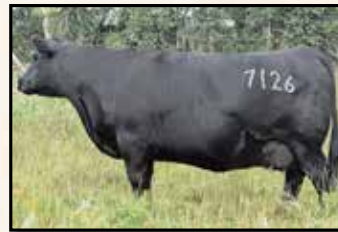
Dam Miss Wix 7126 of Mc Cumber