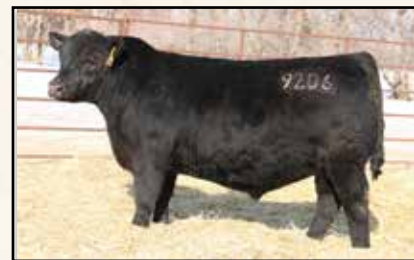
Maternal brother Mc Cumber 5005 Titanium 9206