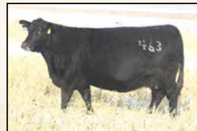
Maternal great grand dam B Pride 463 of Mc Cumber