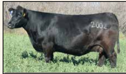
Dam Miss Wix 2002 of Mc Cumber

Selling ½ interest and full possession- 0271 is the natural born bull calf off Miss Wix 2002 of Mc Cumber. The good-looking scamp is well-balanced in his design and possesses explosive muscle shape to his top. He has performed well and combines this with a REA of 15.5 for a ratio of 115 confirming the visual muscle shape he displays down his top. He is a free moving, long bodied bull with excellent breed character and maternal quality on both sides of his pedigree. His dam is an impressive female with abundant rib shape, natural thickness and udder quality. She combines this with excellent hoof shape, extension to her frontend and fleshing ability. Her influence will be lasting here and the future is bright with a large group of young daughters just entering production. 0271 combines the best of the Miss Wix cow family into a complete package.