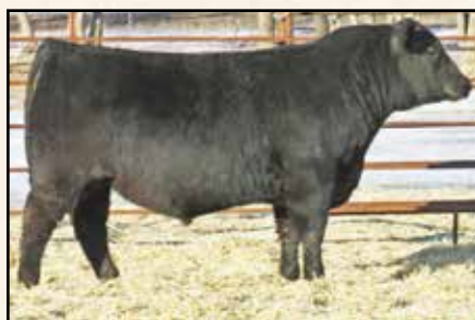
Full brother in blood Mc Cumber Steadfast 0154