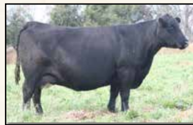
Maternal grand dam Miss Wix 07 of Mc Cumber