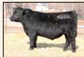
Maternal brother Mc Cumber Sun Dial 9030

Recommended for use on heifers- A calving-ease son of OCC Edge of Glory 841E. He started with just a 74 lb. birth weight and then went on to earn a 205-day weight of nearly 700 lbs. for a WWR of 107. 0051 is a long fronted, smooth shouldered bull with length, depth and thickness. His productive dam has a BWR of 4@90 and a WWR 4@103. She is a deep ribbed, easy fleshing daughter of Mc Cumber Fortunate 213. Calving ease bull that is bred to work in any environment.