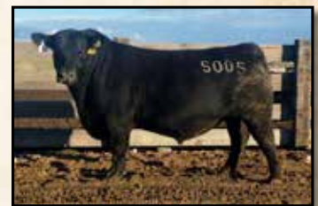
Maternal brother Mc Cumber Titanium 5005