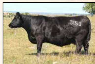
Dam B Pride 3150 of Mc Cumber

Selling 2/3 interest and full possession- Recommended for use on heifers- A high performing, light birth weight member of the Tribute X B Pride 3150 flush. He came off his recipient dam with a 205-day weight of 729 lbs. and then gained 3.87 lbs/day on test and earned a 365-day weight of nearly 1350 lbs. He is the top ultrasound bull of the flush with a REA of 14.4 sq. in. for a ratio of 113 and an IMF ratio of 117. He is a long bodied, big middled, smooth made bull with a large scrotal and easy going disposition. I have talked a lot about their donor dam B Pride 3150 and the best way to describe her is she is balanced. She balances many traits both measureable and ones not easily measured. She will remain a key piece of the gene pool within our program.