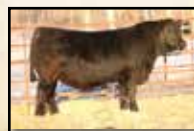
Maternal brother to dam Mc Cumber 5016 Fortunate 9042

A long bodied, big ribbed, wide tracking grand son of Mc Cumber Steadfast 635. 0055 is a heavy weaning bull earning a 205-day weight of 769 lbs. for a ratio of 106. He has a REA ratio of 108. He is produced by a productive, fertile line of cows that bring in a good one every year.