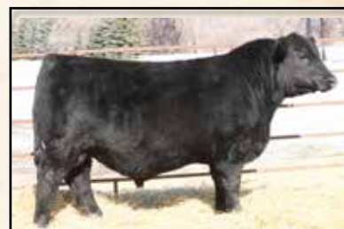
Full brother Mc Cumber 5005 Titanium 9176

Selling ½ interest and full possession- A true power bull in terms of muscle mass, body width, rib shape and stoutness. Remington is a rugged built, masculine, wide tracking, big hipped son of Mc Cumber Titanium 5005 and one of the top sons we have produced. He is the type of bull not often found in today's race for extreme growth, high carcass Angus genetics. He displays true Angus breed character and moves across the pen with authority, putting his large well shaped hoof down true and wide. He has performed well from the start with excellent performance at every measure. He is built to add power in terms of rib shape, natural thickness and bone density. His 11 year old dam has been a staple of consistency. Miss Wix 0170 is a big volume, naturally thick daughter of OCC Tremendous 619T with impeccable teat size still at age 11, hoof shape, and soundness. She is nursing her 10th calf already this year and has produced 3 daughters all of which are top cows within our program. She is the type of cow we would love to have a whole herd of. She just gets the job done year in and year out. Remington is a sale highlight and one of the stoutest, heaviest muscled bulls we have bred. Not only will he power up a set of females, but is bred to ensure they are productive, fertile and problem free.