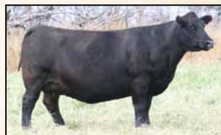
Dam Miss Wix 9102 of Mc Cumber

Selling 2/3 interest and full possession- An impressive, heavy muscled, big butted son of Armour from the ET program. He along with 2 of his flush brothers represent herd building, cow making, maternal genetics. This masculine, wide made Armour son has been a standout since birth, he has impeccable breed character and a herd bull presence to him. His 4th consecutive pathfinder, donor dam sets the bar for udder quality. Still at the age of 12 has impeccable teat size and udder attachment. She is good footed, big bodied, easy fleshing and easy to get along with. His flushmate sisters will be a highlight of the heifer offering and if you want a glimpse as to what the daughters of 0128 will look like go check them out. You will not be disappointed.