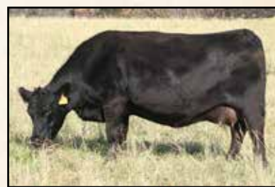
Dam Gale 9169 of Mc Cumber

The Big Time daughters are high volume, wide made females with excellent udders and wonderful disposition. 0216 displays these traits as well and is produced from a 12 year old 4X13 daughter who calved again this year to the AI service and is raising a full brother to 0216. Her dam is a moderate, easy fleshing, neat uddered cow that does the little things right. A predictable genetic package bred to be profitable.