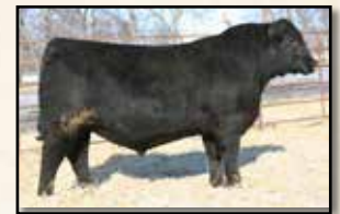
Full brother to Dam Mc Cumber Titanium 5195