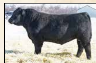
Maternal brother Mc Cumber Fortunate 235