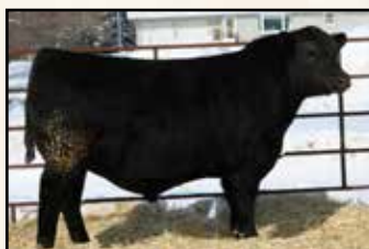
Maternal brother Mc Cumber Steadfast 8105