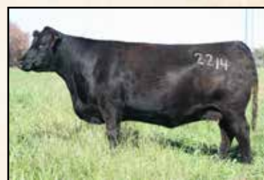
Maternal grand dam Rosetta 2214 of Mc Cumber