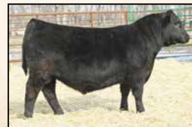
Maternal brother to dam Mc Cumber Steadfast 0030