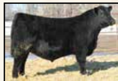
Maternal brother Mc Cumber 4154 Fortunate 6161

Recommended for use on heifers- A moderate framed, deep ribbed, smooth fronted son of Tribute with a masculine, traditional breed character. He is free moving, nicely balanced and good footed. His beautiful dam is a feminine, long bodied, high volume daughter of Mc Cumber Fortunate 241. She is a consistently low birth cow and has impeccable udder quality and hoof structure and shape. She has an outstanding record for fertility and has a top Tribute bull calf nursing her this year. Real complete, attractive bull by Steadfast.