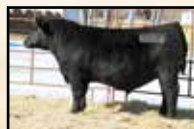
Flush brothers Mc Cumber Tribute 0149

Recommended for use on heifers- A calving ease member of the Tribute X B Pride 3150 flush. 0014 is a long bodied, smooth fronted bull with an extended front end. He is deep ribbed, free moving and is soft in his overall design. He started with just a 72 lb. birth weight and then gained 3.66 lbs/day on test. His donor dam is a herd favorite that excels for hoof shape, udder quality and fleshing ease. Every daughter she has produced has been retained here as a replacement.