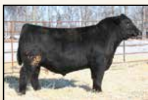
Mc Cumber Fortunate 559