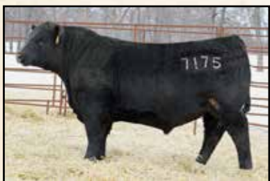
Sire Mc Cumber 5005 Titanium 7175

A big, long bodied, feminine heifer with rib shape, and natural thickness. Both her sire and dam are produced by current donors here and represent a new generation of maternal quality. One of the top performance heifers of the calf crop 088 weaned off her dam with a WWR of 105, and just exploded post weaning earning a YWR of 112. Along with this she balances REA and IMF with ratios above the average for both. Her dam is an impressive Unmistakable grand daughter with fleshing ease, rib shape, and udder quality. She is produced from Miss Wix 2195 of Mc Cumber who was flushed for the first time this past spring. A top performing, well-bred heifer that has top cows stacked in her pedigree.