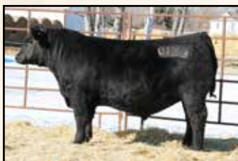
Maternal brother to dam Mc Cumber Tribute 0149