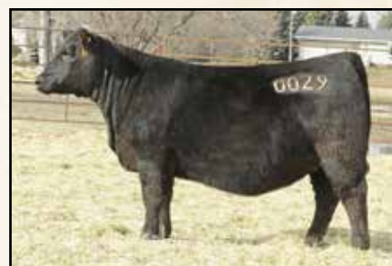
Flush sister Miss Wix 0029 of Mc Cumber