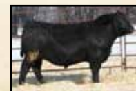
Produced by cow family Mc Cumber Fortunate 5051