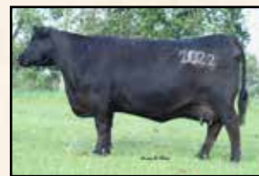
Maternal great grand dam Miss Wix 2022 of Mc Cumber

A long bodied, big ribbed son of Steadfast. 091 has added length, body capacity and plenty of thickness. He gained well on test with an ADG of 3.87 lbs/day and earned an IMF ratio of 141. His dam is a perfect uddered, feminine fronted daughter of Fortunate Son and is produced by one of the best 4X13 daughters we ever produced. 091 traces to Miss Wix 2022 of Mc Cumber on both sides of his pedigree ensuring his ability to sire productive, fertile, problem free females.