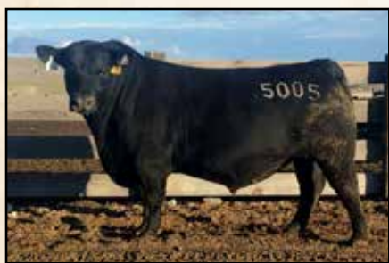
Sire Mc Cumber Titanium 5005

A heavy weaning, well-made long bodied son of 5005. 0042 earned a WWR of 112 and performed well this winter with an ADG of 3.86 lbs/day. He is a masculine, sound structured bull that moves with ease and possesses the muscle shape, big hip and base width common among the 5005 sire group. His dam is a long bodied, deep ribbed daughter of Mc Cumber Fortunate 213 with a WWR of 5@104 and a calving interval of 5@359. She is produced from a productive, long-lived pathfinder dam.