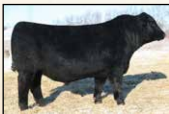
Mc Cumber Fortunate 307