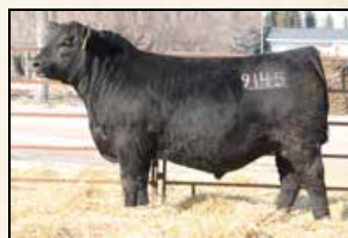
Maternal brother to dam Mc Cumber 5005 Titanium 9145

A bit bigger-framed daughter of Tribute with extra extension to her neck and attractive, well-balanced design. She has performed across the board, even after starting with just a 64 lb. birth weight. Her dam is an easy going, feminine fronted daughter of OCC Big Time 746Z and is produced from a long-lived productive, pathfinder dam that earned a WWR of 10@102. We love the first Tribute daughters in production.