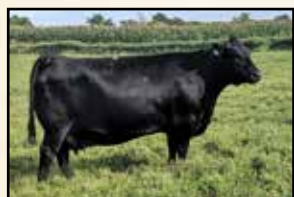
Dam Lassie 935 of Mc Cumber

Selling 2/3 interest and full possession- An attractive, well-built bull produced from the flush of Armour to Miss Wix 9102 of Mc Cumber. 0021 has a presence all his own. This fancy fronted, stout made, big hipped bull really has a neat look to him. He is a good traveling bull and can really get out and move across the pen. He is masculine, wide based, and big topped. Choice of two flush sister will be a highlight of the heifer offering and his 4th generation pathfinder dam is a productive, fertile, perfect uddered daughter of Missing Link that entered the donor pen based mainly on traits that are not easily measured. A neat looking bull with the stoutness, soundness and generations of top cows behind him.