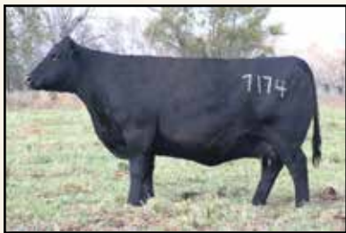
Maternal grand dam Rosetta 7174 of Mc Cumber

A powerful heifer with performance, maternal quality, and fleshing ease bred in. 038 is a stout, big topped, square hipped daughter of Mc Cumber Steadfast 635 with a WWR of 103 and YWR of 104. She combines this with one of the top REAs of the calf crop earning a REA of 14.2 for a ratio of 126. She won't be hard to fine among an impressive set of sale heifers.