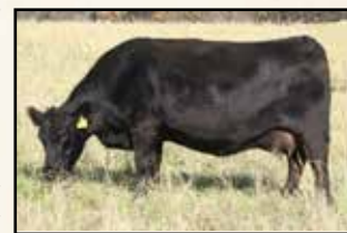
Maternal grand dam Gale 9169 of Mc Cumber.

A big, high volume Steadfast son that has performed with the best of them. He weaned off at over 800 lbs. and then gained 4 lbs/day on test to earn a 365-day weight of 1394 lbs. for a ratio of 105. His dam is an extremely docile, easy going daughter of Mc Cumber Fortunate 241 with extra capacity. Her dam Gale 9169 of Mc Cumber is still in production here at the age of 12.