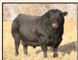
Sire Mc Cumber Big Time 7188