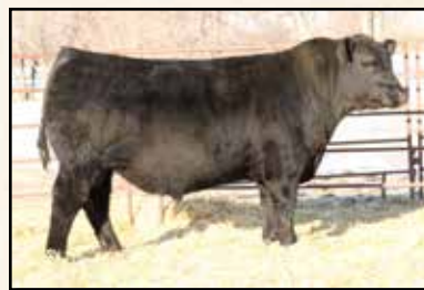
Full brother Mc Cumber Tribute 9216