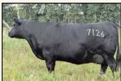
Dam Miss Wix 7126 of Mc Cumber

Selling 2/3 interest and full possession- Recommended for use on heifers- A high volume, naturally thick son of Tribute and a maternal brother to Mc Cumber Titanium 5005. 0005 is a big bodied, masculine, easy fleshing ET son of Miss Wix 7126 of Mc Cumber. He weaned off his recipient dam at 750 lbs and gained 3.70 lbs/day on test. His dam is one of the most influential females in our program and this year at the age of 14 will retire to being a full-time donor. The only bull in the flush and lucky for us there are 3 flush sisters that have the brood cow look. He combines the best of the Miss Wix and Lassie cow families and not only should sire easy fleshing, moderate framed, problem free females, but possess the performance to sire male progeny the will fit the industry.