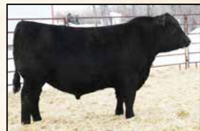
Maternal brother Mc Cumber Emulation 837

Probably the smallest framed bull in the offering, but this guy is loaded with meat. He is a stout, heavy muscled, well-balanced son of Chapman Memento 7601. This expressively muscled, wide based, thick rumped bull is big bodied and sound structured. He is packing a lot of weight on a moderate frame. His visual muscle expression is confirmed with a REA of 14.3 for a ratio of 106 and a REA/CWT of 1.24. His big bodied, tight uddered dam by Unmistakable has a WWR of 3@107 and is a newly qualified pathfinder this year. I realize this guy may not be for everyone but take a look if you are concerned with mature size and lack of ability. This one can change it quickly.