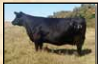
Maternal grand dam Miss Wix 5139 of Mc Cumber

Recommended for use on heifers- A big framed, stretchy son of Tribute with masculinity and muscle shape. 065 is one of the bigger framed bulls in the offering if you are wanting to add some frame and length, he is one to take a look at. He has performed well across the board earning ratios over the average at every measure. His pathfinder dam is a broody, deep ribbed feminine fronted full sister to Mc Cumber Fortunate 213. She never fails to bring in a good one. She is a highly productive, fertile, easy fleshing daughter of Fortunate Son and Miss Wix 5139 of Mc Cumber, a long-time donor and herd bull producing member of the Miss Wix cow family.