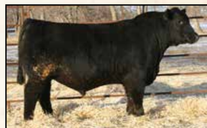
Maternal brother to dam Mc Cumber Fortunate 513

Selling ½ interest and full possession- Recommended for use on heifers- A herd bull prospect with unlimited potential. An outstanding son of Tribute that started with just an 80 lb birth weight and went on to be one of the top performers of the calf crop. 011 is a massive, thick-made, long bodied bull with a large scrotal and excellent disposition. He is a wide based, big ribbed bull that is square hiped and wide based. He gained 4.08 lbs/day on a high roughage ration that never exceeded 45 MCals. He came off test weighing 1430 lbs. and earned a YWR of 108 among a stiff group of contemporaries. His highly productive dam is a feminine fronted, big bodied daughter of Mc Cumber Titanium 3127 and is produced by a top pathfinder dam that produced to the age of 15. His dam produced the Lot 5 and 4th top selling bull in last year's sale to Richard Angus in ND, and is positioned to make a positive impact within our program. Big Time herd bull prospect with the calving ease, performance, and body type to appeal to many.