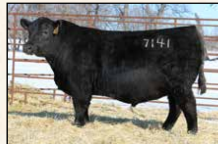
Maternal brother Mc Cumber 307 Fortunate 7141

Selling ½ interest and full possession- A herd bull prospect by 5005 that looks good from any angle. Way more than just a performance bull 049 is the result of a proven mating that never fails to result in a good one. A ¾ brother to Armour and Remington, 049 fits the mold. This big, long bodied, sound structured herd bull has extra length, depth and thickness. He gained 4.68 lbs/day over a 142 day test on just a 45 Mcal ration and weighed off-test at 1495 lbs. to nearly catch Tribute as our all-time heaviest yearling weight bull in our 57 year history. He has a big, square top that carries out into a perfectly designed hip and rear quarter. He is wide based and moves freely as he travels the pen. His moderate framed, beautiful dam by OCC Tremendous 619T is a favorite of mine. She displays perfect hoof shape and has impeccable teat size and udder structure. She is extremely fertile and produced the 3rd top selling bull in our 2018 sale to Chapman Cattle Company in Alberta. His first son's just sold this past February and averaged over $7000. 049 will get your attention with his overall balance, soundness and structure, combined with real world top end performance and the bred in ability to sire females to build a cowherd around.