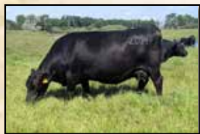
Dam Miss Wix 2003 of Mc Cumber

Selling 2/3 interest and full possession- A full brother to Mc Cumber Steadfast 635. 0036 is a deep bodied, wide based bull with shape and expression to his hind quarter. He has performed well this winter with an ADG of 3.77 lbs/day. His herd bull producing dam has risen to the top of our program. She displays all the characteristics we envision our ideal cow to be. The Steadfast daughters are making excellent young cows with the fleshing ease, udder quality and soundness we would expect.