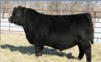
MC CUMBER 829 TITANIUM 0289