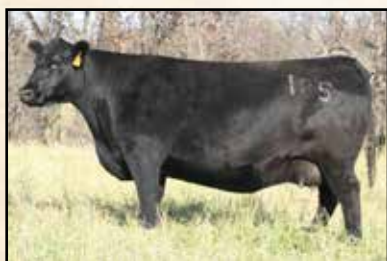
Maternal grand dam B Pride 185 of Mc Cumber

015 is a big bodied, wide made female with extra width and dimension. Built to convert forage efficiently this moderate, easy fleshing female has all the tools to advance a program. Not only has she performed well as her dam's first calf. She earned an IMF score of 5.14 for a ratio of 142. Her moderate, deep ribbed, neat uddered dam by Mc Cumber Titanium 3127 is off to a good start and is built like one that will last a long time.