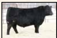
Mc Cumber 5005 Titanium 8160