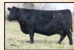
Maternal grand dam Miss Wix 0170 of Mc Cumber