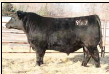
Mc Cumber 5005 Titanium 947