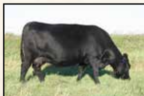
Maternal grand dam Miss Wix 6145 of Mc Cumber