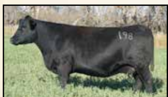
Maternal sister to dam Miss Wix 198 of Mc Cumber

Selling 2/3 interest and full possession- A Steadfast son that combines performance, carcass and cow power as well as any bull in this sale. 0103 is a stout, long bodied, thick topped Steadfast son with added power and muscle. He weaned off his dam with an actual weaning weight of 890 lbs. in September without creep and continued to perform post-weaning earning REA and IMF ratios of 106 and 140 respectively. He ranks among the very top bulls for IMF in the entire offering. His feminine, productive, neat uddered dam is a highly productive, fertile daughter of 4X13 and B Pride 463 of Mc Cumber. She never fails to bring in a good one with a WWR 6@105. We have retained all the daughters she has ever produced. The offering includes a real stout set of Steadfast sons and 0103 will rank right near the top.