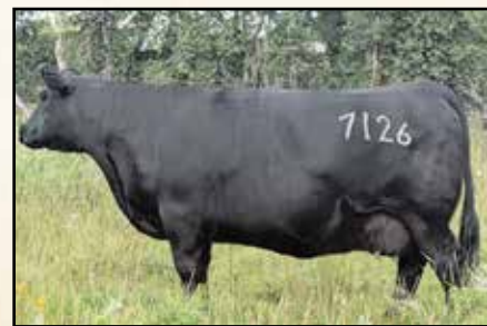
Maternal sister to dam Miss Wix 7126 of Mc Cumber

Selling 2/3 interest and full possession- A thick, meaty Steadfast son with extra rib depth and muscle expression. 0154 combines carcass ultrasound traits as well as any bull in this sale. He has a REA of 15.1 sq in. for a ratio of 112 and earned the #2 IMF score for a ratio of 208. He did this while being slight below average for Backfat. His IMF ranks in the very top percentiles for IMF and he combines this with maternal quality passed on from generations of top cows. His easy going, neat uddered dam is a maternal sister to Miss Wix 7126 of Mc Cumber sired by 4X13. Her 3rd generation pathfinder dam was in production here to the age of 15 and maintained her pathfinder status to the end with a WWR 12@106 and YWR 12 @104. More than just a top carcass bull, 0154 is bred to sire females that will be productive, fertile and long lasting.