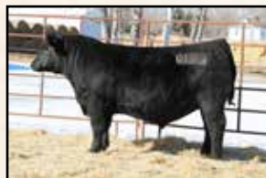
Flush brother Mc Cumber Tribute 0149