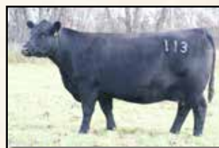
Maternal sister Lassie 113 of Mc Cumber