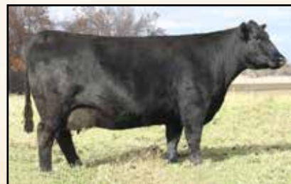
Maternal grand dam Lassie 935 of Mc Cumber