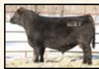
Flush brother Mc Cumber Tremendous 0027

Selling 2/3 interest and full possession- Recommended for use on heifers- 0229 is a member of the OCC Tremendous 619T X Lassie 935 of Mc Cumber flush. Bred to sire calving ease, light birth progeny that have natural thickness, body depth and maternal quality bred in for generations. 0229 has a CED of +14 and a BW EPD of -2.5. He is a big topped, free moving bull with length and depth of body. He did exceptional on the ultrasound with a REA of 15.6 for a ratio of 110 and a REA/CWT of 1.43. He combines this with an IMF ratio of 107. His pathfinder, donor dam is Lassie 935 of Mc Cumber. She has consistently been a light birth weight cow and strong for carcass traits. 0229 is the result of a mating combination that anchors our cowherd, with predictable, easy fleshing, neat uddered, long lasting females.