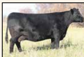
Maternal grand dam Miss Wix 9122 of Mc Cumber

Selling 2/3 interest and full possession- Recommended for use on heifers- 0115 does a lot of thing right. Not only is his pedigree stacked with some of the top cows here. He is one of the top gaining bulls in the offering and combines REA and IMF as well as any bull. He looks the part two with the masculine, muscular build we like to see. He is deep bodied, wide based, and full of meat. His large REA confirms the big, square top he displays. His dam is a quiet, neat uddered, high volume daughter of Mc Cumber Tremendous 2008. She is easy to get along with even with a newborn calf and stays calm and cool in any situation. She is good footed, easy fleshing and a daughter of the herd bull producing Miss Wix 9122 of Mc Cumber, the dam of Mc Cumber Fortunate 307 and Mc Cumber Trademark 4203. I believe you can never stack enough good cows into one. 0115 is bred to consistently sire predictable, profitable progeny.