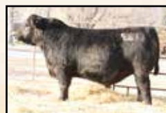
Maternal brother Mc Cumber 7188 Big Time 961

Recommended for use on heifers- A light birth, calving ease prospect by Armour. 02 is a well-balanced, clean made, eye catching bull. He is very well-made, smooth shouldered and free moving. His dam is a herd favorite and combines femininity with extra rib shape and capacity. She is extremely fertile, near perfect uddered and one that always gets noticed when touring the cows. Many generations of top maternal genetics behind 02.