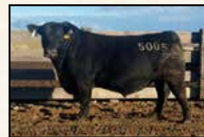
Maternal brother to dam Mc Cumber Titanium 5005