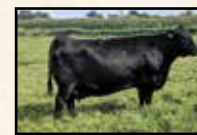
Dam Lassie 935 of Mc Cumber