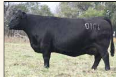
Dam Lassie 0101 of Mc Cumber

Selling ½ interest and full possession- Recommended for use on heifers- An Armour herd bull prospect produced from one the top cows on the Ranch. Lassie 0101 of Mc Cumber excels for udder quality, hoof shape, fleshing ease, fertility and productivity. She is a herd bull producer and her daughters retained in the herd are making their way towards the top. 0191 is an attractive, well-balanced bull with muscle shape and capacity. He displays more shape and expression to his hip and rear quarter than what is common among calving ease bulls. He weaned just a bit lighter due to a slight injury to his dam, but more than made up for it on-test with an ADG of nearly 4 lbs/day and a 365-day weight of nearly 1400 lbs for a ratio of 105. A cow-maker supreme with the softness, extension and mass to sire the type of females everyone wants.