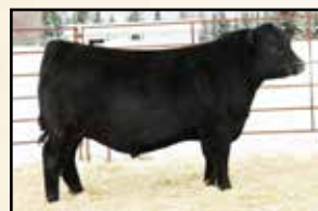
Sire Mc Cumber Steadfast 869

A moderated, long bodied, deep ribbed grand son of Steadfast. He is a wide tracking, free moving bull with masculinity and natural thickness. He has performed well with an ADG of 3.54 lbs/day on a high roughage ration. His 11 year old dam is a long, feminine fronted daughter Sitz JLS Emulation 536P. She has an excellent udder and maintains her condition well. Bred to sire easy fleshing, low maintenance females with longevity bred in for generations.