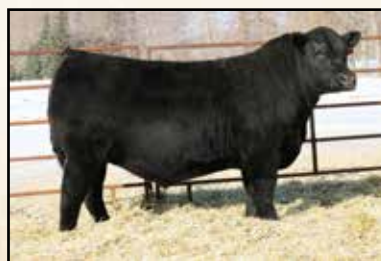
Sire Mc Cumber Armour 7148

Recommended for use on heifers- Armour son cut from the same mold as the rest. 078 is a moderate, sound structured, free moving bull with the combination of muscle and structure. This wide-based, thick-topped son of Armour is produced from a moderate, perfect uddered, easy fleshing daughter of Mc Cumber Rito Rolette 1108. Phenotypically complete bull with maternal qualities bred in for generations.