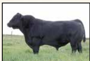
Sire OCC Tremendous 619T