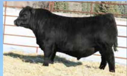
MC CUMBER ZODIAC 098