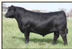
Full brother Mc Cumber Steadfast 635