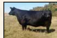
Maternal grand dam Miss Wix 5139 of Mc Cumber