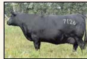
Maternal grand dam Miss Wix 7126 of Mc Cumber