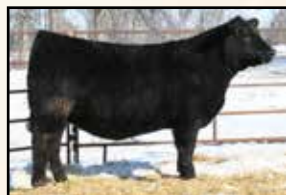
Maternal sister Miss Wix 6127 of Mc Cumber

A moderate, stout, thick son by Chapman Memento 7601E. He is deep ribbed, wide based and thick rumped. He has an easy going disposition and excellent hoof shape. We lost his dam this summer on pasture so he was orphaned for a month before weaning and was ratioed in his own contemporary group. His dam was a moderate, perfect uddered daughter of Mc Cumber Fortunate 248 with impeccable udder structure and an excellent disposition. Her dam was in production here to the age of 11 and maintained exceptional udder quality and soundness.