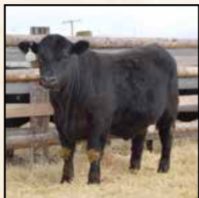
Sire Sinclair Emulation 6FX2

A masculine, muscular son of 6FX2 with a stout hip and rear quarter. 0287 is a moderate framed, wide based bull with extra muscle shape. He is packing a large REA of 15.2 for a ratio of 113 and has a REA/CWT of 1.39 confirming the extra muscle expression he visually displays. His dam is feminine, deep ribbed, neat uddered daughter of Mc Cumber Fortunate 235. The 6FX2 daughters are big bodied, and have a neat, well-attached udder.