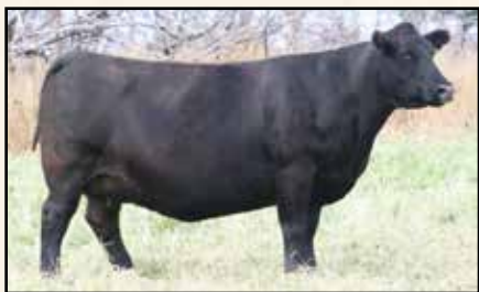
Donor Dam Miss Wix 9102 of Mc Cumber

An ET son of Armour produced from the powerful, pathfinder donor dam Miss Wix 9102 of Mc Cumber. 0146 is a long bodied, masculine bull with an easy going disposition and good hoof shape. He has weaning and yearling ratios of 102 and 103 respectively and gained 3.70 lbs/day. He is square topped, and good hiped. His pathfinder donor dam is a 12 year old Missing Link daughter that traces back to Miss Wix 2022 of Mc Cumber. She is perfect uddered, big bodied, and easy fleshing. She has a good disposition even with a newborn calf and will continue to be flushed here at Mc Cumber. These Armour X Miss Wix 9102 flush brothers are bred to sire those beautiful, big bodied, easy fleshing females with impeccable udder quality and maternal instincts.