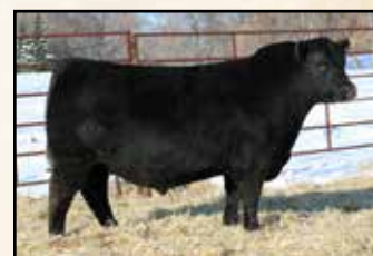
Maternal brother Mc Cumber 5005 Titanium 899