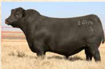
SIRE DUFF RED MEAT 20114

Selling 2/3 interest and full possession - A Red Meat son that is a real load. This thick, massive bodied, wide tracking bull is big hipped and stout made. A forage converter to pounds at its best with some of the best post-weaning performance of the offering. 3105 gained 4.23 lbs/day on test and earned a 365-day weight of 1383 lbs for a ratio of 109. His dam is a tight uddered, small teated daughter of Mc Cumber Titanium 5005 that fleshes easy on forage and converts efficiently. Some new blood for long time customers without sacrificing the goals and direction of our program.