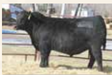
MATERNAL BROTHER MC CUMBER TRIBUTE 0145