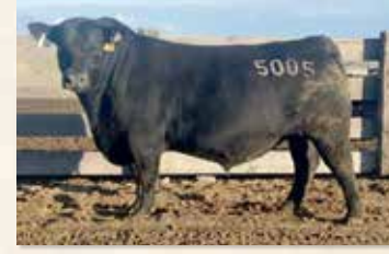
MATERNAL BROTHER TO DAM MC CUMBER TITANIUM 5005