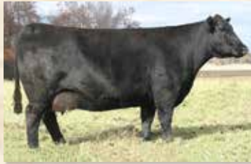
MATERNAL GRAND DAM LASSIE 935 OF MC CUMBER

Recommended for use on heifers - A long, smooth Mc Cumber Armour 7148 son with a big top and good disposition. He can work on heifers and then transition to cows if you desire and has good performance from the start with a WWR of 103. He has a long, free stride and extra expression to his hip. His visual muscle is confirmed by a large REA of 13.4 sq. in. and then combines it with an IMF ratio of 110 while having less than .15 in. Back Fat. His dam is a favorite of mine and on the fast track to the donor pen. She is a stout, big-bodied, easy fleshing near perfect uddered daughter of Mc Cumber Trademark 4203 and her Pathfinder donor dam B Pride 463 of Mc Cumber. In addition, she is docile, has excellent hoof shape and is not only productive but fertile as well.