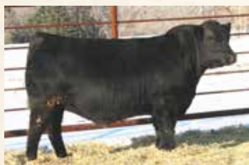
MATERNAL BROTHER MC CUMBER EDGE OF GLORY 295