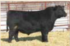
FULL BROTHER MC CUMBER LA JOYA 256

Selling 2/3 interest and full possession - Recommended for use on heifers - A good-looking, well-balanced calving ease bull by La Joya and full brother to one of the top La Joya sons in last year's sale. On pace to match his brother 3156's dam was injured halfway through the summer, and it really affected the performance of 3156. A sleeper with herd bull potential and all the bred in traits to make a positive impact to any program. His dam is a big, stout, thick daughter of Mc Cumber Fortunate 307 and the Pathfinder donor dam B Pride 463 of Mc Cumber. As many of the top cows in our program stacked into the pedigree of this good bull.