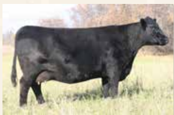
MATERNAL GREAT GRAND DAM MISS WIX 9122 OF MC CUMBER

Selling 2/3 interest and full possession - Recommended for use on heifers - A top young calving ease herd bull prospect sired by Armour and produced from a Pathfinder dam that never fails to bring in a good one. 3255 is a moderate, well-balanced, attractive patterned bull with muscle mass and structural soundness. He is free moving wide based and catches my eye when viewing his pen. His Pathfinder dam is the kind you wish you had a whole herd of. She is fertile, productive and problem free, and exhibits udder quality, excellent hoof shape and fleshing ease still at the age of 11. 3255 has a pedigree stacked with some of the best Miss Wix cows to ever reside here and is bred to pass on consistently the traits that lead to profitability.