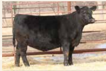
MATERNAL SISTER ENCHANTRESS 015 OF MC CUMBER