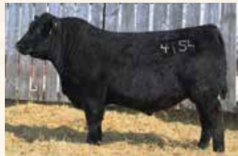
MATERNAL BROTHER MC CUMBER 235 FORTUNATE 4154