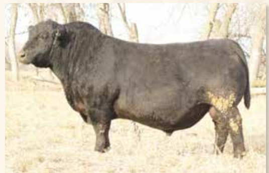
SIRE MC CUMBER ZODIAC 073

Selling 2/3 interest and full possession - This big-hipped, stout, deep ribbed son of Zodiac 073 has extra length and extension. He is long fronted, masculine, and really catches your eye when viewing the pen. He has performed across the board with a WWR of 102, YWR 103, REA ratio of 101 and IMF ratio of 101. His dam is a powerful, easy-going cow with udder quality and impeccable hoof shape and heel depth. A complete bull with balance, forage conversion, fertility and productivity bred in.