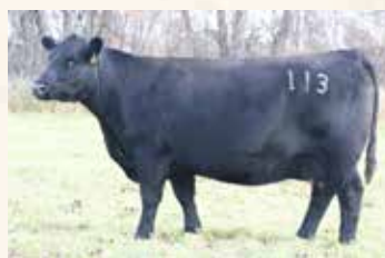
DAM LASSIE 113 OF MC CUMBER