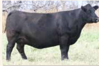
MATERNAL GRAND DAM MISS WIX 9102 OF MC CUMBER