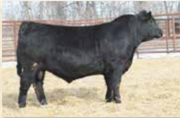
MATERNAL BROTHER TO DAM MC CUMBER EDGE OF GLORY 335

Recommended for use on heifers - Calving ease Tribute son cut from the same mold as the rest. 3109 is a naturally thick, deep ribbed bull that tracks wide and true. He has the masculinity, breed character we demand. His dam is an easy fleshing, neat uddered daughter of Chapman Memento 7601 with abundant rib shape and capacity. A source of maternal strength and calving ease that is backed by a strong line of cows.