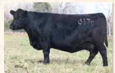
MATERNAL GRAND DAM MISS WIX 0170 OF MC CUMBER