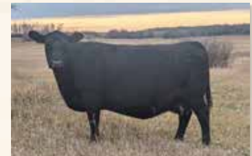
MATERNAL GRAND DAM MISS WIX 3002 OF MC CUMBER

Recommended for use on heifers - A Tribute 702 son with bred in calving ease and maternal strength for many generations. 362 started at just 64 lbs. and has a CED of +13 and -1.5 BW EPD. You will find many of these true calving ease bulls through out the offering and none bred any better than 362. The Tribute daughters are the real deal. They are a real treat to calve. They have impeccable udder quality, are easy going even with a newborn, have excellent mothering instincts and are very productive. The dam of 362 is a deep ribbed, easy fleshing daughter of Manzano Electra 0214 and built like a forage converting machine.