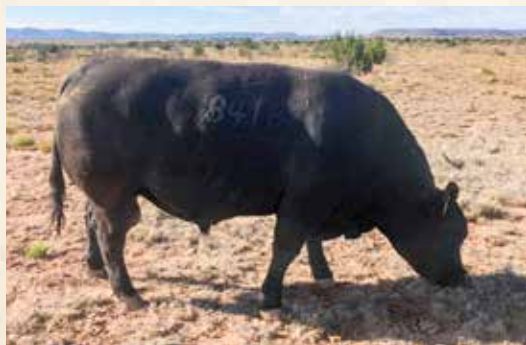
SIRE OCC EDGE OF GLORY 841E

Selling 1/2 interest and full possession - Recommended for use on heifers - Herd bull prospect by Edge of Glory and a top Tribute 702 daughter produced from the 4 consecutive generation Pathfinder donor dam Miss Wix 7126 of Mc Cumber. 331 is a high volume, naturally thick, wide based, square hipped son of Edge of Glory. He is the #1 ADG bull on test with an ADG of 4.49 lbs/day and earned a 365-day weight of 1410 lbs. for a ratio of 111. His dam may be on the fast track to the donor pen and has once again calved first service AI. Miss Wix 0001 of Mc Cumber is a capacious, naturally thick, easy fleshing, near perfect uddered young female. She is built to convert forage and does it efficiently. 331 is one of the top Edge of Glory bulls in this sale and descends from some of the best cows to ever reside at Mc Cumber.