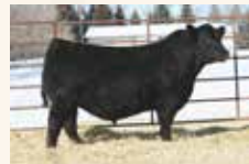
FULL BROTHER MC CUMBER NOBLE 1121

Selling 2/3 interest and full possession - Recommended for use on heifers - An outstanding Tribute 702 son that has all the ingredients of a top herd bull prospect. This masculine, heavy muscled herd bull prospect is a full brother to past sale feature and 2nd top selling bull Mc Cumber Noble 1121. His dam is a moderate, easy fleshing, near perfect uddered daughter of Fortunate Son that never fails to raise a good one and has already calved again to La Joya. Earning her way to the donor pen the old fashioned way, by proving it. 379 has been near the top this winter with an ADG of 4.02 lbs/day and a YWR of 102. He combines both REA and IMF with ratios of 110 and 101 respectively. 379 represents the kind to build a cow herd around.