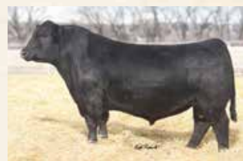
MATERNAL BROTHER TO DAM MC CUMBER TITANIUM 3127