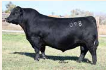
MATERNAL BROTHER TO DAM MC CUMBER LA JOYA 098