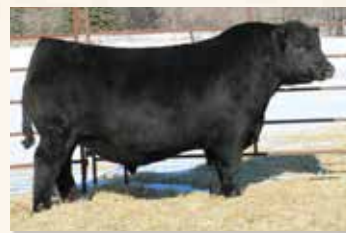
MATERNAL BROTHER TO DAM MC CUMBER REMINGTON 031