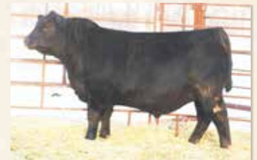
FULL BROTHER MC CUMBER LA JOYA 202