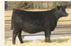
FULL SISTER TO DAM MISS WIX 0148 OF MC CUMBER