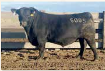
MATERNAL BROTHER TO DAM MC CUMBER TITANIUM 5005