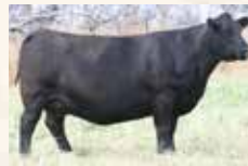
MATERNAL GRAND DAM MISS WIX 9102 OF MC CUMBER

Recommended for use on heifers - Royally bred calving ease bull. 3130 is loaded with top cows and every cow in the 3rd generation of his pedigree are Pathfinder females. 3130 is a good-looking, deep ribbed, thick made son of Mc Cumber Tribute 0145. He is wide based and big hipped. His moderate framed, neat uddered dam is a full sister to past sale feature females Miss Wix 0148 of Mc Cumber. Her Pathfinder donor dam sets the bar for udder quality and at 15 years of age is still in production. As many top cows in the pedigree of 3130 as we can put in one.