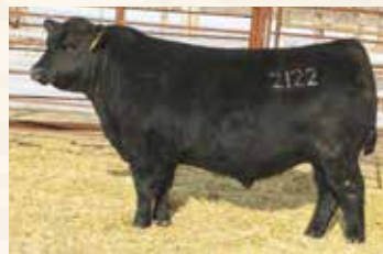
MATERNAL BROTHER MC CUMBER 4 REAL 2122

Mc Cumber Armour 7148 Lassie 9185 of Mc Cumber Lassie 456 of Mc Cumber