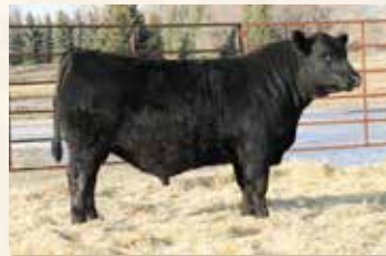
MC CUMBER TRIBUTE 0212

Recommended for use on heifers - A masculine, muscular Mc Cumber Tribute 702 son with plenty of performance and muscle. He is a heavy weaning bull that earned a WWR of 102 and is produced by a top young Mc Cumber Titanium 5005 daughter. Holly 8188 has massive volume, excels for udder quality, is easy fleshing and is sound structured. The 3rd Mc Cumber Tribute 702 son she has produced and one that possesses all the ingredients to positively impact a program.