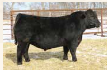
MATERNAL BROTHER TO DAM MC CUMBER ELECTRA 092

Recommended for use on heifers - Calving ease son of Mc Cumber Believe 1169. Believe is the 2022 sale topper to 66 Ranch in Canada. 3116 is a sound structured, naturally thick, easy fleshing calving ease bull. He is the #1 IMF bull of the calf crop with an IMF ratio of 178. His dam is a wedge shaped, big hiped, feminine fronted daughter of Mc Cumber Titanium 3127 and daughter of Miss Wix 9259 of Mc Cumber who produced to the age of 14. A pedigree loaded with good cows.