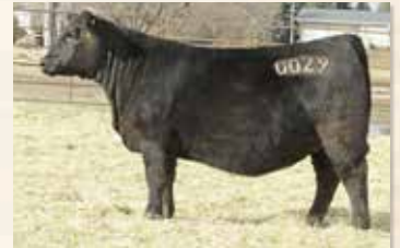
FLUSH SISTER TO DAM MISS WIX 0029 OF MC CUMBER