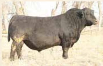
SIRE MC CUMBER ZODIAC 073

A powerful Edge of Glory daughter that ranked near the top at weaning with a WWR of 110. 368 is not hard to find in a pen full of good ones. 368 is built stout from the ground up with substance and bone. She has added rib shape and dimension and carries extra width down her top out into a big, wide square hip and rear quarter. Her dam is a moderate, neat uddered, deep bodied daughter of Mc Cumber Steadfast 635 and is produced from a now 10-year-old Rito Rolette dam that looks like she is 6. Her dam produced well into her teens and was a productive, fertile, donor dam in Canada. 368 is backed by generations of fertile, productive, forage efficient, long-lived females that helps to remove the guess work.