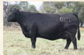
MATERNAL GREAT GRAND DAM LASSIE 0101 OF MC CUMBER