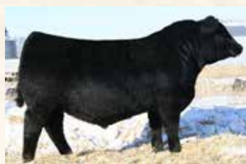
MATERNAL BROTHER TO GRAND DAM MC CUMBER TITANIUM 3127

A sweet, high volume, thick made Tribute daughter that fits his mold. Light birth and good performing in a naturally thick, deep ribbed package that is sound and built for any environment. The Tribute daughters are some of the best young cows on the Ranch with impeccable udder quality, dispositions, maternal instincts and productivity. 350 is backed by a strong line of cows that traces back to the dam of Mc Cumber Titanium 3127.