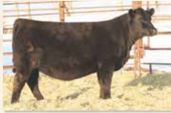
MATERNAL SISTER TO DAM Sired BY 4 REAL LASSIE 2249 OF MC CUMBER