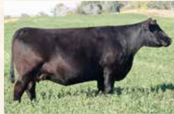
DAM ROSETTA 277 OF MC CUMBER