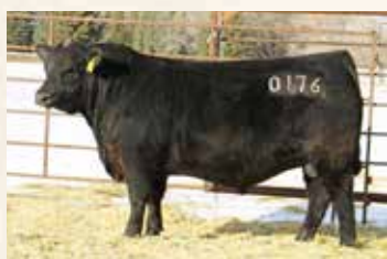
MATERNAL BROTHER MC CUMBER ELECTRA 0176