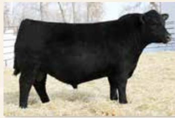
MATERNAL BROTHER MC CUMBER 5005 TITANIUM 8153

Sinclair Fortunate Son Miss Wix 5227 of Mc Cumber Miss Wix 2002 of Mc Cumber