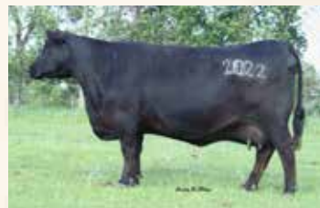
MATERNAL GREAT GRAND DAM MISS WIX 2022 OF MC CUMBER