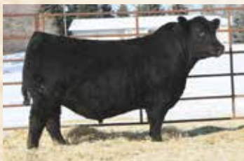
SIRE MC CUMBER NOBLE 1121

A cow prospect with rib dimension, base width, a square hip, and level top. 3150 is naturally thick with the build to work in any environment. Her dam is a favorite, with extra capacity, natural thickness, and impeccable udder quality. She is good footed, easy fleshing, and fertile. She always brings in a good one with sons working in top commercial operations and a daughter retained as a replacement. Top cow prospect.