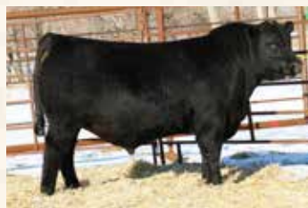
MATERNAL BROTHERS MC CUMBER TRADEMARK 0109