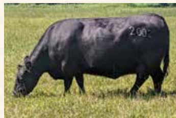
MATERNAL GRAND DAM MISS WIX 2002 OF MC CUMBER

Selling 2/3 interest and full possession - Recommended for use on heifers - A Tribute son that not only doubles up the flush sister Miss Wix 2003 of Mc Cumber and Miss Wix 2002 of Mc Cumber but goes 3 times to Miss Wix 2022 of Mc Cumber in 4 generations. Predictable fertility, productivity and longevity bred into this good bull. A full brother in blood to 327 selling in this sale and are generations of our very best cows stacked into his pedigree. This heavy muscled, calving ease bull started at just 71 lbs. and then earned a WWR of 104 as his dam's first calf. He is packing a large REA of 12.6 sq. in. for a ratio of 105 in his contemporary group and confirms the extra shape and expression he displays. His dam has extra rib dimension, she is wide made and has excellent udder quality and teat placement. She maintains her flesh well and bred right back to the AI service and has a stout bull calf nursing her again. Consistency and predictability is bred into this bull with all the top cows our program has to offer.