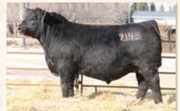
MATERNAL BROTHER TO DAM MC CUMBER 5005 TITANIUM 9145

Recommended for use on heifers - Starting at just 64 lbs. at birth and combining that with a +12 CED and -1.4 BW EPD will help ensure his ability to be a true, no doubt, calving ease prospect. 357 is a well-balanced, smooth made bull with plenty of rib and muscle. His dam is docile, easy fleshing, neat uddered and produced from 3 consecutive generations of Miss Wix Pathfinder dams.