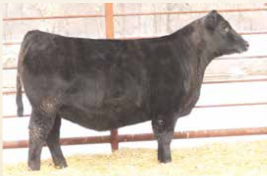
PATERNAL SISTER MISS WIX 268 OF MC CUMBER

Selling 2/3 interest and full possession - Here is one stout, big-bodied, massive, heavy muscled bull. 372 has as much capacity and internal dimension as you can put into one. In addition, he has performed at every measure and possesses not only the phenotypic ingredients to sire easy fleshing, forage efficient females that will thrive in any environment, but it is bred into him maternally from the easy fleshing, high volume, naturally thick females from which he descends. He stands down on a well-shaped hoof with extra bone and substance. He has an excellent disposition and has been a favorite of mine all year. An excellent option for long-term customers looking for a little different pedigree.