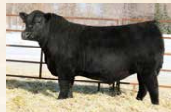
MATERNAL BROTHER MC CUMBER ARMOUR 7148