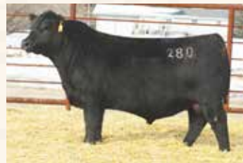
MC CUMBER LA JOYA 280