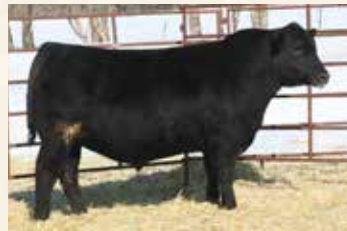
MATERNAL BROTHER MC CUMBER TRIBUTE 1106

One of the top bulls at weaning with a WWR of 110. 3118 is a masculine, muscular Red Meat son with muscle expression to his hip and hind quarter. He stands down on a well-shaped hoof with plenty of heel and possesses the capacity and rib dimension to sire forage efficient, easy fleshing progeny. His productive dam is a top daughter of Mc Cumber Trademark 4203 and daughter of the Pathfinder donor dam B Pride 463 of Mc Cumber.