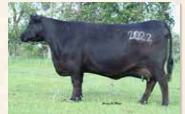
MATERNAL GRAND DAM MISS WIX 2022 OF MC CUMBER