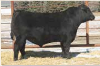
MATERNAL BROTHER TO DAM MC CUMBER 4 REAL 358