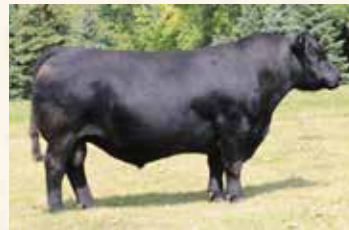
SIRE MC CUMBER TRIBUTE 702

A calving ease Tribute daughter that has been so much more than just a light birth weight female. 366 has been exceptional at every measure with a WWR of 107, YWR of 112, an IMF ratio of 107 and REA ratio of 109 as her dam's first calf. A pedigree loaded with a bunch of top cows that include the flush mates to Mc Cumber Tremendous 2008, Miss Wix 2003 of Mc Cumber and Miss Wix 2002 of Mc Cumber, which makes her triple bred to Miss Wix 2022 of Mc Cumber in 5 generations and combines the top Lassie cows 113 and 935. A lot of predictability is bred into this one.