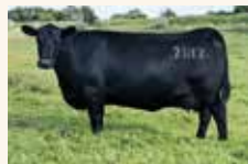
MATERNAL GRAND DAM MISS WIX 2012 OF MC CUMBER