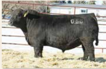
MATERNAL BROTHER MC CUMBER TRADEMARK 068