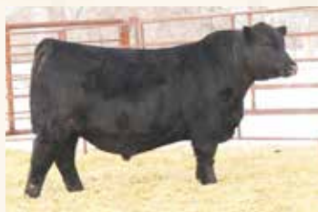
MATERNAL BROTHER MC CUMBER 9145 TITANIUM 283