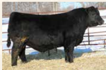
MATERNAL BROTHER TO DAM MC CUMBER STEADFAST 8175

Selling 2/3 interest and full possession - One of the widest based, naturally thick bulls in the entire sale. 328 has abundant center rib dimension and depth of body. He is square hipped, thick topped and puts a foot down out in the corners. He earned a WWR of 109 as his dam's first calf and has 1306 lb. 365-day weight for a ratio of 108. He combines this with one of the top IMF ratios of 143. His moderate, high volume, easy fleshing dam is an impressive you female with extra bone and excellent hoof shape. She is easy going and passed it on to her son. Her Pathfinder dam is going to have her 14th calf this spring here and has a WWR 13 @107 and never fails to get the job done. Predictably bred to sire no nonsense, adaptable progeny that can thrive in even the harshest environments.