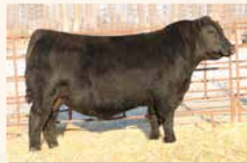
MATERNAL GRAND SIRE MC CUMBER ZODIAC 9119