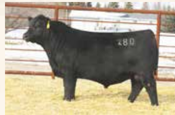
PRODUCED BY FLUSH SISTER TO DAM MC CUMBER LA JOYA 280

Selling 2/3 interest and full possession - A moderate, masculine, easy fleshing son of La Joya that just misses qualifying as a heifer bull, but if you keep an eye on your heifers he may be just fine. 3224 stacks a bunch of the best cows ever here at Mc Cumber and combines it with the dam of Zodiac OCC Dixie Erica 628W. His dam is a moderate, naturally thick, easy fleshing daughter of Mc Cumber Titanium 5005 and Miss Wix 2012 of Mc Cumber. Her flush sister Miss Wix 8008 of Mc Cumber is the dam of Mc Cumber La Joya 280 and Mc Cumber 073 Zodiac 3119 who sells in this sale. Built to thrive in the Grasslands of this country and bred to consistently sire forage efficient, easy fleshing progeny with muscle and capacity.