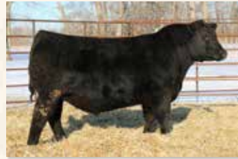
MATERNAL BROTHER TO DAM MC CUMBER TREMENDOUS 713

An absolute tank with a big, expressive rear quarter and the added rib dimension and depth of body to thrive in harsh environments. This masculine, wide based, wide tracking Edge of Glory son is produced from one of the top Mc Cumber Titanium 5005 daughters on the Ranch. She is a sound footed, deep ribbed, easy fleshing female with outstanding udder quality and the extra muscle and dimension needed to thrive on forage. She has a never missed to the AI service and is nursing another standout bull calf this year. 339 is designed to excel in any environment.