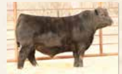
PRODUCED BY FULL SISTER MC CUMBER 4 REAL 325