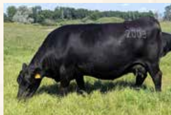
DAM MISS WIX 2003 OF MC CUMBER