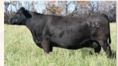
MATERNAL GRAND DAM BEMINDFUL MAID 965 MC CUMBER

Selling 2/3 interest and full possession - Recommended for use on heifers - 3218 has been a favorite of mine since last spring. He has an eye-catching, well-balanced sound structured look to him and is a favorite when evaluating the bulls. Following in the footsteps of his sire 3218 is a masculine, heavy muscled bull with muscle shape and expression to his top and rear quarter. He is wide based and tracks wide as he travels the pen. Not only is he impressive phenotypically but has data to match with above average performance and a top IMF ratio of 112. He is large scrotaled, easy going, bred to sire progeny that will fit the goals of many operations. His dam is a big, stout, OCC Big Time 746Z daughter with excellent udder structure, fleshing ease and disposition. She is a daughter of an all-time favorite 4X13 daughter whose influence spread throughout our program. I'm a big fan of this good bull.