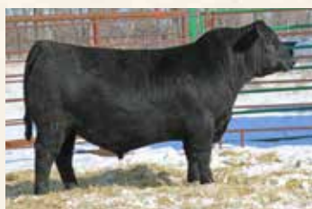
MATERNAL BROTHER MC CUMBER TRIBUTE 036

Selling 2/3 interest and full possession - A big bodied, deep ribbed, naturally thick son of Edge of Glory. Produced from a maternal sister to Mc Cumber Titanium 3127 and one of the top easy fleshing, big scrotaled, masculine sound structured sons of Edge of Glory. His dam is a high volume, good footed, easy-going daughter of Mc Cumber Fortunate 307 and maternal sister a past sale topping Mc Cumber Titanium 3127. Bred to build a cowherd from. Generations of top cows proven for consistent fertility and productivity.