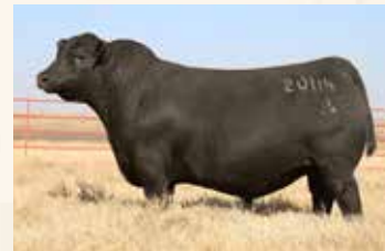
SIRE DUFF RED MEAT 20114