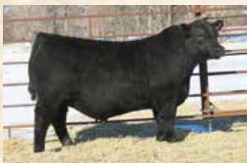
MATERNAL BROTHER MC CUMBER ARMOUR 014

disposition and large scrotal. His Pathfinder dam is a no miss female with abundant rib shape and capacity. She is stout built with extra width and dimension. She never fails to bring in a good one and has a top production record. Bred to add maternal quality to any herd and designed to sire easy fleshing, problem-free progeny.