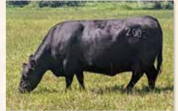
MATERNAL GRAND DAM MISS WIX 2002 OF MC CUMBER