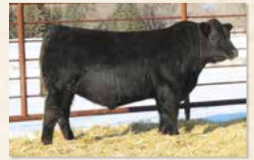
MATERNAL BROTHER MC CUMBER EDGE OF GLORY 2113