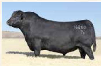
SIRE DUFF-JC 4 REAL 16250