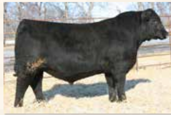
FULL BROTHER TO DAM MC CUMBER TITANIUM 5195

A rugged, stout built, masculine son of Mc Cumber Believe 1169. 3143 is a high capacity, naturally thick bull with base width and internal dimension. He has performed well with a WWR of 105, ADG of 3.72 lbs/day and a 365-day weight of 1334 lbs. for a ratio of 105. A bull that finds my eye often with his attractive front end and extra length. His dam is a powerful daughter of Mc Cumber Titanium 3127 with extra mass, thickness and stoutness. She has added width and dimension and maintains her condition with ease. She has a top record and always brings in a good one. Believe is a new sire group this year that is sure to impress.