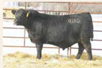
FULL BROTHER TO DAM MC CUMBER ARMOUR 0160

Recommended for use on heifers - A heavily muscled, masculine, wide based calving ease bull with abundant expression to his rear quarter. 3112 is built and designed to work in any environment. His dam is a feminine, deep ribbed, near perfect uddered daughter of OCC Bonus 802B. She is good-footed, easy going and has a perfect record for fertility. Take a bunch of these calving ease bulls home and sleep all night while calving heifers.