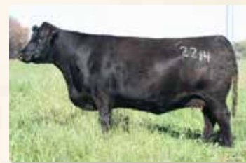
MATERNAL GRAND DAM ROSETTA 2214 OF MC CUMBER