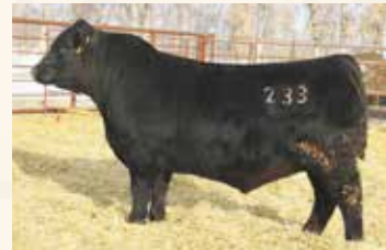
MATERNAL BROTHER TO DAM MC CUMBER EDGE OF GLORY 233