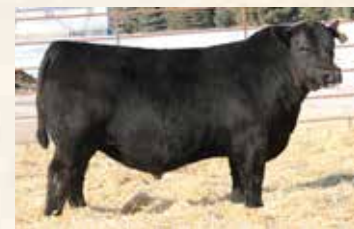
FLUSH BROTHER TO SIRE MC CUMBER ZODIAC 9116