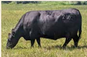
MATERNAL GRAND DAM MISS WIX 2002 OF MC CUMBER

Recommended for use on heifers - A sure-shot no doubt about it heifer bull with a pedigree loaded with the best we have to offer. 327 started with a BW of 60 lbs as his dam's first calf and has a CED of +16 and a BW EPD of -2.8. He combines some of the best and most influential cows in the history of our program. He traces to Miss Wix 2022 of Mc Cumber 3 times, who has not only been one of the great cows ever produced in our program but a son of hers is ranked the #3 bull in the breed for Functional Longevity, a new EPD recently released by the AAA.