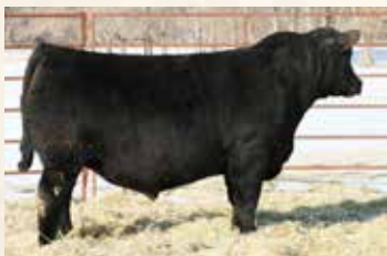
SIRE MC CUMBER ARMOUR 0191