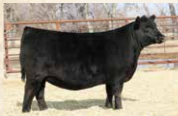
FULL SISTER TO DAM MISS WIX 09 OF MC CUMBER

Recommended for use on heifers - A smooth, long-bodied calving ease bull by Mc Cumber Armour 0191. 307 started with just a 68 lb BW for a ratio of 92 and earned double digit calving ease EPD and negative BW EPD. His dam is a fancy fronted, deep-ribbed, near perfect uddered daughter of Mc Cumber Tribute 702 and a full sister to the 2021 sale topping female Miss Wix 09 of Mc Cumber. Consistent calving ease bred-in on both sides of the pedigree.