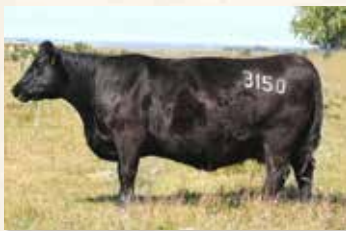
MATERNAL GRAND DAM B PRIDE 3150 OF MC CUMBER