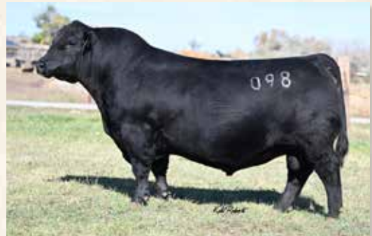
SIRE MC CUMBER LA JOYA 098