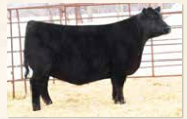
PATERNAL SISTER B PRIDE 184 OF MC CUMBER