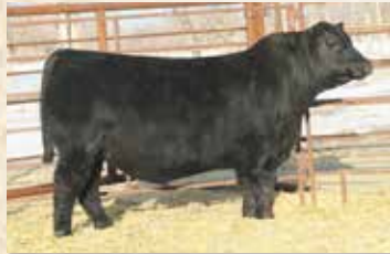
MATERNAL BROTHER MC CUMBER LA JOYA 294

Selling 2/3 interest and full possession - Recommended for use on heifers - The natural calf of Miss Wix 093 of Mc Cumber who is the Pathfinder donor dam of last year's second high selling bull Mc Cumber La Joya 294. Still in production at the age of 14 and an influential dam in our program from the top sons and daughters she has produced. 374 has come on strong this summer and is genetically designed to sire fertile, productive, problem-free progeny that are long-lasting. Don't overlook the potential of this calving ease prospect.