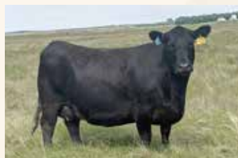
DAM MISS WIX 7233 OF MC CUMBER

Recommended for use on heifers - A well-bred, long bodied, heavy muscled calving ease bull that stacks all the best from the Miss Wix cow family. 3265 is free moving, wide tracking and displays added muscle shape and masculinity. His dam is a favorite with impeccable udder quality, excellent fleshing ability and the soundness and structure that leads to longevity. She is the front pasture kind with power and thickness to thrive in any environment. 3265 stacks some of the top maternal oriented cows in our program from the Miss Wix cow family and the outstanding dam of Zodiac, OCC Dixie Erica 628W.