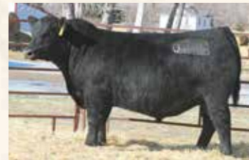
MATERNAL BROTHER MC CUMBER TRIBUTE 0145