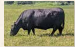
DAM MISS WIX 2002 OF MC CUMBER