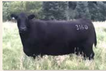
MATERNAL GRAND DAM B PRIDE 3160 OF MC CUMBER