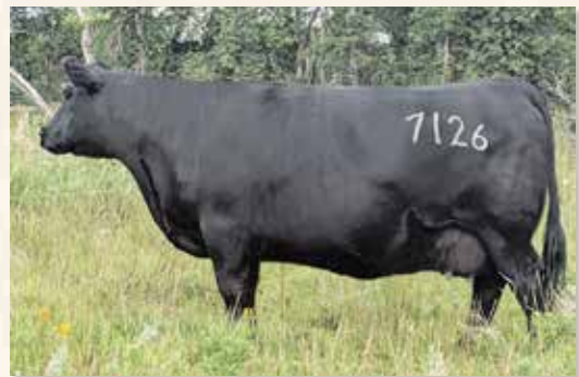
MATERNAL GREAT GRAND DAM MISS WIX 7126 OF MC CUMBER