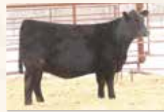
MATERNAL SISTER MISS WIX 2019 OF MC CUMBER

Selling 2/3 interest and full possession - Recommended for use on heifers - A thick, deep bodied, wide based calving ease, cow-maker right from the ET program. 3175 has all the best cows up front in his pedigree. He started at just 66 lbs. and has a CED of +14 and a BW EPD of -1.4. He is moderate framed, easy fleshing and combines this with above average carcass data. His dam is Miss Wix 2002 of Mc Cumber, who along with her flush sister Miss Wix 2003 of Mc Cumber and Miss Wix 2012 of Mc Cumber will go down as 3 of the most impactful females ever at Mc Cumber Angus. The fertility, productivity and longevity they possess and pass on will have a lasting impact on our program.