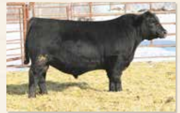
MC CUMBER TRIBUTE 276