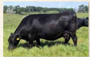
FLUSH SISTER TO MATERNAL GRAND DAM MISS WIX 2003 OF MC CUMBER