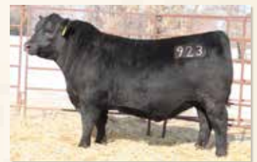
MATERNAL BROTHER MC CUMBER 5005 TITANIUM 923