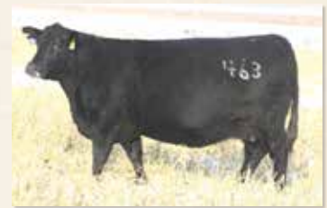
MATERNAL GRAND DAM B PRIDE 463 OF MC CUMBER