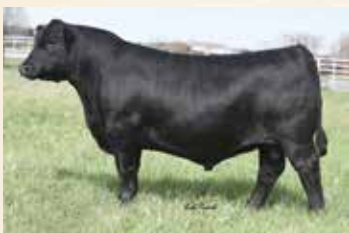
FULL BROTHER TO DAM MC CUMBER STEADFAST 635

Selling 2/3 interest and full possession - A big, stout, heavy muscled La Joya son from the full sister to Mc Cumber Steadfast 635. 3228 is an attractive, well-balanced herd sire prospect with added length and an abundant amount of muscle and stoutness. He has an expressive hip and rear quarter and stands wide and square. He is large scrotaled and easy going. He is one of the top bulls at weaning with a WWR of 110 and earned a 365-day weight of 1354 lbs. for a ratio of 107. In addition to this his muscle expression is confirmed by a REA of 14.6 sq. in. for a ratio of 116 and REA/CWT of 1.20. His dam is stout, good footed, high volume, thick made female with impeccable udder quality and excellent disposition. She is a daughter of the herd bull producer Miss Wix 2003 of Mc Cumber. 3228 combines the best of the Miss Wix and Lassie cow family bringing to the forefront the ability to predictably sire profit-oriented progeny.