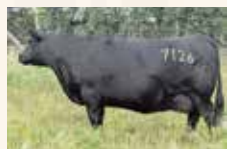
MATERNAL GRAND DAM MISS WIX 7126 OF MC CUMBER