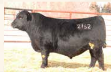
MATERNAL BROTHER TO DAM MC CUMBER 0145 TRIBUTE 2162

A thick, powerful April born bull with mass, muscle and masculinity. 3278 is a heavy muscled son of Mc Cumber Big Time 7188, who will serve as a natural service sire here at Mc Cumber again this year at the age of 7. 3278 earned a WWR of 101 and has performed well on test. His dam is a tank with massive volume and thickness. She has fault-free udder quality and is one of the easiest fleshing females on the Ranch. Her dam is a top producer with a WWR of 6@103 and YWR 6@106. She has produced sons that have successfully adapted and are working from New Mexico to North Dakota.