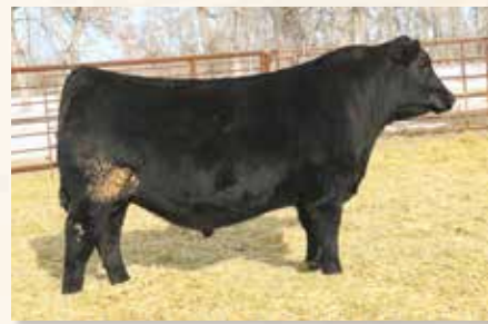
MATERNAL BROTHER MC CUMBER 0191 ARMOUR 2182