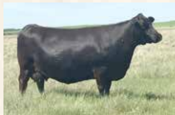
DAM SINCLAIR ENCHANTRESS 2F1