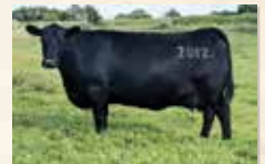
MATERNAL GRAND DAM MISS WIX 2012 OF MC CUMBER