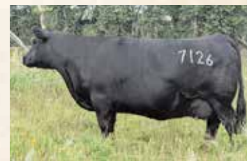
MATERNAL GRAND DAM MISS WIX 7126 OF MC CUMBER