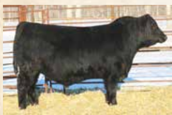
MATERNAL BROTHER MC CUMBER REMINGTON 2125

Selling 2/3 interest and full possession - Recommended for use on heifers - This masculine, muscular, herd bull prospect has been catching my eye all winter. He has the look we desire, with the mass, muscle and soundness we try to breed into every one of them. This big hipped, expressively muscled La Joya son not only has the build we strive to produce but has performed well across the board with WWR of 109, ADG of 3.68 lbs/day for a ratio of 103 and a 365-day weight of 1353 lbs. for a ratio of 106. In addition to his performance, he is one of the top bulls for carcass with a REA ratio of 106 and IMF ratio of 127. His 12-year-old dam is a moderate, sound, easy fleshing, neat uddered daughter of Sinclair Entrepreneur 8R101. She consistently gets her job done year in and year out. A La Joya son that shines no matter how you look at it. Calving ease, performance, carcass combined with outstanding phenotype for siring forage efficient progeny.