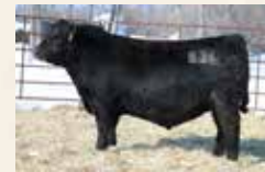
MATERNAL BROTHER MC CUMBER EMULATION XXP 836