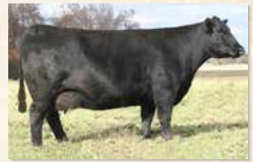
MATERNAL GRAND DAM LASSIE 935 OF MC CUMBER