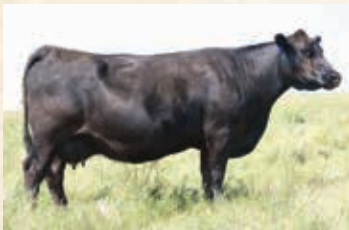
MATERNAL GREAT GRAND DAM B PRIDE 636 OF MC CUMBER

A moderate, deep ribbed, wide based La Joya daughter with a line of top cows behind her. 364 has added thickness and moves out wide and true as she travels. The first La Joya daughters have calved this year and are impressive young females. They get down and have their calf are up licking it off and are some of the most attentive young females we have worked with, not aggressive or mean, but know where their calf is and do a good job of keeping track of it. We can offer some of these good La Joya daughters because he stamps them so well it really doesn't matter if a good one leaves his ability to repeat it is uncanny.