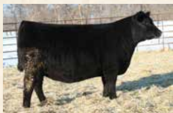
MATERNAL SISTER GALE 867 OF MC CUMBER