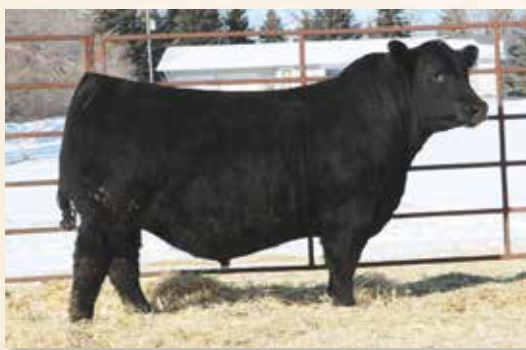
SIRE MC CUMBER NOBLE 1121

A moderate, heavy muscled, masculine son of OCC Edge of Glory 841E with the balance, soundness and pattern to get your attention. Built with style, capacity and extra dimension to sire females with the ability to convert forage efficiently and look good doing it. His dam is a beautiful, feminine Mc Cumber Titanium 5005 granddaughter with extra capacity, an excellent disposition and the soundness and structure we demand. He has the look and maternal strength to sire fertile, easy fleshing females with capacity and femininity, without sacrificing performance.