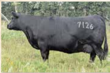
MATERNAL GRAND DAM MISS WIX 7126 OF MC CUMBER

Selling 2/3 interest and full possession - One of the top Edge of Glory sons in this sale. He won't be hard to find with his added length, size, stoutness and masculinity. 3124 has performed from the start with a WWR of 105, an ADG of 3.72 lbs/day and a YWR of 104. He can really get out and move with a long, fluid stride and a presence that will get your attention. His dam is a favorite of mine. She has impeccable udder quality, fleshing ease, and hoof quality. She is easy-going, long bodied and built the way you would draw one. She has an excellent production record and at the age of 10 looks like one that has many more years ahead of her. Top bull in the offering.