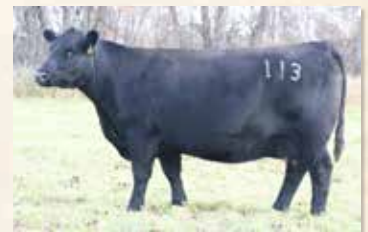
MATERNAL GRAND DAM LASSIE 113 OF MC CUMBER