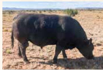
SIRE OCC EDGE OF GLORY 841E