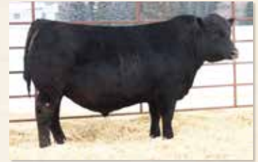
FULL BROTHER MC CUMBER EDGE OF GLORY 1112