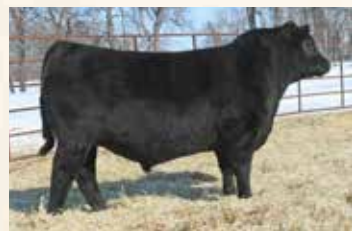
PRODUCED BY FULL SISTER MC CUMBER 5005 TITANIUM 1125