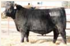
MATERNAL BROTHER MC CUMBER TRIBUTE 9180