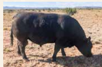
SIRE OCC EDGE OF GLORY 841E

An absolute tank with abundant rib dimension and shape, a big wide square hip and extra base width and it comes in a package that is designed to thrive in tough conditions. She has an extra fancy front end with extension and style. When on the move she really gets your attention with a long fluid stride that is wide and true. Her moderate, near perfect uddered dam is a high-volume, easy-going daughter of Mc Cumber Titanium 5005. She is produced from one of the most physically appealing cows on the Ranch and on the short list of future donors.