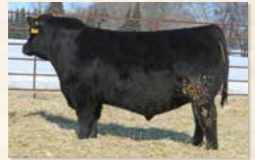
SIRE MC CUMBER COW POWER 118