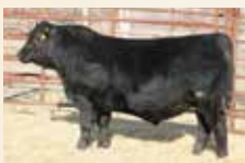
FLUSH BROTHER MC CUMBER CONVICTION 3202

Selling 2/3 interest and full possession - Recommended for use on heifers - A deep ribbed, naturally thick La Joya and an ET son of Miss Wix 8004 of Mc Cumber, the dam of Mc Cumber Tribute 0145 and Mc Cumber Conviction 3202. 3199 is wide based, free moving and masculine. He moves with ease as he travels the pen and has the maternal heritage to leave a lasting impact. In addition, he was a top performer post weaning with an ADG of 3.97 lbs/day and a 365-day weight of 1267 lbs. His donor dam is a herd favorite, with added rib dimension and capacity. She has near perfect udder structure and teat placement and is docile, easy fleshing and fertile. 3199 is bred to be a predictable source of calving ease, maternal strength, longevity and efficiency.