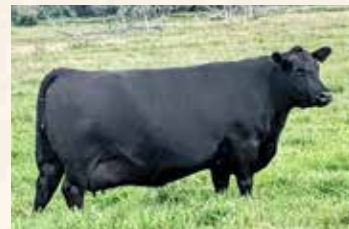
MATERNAL GRAND DAM HOLLY 411 OF MC CUMBER