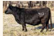
DAM BEMINDFUL MAID 413 MC CUMBER