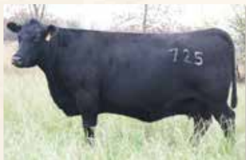
MATERNAL GREAT GRAND DAM LASSIE 725 OF MC CUMBER