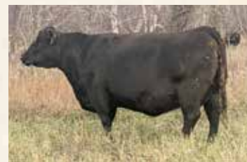
DAM MISS WIX 6297 OF MC CUMBER

A stout, powerful daughter of Mc Cumber Zodiac 9220 with abundant rib shape and natural thickness. She is wide based, big hipped and heavy muscled. In addition to this she has an IMF ratio of 156 with only a BF ratio of 96. Her dam is massive with powerful rib design, extra thickness, stoutness of bone. She is produced from a 3rd consecutive generation Pathfinder still in production at the age of 12. A well-bred heifer that is double bred to Miss Wix 2022 of Mc Cumber with a shot of OCC Dixie Erica 628W.