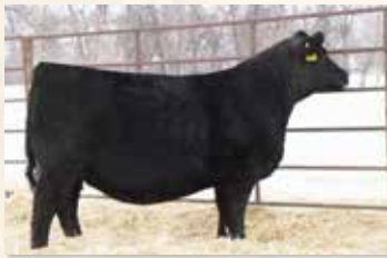
MATERNAL SISTER TO DAM B PRIDE 149 OF MC CUMBER