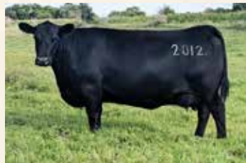
DAM MISS WIX 2012 OF MC CUMBER

O C C Tremendous 619T Miss Wix 2012 of Mc Cumber Miss Wix 2022 HC Mc Cumber