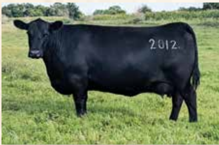
MATERNAL GRAND DAM MISS WIX 2012 OF MC CUMBER

Selling 1/2 interest and full possession - Recommended for use on heifers - A full brother in blood to the bulls 359 and 383. All 3 are Zodiac 073 sons produced by 3 full sisters by OCC Edge of Glory 841E and Miss Wix 2012 of Mc Cumber. The dams are full flush sisters to the $50,000 Miss Wix 1020 of Mc Cumber who sold in the 2022 production sale. 353 has been getting our attention from the start. He is an attractive, well-balanced, long bodied bull with top performance and plenty of muscle. He moves with ease and has a big, square hip and rear quarter. He is easy going, large scrotaled and good footed. He combines the best of the Miss Wix and Lassie cow families here at Mc Cumber and is produced from a big-bodied, feminine fronted, neat uddered daughter of Edge of Glory and Miss Wix 2012 of Mc Cumber. A breeding tool to not only inject the proven maternal quality of the cows from which he descends but also sire plenty of performance and carcass quality.