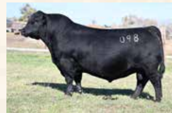
SIRE MC CUMBER LA JOYA 098