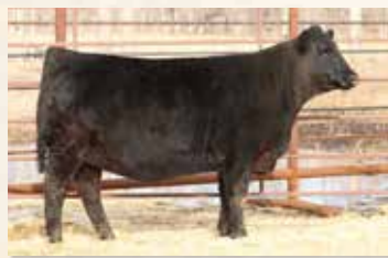
FLUSH SISTER TO DAM LASSIE 0024 OF MC CUMBER