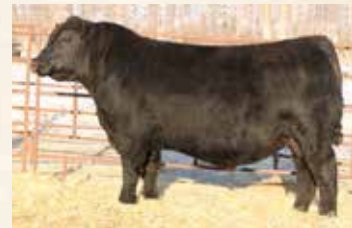
MATERNAL BROTHER MC CUMBER ZODIAC 9119