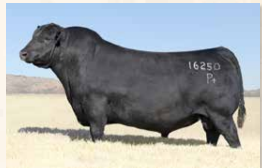
SIRE DUFF JC 4REAL 16250