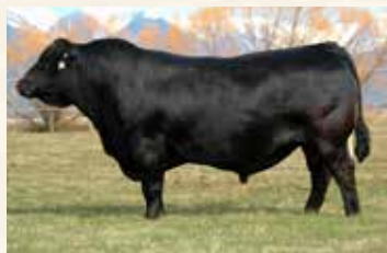
MATERNAL GRAND SIRE COLEMAN EMBLAZON 780

Recommended for use on heifers - Long, smooth extended fronted son of Remington with a large scrotal and easy-going disposition. 3004 is correct on his feet and legs and puts a foot down in all 4 corners. He has jumped through all the hoops performance wise with a WWR of 104, YWR of 104 and ADG of 3.77 lbs/day. His dam by Coleman Emblazon 780 is a moderate, deep ribbed, easy fleshing female with and a member of the Enchantress cow family.