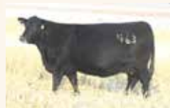
MATERNAL GRAND DAM B PRIDE 463 OF MC CUMBER