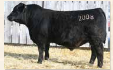
MATERNAL GRAND SIRE MC CUMBER TREMENDOUS 2008