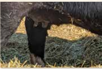
DAM MISS WIX 8008 OF MC CUMBER UDDER

Selling 2/3 interest and full possession - An absolute tank by 4 Real. If you have cattle lacking top then check this guy out. 3151 has a top that pops with muscle and he carries it out into a huge, expressive rear quarter. I've called him diesel since he was a baby calf because I think of a truck when I look at him. He is wide based, big-bodied, and good footed. He has performed well with a WWR of 106, YWR of 101. His visual muscle is confirmed with an actual REA of 15.0 sq. in. for a ratio of 118 and a REA/CWT of 1.30. His dam has brood cow written all over her. Miss Wix 0007 of Mc Cumber is a high volume, thick made female with added stoutness. She is big hipped, wide pinned and has near perfect udder quality. She has settled first service AI every time and is nursing a fancy heifer calf this year. She is a daughter of the Pathfinder donor dam Miss Wix 2012 of Mc Cumber whose influence and importance to our program has been well documented. Additionally, she is a flush sister to the dam of Mc Cumber Black Pearl 291, who topped last year's sale to JR Ranch and Juan Debernardi/Select Sires in Argentina. Built to thrive the toughest conditions and bred to sire forage efficient, adaptable, long-lasting progeny that will make a positive impact.