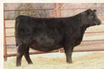
PATERNAL SISTER LASSIE 3171 OF MC CUMBER