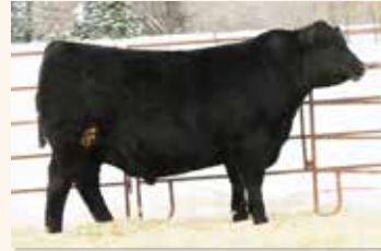
MATERNAL BROTHER TO DAM MC CUMBER STEADFAST 809