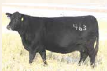
MATERNAL GRAND DAM B PRIDE 463 OF MC CUMBER