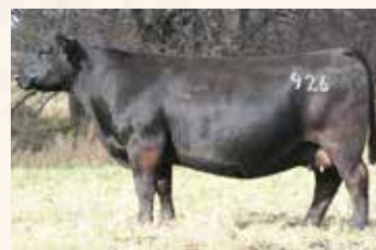
MATERNAL GRAND DAM MISS WIX 926 OF MC CUMBER