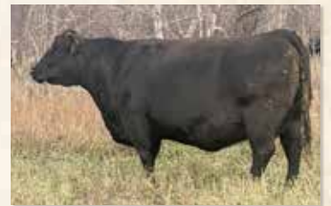
MATERNAL GRAND DAM MISS WIX 6297 OF MC CUMBER