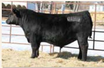
FULL BROTHER TO DAM MC CUMBER TRIBUTE 0149