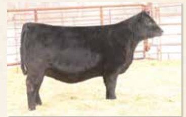
MATERNAL SISTER LASSIE 286 OF MC CUMBER