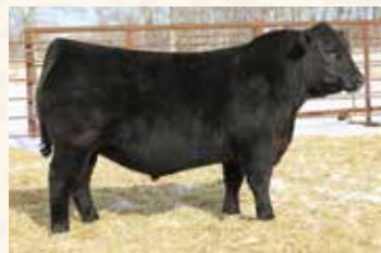
MATERNAL BROTHER TO THE DAM MC CUMBER ELECTRA 092