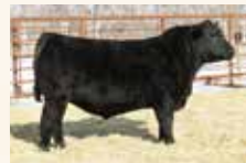
FLUSH BROTHER TO DAM MC CUMBER TRADEMARK 0012