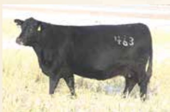
MATERNAL GRAND DAM B PRIDE 463 OF MC CUMBER

Selling 2/3 interest and full possession - Recommended for use on heifers - Won't be hard to spot this guy sale day. An extra-long, eye appealing son of La Joya from one of the top cows on the ranch. 329 has been excellent at all the measures. After starting at just 82 lbs. he went on to wean off his outstanding 12 year old dam with an actual weaning weight of 845 lbs. for a ratio of 109 and earned a 365-day weight of 1383 lbs. for a YWR of 109. He is a big-topped, sound structured bull with added length. His fertile, highly productive dam has consistently settled first service AI and is once again at the age of 12 nursing a top end bull calf. She excels for teat size, hoof shape and maternal instinct. The 4X13 daughters have been long-lived, fertile females that are productive and problem free and B Pride 2011 of Mc Cumber is one of the best. 329 is loaded with maternal superiority but also brings excellent performance and carcass to the table as well.