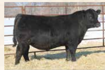
AND MC CUMBER EDGE OF GLORY 169