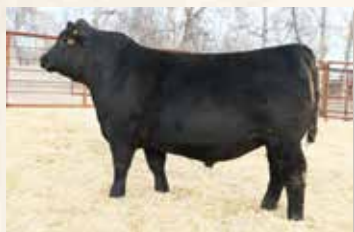
MATERNAL BROTHER TO DAM MC CUMBER EDGE OF GLORY 3124

A young bull with power, muscle, and performance. A son of the Memento bull we retained for in-herd use from the Pathfinder donor dam Miss Wix 2003 of Mc Cumber. 3275 will not quite be a year old by sale day and has performed right along his older contemporaries. His productive, neat uddered, easy-going dam is off to a great start with a WWR of 2@105 and her third calf at side already this year. 3275 was too young to get an adjusted yearling weight, but really excelled for REA with a REA of 14.1 sq. in. for a ratio of 112 and a REA/CWT of 1.25. Top bull that has not missed a beat.