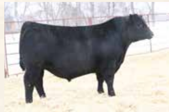
MATERNAL BROTHER MC CUMBER 5005 TITANIUM 1139

Selling 2/3 interest and full possession - Recommended for use on heifers - A complete, high volume, wide based, big scrotaled son of Mc Cumber Zodiac 073. 3196 is easy fleshing, masculine and wide tracking as he travels the pen. His highly productive, deep bodied, easy fleshing dam is a top producer tracing to one of the top OCC Tremendous 619T daughters from our program Lassie 0101 of Mc Cumber. He is bred to sire easy fleshing; forage efficient progeny and his genetic make-up should help with his ability to consistently do it.