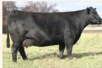
MATERNAL SISTER TO GRAND DAM LASSIE 935 OF MC CUMBER