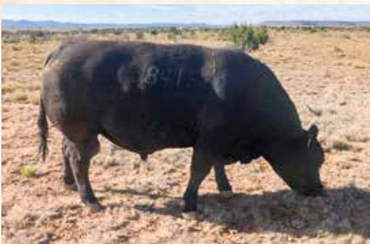
SIRE OCC EDGE OF GLORY 841E

Selling 2/3 interest and full possession - A top performer of the calf crop with the bred in ability to sire stout, heavy muscled, scale pounding progeny. 3115 is a masculine, long bodied stout bull that moves with ease and catches your eye when you enter the pen. He has weaning and yearling ratios of 111 and 114 respectively. In addition, he has an ADG of 4.19 lbs/day and combines this with a REA ratio of 106 and IMF ratio of 120. His quiet, easy going dam has massive body capacity. She is sound structured, easy fleshing, fertile and highly productive. She is a maternal sister to past sale feature Mc Cumber Remington 031, who has sons selling in this sale. This performance standout will not only sire market topping feeder cattle but leave a set of females that can convert forage efficiently.