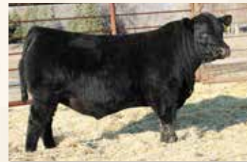
MC CUMBER 073 ZODIAC 3119