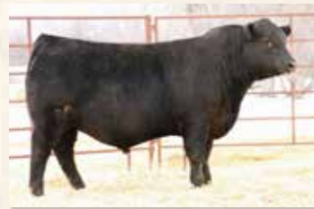
FULL BROTHER TO DAM MC CUMBER ELECTRA 1175

celebrating 60 years MC CUMBER ANGUS RANCH