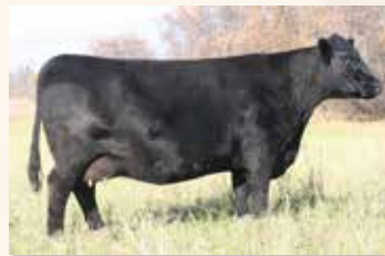
FULL SISTERS TO DAM MISS WIX 9122 OF MC CUMBER