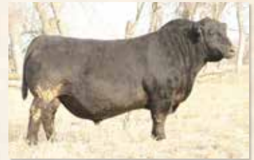
MC CUMBER ZODIAC 073