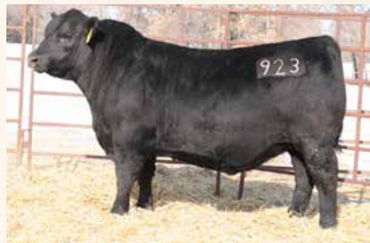
MATERNAL BROTHER TO DAM MC CUMBER 5005 TITANIUM 923