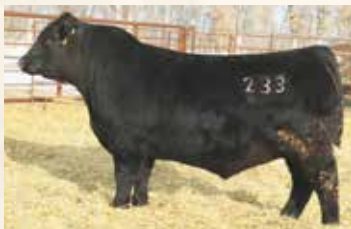
MATERNAL BROTHER MC CUMBER EDGE OF GLORY 233