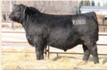
FULL BROTHER TO DAM MC CUMBER 5005 TITANIUM 9145

Recommended for use on heifers - 318 is the result of a favorite mating combination using Tribute 702 on 5005 daughters. 318 doesn't disappoint. He started with just 70 lb. BW and then went on to earn a WWR of 105 as his dam's first calf. He is a long, extended fronted bull with a foot out in the corners. His dam is a feminine, neat uddered daughter of 5005 who bred right back and calved first service AI already this year.