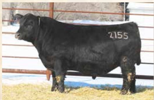
MATERNAL BROTHER MC CUMBER LA JOYA 2155

Selling 2/3 interest and full possession - A 4 Real son with impeccable structure, soundness, capacity and muscle. He moves out well with a long, smooth stride and tracks wide as he moves across the pen. He is loaded with muscle and carries it in a soft cow-maker package. He has a REA of 14.1 sq. in. for a ratio of 112 and a REA/CWT of 1.24. His dam is a top young Armour daughter on the rise in our herd. She is a favorite of mine and I would describe her as just the right size with abundant capacity, femininity, and udder quality. She is the kind you see and say, "who is that cow" when going through the cowherd. Her dam is still in production at age 12 and still has impeccable udder quality, hoof shape and fleshing ease. Based on the 4 Real daughters we have calved this year, I would predict the females 3235 will sire will be the kind to build a cowherd around.