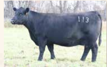
MATERNAL GRAND DAM LASSIE 113 OF MC CUMBER