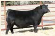
FULL BROTHER IN BLOOD MC CUMBER 073 ZODIAC 359

Selling 2/3 interest and full possession - Recommended for use on heifers - A complete, well-balanced, sound structured, heavy muscled calving ease herd bull prospect by La Joya 098. 3157 has the masculinity, base width, body capacity and length common among the sire group and combines this with performance and carcass traits. His dam is a new generation Sinclair Extra 4X13 daughter and full sister to Miss Wix 9122 of Mc Cumber, who calved again this year at the age of 15 and Miss Wix 175 of Mc Cumber who produced to the age of twelve. Her 4th consecutive generation Pathfinder dam Miss Wix 7126 of Mc Cumber was lost this past summer at the age of 16. When you combine it with the maternal side of La Joya's pedigree you include his Pathfinder dam Lassie 113 of Mc Cumber producing at the age of 13 and her Pathfinder dam Lassie 935 of Mc Cumber still in production at the age of 15. Time-tested, proven females that have excelled for fertility, productivity, longevity and functionality. I would guess not many bulls selling this year have that much proven longevity stacked into their pedigree.