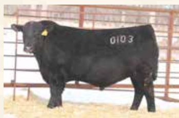
MATERNAL BROTHER MC CUMBER STEADFAST 0103