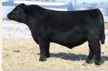
MATERNAL GRAND SIRE MC CUMBER FORTUNATE 213

Another good Remington 031 son with masculinity, muscle shape and rib shape and dimension. He has performed well and is a top gainer on test with an ADG of 3.95 lbs/day. His dam is a productive, fertile, easy fleshing daughter of Mc Cumber Fortunate 213. These moderate, easy fleshing, sound structured son's of Remington 031 are designed for forage efficiency and adaptability.