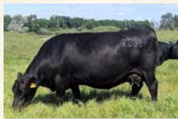
MATERNAL GRAND DAM MISS WIX 2003 OF MC CUMBER