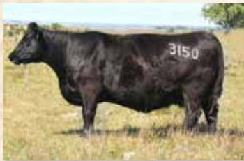
MATERNAL GRAND DAM B PRIDE 3150 OF MC CUMBER

Selling 2/3 interest and full possession - Recommended for use on heifers - This smooth, long fronted, sound structured well-balanced calving ease bull by Tribute doubles up both Lassie 113 of Mc Cumber and Lassie 935 of Mc Cumber and combines that with OCC Dixie Erica 628W and Miss Wix 2022 of Mc Cumber. A royal pedigree loaded with some of the best cows from our program. He has performed well earning a WWR of 102, YWR of 103, and REA ratio of 105. He is big-topped and wide based. His dam has impeccable udder and teat structure and bred right back to calve first service AI this year as a 3-year-old. 330 is a top calving ease bull with plenty more to offer.