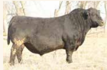
SIRE MC CUMBER ZODIAC 073