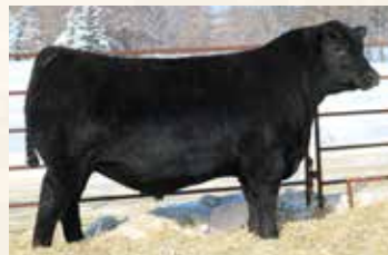
SIRE MC CUMBER 5005 TITANIUM 829