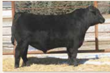
MATERNAL BROTHER TO DAM MC CUMBER 4 REAL 358

Manzano Electra 0214 Miss Wix 0133 of Mc Cumber Miss Wix 5261 of Mc Cumber