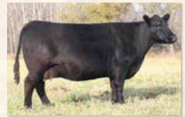
MISS WIX 175 OF MC CUMBER