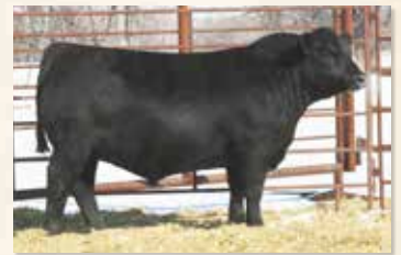
MATERNAL BROTHER MC CUMBER TRIBUTE 2150