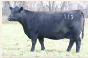
MATERNAL SISTER TO DAM LASSIE 113 OF MC CUMBER