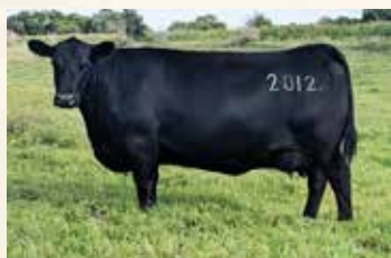
MATERNAL GRAND DAM MISS WIX 2012 OF MC CUMBER