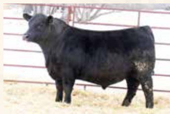
PRODUCED BY FULL SISTER TO DAM MC CUMBER BELIEVE 1169

Selling 2/3 interest and full possession - A massive, heavy muscled, beef bull that resembles his sire Duff Red Meat 20114 in many ways. 3212 is wide based, square hipped, masculine bull with extra power and dimension. He displays the added muscle shape and dimension that is confirmed by his large REA of 15.2 sq. in. for a ratio of 121, earning him a top 5 ranking in REA. His dam is a big-bodied, easy fleshing, neat uddered daughter of Mc Cumber Tremendous 2008 and the 4th consecutive generation Pathfinder dam Miss Wix 7126 of Mc Cumber. Her flush sister is the dam to a previous sale topper Mc Cumber Believe 1169 and Miss Wix 9015 of Mc Cumber is a well on her way to leaving a positive impact to our cowherd.