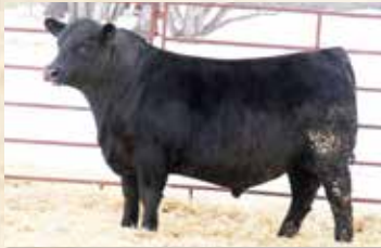
SIRE MC CUMBER BELIEVE 1169

A fancy, feminine, sound structured, well-bred heifer from the first calf crop by the 2022 sale topper Mc Cumber Believe 1169. In addition, she is strong topped, big hipped and free moving. She has been outstanding post-weaning with a YWR of 103 and an IMF ratio of 104. Her pedigree is loaded with top cows and double and triple bred to a couple. Not only is she triple bred to Miss Wix 2022 of Mc Cumber but is also double bred to Miss Wix 7126 of Mc Cumber and combines Lassie 113 of Mc Cumber as well. Her pedigree also includes a Pathfinder dam in every position in the 3rd generation making her a predictable source of fertility, productivity, and longevity.