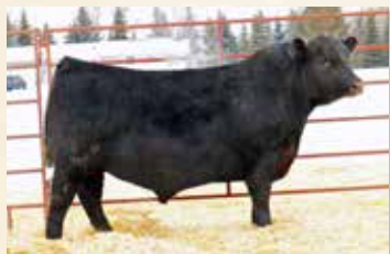
MATERNAL BROTHER MC CUMBER ELECTRA 1157

A stout constructed, big-bodied, thick-made daughter of Duff Red Meat 20114. She is not hard to find among a strong group of contemporaries with her added length, thickness, and body dimension. A performance standout that really turned it on post-weaning earning a YWR of 113 and a top REA of 10.6 sq. in. for a ratio of 109. Her dam is a feminine fronted, long necked, big-bodied daughter of Mc Cumber Tremendous 2008. She has impeccable udder structure and teat placement, along with fleshing ease, productivity, and structural soundness. A new pedigree on the paternal side with the proven predictability of the Miss Wix cow family.