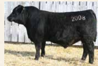
MATERNAL GRAND SIRE MC CUMBER TREMENDOUS 2008