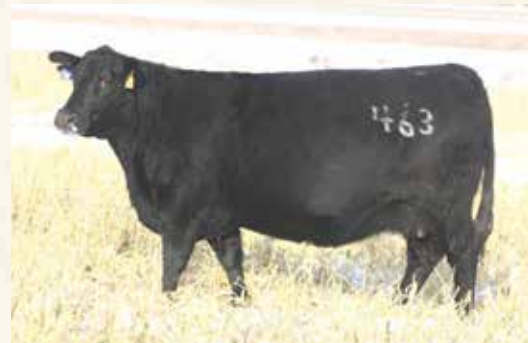
MATERNAL GRAND DAM B PRIDE 463 OF MC CUMBER

Recommended for use on heifers - A well-balanced, attractive, long bodied son of Mc Cumber Tribute 702. 3170 is large scrotaled, wide hipped and free moving. He really performed on test with an ADG of 3.97 lbs/day and earned a YWR of 101. His dam is a feminine, long, smooth, neat uddered daughter of Mc Cumber 307 Fortunate 5156. She has a top record for fertility and gets the job done on a consistent basis.