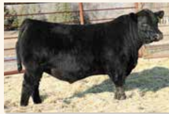
MC CUMBER 073 ZODIAC 3119