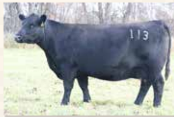
DAM LASSIE 113 OF MC CUMBER