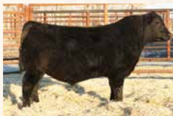
PATERNAL BROTHER MC CUMBER ARCHIVE 3187

When it comes to building the brood cow kind, OCC Edge of Glory 841E can sire them one after the other and 309 is no exception. I am a patient guy when it comes to breeding cattle, so we took our time making sure he was a fit, before really tying into Edge of Glory. He has exceeded our expectations, so we have really got on board and used him heavily within our program. As the daughters continue to calve, they confirm that it has been a good decision and because of the heavy use we are finally able to offer some more of these females in our production sale. 309 really sets the bar high for her combination of thickness, mass, structure and femininity. She has excelled at every measure and is one of the top heifers of the entire calf crop. Her dam is an impressive daughter of Mc Cumber Titanium 5005 with impeccable udder structure, hoof shape and fleshing ability. 309 is a neat combination of Miss Wix and Dixie Erica cow families.