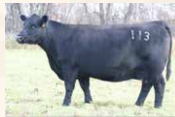
PATERNAL GRAND DAM LASSIE 113 OF MC CUMBER