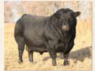
SIRE MC CUMBER BIG TIME 7188