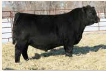
MATERNAL BROTHER MC CUMBER 829 TITANIUM 0289