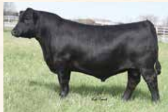
MATERNAL BROTHER MC CUMBER STEADFAST 635