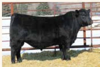
MATERNAL BROTHER MC CUMBER LA JOYA 2142

A 4 Real daughter that has excelled at every measure and combines it with power, mass and soundness to be the front pasture kind. An impressive female with abundant capacity, natural thickness, and the length and extension to get your attention. A standout since she was born 308 has never looked back earning a WWR of 107, YWR of 108, IMF ratio of 122 and REA ratio of 104. She is the kind that will excel in any situation and program be it a low-input operation or one that pushes the bar for maximum output she could fit either place. Her dam is a productive, neat uddered, fertile daughter of Mc Cumber 4X13 Extra 829 and at the age of 11 is nursing another standout La Joya son already this year. Offered strictly as a sale feature and one that could go on to do big things.