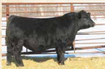
MATERNAL BROTHER MC CUMBER EDGE OF GLORY 2144

Selling 2/3 interest and full possession. - A thick, wide based, well-made son of Mc Cumber Zodiac 073 with maternal quality bred in for many generations. 346 has the balance, style and soundness to catch your eye when on the move and combines it with a big, expressive rear quarter and a masculine, extended front end. His productive dam is easy going, neat uddered and excellent on her feet and legs. Numbers would indicate that 346 could be used on heifers, but I would recommend him on the cows for the first year at least.