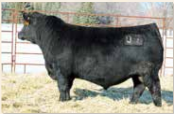
MATERNAL BROTHER MC CUMBER GLOBAL 07

Selling 2/3 interest and full possession - A herd bull prospect by the outside sire Duff JC 4 Real 16250 and produced from the predictable and consistently top producing B Pride 8122 of Mc Cumber. A Maternal Brother to the past sale feature and top-selling bull Mc Cumber Global 07. 311 is a stout, big-bodied, sound structured bull with masculinity and muscle. He has been a standout since birth and has never looked back. His dam is an easy fleshing, fertile, near perfect uddered daughter of Mc Cumber Steadfast 635. 8122 has never missed settling to the AI service and is consistent producer of pounds and performance. She is produced from 2 consecutive generations of Pathfinder donor dams and continues to build upon a tradition of top B Pride females.