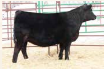
FLUSH SISTER TO DAM MISS WIX 1020 OF MC CUMBER