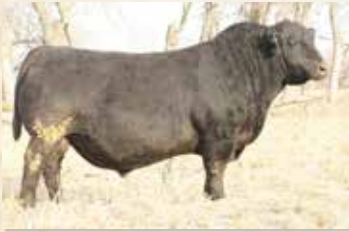
SIRE MC CUMBER ZODIAC 073

Recommended for use on heifers - A fancy, eye-catching calving ease son of Mc Cumber Zodiac 073. He has the extra style, soundness and structure to really get your attention. He combines this with a big, expressive top and rear quarter and has performed well from the start. He is packing a large REA with a ratio of 109 and a REA/CWT of 1.20. His dam is a neat uddered, easy going daughter of Mc Cumber Titanium 5005 with excellent hoof shape and heel depth. She is produced from a top daughter of Mc Cumber Tremendous 2008 and is already nursing a standout by Edge of Glory this year.