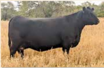
MATERNAL GRAND DAM B PRIDE 4137 OF MC CUMBER

An absolute powerhouse by Edge of Glory with as much mass and muscle as any bull in the offering. A top performer with weaning and yearling weight ratios of 107 and 110 respectively. He is one of the top gaining bulls on test with an ADG of 4.10 lbs/day. This wide tracking, big bodied bull has converted as well as any and is built like one that can thrive in the toughest conditions. His deep bodied, naturally thick dam is a maternal sister to the outstanding Edge of Glory heifer that was a feature of the 2022 sale and his grand dam is a top B Pride cow still in production at 10. Put him on the cows and benefit from the added performance and power he possesses.