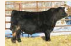
PRODUCED BY FLUSH SISTER MC CUMBER BLACK PEARL 291