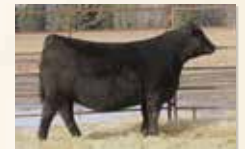
MATERNAL SISTER BEMINDFUL MAID 0138 MC CUMBER