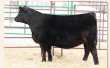
MATERNAL SISTER MISS WIX 1020 OF MC CUMBER