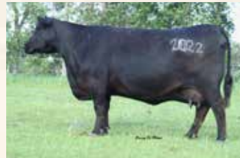
TRACES 3 TIMES TO MISS WIX 2022 OF MC CUMBER

Recommended for use on heifers - You could put a large group of these true, sleep-all-night calving ease bulls together to breed a large group of heifers. There are many half and 3/4 brothers by Tribute, La Joya and 073 that could be run together to create a uniform calf crop with top of the line maternal genetics bred into them. 367 fits this description. He is a sound structured, easy fleshing, well-balanced bull that traces 3 times to Miss Wix 2022 of Mc Cumber in 4 generations and combines this with Miss Wix 2002, Miss Wix 2003, Lassie 113 and Lassie 935. Can't go wrong maternally.