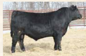
\frac{3}{4} BROTHER MC CUMBER EDGE OF GLORY 335