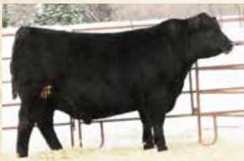
MATERNAL BROTHER TO DAM MC CUMBER STEADFAST 809

Recommended for use on heifers - A smooth, long bodied, free moving bull with calving ease credentials. 3276 is an April born bull with not only calving ease, but maternal strength bred in for generations. His 10-year-old dam is a sound structured, near perfect uddered daughter of Mc Cumber Rito Rolette 1108 and Lassie 706 of Mc Cumber who produced well into her teens. Maternal strength, calving ease, and forage efficiency combined.