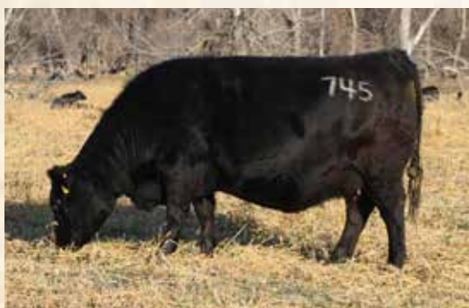
MATERNAL SISTER BLACKCAP 745 OF MC CUMBER

Selling 2/3 interest and full possession - A thick, heavy muscled Red Meat son with balance and eye appeal combined. A masculine, muscular bull with base width and natural thickness. 3110 is a heavy weaning bull that earned a WWR of 107. He is easy going, good footed and loaded with meat. The Red Meat sire group is consistently good footed, which is always a trait that needs attention. His dam is a top young cow in the program with an excellent production and fertility record to this point. She is a stout, big-bodied cow with thickness and fleshing ability. She displays outstanding udder quality with small, well-placed teats and proper attachment both fore and rear. If you utilize Facebook, she is the dam of the La Joya 2-year-old videoed in the pole barn when Santiago was here in February that we shared to the Mc Cumber page. A really good choice for those looking for a different bloodline in our program.