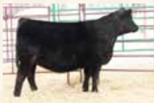
FLUSH SISTER TO DAM MISS WIX 1020 OF MC CUMBER