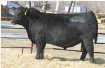
SIRE MC CUMBER TRIBUTE 0145

Recommended for use on heifers - 348 is a long, smooth fronted, masculine calving ease bull by a top Tribute son, Mc Cumber Tribute 0145. 348 got set back a bit this summer by foot rot which affected his weaning performance but has come on strong this winter. His dam is a moderate, easy fleshing, stout, wide hipped daughter of Duff JC 4 Real 16250. We purchased her as a feature of a past Power Plus production sale. She has never missed to the AI service and is nursing another calf this year.