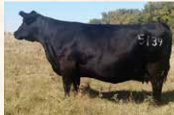
MATERNAL GRAND DAM MISS WIX 5139 OF MC CUMBER

Selling 2/3 interest and full possession - A long, masculine, deep ribbed son of Red Meat. He is high volume, wide based, free moving. He has performed well from the start and is backed by some of the best from the Miss Wix cow family. His dam is a favorite with abundant capacity, femininity and udder quality. She is easy fleshing, good footed and traces to Miss Wix 7111 of Mc Cumber. Her dam Miss Wix 5139 of Mc Cumber produced here well into her teens and was a consistent producer of fertile, easy fleshing, problem free females. 3106 represents a combination of muscle and mass from Red Meat and the fertility, femininity, productivity and longevity of the Miss Wix cow family.