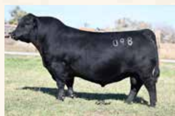
SIRE MC CUMBER LA JOYA 098