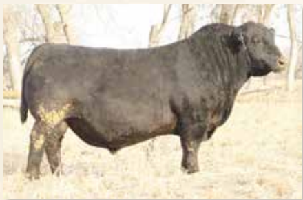
SIRE MC CUMBER ZODIAC 073

Selling 2/3 interest and full possession - Big, stout, masculine, Believe son with muscle mass, added length and performance. Use him on the cows benefit from his added performance, power and pounds. He has outstanding post-weaning performance with an ADG of 4.36 lbs/day for a gain ratio of 121 and a 365-day weight of 1403 lbs. for a YWR of 110. In addition, he has REA ratio of 108 and is easy to spot among his contemporaries. His dam is a powerful, stout, big-bodied daughter of OCC Unmistakable 946U with a top production record and the extra mass and muscle to work in any environment.