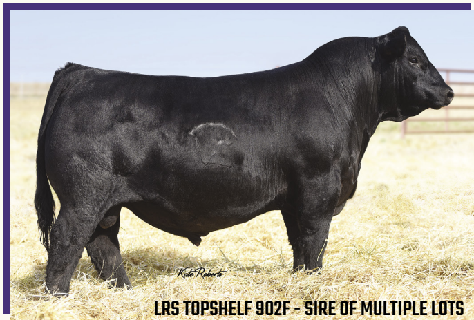
LRS TOPSHELF 902F - SIRE OF MULTIPLE LOTS

This is one that is hard to fault. So well made and just reeks with volume, fleshing ability, and balance. His cow family is the real deal, moderate in size, and productive, it comes naturally with Top Shelf, Data, and going back to Range Boss. He should be a true herd bull candidate that the top producers need to consider.