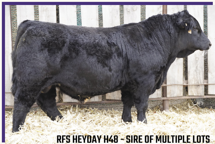
RFS HEYDAY H48 ~ SIRE OF MULTIPLE LOTS

Like all the Hey Deys, easy to appreciate and bred to perform. This guy has what it takes to sire sale toppers. His dam is a moderate cow with a very nice udder. He will work well on Angus and Baldy cows to enhance overall performance.