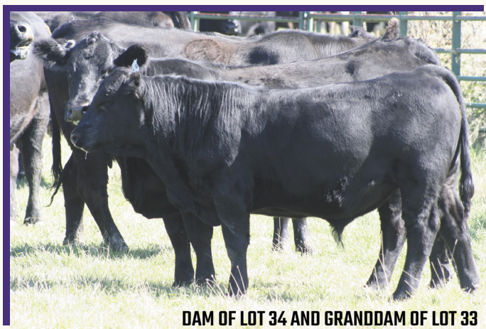
DAM OF LOT 34 AND GRANDDAM OF LOT 33

Looking for a fancy Baldy bull you will like this one, very clean made with a big top and wide rear end, he's a classy one. His sire is a full brother to the $70,000 Hot Shot bull that sold at Rydeens 2 years ago. His dam is a little bigger framed yet loaded with volume and eye appeal. You will love his length and admire his overall look, his daughters will be very nice.