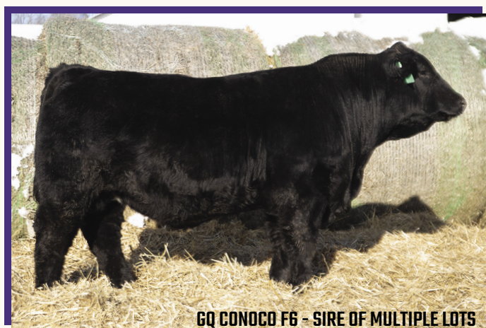
GQ CONOCO F6 - SIRE OF MULTIPLE LOTS

These Conocos are making excellent fleshing ease cattle. They are moderate in size and have a lot of capacity. We certainly believe he has a lot to offer. Take a look here, very long, deep and moderate, put him on a set of British bred cows and reap the rewards. Feeders and packers will love their efficiency, the daughters will be the keeping kind.