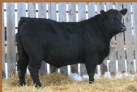
Best Resource 988 • Reg. #: 19636448

Annual Production Sale March 2, 2020 Watford City, ND