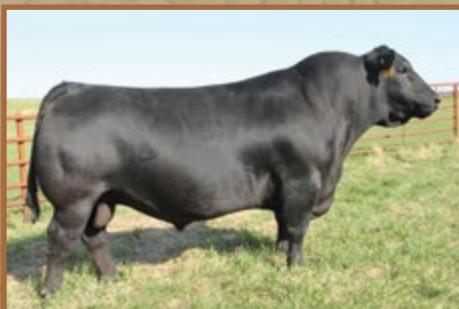
SAV Resource 1441 • Selling Sons & Daughters