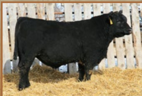
Best Resource 986 • Reg. #: 19636460