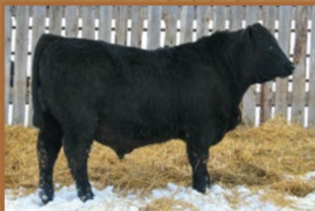
Best Resource 975 • Reg. #: 19636444