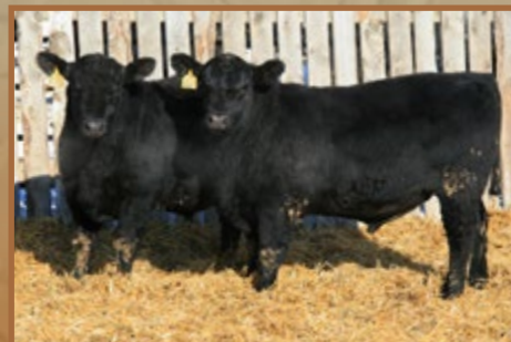
16 sons of McCumber Tribute 702 sell!