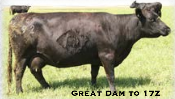
GREAT DAM TO 17Z