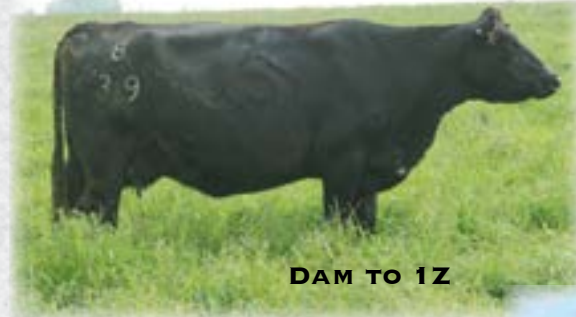
DAM TO 1Z