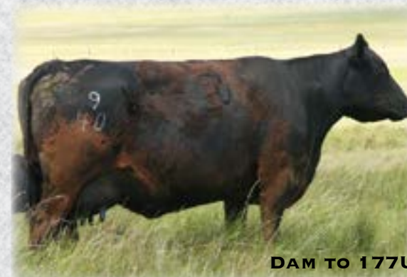
DAM TO 177U

LONGEVITY IN OUR HERD INDICATES MANY THINGS ABOUT AN ANIMAL. FIRST OF ALL ANY TIME AN ANIMAL GIVES PROBLEMS, SHE IS GONE. IF SHE LOSES A CALF SHE IS GONE. IF SHE HAS A RUNT CALF SHE IS GONE. IF SHE HAS FEET OR STRUCTURE PROBLEMS SHE IS GONE. IF SHE HAS UDDER OR TEMPERAMENT PROBLEMS, SHE IS GONE. IF SHE DOES NOT BREED BACK QUICKLY SHE IS GONE. SO WITH THAT SAID ANY TIME A COW IS OLD, AND STILL HERE, SHE HAS PASSED A RIGID TEST. WE HAVE IDENTIFIED THE MOTHER, THE GRAND MOTHER AND GREAT GRANDMOTHER AS A COW FAMILY THAT HAS PASSED THE RIGID TEST. WE SAVED SONS OF THE GREAT HANA 940, DDA BAR LAD 177U AND DDA ALLIANCE 142V. THE 177U WAS BORN WHEN THE 940 COW WAS 18 YEARS OLD AND THE 142V SHE WAS 19 YEARS OLD. CATTLE SELECTED FOR THE MOST IN ANYTHING TYPICALLY ARE THE MOST IN THAT TRAIT BECAUSE THEY WERE SELECTED FOR THE MOST. HOWEVER ANY TIME AN ANIMAL IS THE MOST IN ONE THING THEY HAVE LOST A VERY IMPORTANT TRAIT OR TRAITS IN ORDER TO BE THE MOST IN SOMETHING ELSE.