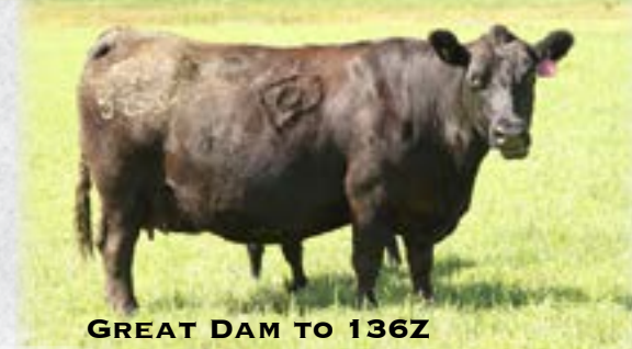
GREAT DAM TO 136Z DAM TO REFERENCE SIRE 45W