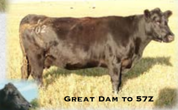
GREAT DAM TO 57Z