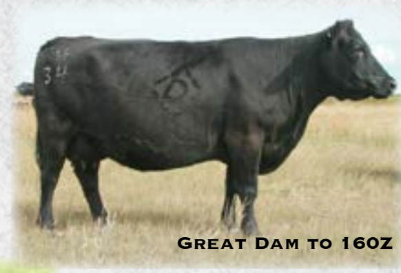
GREAT DAM TO 160Z