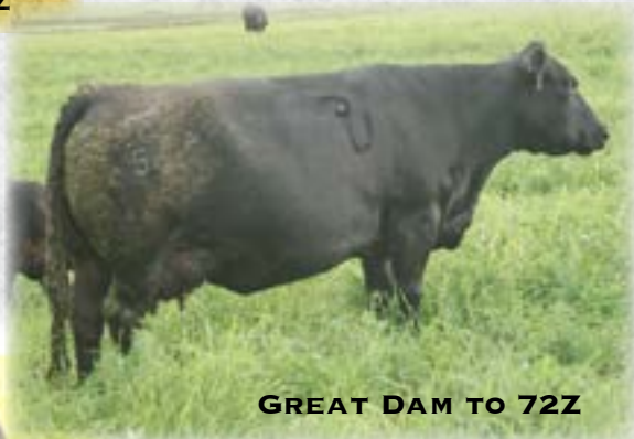
GREAT DAM TO 72Z