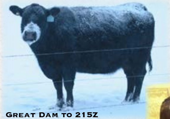
GREAT DAM TO 215Z