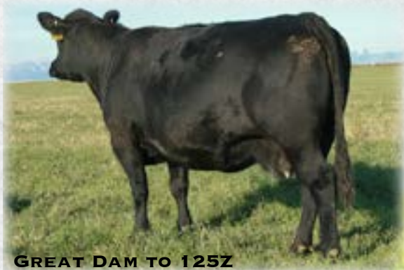
GREAT DAM TO 125Z