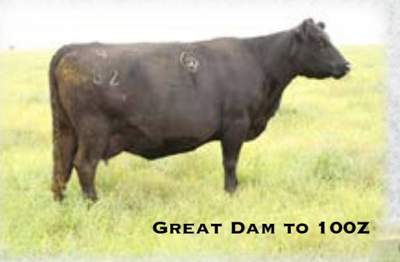
GREAT DAM TO 100Z