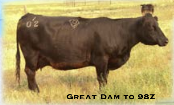
GREAT DAM TO 98Z