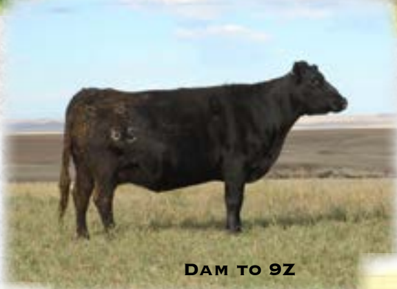
DAM TO 9Z