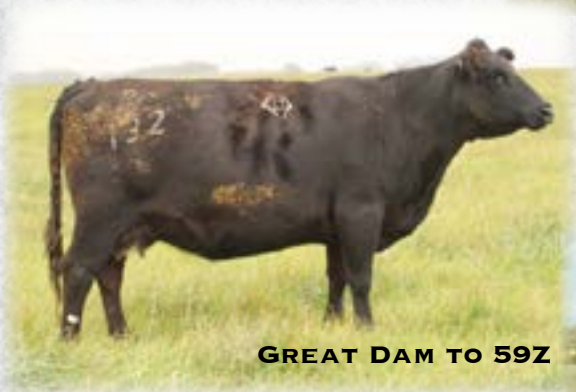
GREAT DAM TO 59Z