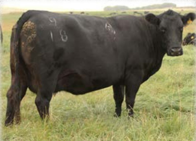
GREAT DAM TO 51Z DDA HOLLY 918