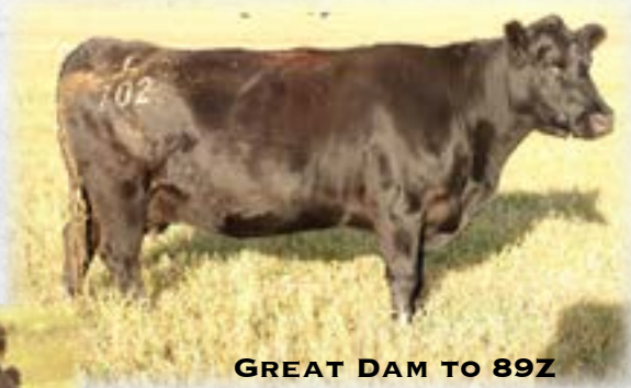
GREAT DAM TO 89Z