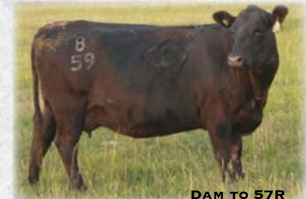
DAM TO 57R

EMULATION N BAR 5522 N BAR PRIMROSE 2424 PBC 707 1M F0203 DIXIE ERICA OF CH 615 O C C EMBLAZON 854E D D A MELISA 824 HIGH VALLEY 4C6 AMBUSH D D A GALATEA 423