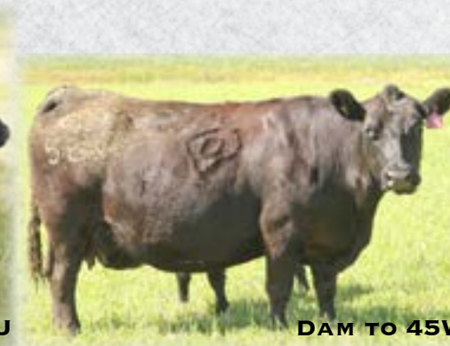
DAM TO 45W