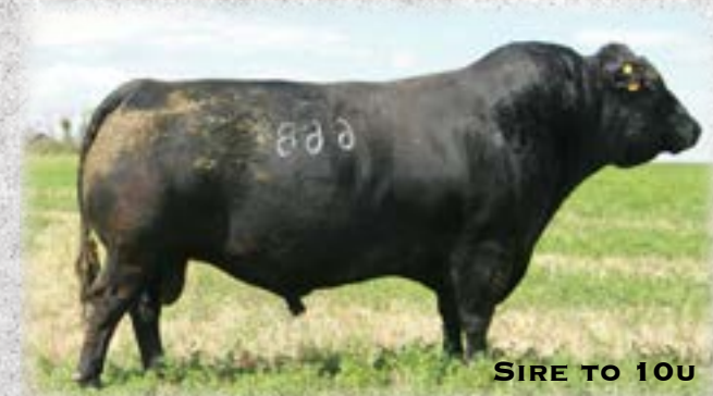
SIRE TO 10U

LODGE OF WYE HYLAND BC 0668 HYLAND BARBARA 0266