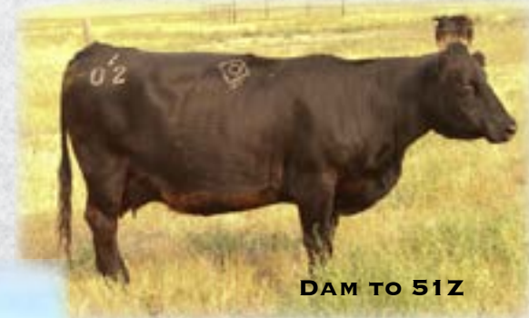
DAM TO 51Z