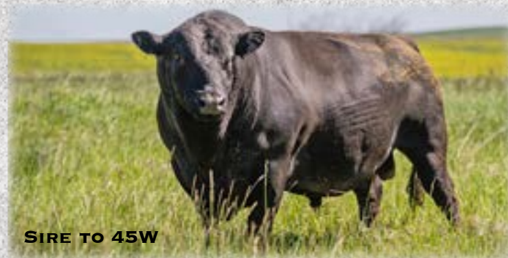
SIRE TO 45W

PINEBANK WAIGROUP 152/04 PINEBANK SE 10D PINEBANK WAIGROUP 92/99