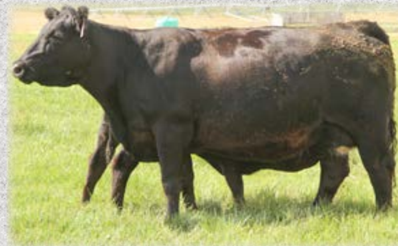
GREAT DAM TO 76Z DDA MELISA 174