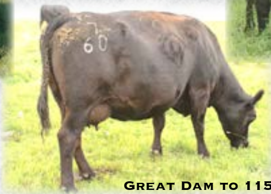
GREAT DAM TO 115Z