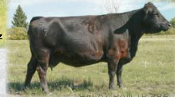
GREAT DAM TO 98Z