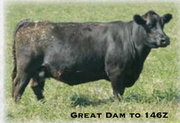
GREAT DAM TO 146Z