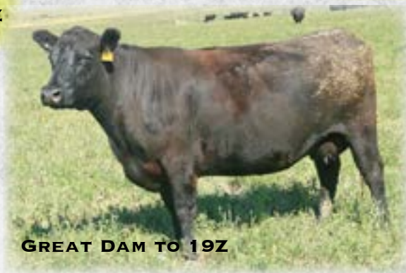
GREAT DAM TO 19Z