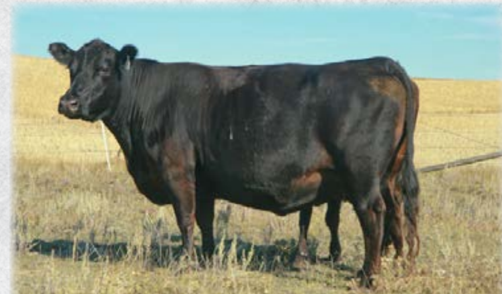
DDA MELISA 824 SHE IS ALSO IN ALMOST EVERY PEDIGREE SELLING.

ANGUS CATTLE USED TO BE NOTED FOR THEIR FNCTION, FERTILITY, AND LONGEVITY. AS A RESULT OF THE NUMBER CHASE GAME, MANY ANGUS CATTLE HAVE TOTALLY LOST THE CHARACTERISTICS THAT MADE THEM POPULAR IN THE FIRST PLACE. THEY ARE NOT BRED TO LAST. THIS IS OUR 824 COW. SHE LIVED TO BE 21 YEARS OLD. SHE IS IN ALMOST EVERY DIAMOND D ANGUS PEDIGREE, SOME MANY TIMES. IF YOU WOULD LIKE TO ADD SOME LONGEVITY AND FUNCTION BACK INTO YOUR HERD, PLEASE CONTACT US.