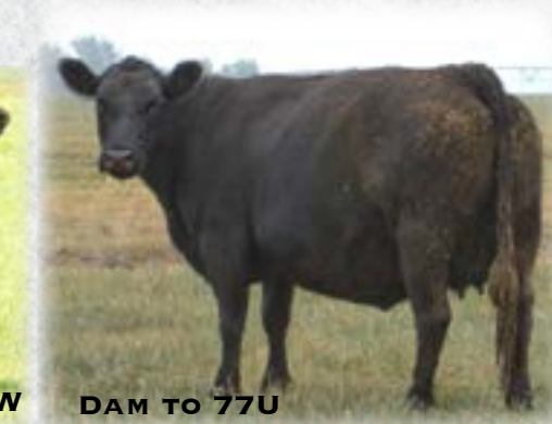
DAM TO 77U