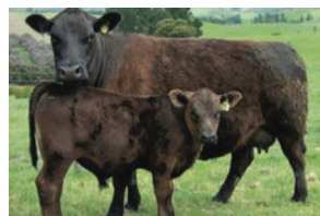
SE 9D Dam

Waitara Valley Tex Hingaia 910 Pinebank Waigroup 41/97 Pinebank Waigroup 64/97 Pinebank Waig 31/97 Pinebank Waig 30/93 Pinebank Waig 30/93 Pinebank Waig 65/93