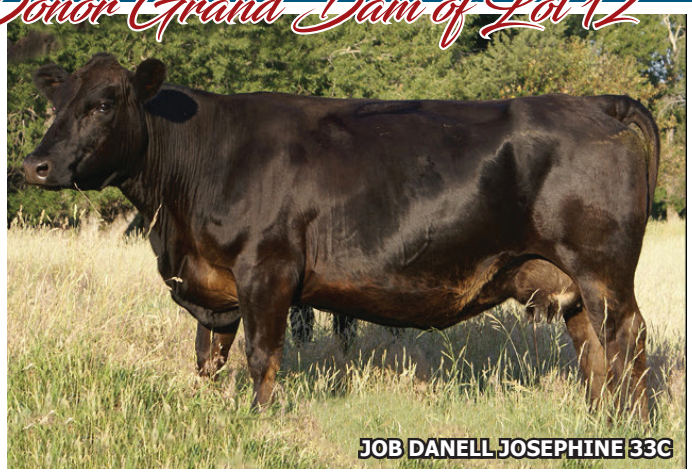
JOB DANELL JOSEPHINE 33C