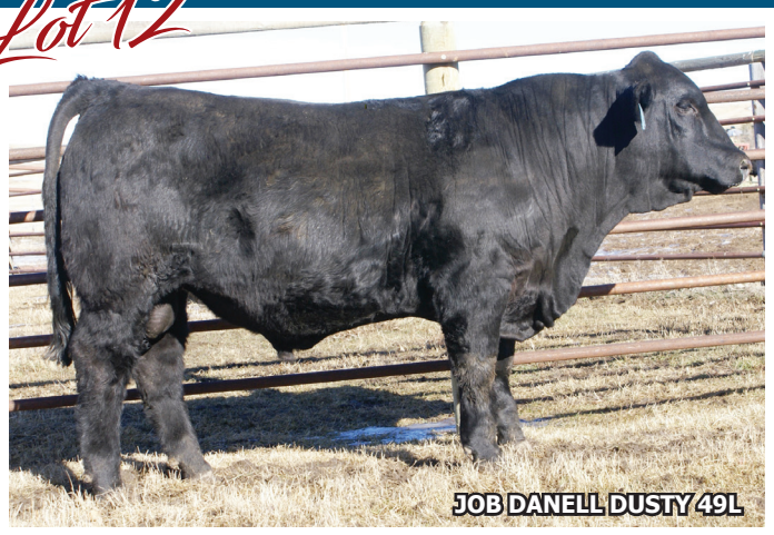
JOB DANELL DUSTY 49L