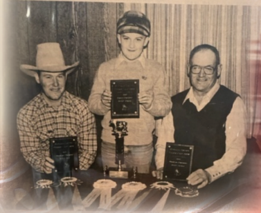
Feiring Angus Ranch Receives Awards at Calf Shows

40 - YEARLING BULLS 2 - TWO-YEAR-OLD BULLS 120 - HEIFERS