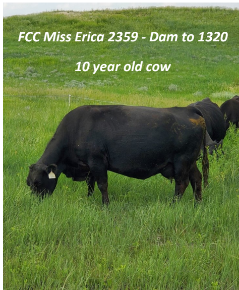
FCC Miss Erica 2359 - Dam to 1320