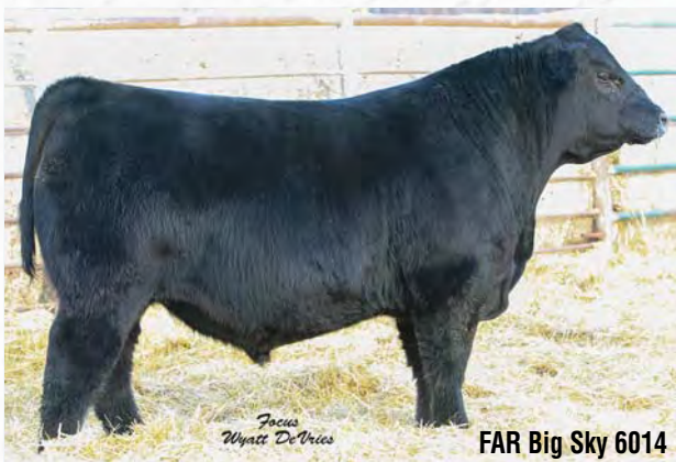
FAR Big Sky 6014