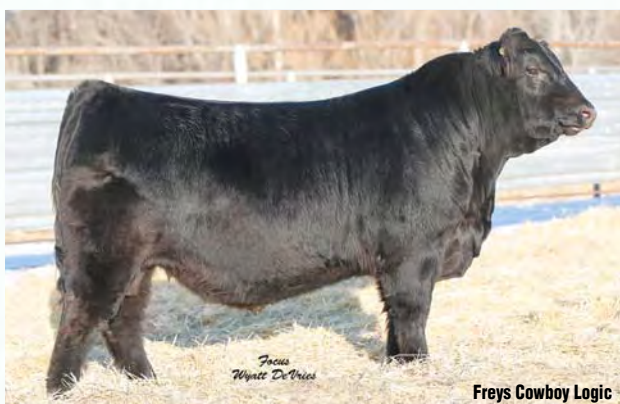
Freys Cowboy Logic