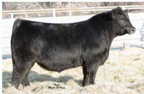
2020 Lot 3