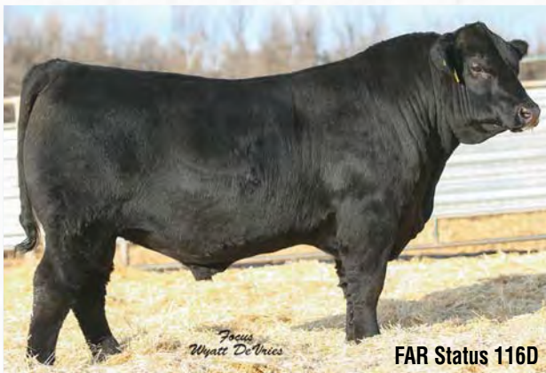
FAR Status 116D