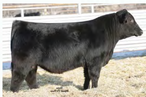
2020 Lot 6