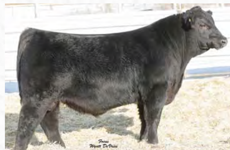
2020 Lot 4