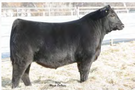
2020 Lot 5