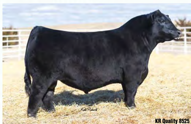
KR Quality 8525