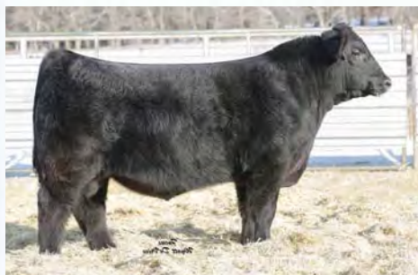
2020 Lot 2