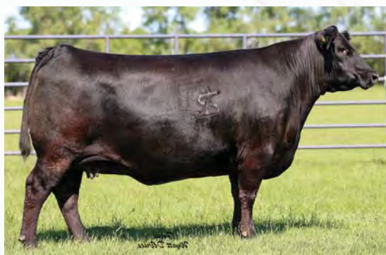
FAR PRINCESS 250A