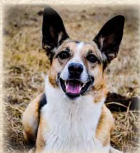
Daisy Head of cattle movement and corral boss