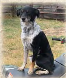
Doc Best 4-wheeler companion ever