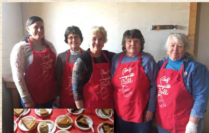
Gallatin Cattle Women

This Declaration x Profitbuilder combo lends to extra length and good capacity.