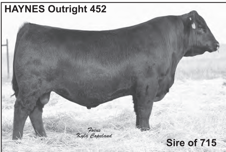
HAYNES Outright 452 Sire of 715 Reg: AAA 19004314 Birth Date: 03/08/17

HAYNES Outright 452 K C F Bennett Absolute # HAYNES ND 454 Miss 179 Springvale Duchess 302 SydGen Aim 0001 Springvale Duchess914 S A V Final Answer 0035 # Thomas Miss Lucy 5152 B/R New Day 454 # HAYNES Miss Infocus 984 SydGen 928 Destination 5420 # SydGen Blackbird Lady 1059 S S Objective T510 0T26 # Springvale Duchess 946