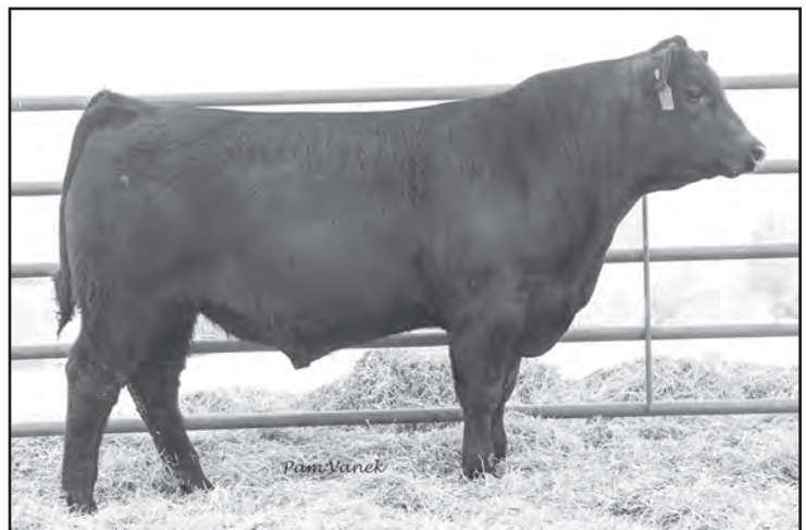
M A R Fortitude 512 Reg: AAA 18312476 Birth Date: 01/19/15

PA Fortitude 2500 GAR-EGL Protege # G G Clara 0171 M A R Lucy 1352 EXAR Upshot 0562B # S J H Lucy 9682 Rito 112 of 2536 Rito 616 # L B 6807 Isabel 339 SydGen C C & 7 # G G Clara 7192 Sitz Upward 307R # EXAR Barbara T020 # G A R Predestined # Basin Lucy 3859