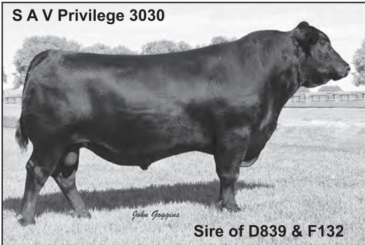
S A V Privilege 3030