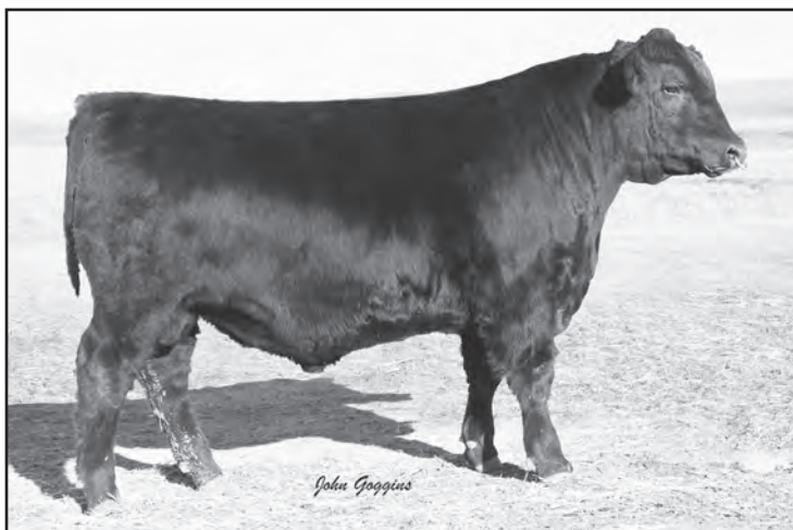
Reference Sire Stevenson All in 50654 Reg: AAA 18141704 Birth Date: 02/12/15

Deer Valley All In Diamond Primrose Lady Y776 A A R Ten X 7008 S A # Deer Valley Rita 0274 Hoover Dam # Diamond Primrose Lady 144T Mytty In Focus # A A R Lady Kelton 5551 # Sitz Upward 307R # G A R Objective 2345 SydGen C C & 7 # Erica of Ellston C124 # Diamond Dateline 5072 Diamond Primrose Lady 901L