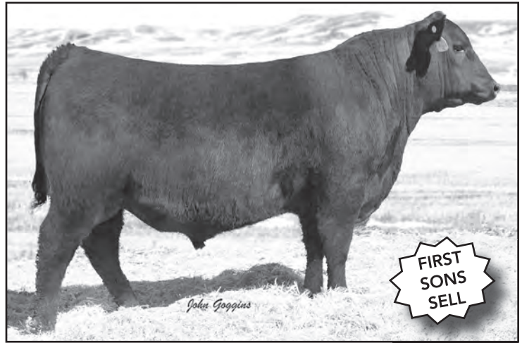
Springvale Cool 803 Reg: AAA 19285765 Birth Date: 03/03/18

Connealy Cool 39L Connealy Heat 0243 # JMc Jeena Allie 8345 5399 # Springvale Bonny 507 Connealy All Around # Springvale Bonny 377 Bunty Lanna of Conanga 556 H A Power Alliance 1025 # Jeena of Conanga 357 SydGen 928 Destination 5420 # SydGen Blackbird Lady 1059 SydGen Googol Springvale Bonny 439