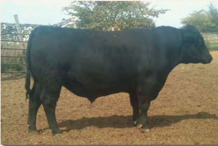
O C C X-TRA EASY 708X