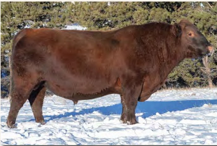
RIDGE TRAVELER 5412