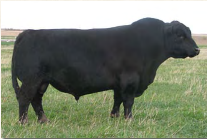
O C C REAR END 751R