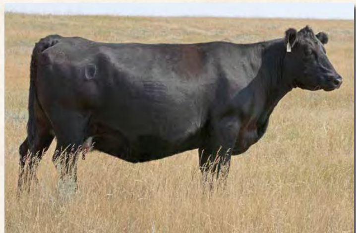
HRR PAULA 062, DAM OF LOT 17