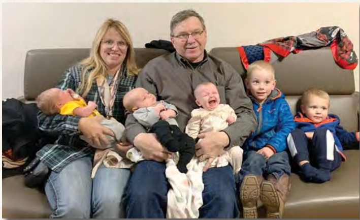
Grandchildren (L to R):