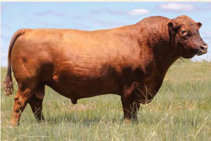
5L TOPGUN 560-65B

their way to becoming moderate framed attractive, deep ribbed daughters. Max is in the top 11% for HB, top 14% or better for efficiency traits like DMI, ME, and STAY even at 9 years of age, Max is moving his EPDS in these areas positively.