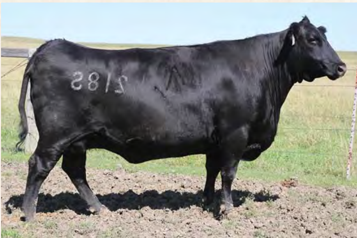
OPEN A 8180 218S, MATERNAL GRANDDAM

Open A 265X Thumper G986 is out of Open A 854E Pride Ruby 265X, who is part of the Pride Ruby cow family which is a foundation cow family in the Open A herd. The dam to this bull is outstanding and was a donor dam for Open A and has produced many good females that are still retained in the Open A herd. This cow bull posted an impressive weaning weight with aa WR of 105 and a respectable yearling weight.