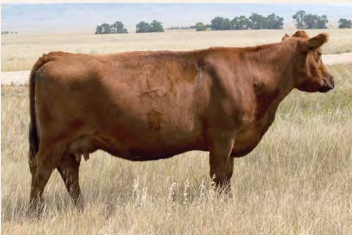
HRR COLLEEN 2146, MATERNAL DAM OF LOT 16

Another really long, balanced, performance and carcass son of Ridge Pragmatic 6098 and out of a first-calf heifer, HRR Sheba 790. A dark red bull with a good disposition and strong EPDs for growth and retail traits.