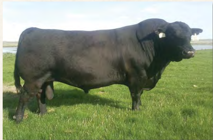
OPEN A 8180 179T