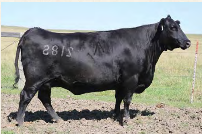
OPEN A 8180 218S, DAM OF LOT 69, 70 AND 74

Open A B6 Xtra Easy G9177 is a long-spined, straight-topped calving-ease bull. Top 10% CED and 3% $EN.