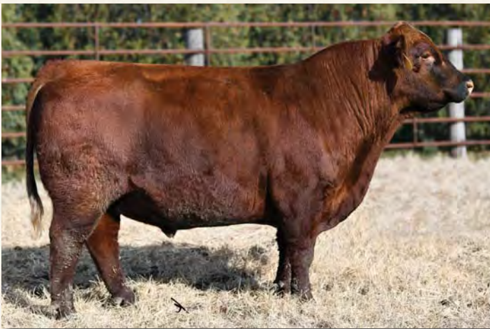
RIDGE PRAGMATIC 6098