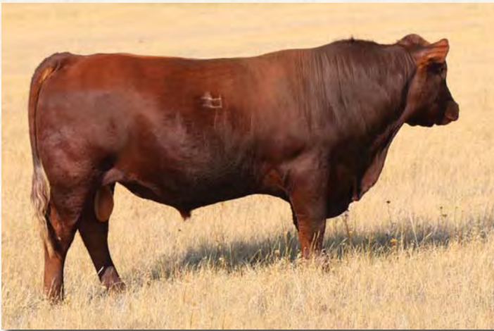
RIDGE PROVISION 6013

Ridge Pragmatic 6098 is a dark red performance sire out of 5L Top Gun. We used Ridge Pragmatic 6098 AI to capture the maternal strength of his young dam and grand dam and to put his good growth and carcass genetics to work. His first daughter's will calve in 2020 and reports are good to date.