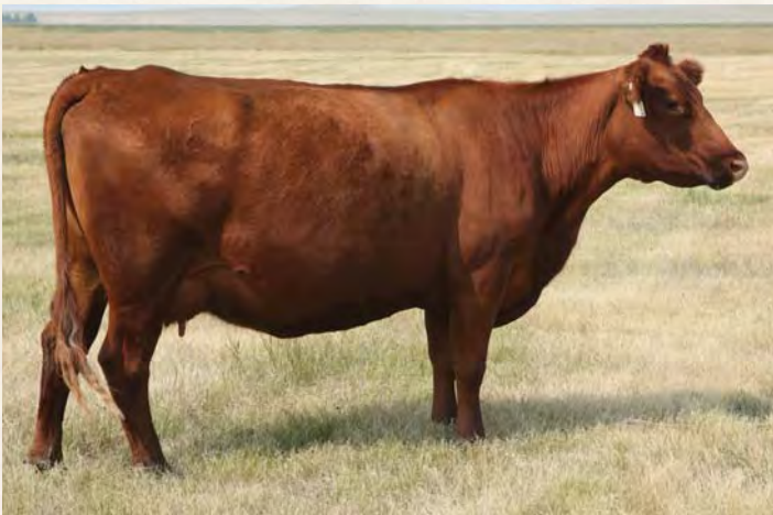
HRR STARLIGHT 312, DAM

HRR Gunsmoke 9309 is a solid working-class performance bull that made his mark with consistently being above average at the scale. He is out of Milk Creek Grass Roots 7208, who brings a little different pedigree on the sire side. The gold standard is set on the dam, HRR Starlight 312. Going back four generations, the dams hit 100 or better MPPAs. His performance EPDs and ratios will be among the top in this sale.