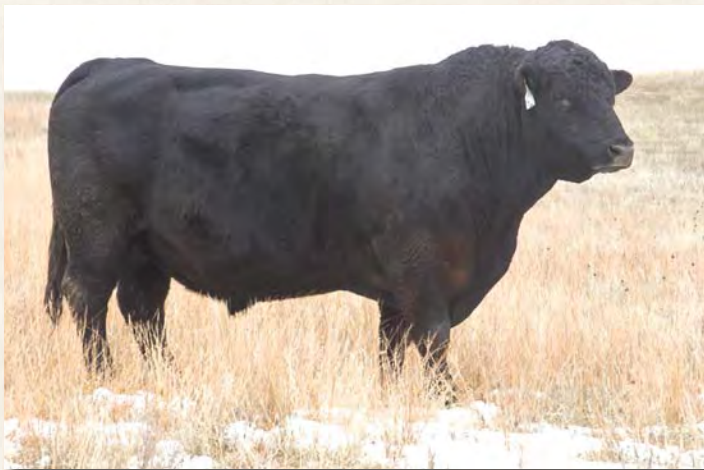
O C C CHAMP 777C

Here is a son out of the cleanup sire OCC Champ 777C who is doing a really good job. Open A Z2187 Champ G9061 is a cow bull that had a 116 WW ratio.