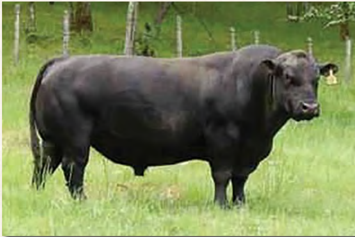
O C C THUMPER 819T

OCC Rear End 751R is a massive easy fleshing son of OCC Homer 650H. His EPDs and phenotype are similar to OCC Legend. The progeny of OCC Rear End 751R have strong wide top lines with heavy hindquarters. Daughters will stay fat easily and have beautiful udders. Used extensively in the AI program.