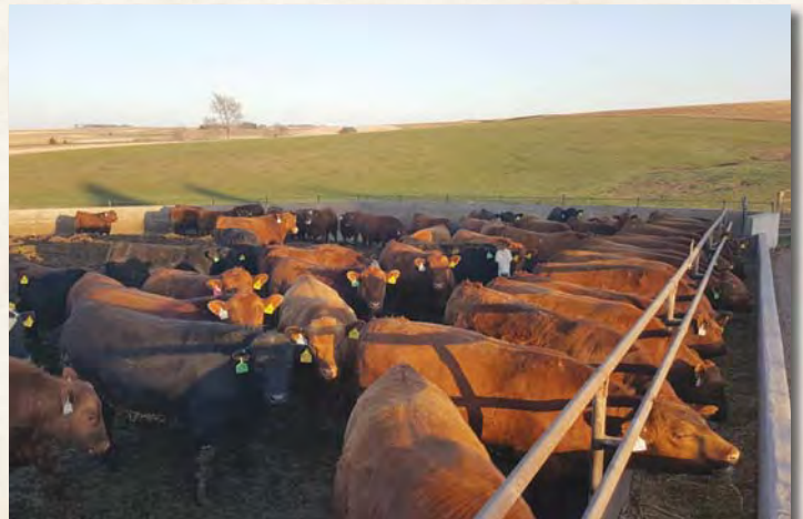
Heart River Ranch steers being finished at a feedlot in northwest Iowa. These cattle were harvested in May of 2019.