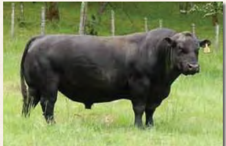
OCC THUMPER 819T