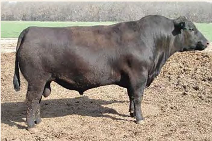
O C C JET STREAM 825J