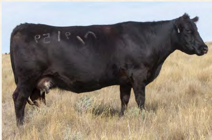
HRR EILEEN 9159, DAM OF LOT 9

HRR Pro 9251 is smooth-made bull with a top weaning weight, 113 WWR and good yearling performance to sire heavy calves. Dam's MPPA 102. These calves did it without creep in big country where it is a long walk to water.