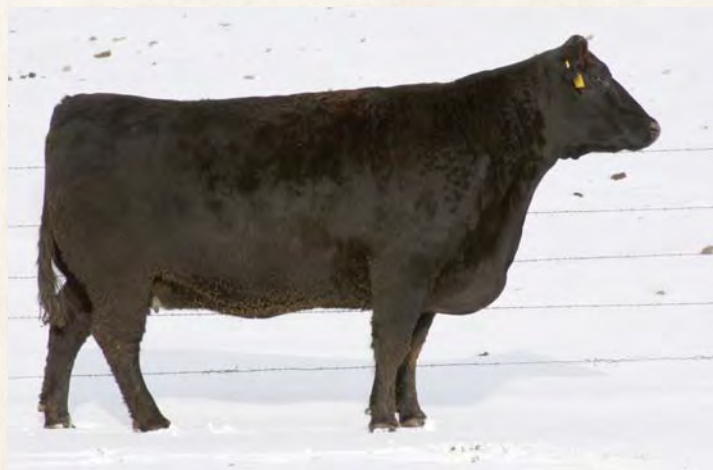
SAV CHERYL 208, MATERNAL GRANDDAM OF LOT 71