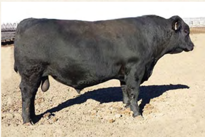
O C C BIG TIME 746Z

OCC Thumper 819T is a heavy muscled easy fleshing bull. His daughters have great udders and are easy fleshing. Used in AI program.