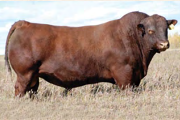
RED FLYING K MAX 159Y

Ridge Traveler 5412 is a breeding bull that moves out with determination and athletic ability. His greatest assets are his feet and legs and depth of rib. His daughters mature into cows with rib and capacity and have balanced udders.