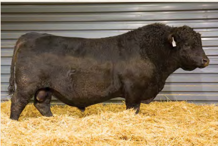
O C C DEADLINE 775D

The OCC Jet Stream 825J daughters are very good, with unbelievable under quality. His dam is a beautiful Eureka daughter that stems from the OCC Juanada 709V (Anchor's dam) cow family.