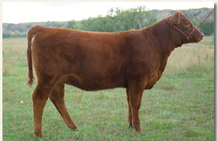
HIGH-SELLING OPEN FEMALE, 2019 NILE RED ANGUS SALE HRR BLOCKANA 966