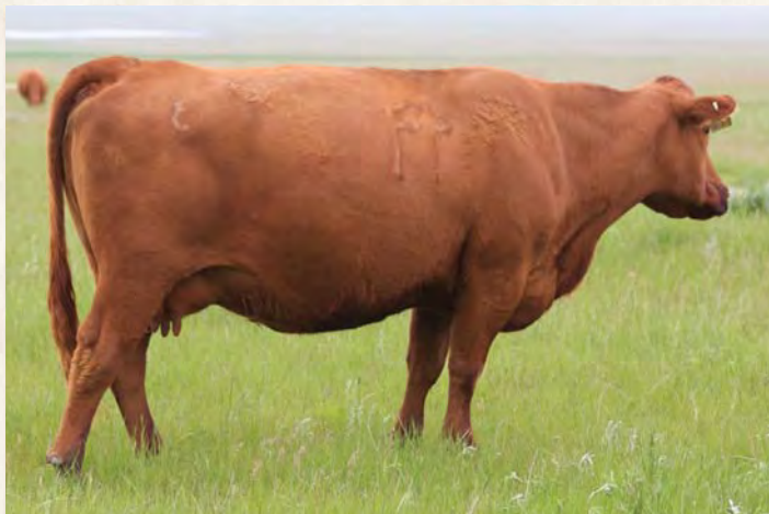
HRR FREYJA 308, MATERNAL GRANDDAM OF LOT 11