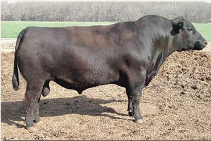
O C C JET STREAM 825J

OCC X-tra Easy 708X is a long, thick, smooth-made bull bred several generations for low birth and great efficiency. He has extra scrotal and exceptional fleshing ability.