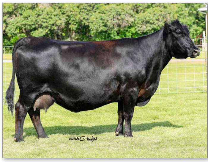
DAM OF LOT 2