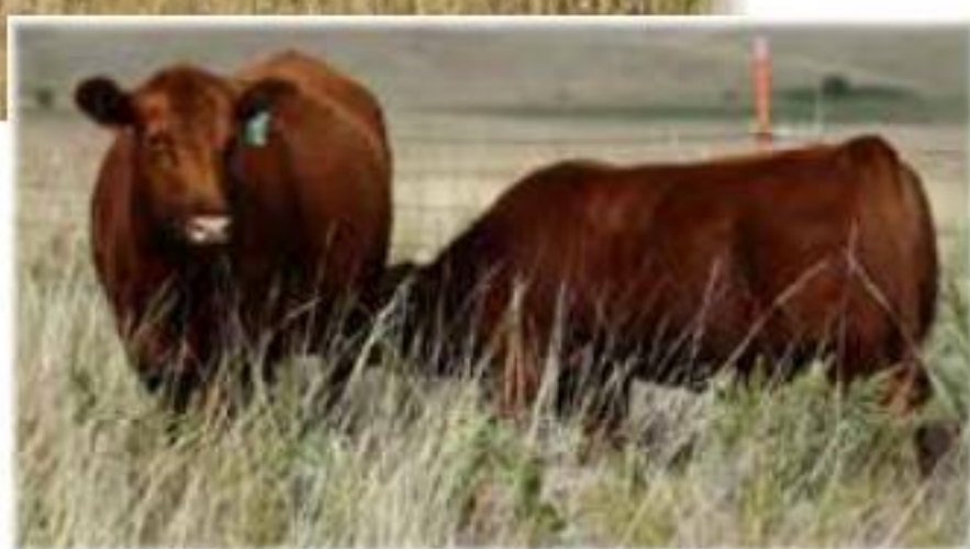
K2 Sheridan 714