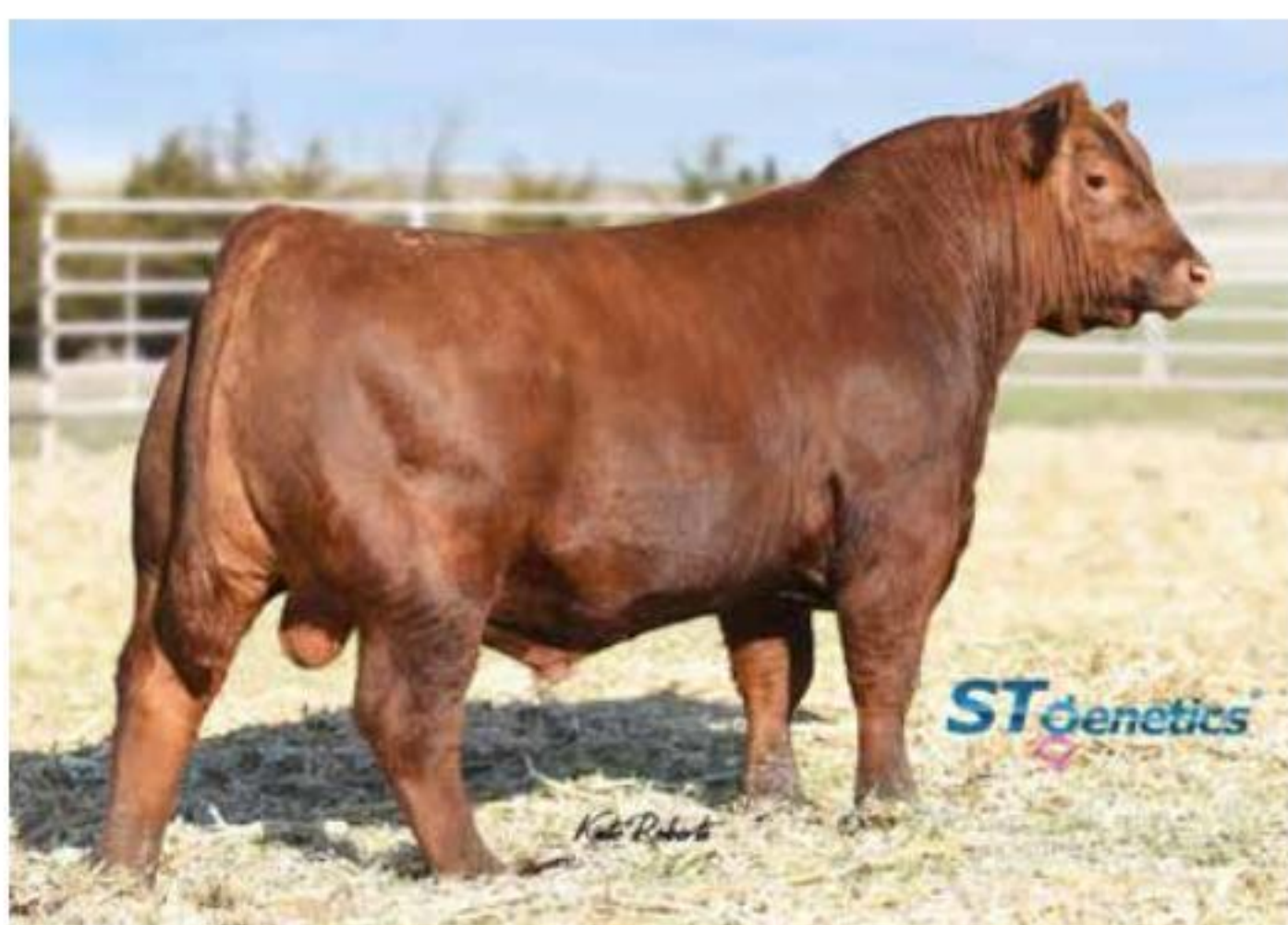
Red U2 Dominion