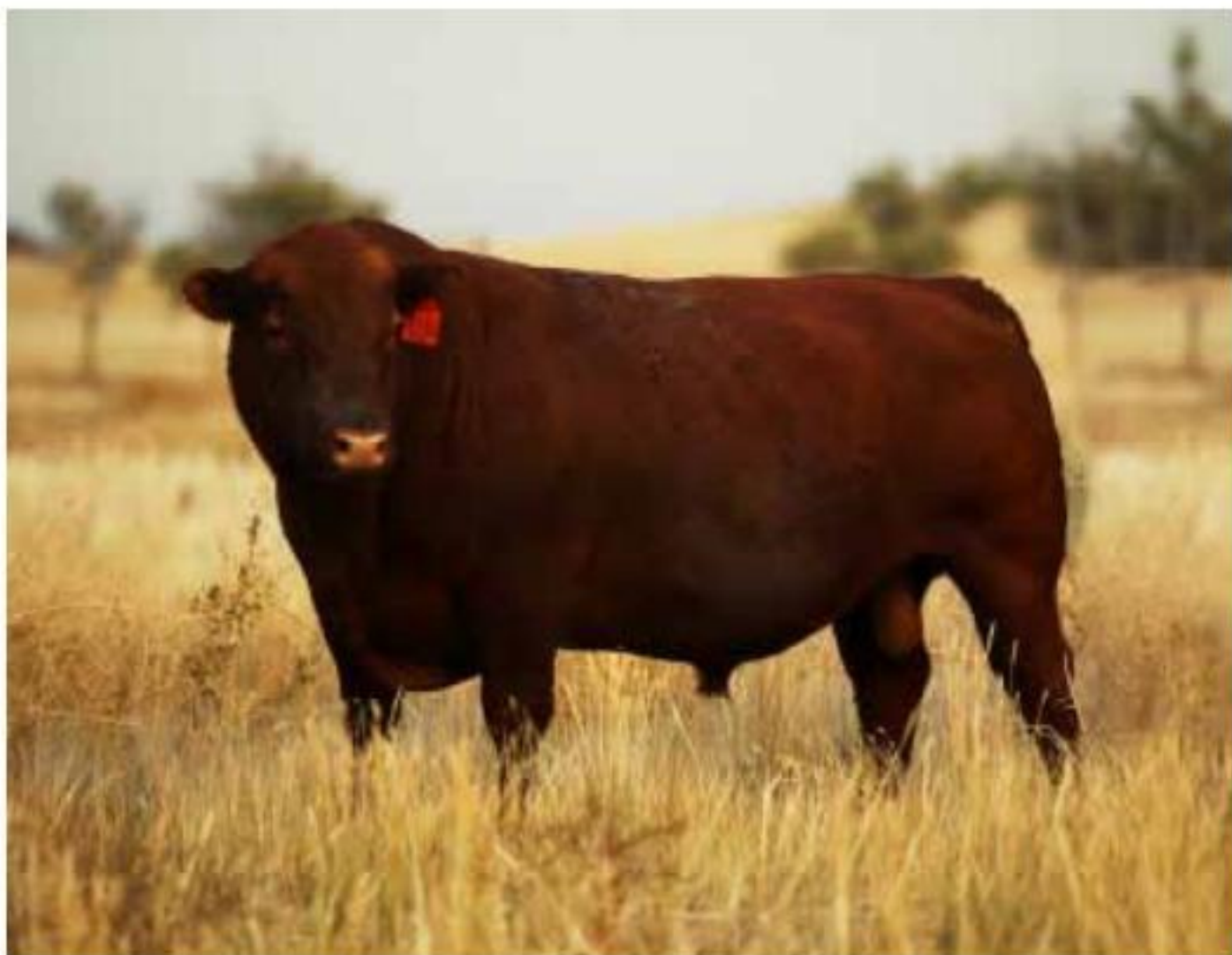
K2 Redman 631 8031