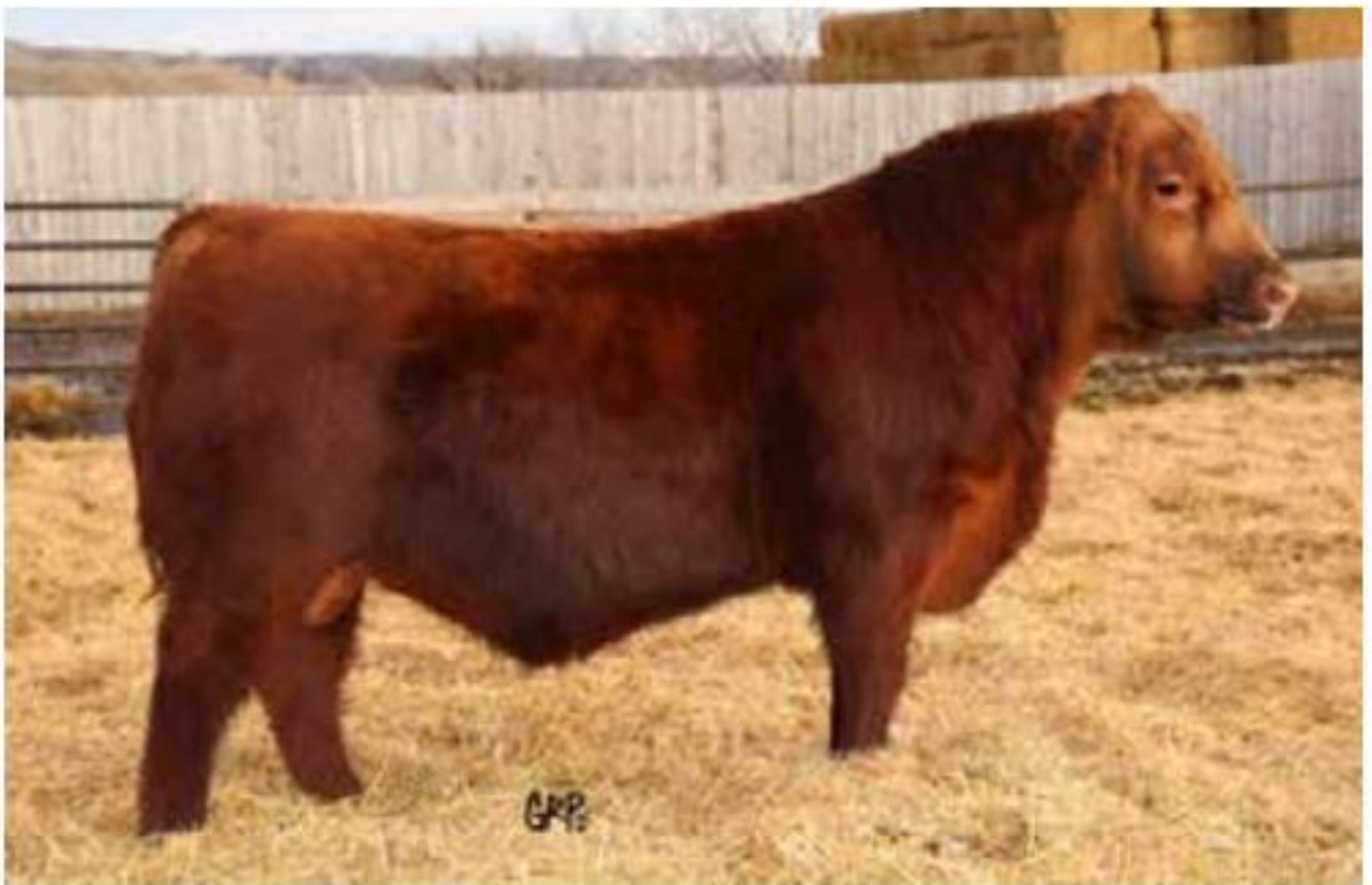
Red U2 Foreigner — Sire of our herd bull "Stout"