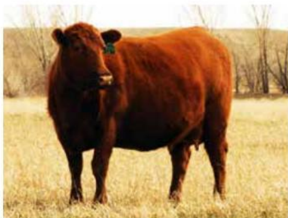
714 at 7 with son Resilience