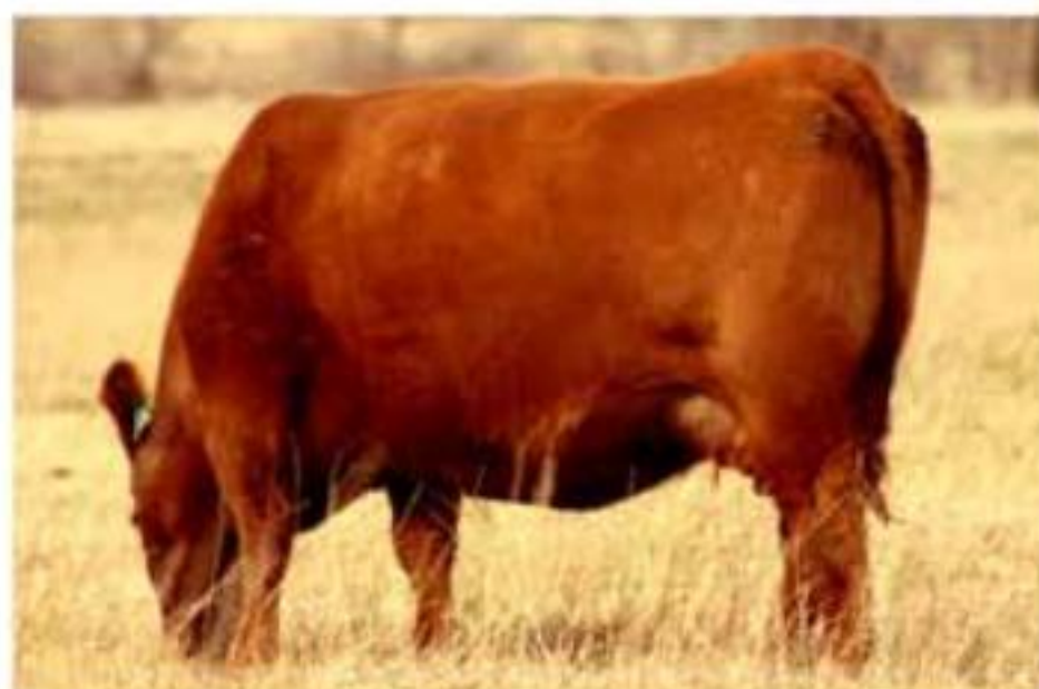
K2 Paprika 305 605—Granddam to Lot 17 and a donor dam showing up in many of our pedigrees

One benefit of this is to offer our customers several full brothers and 3/4 brothers out of the best genetics in our program. If you are looking for this consistency we can help you with a list of these closely related bulls.