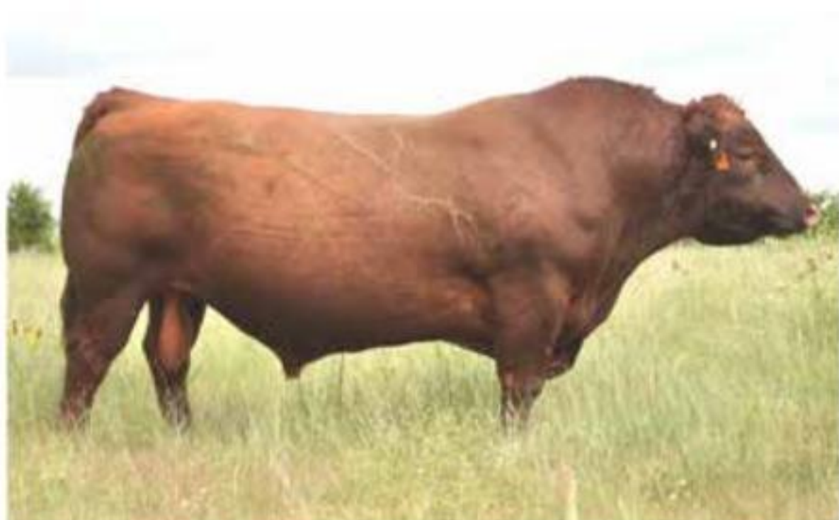
POKE NebP707 9116 1064

K2 Sheridan 714 is one of our embryo donors, and shows up in many pedigrees in this catalog