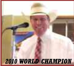
2010 WORLD CHAMPION