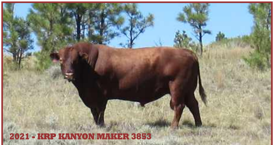
2021 - KRP KANYON MAKER 3853