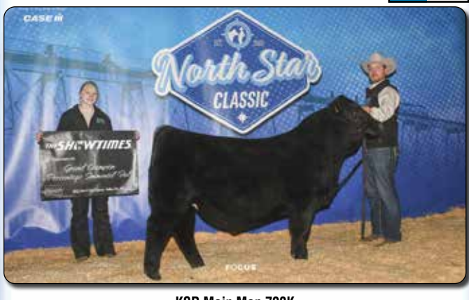
KSR Main Man 723K Grand Champion Percentage Simmental Bull 2022 North Star Classic