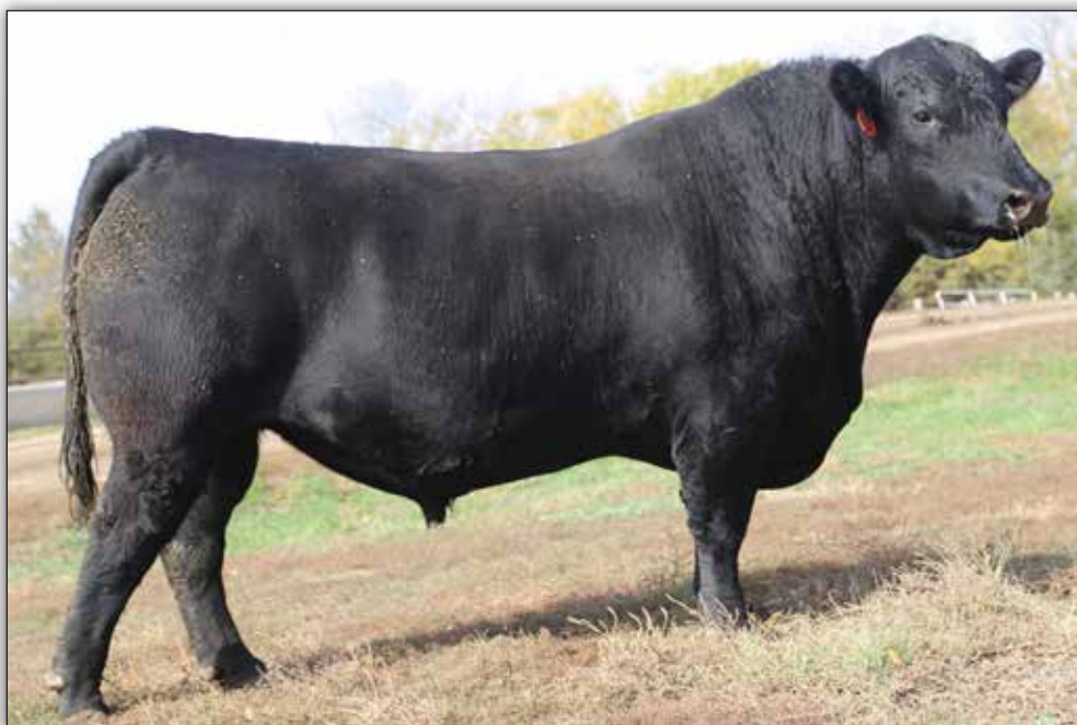
Koupals B&B Infinity 9012