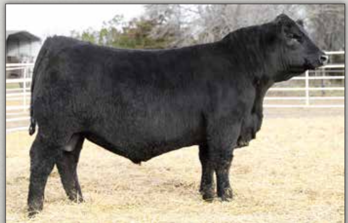
Koupals B&B Eyes Onyou 1076 - Lot 104

• Lot of meat. Nice productive cow. Eighth largest ribeye and 10th in ADG.