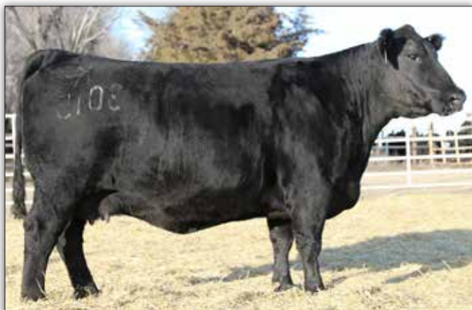
B&B Blkbd Progress 3015