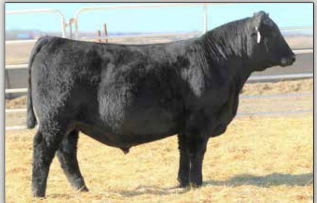
Koupals B&B McCoy 0148