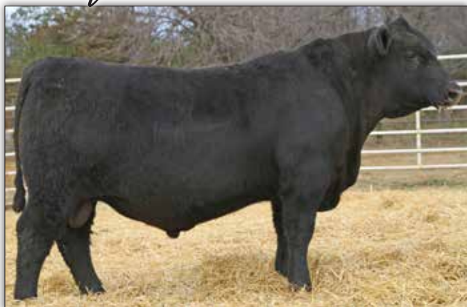
Koupals B&B Pathfinder 1046 - Lot 3