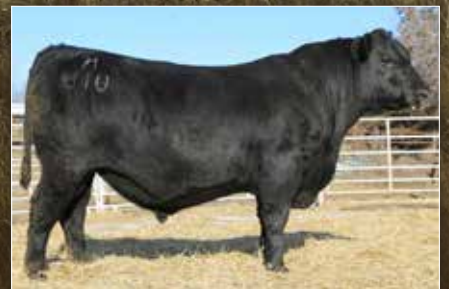
Koupals D&A Blackout 018 – Lot 233