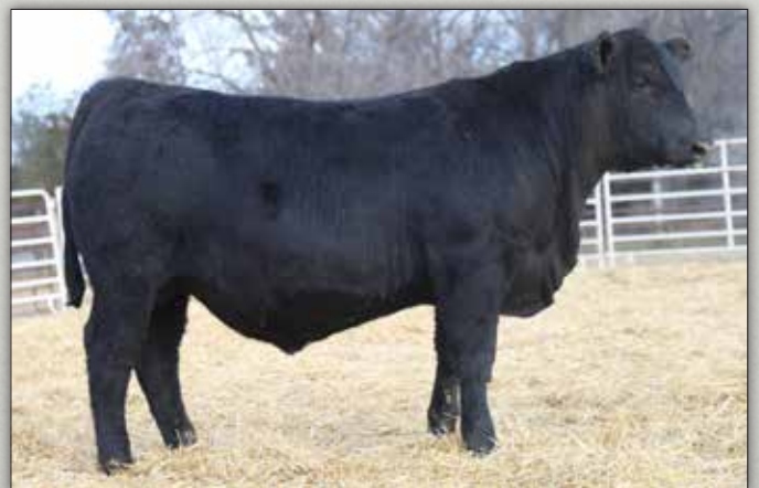
Koupals B&B Atlantis 1215 - Lot 193