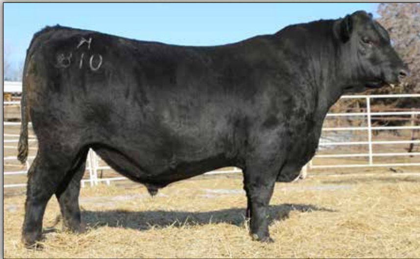
Koupal's D&A Blackout 018 - Lot 233