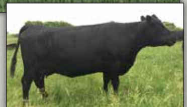
Koupal Erroline 1103 - Dam of Koupal Olympian 533.