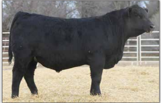
Koupals B&B Stellar 1120 - Lot 114

• Calving ease. Out of Maternal sister to Koupals B & B Detail.