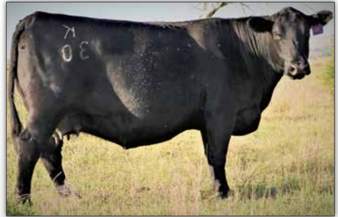
D&A Prospector Pride 30 - Dam of Lot 220.

• A big hipped bull backed by a great cow family! Frontman Dam is easy fleshing with an ideal udder.