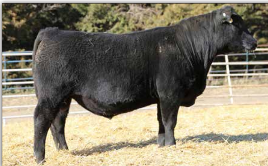
Koupal Fred 174 - Lot 139