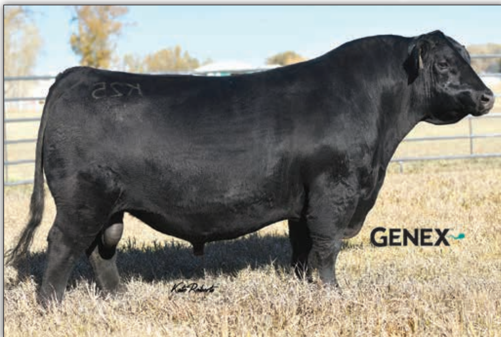
G A R Ashland