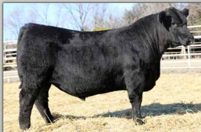
Koupals B&B Infinity 1066 - Lot 36

• Dam is very productive. 7/100 BR, 7/104 WR, 5/108 YR, 4/108 IMF Ratio. 4/106 REA ratio. Bull is long bodied with a look of a herd bull. Free moving daughters should be excellent. Maternal brothers sold to Adam Mohrhauser and LaVern Koupal along with having two heifers retained, she will become donor cow this spring. We don't FLUSH COWS because some are high dollar beef or extreme numbers, but because they are productive with good udders, feet, fertility, and longevity!!!!