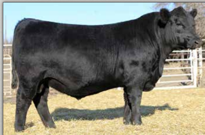
Koupals B&B Progress 0017 - Maternal Brother to Lot 28.