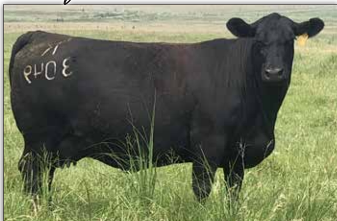
Koupals B & B Lassie 3049 - Granddam of Lot 24 and Dam of Koupals B & B Detail 7070.