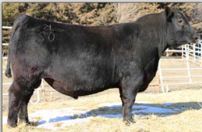
Koupal's D&A Pathfinder 02 - Lot 199