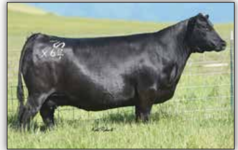
Pine Coulee Ever Entense X64 - Dam of Drifter.