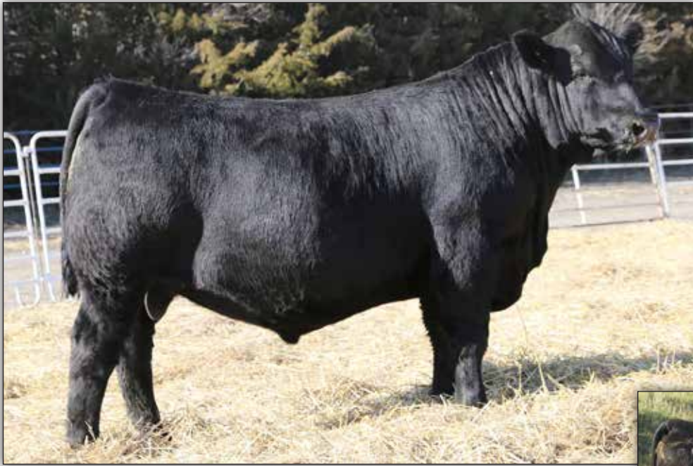
Koupals B&B Juneau 1083 - Lot 189