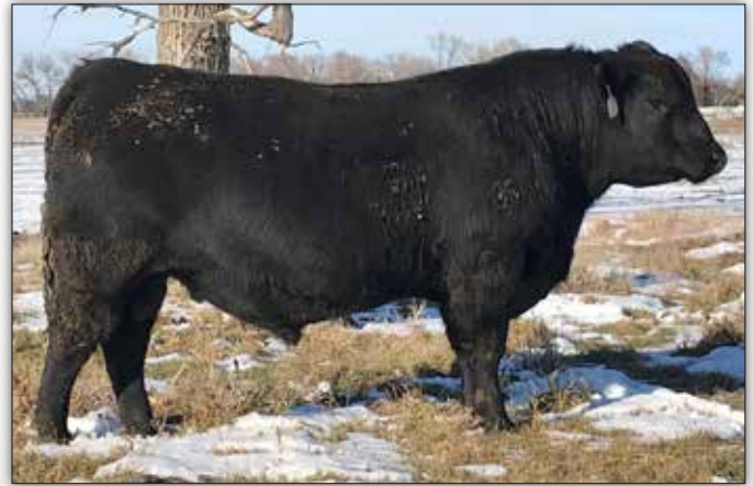
Brooks Just Right 0339