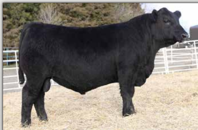
Koupals B&B Juneau 1192 - Lot 28