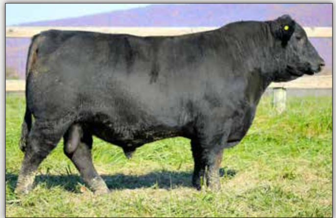
Ginger Hill Macho Man 058