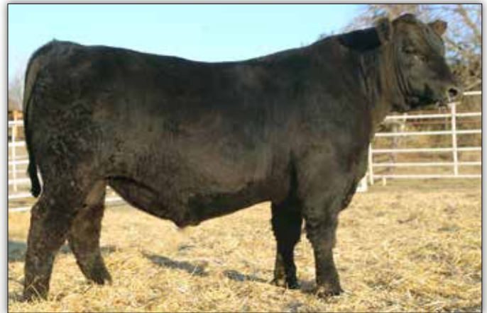
Koupals B&B Knockout 1071 - Lot 83