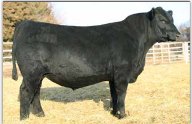
Koupals B&B Junction 0124