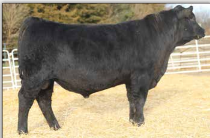
Koupals B&B Stellar 102 - Lot 108