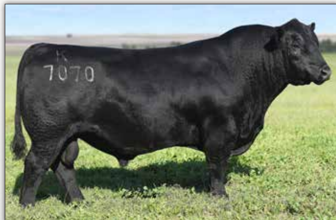
Koupals B & B Detail 7070 - Maternal brother to the Dam of Lot 24.