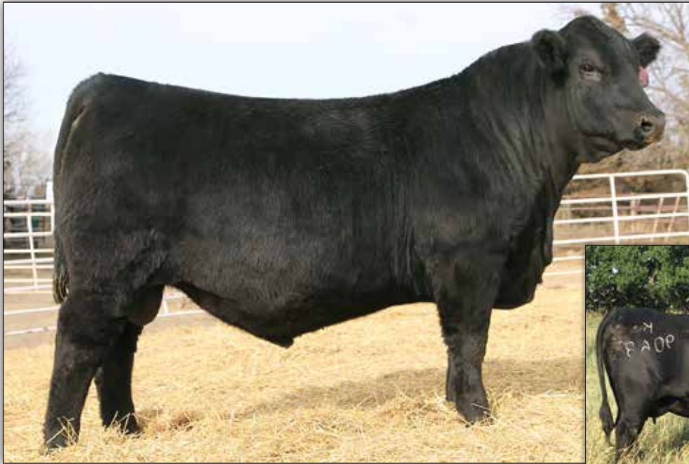
Koupals B&B Pathfinder 1048 - Lot 1