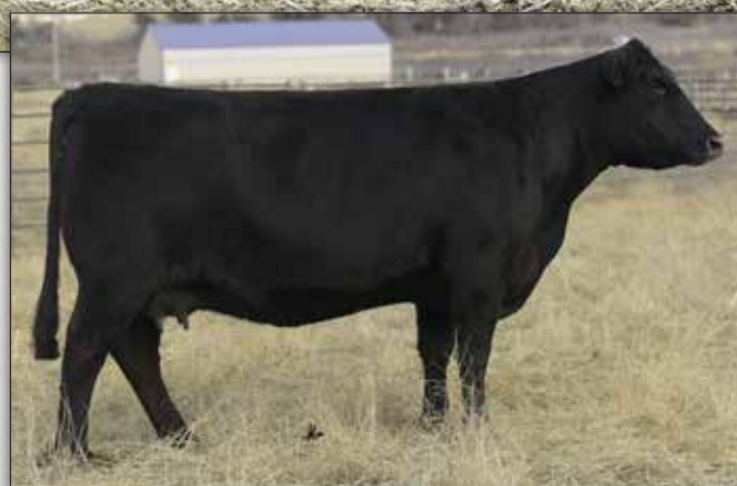
Bear Mtn Forever Lady 2197 - Dam of Maternal Dream.

• Co-owned with Bear Mountain Angus. Moderate growth, adds fleshing ability, good disposition. Keep every daughter. Maternal Dream Top 10% for WW, Top 20% for YW, Top 10% for $W, and Top 15% for $F. Six Pathfinder sires in his pedigree.