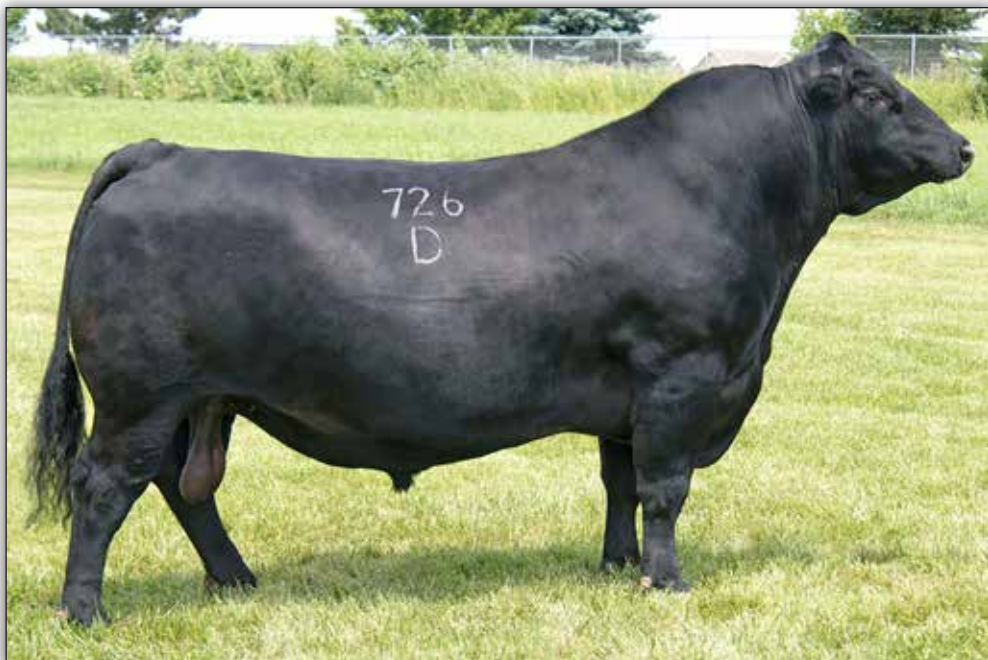
Sitz Stellar 726D