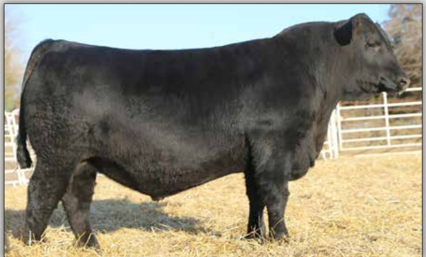
Koupals B&B Mainstay 1061 - Lot 155

• Very productive cow family. Excellent udder and disposition. Calving ease.