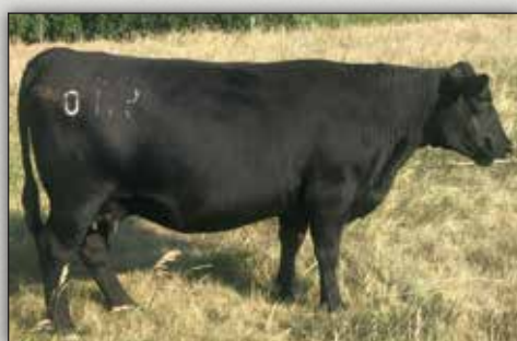
B&B Gammer 9110 - Dam of Lot 108.