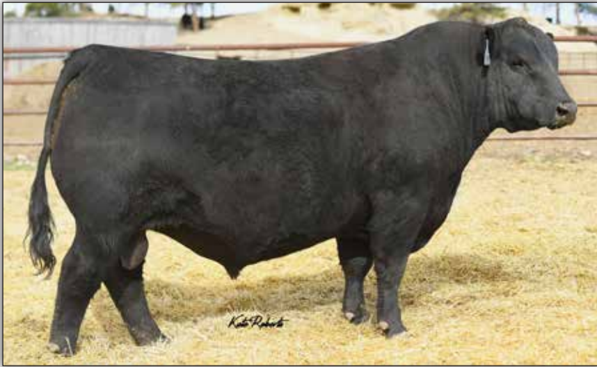
Pine Coulee Drifter G372