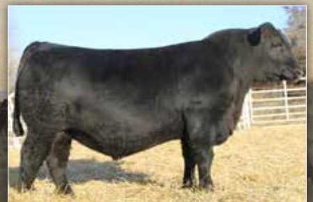
Koupals B & B Mainstay 1061 – Lot 155