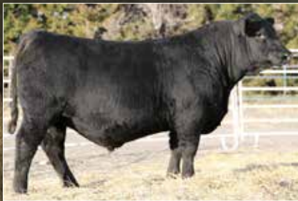
Koupals B & B Territory 1159 – Lot 34