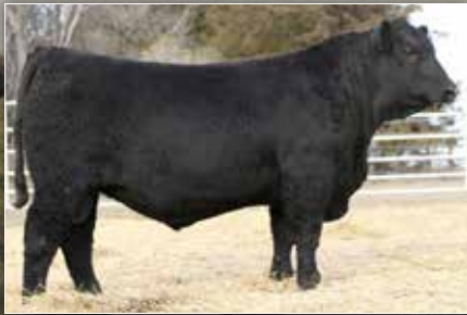
Koupals B & B Rainfall 1013 – Lot 29