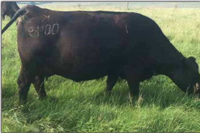
B&B Blkbd Progress 0049 - Dam of Lot 37.