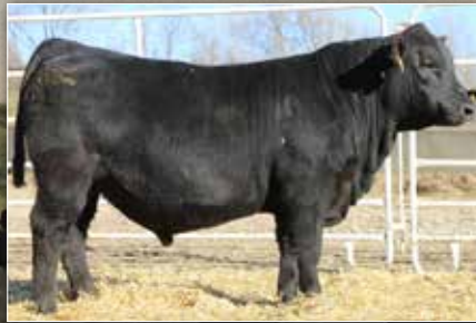
Koupals D&K Knockout 125 – Lot 74