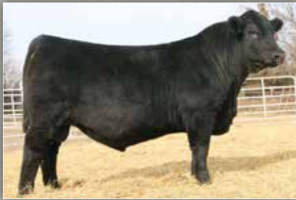
Koupals B & B Pathfinder 1048 – Lot 1