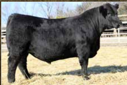
Koupals B & B Infinity 1066 – Lot 36