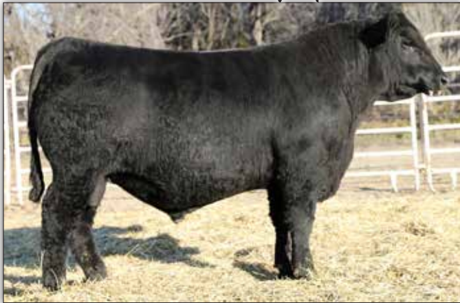
Koupals B&B Ashland 1052 - Lot 170