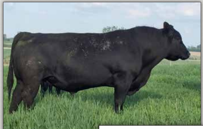
Koupal Olympian 533