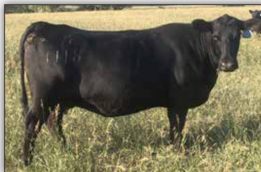
B&B Queen Isabel 8111 - Dam of Lot 181.