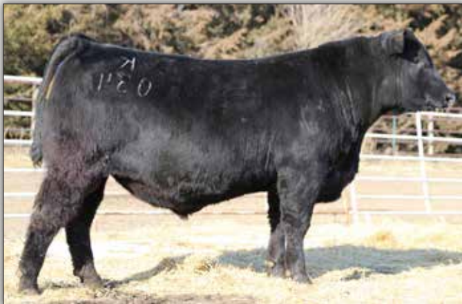
Koupal's D&A Substance 034 - Lot 212

• Big, Long, performance bull! He'll sire a nice set of feeder cattle. One of the heavier fall bulls at weaning. WR:106, YR:102.