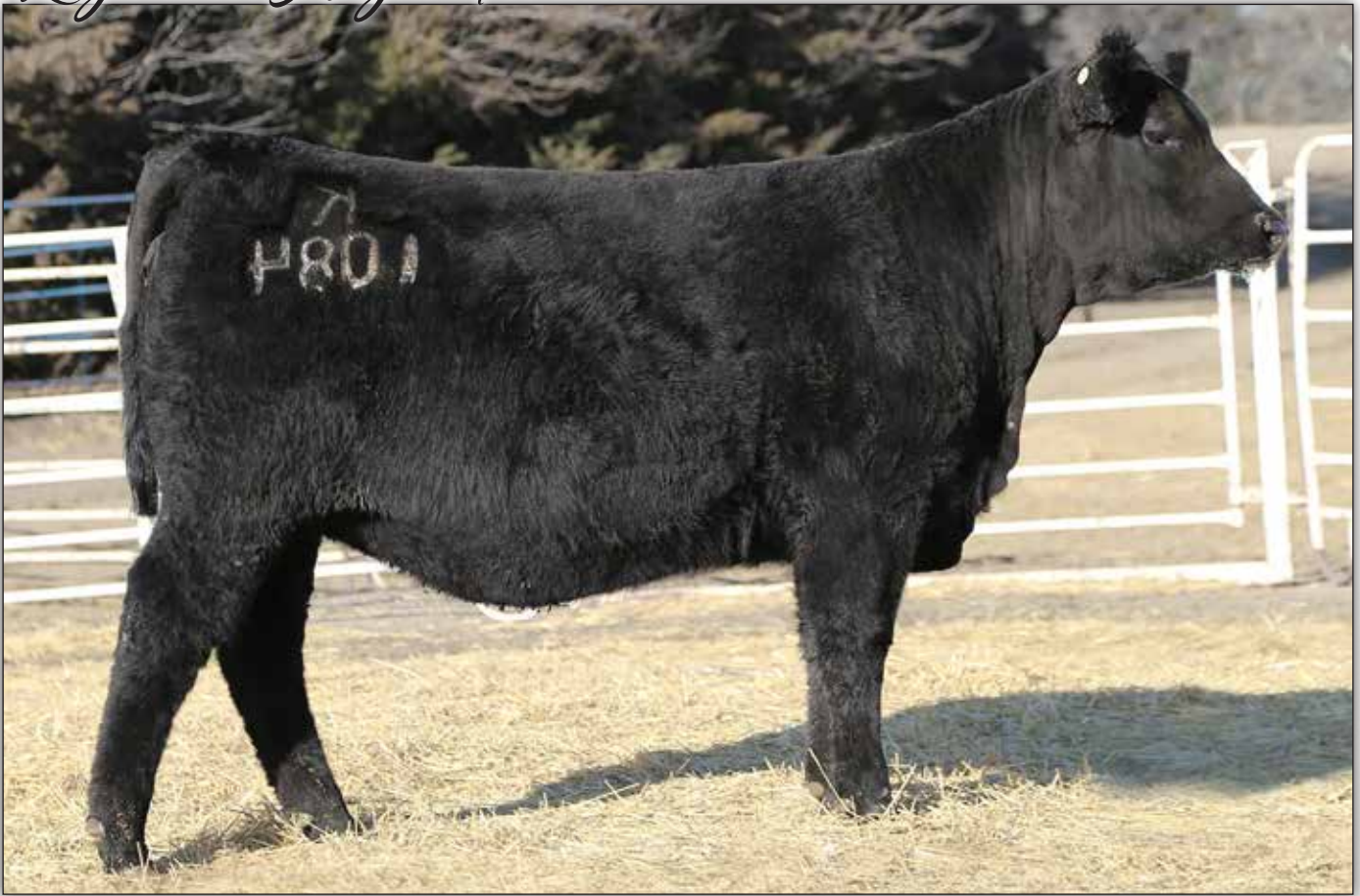
B&B Zara 1084 - Lot 236