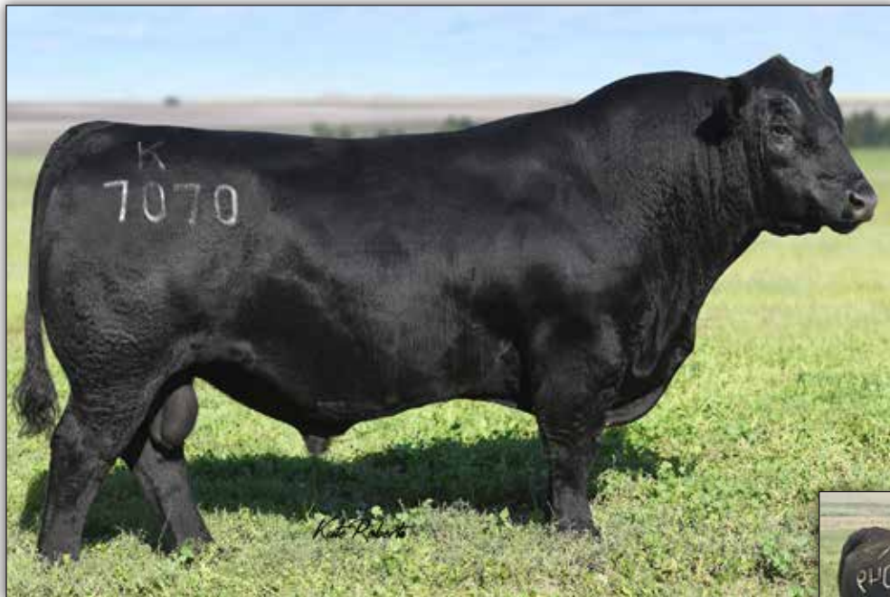
Koupals B&B Detail 7070