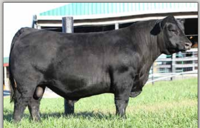
Tamme Valley Fundamental 034