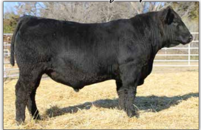
Koupals B&B Infinity 1037 - Lot 39