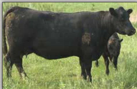
B&B Blue Ribbon 206 - Dam of Lots 184 - 186.