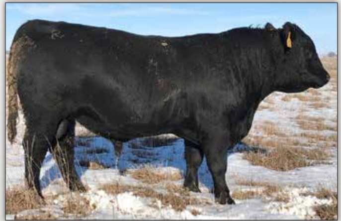
RRR Deluxe R2569