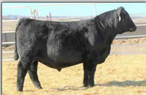
Koupals B&B McCoy 0148 - Maternal Brother to Lot 184.