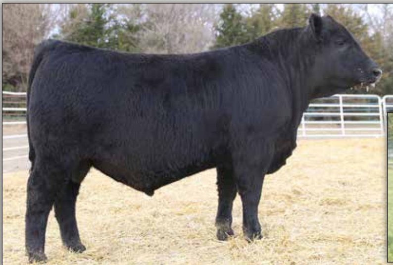
Koupals B&B Pathfinder 1201 - Lot 2