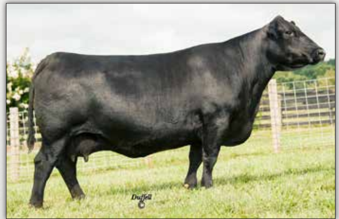
B&B Erica 605 - Granddam of Lot 23.