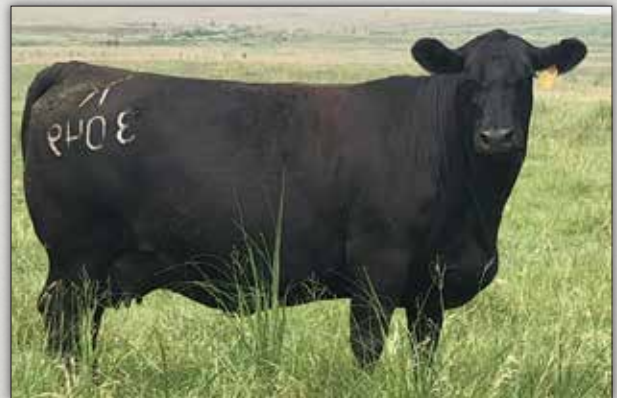
Koupal's B & B Lassie 3049 - Maternal Sister to Charm.