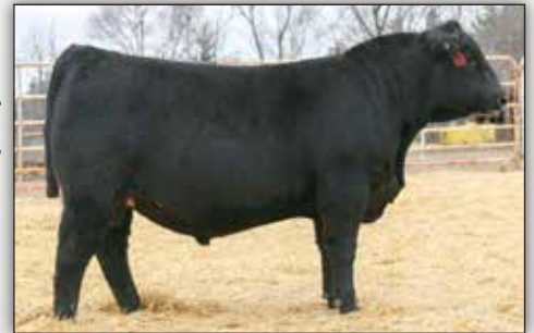
Koupl's B&B Pathfinder 0051 - Full brother to Lot 11.

• Heifer bull. Nice complete calf that will calve easy, and they grow.