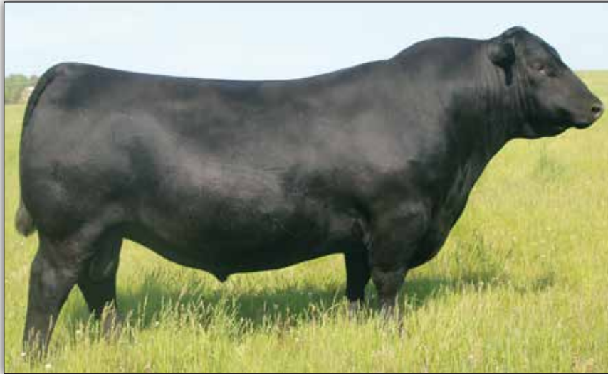
S A V Rainfall 6846