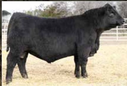
Koupals B & B Eyes Onyou 1076 – Lot 104