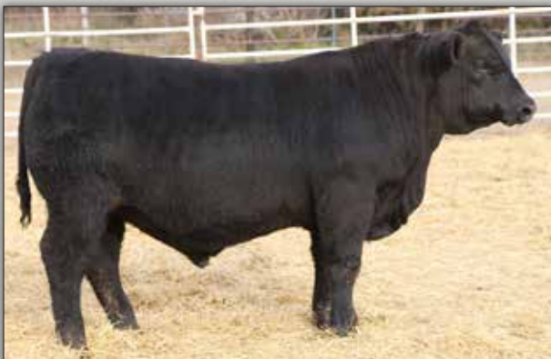
Koupals B&B Kozi 1186 - Lot 190

• No fall creep. I marked this bull as long, deep, square hipped, and good.