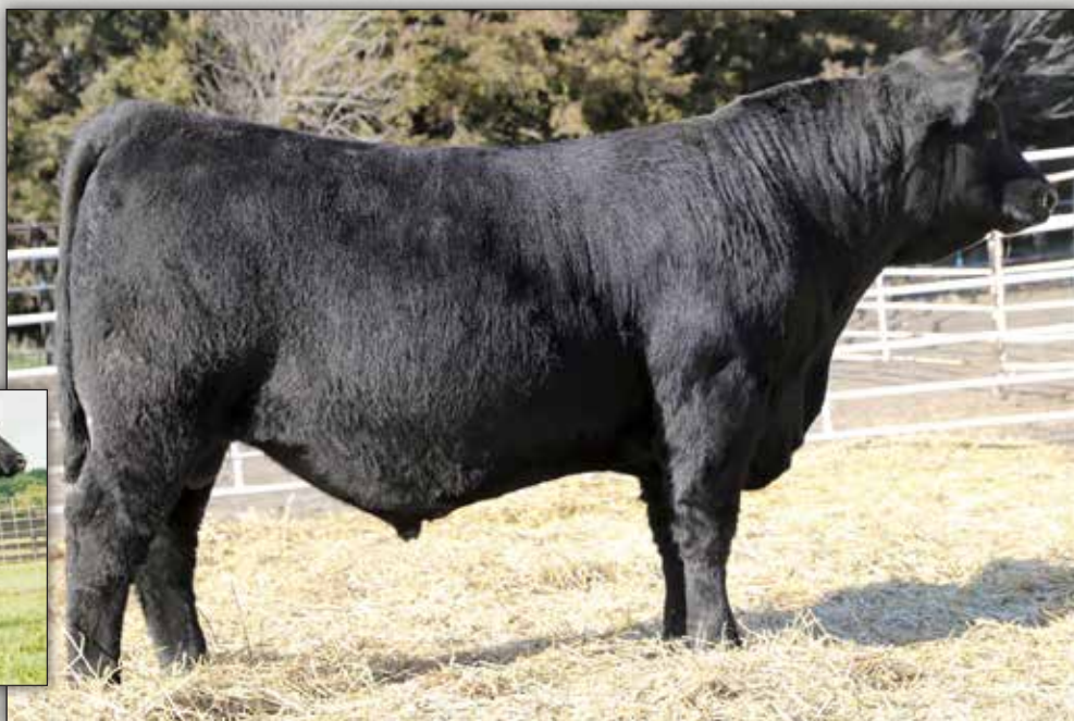
Koupals B&B Ashland 1040 - Lot 169