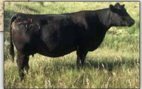
B&B Pride 6019 - Dam of Lot 189.