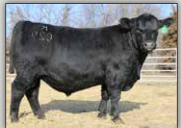
Koupals D&A Full Metal 029 - Lot 229