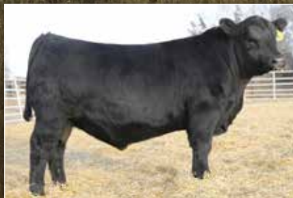
Koupals B & B Rainfall 1111 – Lot 126