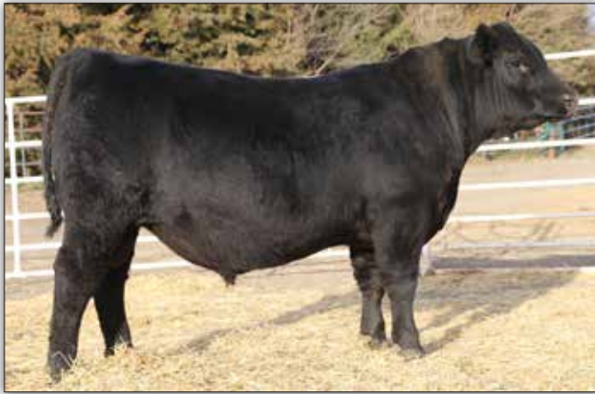
Koupals B&B Charm 1063 - Lot 150