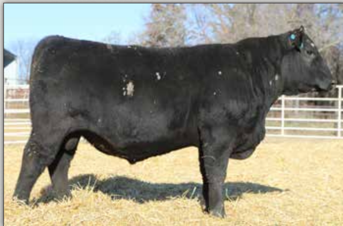
Koupal Infinity 168 - Lot 66

• No fall creep. Potential heifer bull on larger framed heifers. Dam's production BWR 6/90, WWR 6/103. 4 generations of BWR under 100. Dam has tremendous udder and small teat size.