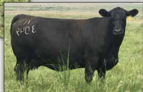
B&B Lassie 3049 - Dam of Detail.