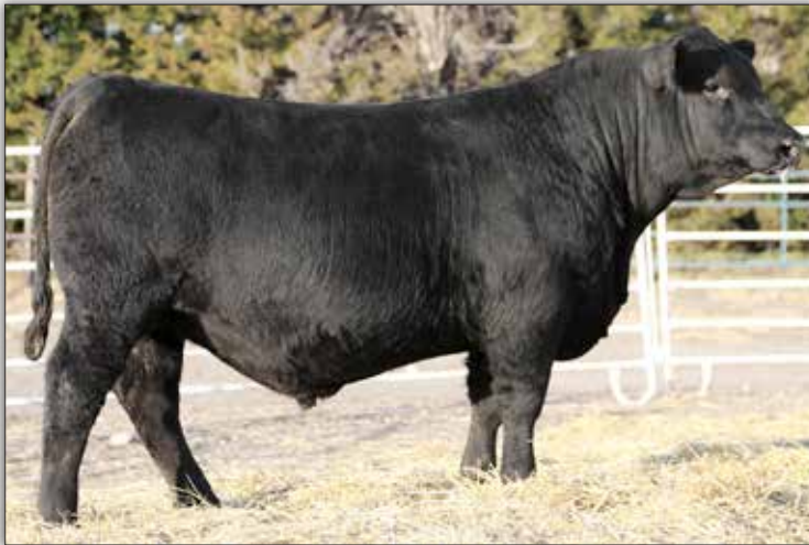
Koupals B&B Territory 1159 - Lot 34