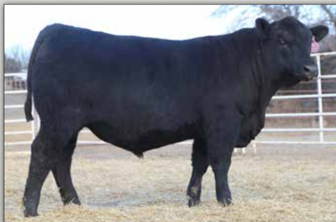
Koupals B&B Pathfinder 1128 - Lot 4

• Dam is tight uddered. She is a maternal sister to the Cannon Bull sold to CRV. Well balanced EPD profile. He is top 1% $M and top 4% HP. Top 10% CED and 20% BW.