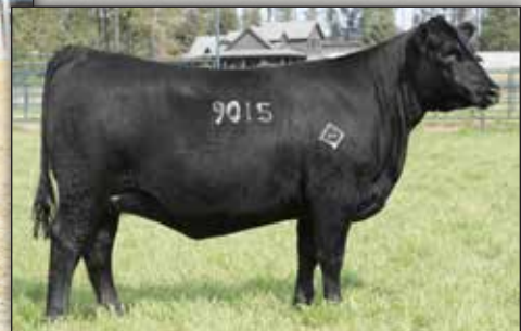
Montana Donna 9015 - Dam of Lot 2