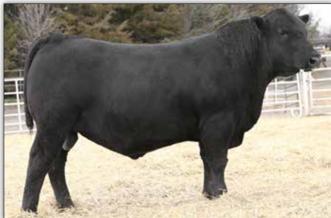
Koupals B&B Makers Mark 1117 - Lot 77

• Powerful cow bull. Super thick and will put more pounds on the scale.