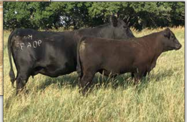
Lot 1 with Dam - BB Zara 9068