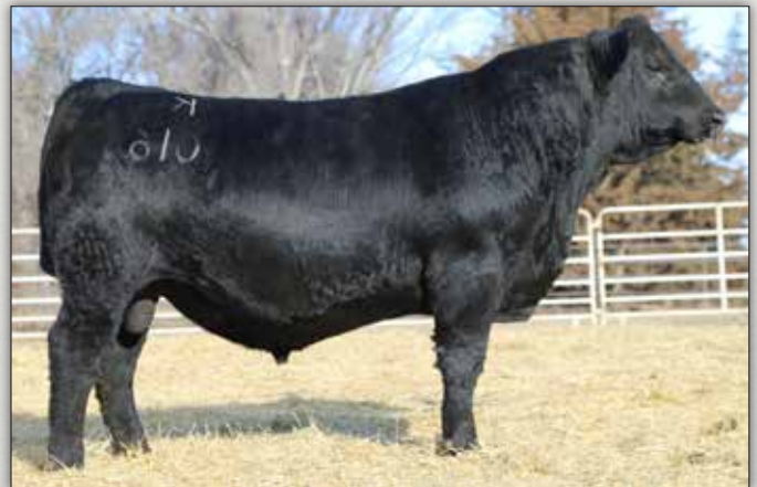
Koupal's D&A Fix It 016 - Lot 215