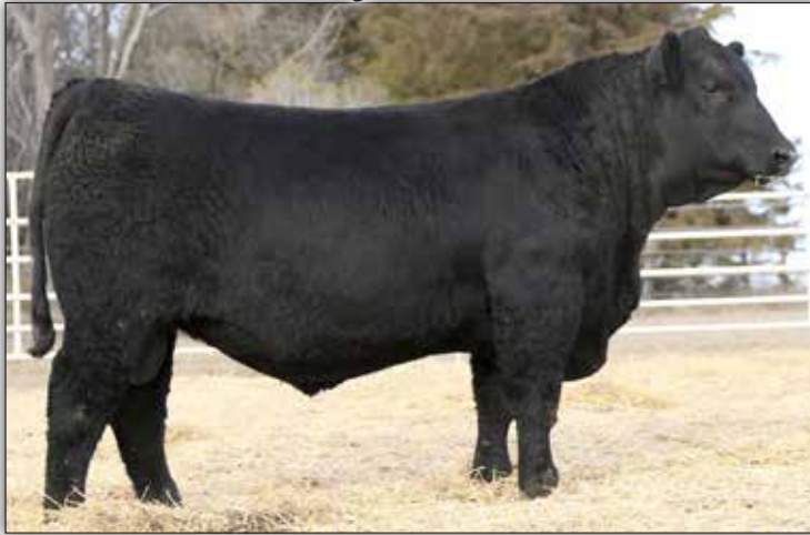
Koupals B&B Rainfall 1013 - Lot 29