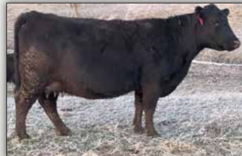
B&B Kimberly 602 - Dam of Lot 11.