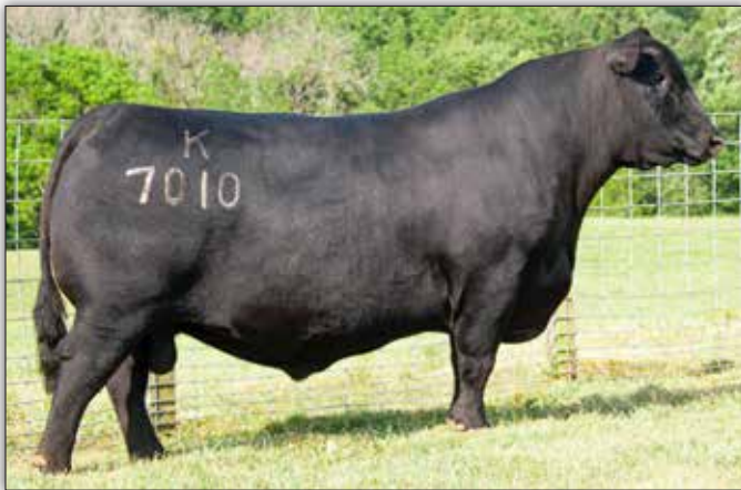
Koupals B & B Canon 7010 - Maternal Brother to Lot 80.