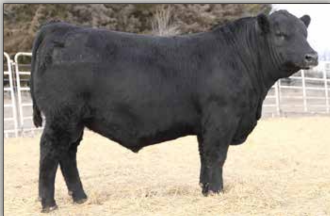
Koupals B&B Blackout 0039 - Maternal Brother to Lot 28.