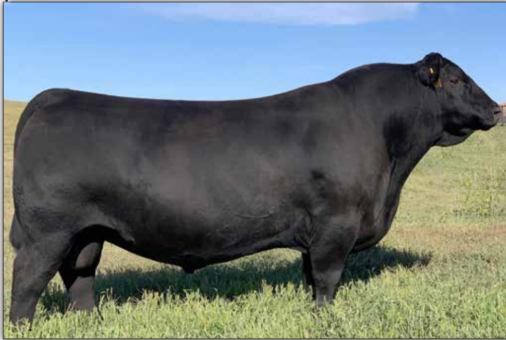
S A V Territory 7225