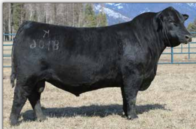
KOUFALS B&B Pathfinder 8106