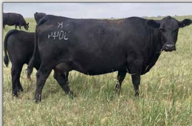
B&B Blkbd Progress 3044 - Dam of Lot 36.