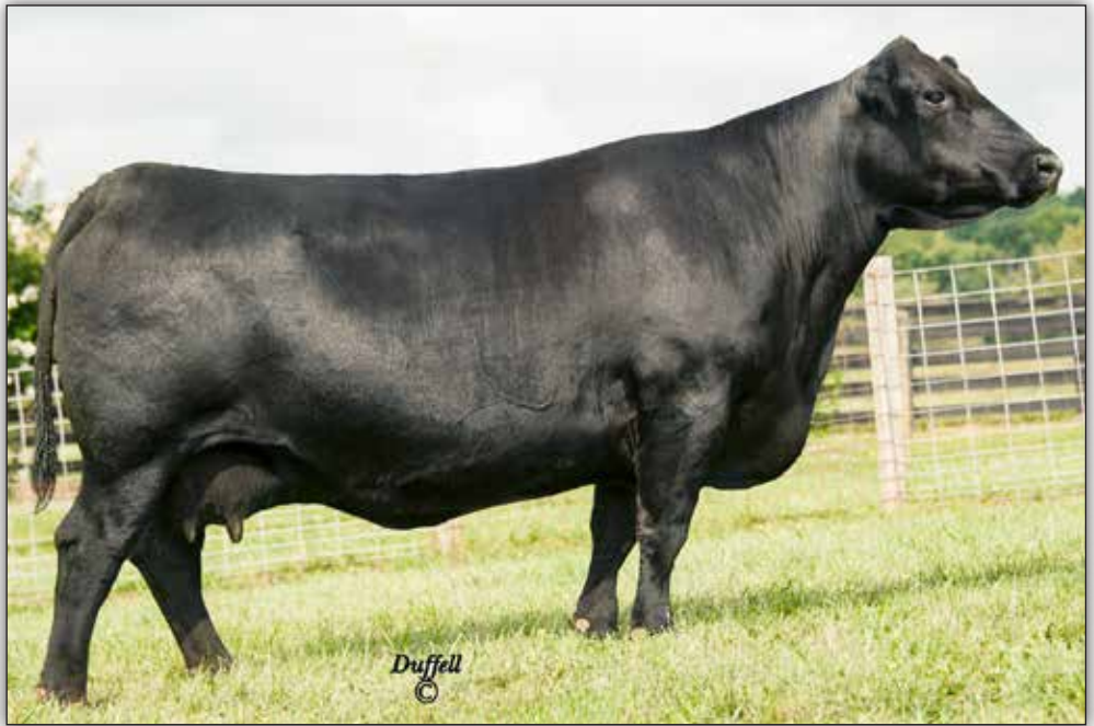
B&B Erica 605 - Dam of Lot 191 and Identity, Nikon, Apollo, and Whitestone. Granddam of Cannon.