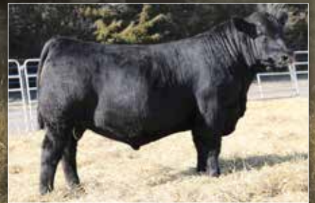
Koupals B & B Juneau 1083 – Lot 189