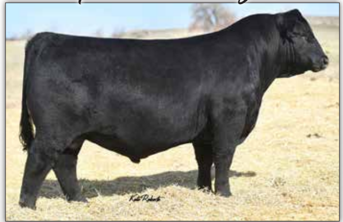
W Sunrise Executive Law 507H