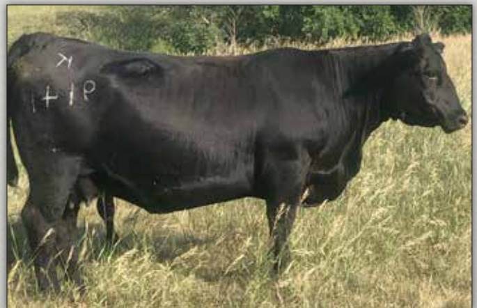
B&B Blackcap 9140 - Dam of Lot 113.

• Big time performance! Dam is Excellent! The 50K came back that he should be the worst on marbling, but actual data put him at a 100 ratio which would make him average. Detail has 101 progeny ratioing 103 on IMF, yet he is only a .17 for marbling on his EPD. This is one of the instances where raw data has some true value. The problem is DNA is weighted so heavily that raw data doesn't help.