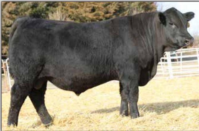
Koupals B&B Stellar 1114 - Lot 113

• Out of heifer. Bull had 99BR,102 WR, 104 YR. Well balanced numbers.