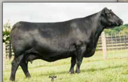
B&B Erica 605 - Granddam of Lot 169.