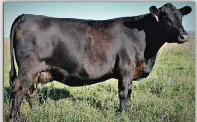
D&A Prospector Pride 520 - Dam of Lot 221.

• A cattleman's bull! I named this bull Keeper as I have a hard time letting him go. His mother is the best cow to walk at D&A's place. If you like them easy fleshing, thick made, and correct look him up sale day!