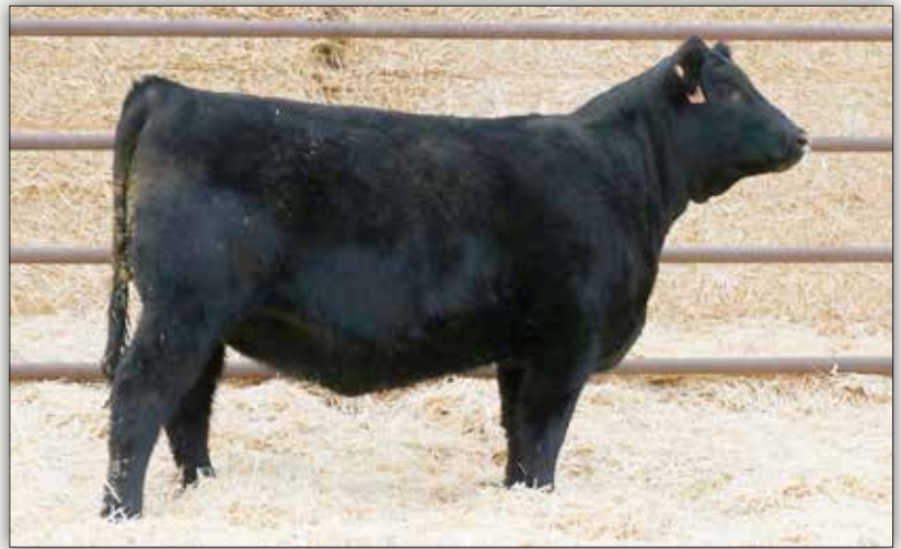
LGR EMBLYNETTE 1128

At Little Goose Ranch we believe that the youth in agriculture are the best asset for the future of our industry. As has become tradition we are going to donate a heifer to any junior, age 21 or younger, on sale day. When choosing the donation heifer, we picked a female representative of the type and kind of female that we want to create – right out of the heart of our replacements. 1128 has a solid pedigree, well balanced EPDs, and is phenotypically correct indicating a productive cow in the making. Juniors will only be eligible to win if they are in attendance sale day. Just stop by clerk's counter at the sale barn to get your winning ticket!