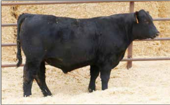
LGR BRAVO 1075 - Lot 10