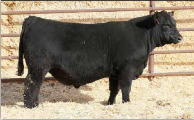
LGR BRAVO 1093 - Lot 47