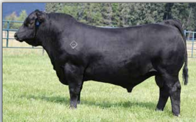
MONTANA FOREMAN 8076