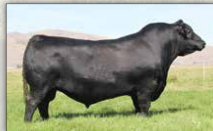
COLEMAN BRAVO 6313 - Paternal grandsire of Lot 4.