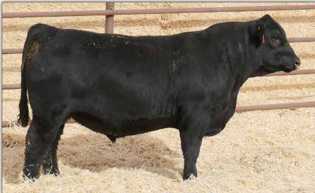
LGR RESOURCE 1086 - Lot 15