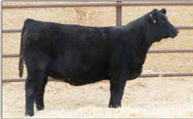
LGR RUBY 1099 - Lot 101A