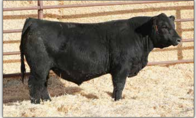
LGR FOREMAN 1034 - Lot 50