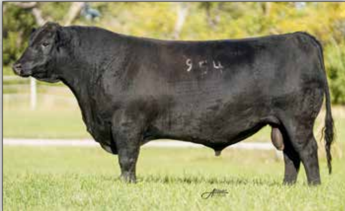
COLEMAN BRAVO 954