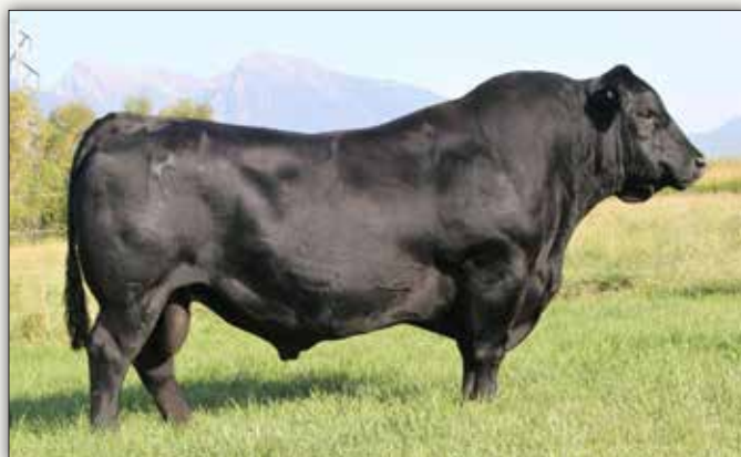
COLEMAN RESOURCE 710