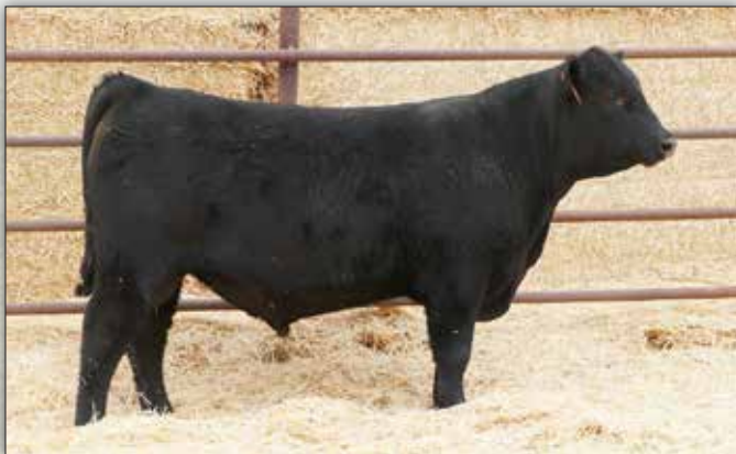
LGR BRAVO 1021 - Lot 6