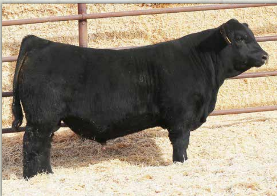
LGR BRAVO 1028 - Lot 4