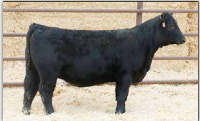
LGR MISS WIX 1003 - Lot 102B