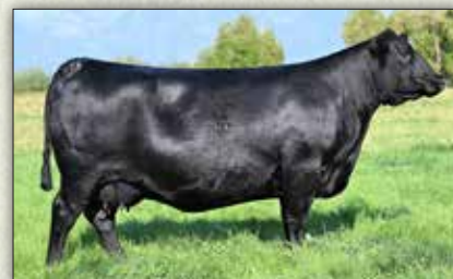
LAWSONS CHLOE C815 - Paternal grandam of Lot 4.