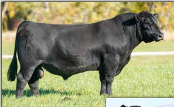
LGR RELOAD 0139