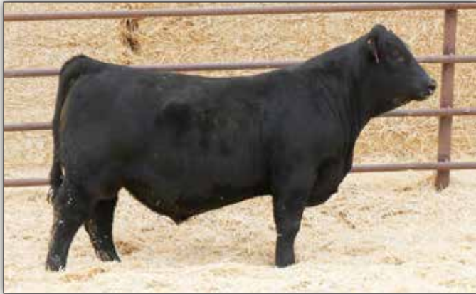
LGR LOGO 1045 - Lot 5