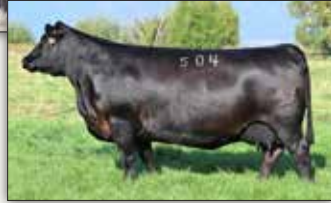
COLEMAN DONNA 504 - Dam of Coleman Sheridan 9295