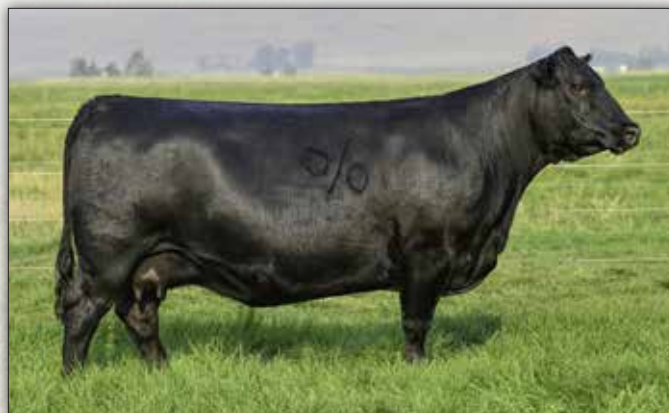
COLEMAN DONNA 7100 - Dam of Coleman Logo 947.