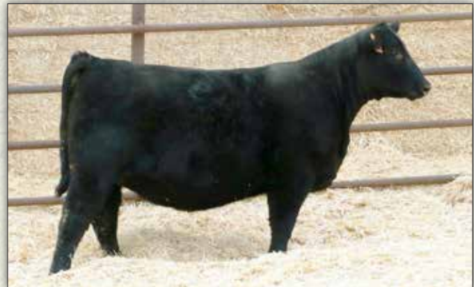
LGR BLACKBIRD 1106 - Lot 100B

About the Heifers The heifers will be selling as commercial females. Registration certificates can be purchased for an additional $200 per head of the purchase price. The heifers reflect our cow herd representing daughters from first calf heifers to running age cows. Our past customers have been very satisfied with the type, kind, and docility of our heifers. All heifers have been Bangs vaccinated and are on the same vaccination program as our bulls. These heifers are for immediate pickup unless prior arrangements have been made.