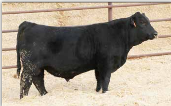
LGR LOGO 1043 - Lot 38