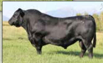
COLEMAN RESOURCE 710 - Sire of LGR Reload 0139

We are excited about the future of these guys and their progeny.