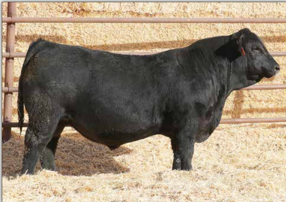
LGR RESOURCE 1064 - Lot 3