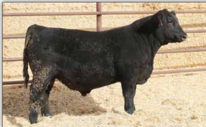
LGR SERGEANT 1042 - Lot 39