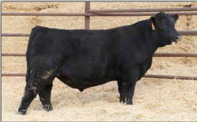
LGR LOGO 1008 - Lot 32