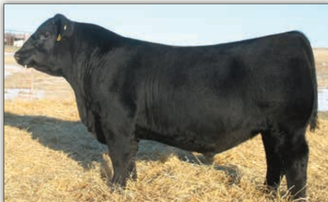
S A V CLOUDBURST 8012