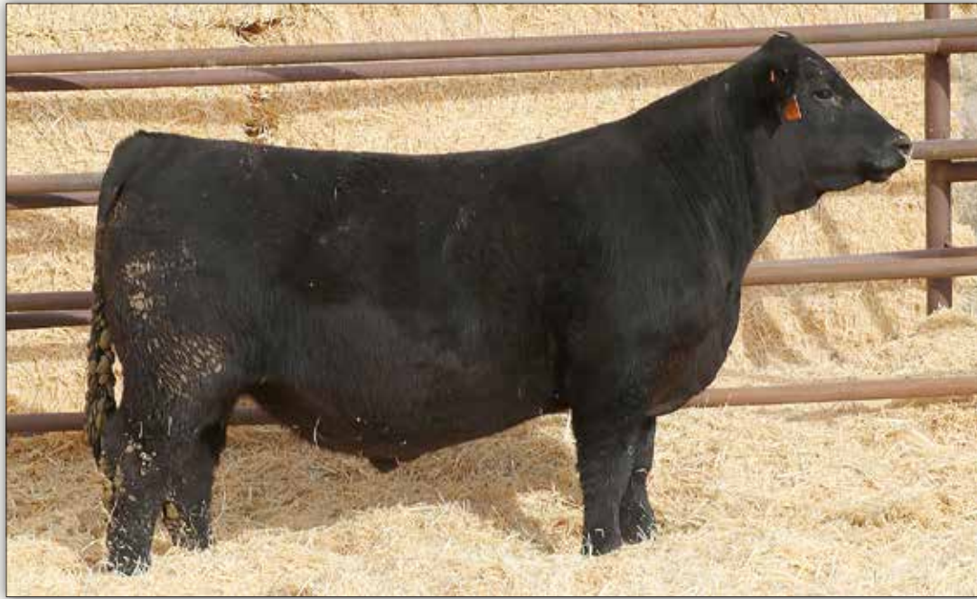
LGR LOGO 1009 - Lot 17