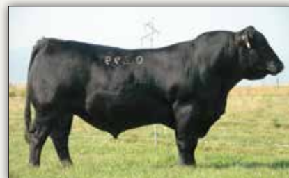
COLEMAN MANNING 0299 - Maternal grandsire of Lot 3.