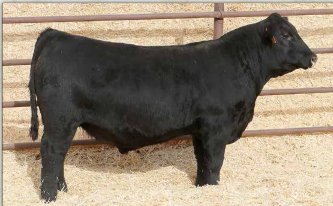
LGR SERGEANT 1073 - Lot 16