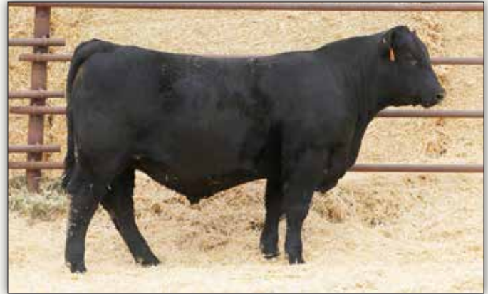
LGR CLOUDBURST 1002 - Lot 7