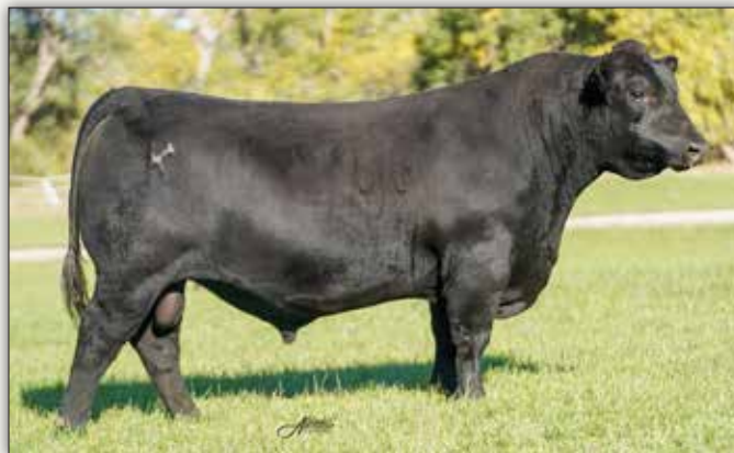
COLEMAN BRAVO 974