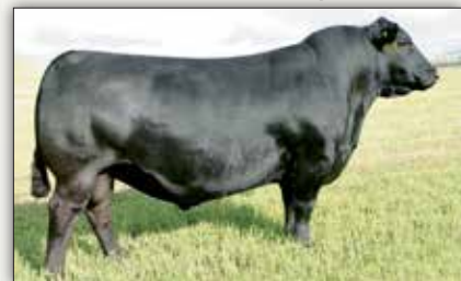
SAV 707 RITO 9969 - Maternal grandsire of Lot 1.