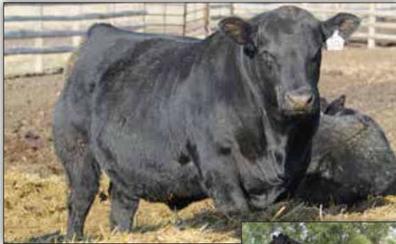
COLEMAN RENOWN 029