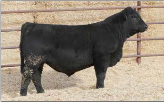
LGR LOGO 1020 - Lot 31