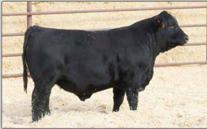
LGR RESOURCE 1134 - Lot 43