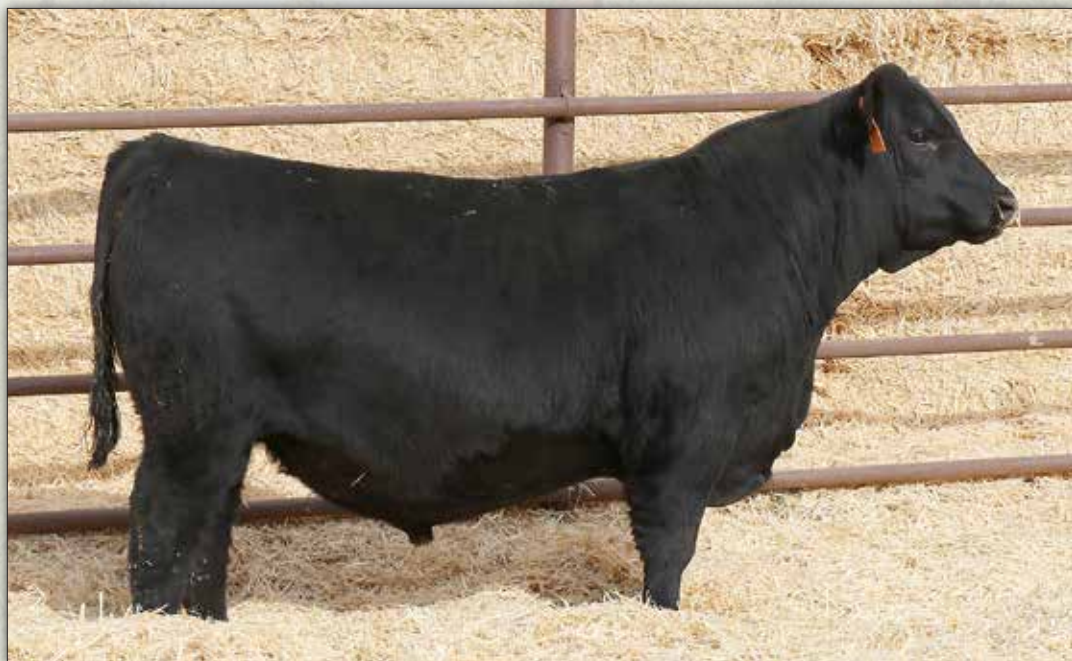
LGR BRAVO 1048 - Lot 18