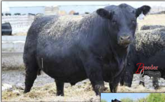
COLEMAN SHERIDAN 9295