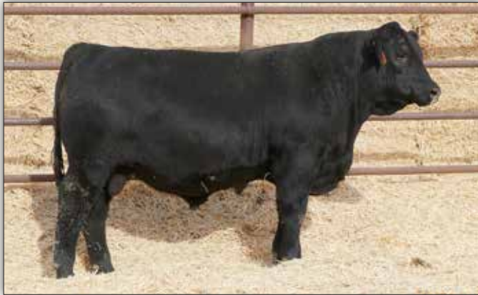
LGR RESOURCE 1013 - Lot 19