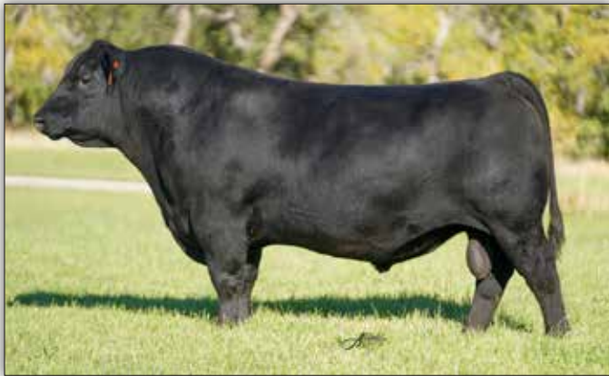
S A V BALLOT 8028