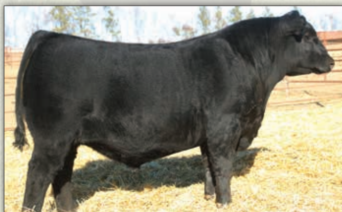
S A V SERGEANT 7188