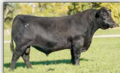
COLEMAN BRAVO 974 - Sire of Lot 1 and flush brother to Coleman Triumph 9145.