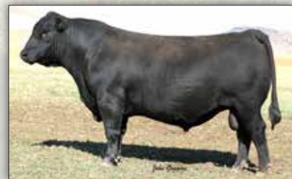
SITZ LOGO 12964 - Paternal grandsire of Lot 2.