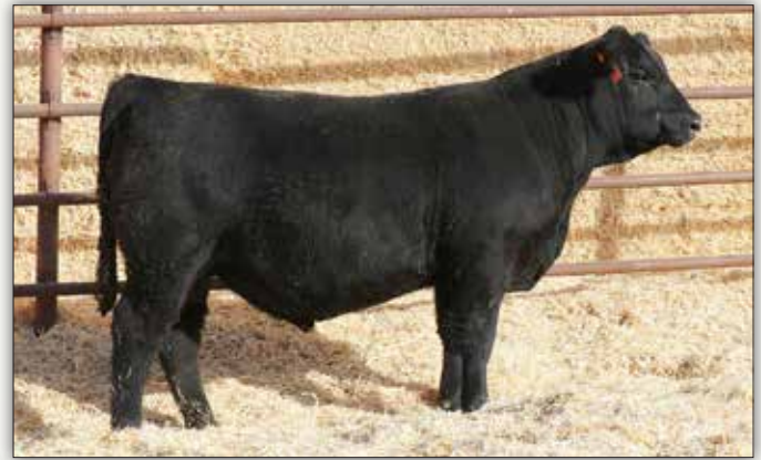
LGR LOGO 1100 - Lot 46