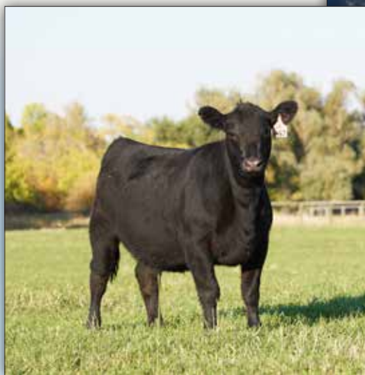
LGR EMBLYNETTE 1063 - Coleman Logo daughter two weeks after weaning.