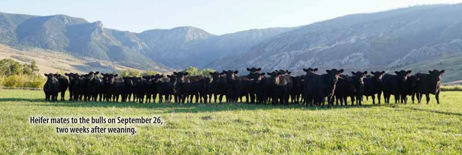
Heifer mates to the bulls on September 26, two weeks after weaning.