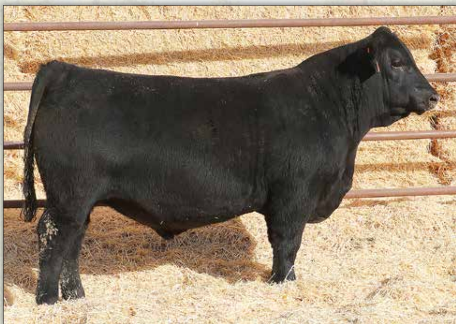
LGR LOGO 1010 - Lot 2