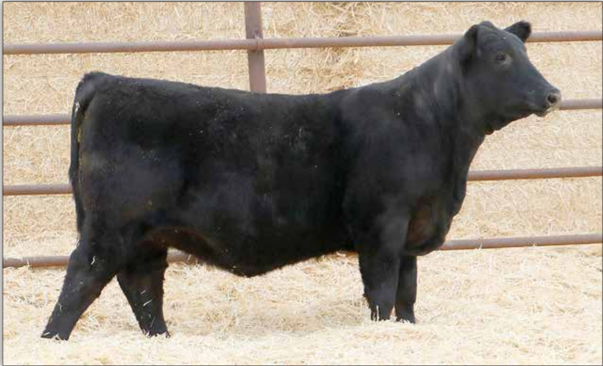
LGR KARMA 1119 - Lot 100A