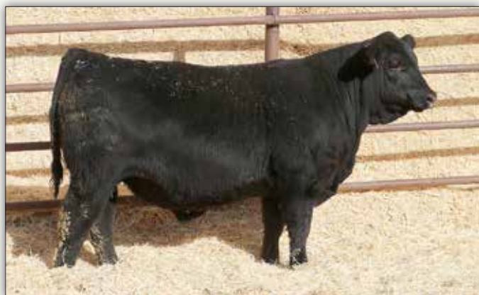
LGR BRAVO 1097 - Lot 30