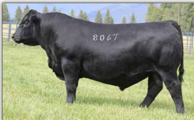
MONTANA FOUNDATION 8067