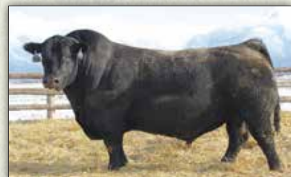
COLEMAN CHARLO 0256 - Maternal grandsire of Lot 2.