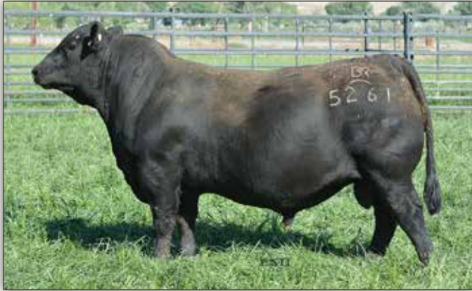
BRUIN TORQUE 5261