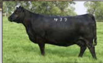
COLEMAN DONNA 439 - Dam of Coleman Renown 029