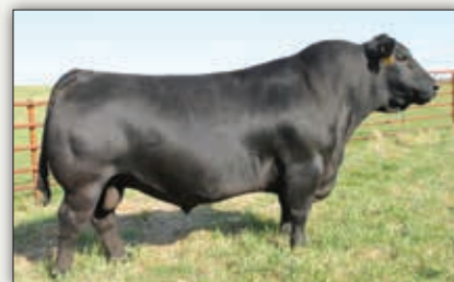
SAV RESOURCE 1441 - Paternal grandsire of Lot 3.