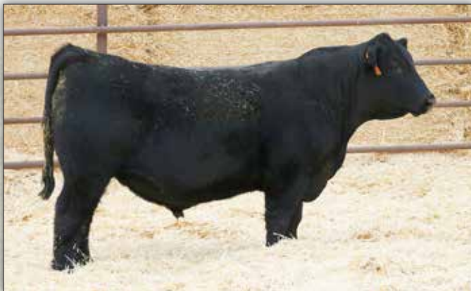
LGR TORQUE 1061 - Lot 11