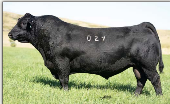
COLEMAN RANGER 029