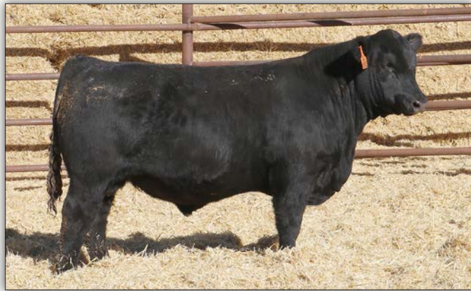
LGR RESOURCE 3081 - Lot 14