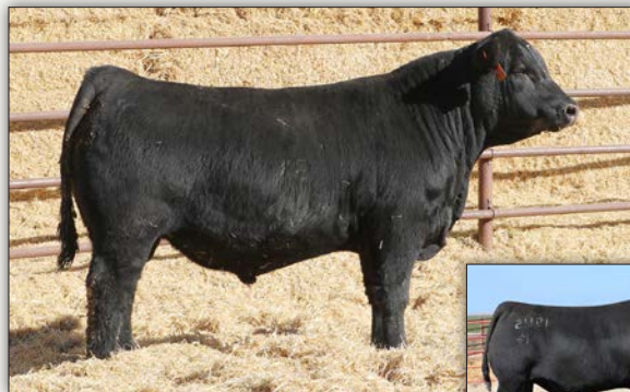
LGR REAL DEAL 3013 - Lot 19