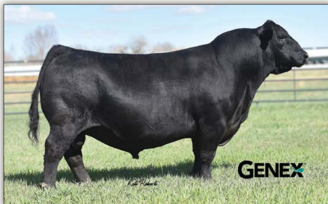
KG JUSTIFIED 3023