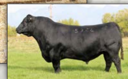
COLEMAN MAVERICK 5322 - Maternal grandsire of Lot 21