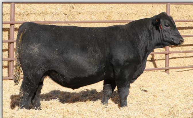
LGR RANGER 3065 - Lot 8