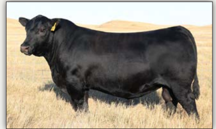
S A V GLORY DAYS 1832 - Full brother to S A V Anthem 0042. Owned by Vermilion Ranch and Schaff Angus Valley.