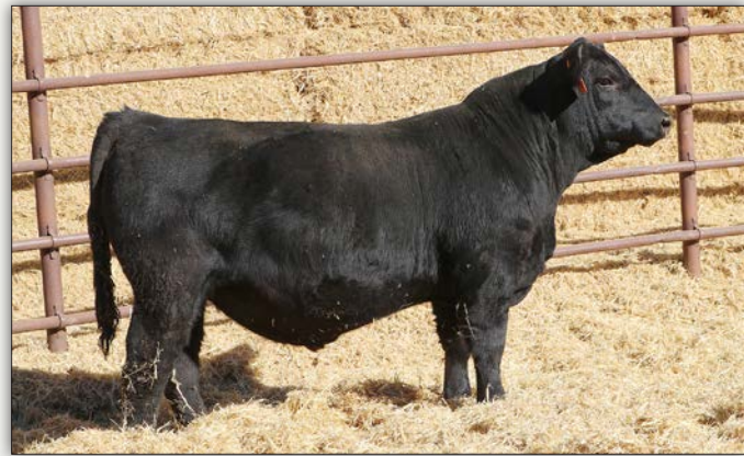
LGR RANGER 3096 - Lot 16