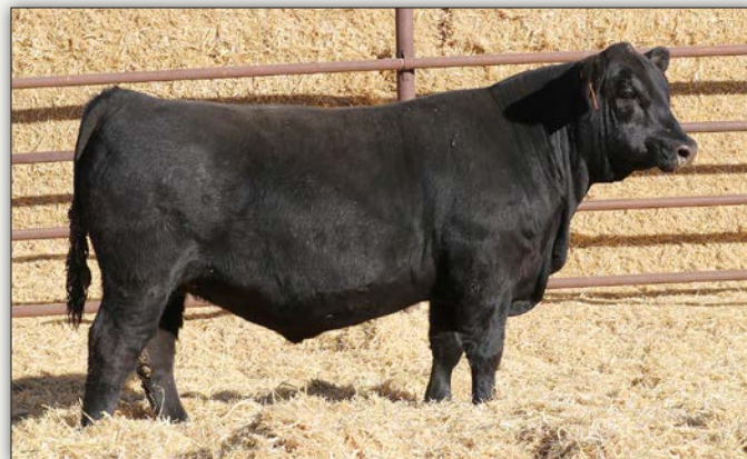
LGR SHERIDAN 3021 - Lot 34