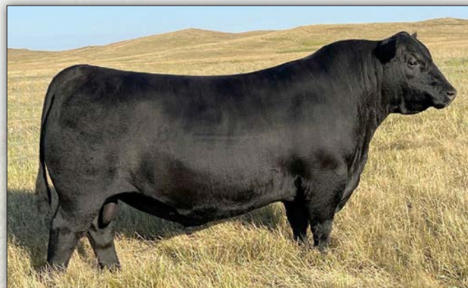
S A V ANTHEM 0042