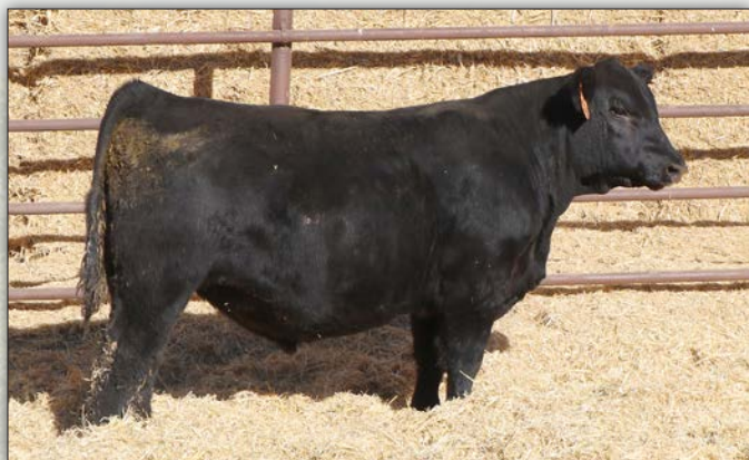
LGR LOGO 3091 - Lot 10