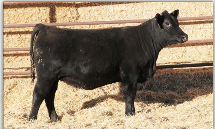
LGR GEORGINA 3068 - Lot 100B