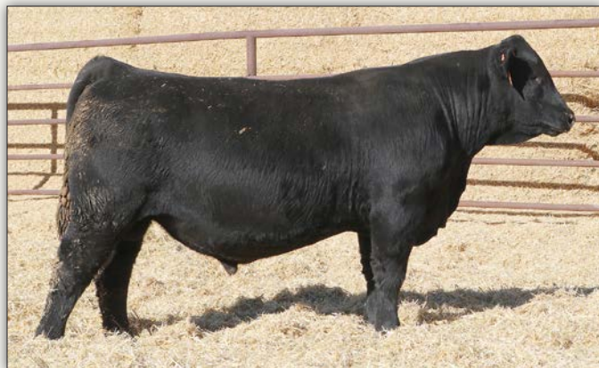
LGR SHERIDAN 3113 - Lot 7