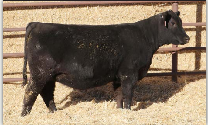
LGR EMBLYNETTE 3073 - Lot 100A