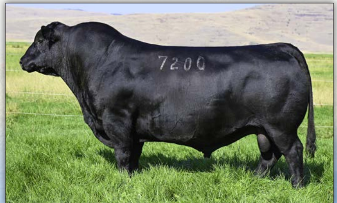
COLEMAN ROCK 7200 - Sire of Coleman Rock 2132

• Rock 2132, a direct son of Coleman Rock 7200, was purchased from Coleman Angus. We used him as a cleanup sire on heifers. Based upon his pedigree his offspring will have low birth weight with explosive growth in a maternal package.