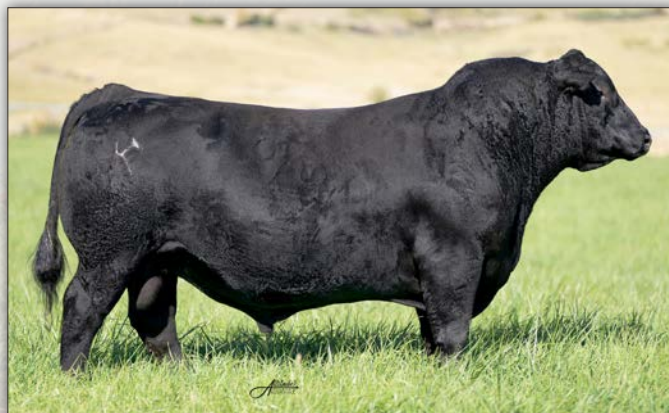
COLEMAN MARSHALL 1162