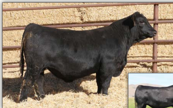
LGR RANGER 3042 - Lot 20