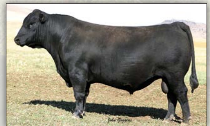
SITZ LOGO 12964 - Paternal grandsire to Lot 18