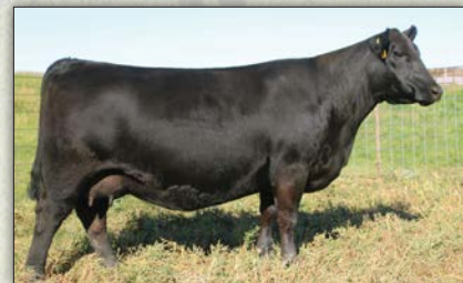
S A V MADAME PRIDE 3145 - Paternal granddam of Lot 4