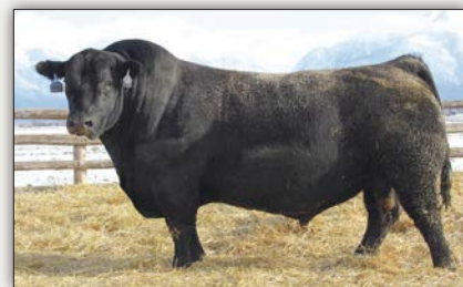
COLEMAN CHARLO 0256 - Maternal grandsire of Lot 3