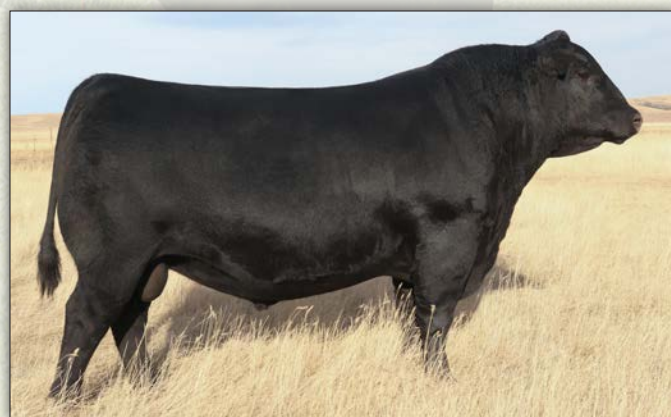
S A V EARLY ARRIVAL 0903