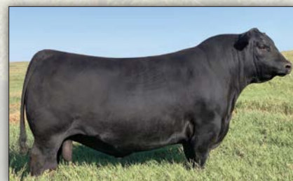
S A V AMERICA 8018 - Paternal grandsire of Lot 4