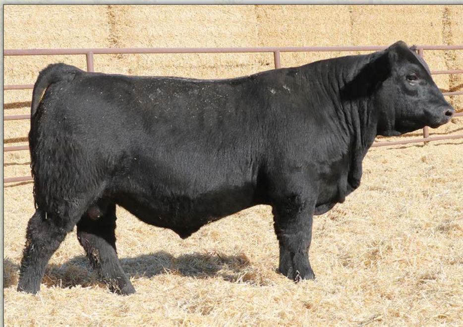
LGR RANGER 3071 - Lot 2