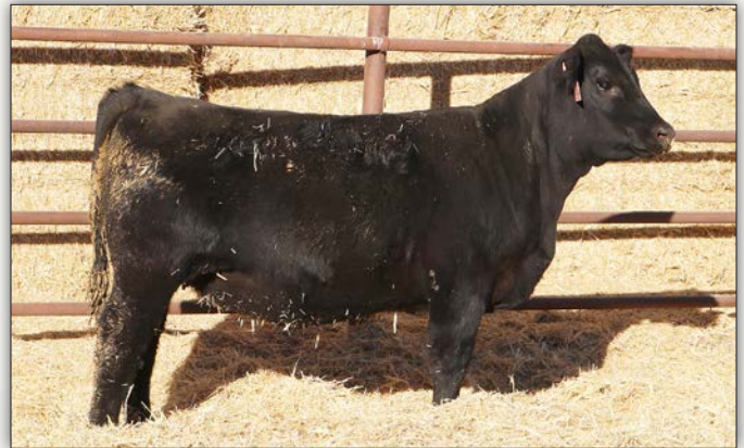
LGR ETHELDA 3046 - Lot 101B