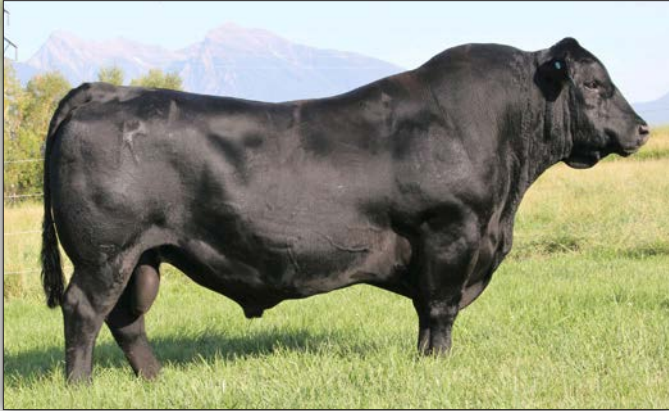
COLEMAN RESOURCE 710