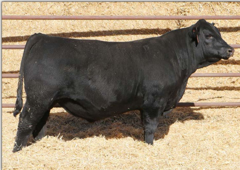
LGR SHERIDAN 3089 - Lot 1