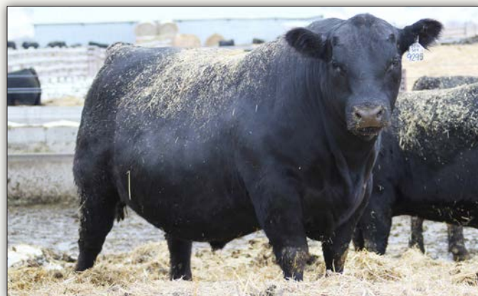
COLEMAN SHERIDAN 9295