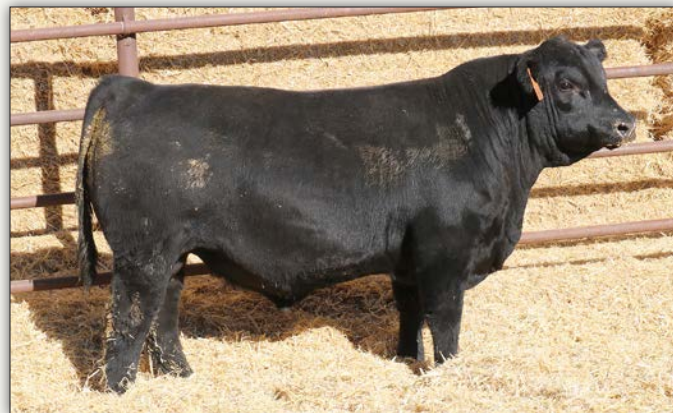
LGR RESOURCE 3111 - Lot 11