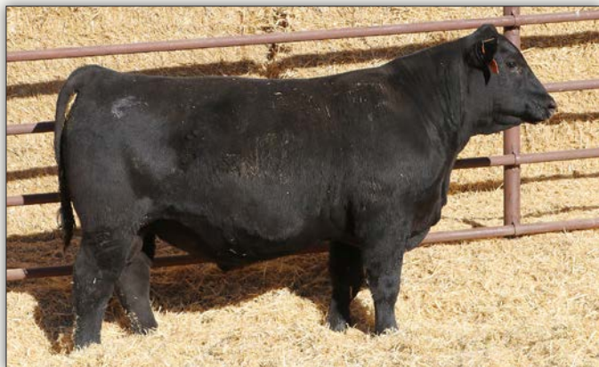
LGR LOGO 3103 - Lot 5