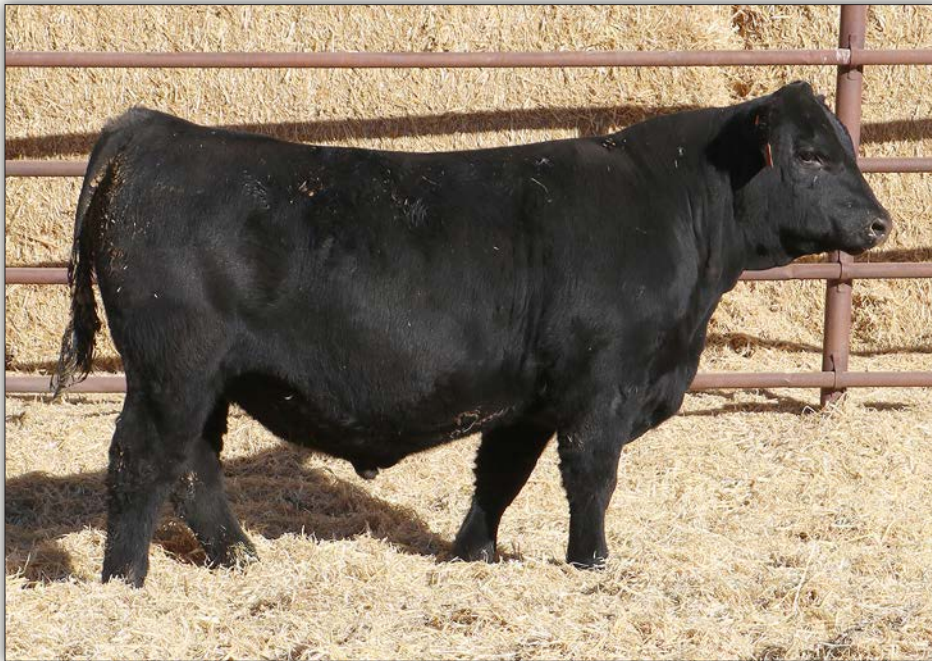
LGR ANTHEM 3127 - Lot 17