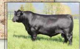
MONTANA EASY RIDER 7005 - Maternal grandsire of Lot 22