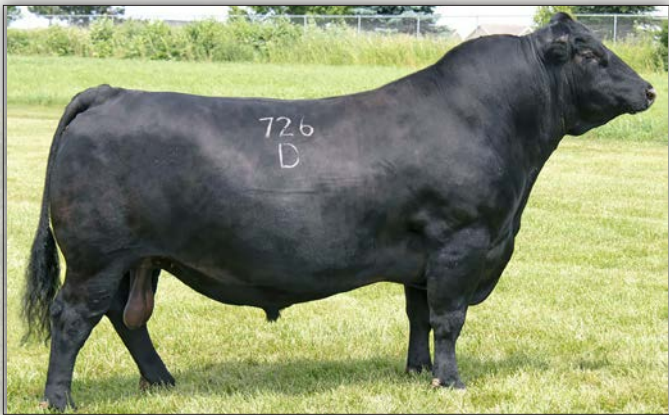
SITZ STELLAR 726D