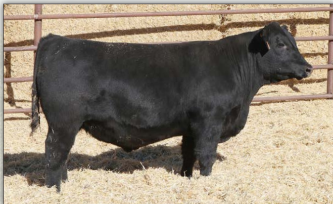
LGR RESOURCE 3069 - Lot 6