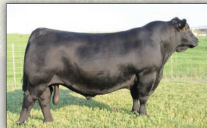
S A V RENOWN 3439 - Paternal grandsire of Lot 2