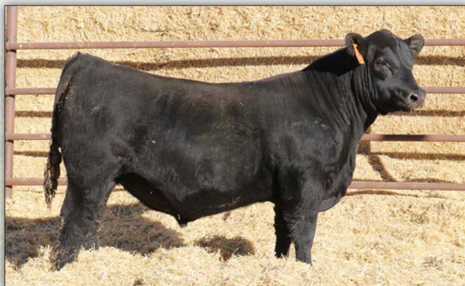
LGR RELOAD 3148 - Lot 39