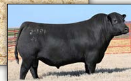
DUFF REAL DEAL 19115 - Sire of Lot 19