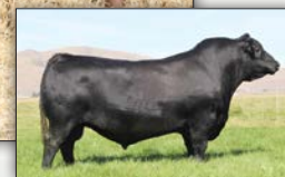
COLEMAN BRAVO 6313 - Maternal grandsire of Lot 20