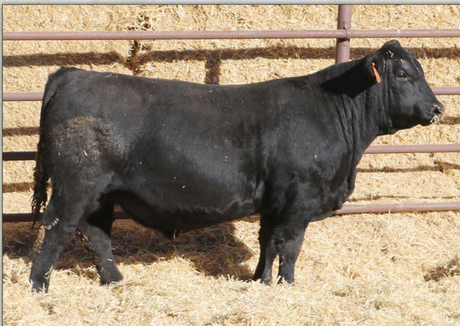
LGR LOGO 3034 - Lot 18