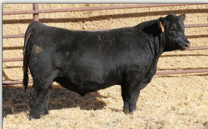
LGR RANGER 3078 - Lot 24