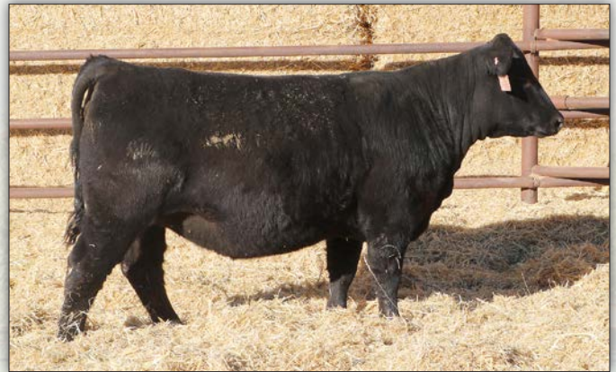
LGR ERICA 3027 - Lot 101C