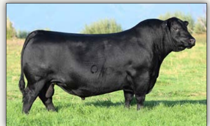
COLEMAN RESOLVE 7219 - Maternal grandsire of Lot 17