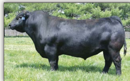
LD CAPITALIST 316 - Paternal grandsire of Lot 3