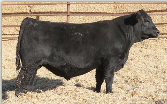
LGR RELOAD 3140 - Lot 42