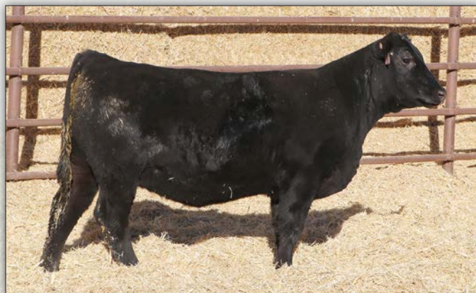
LGR GEORGINA 3141 - Lot 103C