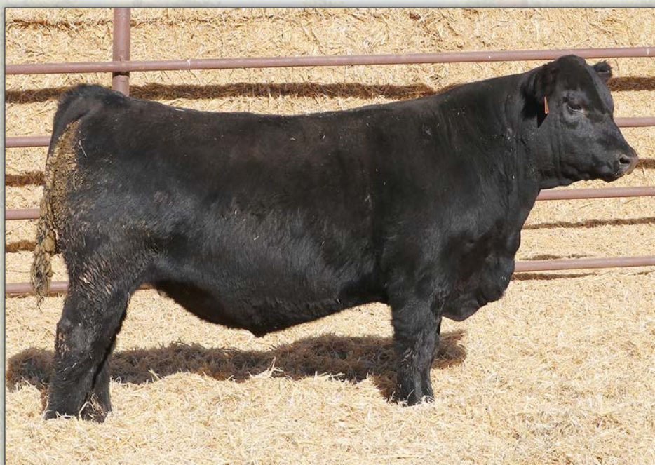
LGR ANTHEM 3052 - Lot 4