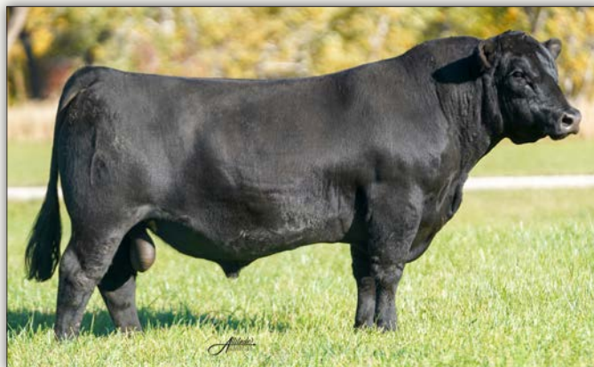
LGR RELOAD 0139