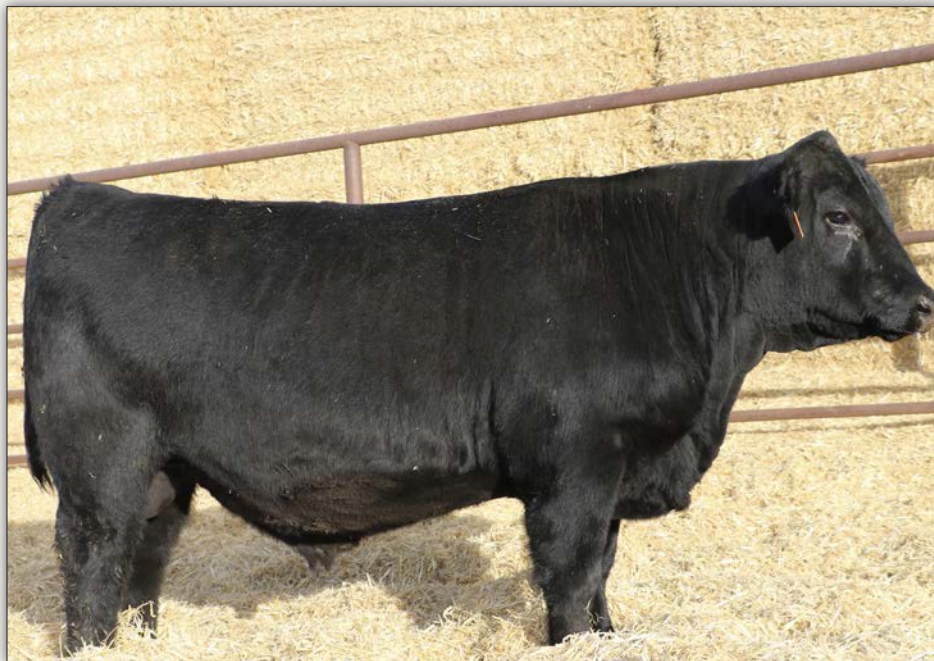
LGR EARLY ARRIVAL 3067 - Lot 3