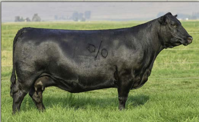
COLEMAN DONNA 7100 - Dam of Logo