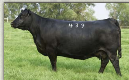
COLEMAN DONNA 439 - Paternal granddam of Lot 2