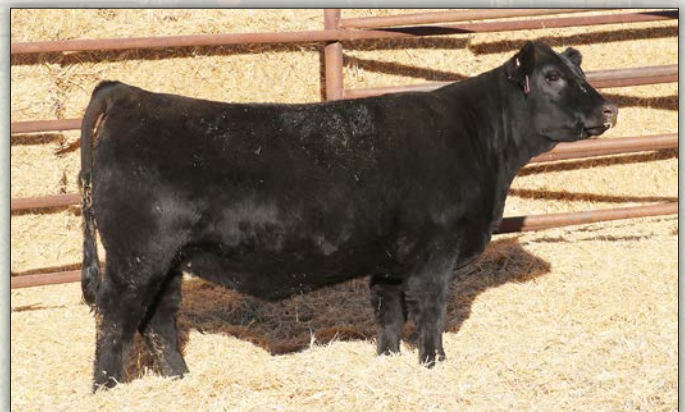
LGR ESTHER 3004 - Lot 100C