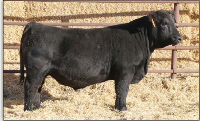
LGR SHERIDAN 3058 - Lot 48