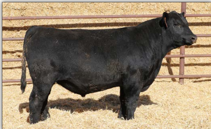
LGR EARLY ARRIVAL 3024 - Lot 9