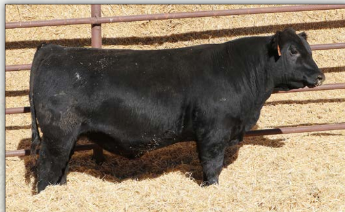
LGR SHERIDAN 3097 - Lot 12