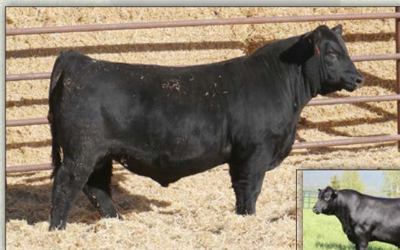
LGR RELOAD 3147 - Lot 22