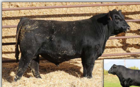
LGR RANGER 3133 - Lot 21