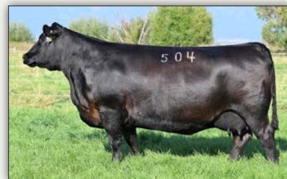
COLEMAN DONNA 504 - Paternal granddam of Lot 1