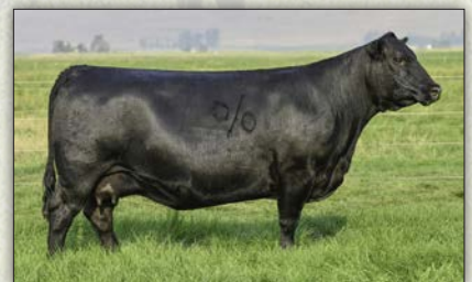
COLEMAN DONNA 7100 - Paternal granddam of Lot 18