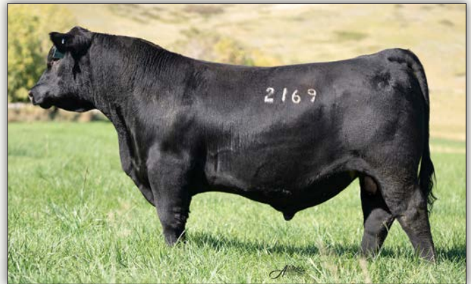
COLEMAN GAUCHO 2169

• Gaucho is the third top-selling bull of his sire group at $40,000 from the 2023 Coleman Angus Sale. We look forward to Gaucho having a significant impact within our herd. His dam is displaying an excellent production record and backed by an old school tried and proven pedigree. His sire, Hummel South America, is an outcross sire that can be used almost anywhere.