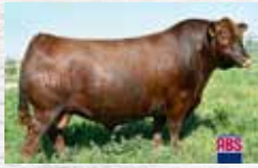
Reference Sire Lots 9-12

ANDRAS FUSION R236 BIEBER CL ATOMIC C218 BIEBER DATELINE 308Y