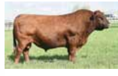
Reference Sire Lots 24-33

LJC MISSION STATEMENT P27 LJC MERLIN T179 BUF CRK REDPRIDE N179