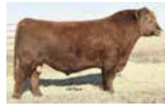
Reference Sire Lots 36-40

A A R TEN X 7008 S A REDHILL TEN X 104U 190A RED HILL B571 BARMAID 104U