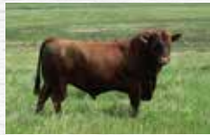
Reference Sire Lots 21-23

BUF CRK THE RIGHT KIND U199 PIE ONE OF A KIND 352 PIE FAYETTE 1160