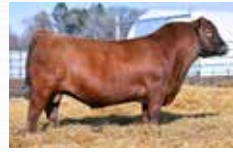
Reference Sire Lots 13-20

BIEBER ROLLIN DEEP Y118 RREDS SENECA 731C RREDS ASTER 309A