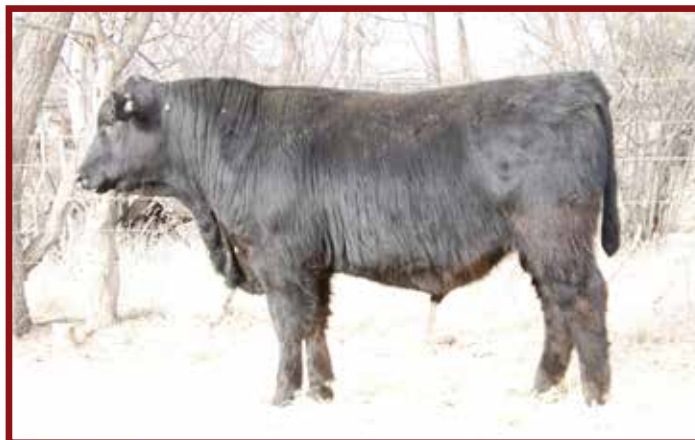
Black Red Carrier- One of the more powerful Jefferson bulls posting a 117 WR! Top 1% CW and top 1% REA EPDs!