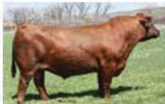
Reference Sire Lots 41-46

BECKTON DOMINOR Z1 R610 BECKTON DOMINOR T122 Z1 BKT LARKABEL R038 WA