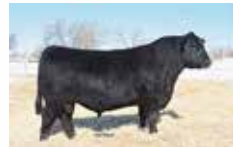
Reference Sire Lots 47-49

BASIN FRANCHISE P142 SPUR FRANCHISE 7070 H&H L&C LADY BEHAVE 5040