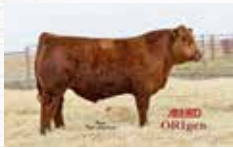
Reference Sire Lots 34-35

WS BEEF KING W107 WS ALL-AROUND Z35 CDI MS HIGH ROLLER 39W