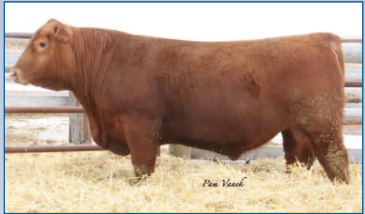
LOOSLI SPARTACUS 107

This is a full flush brother to Lot 2, just a different recipient dam. Same genetics with a great EPD profile.