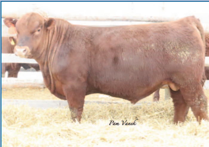
LOOSLI SPARTACUS 129 • LOT 6