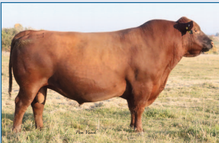
BROWN CSB TRIAD D6451 • SIRE OF LOT 8