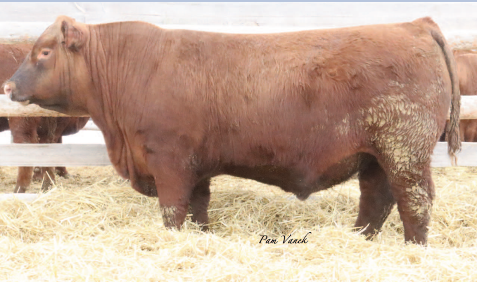
LOOSLI ULTIMATUM 123 • LOT 3