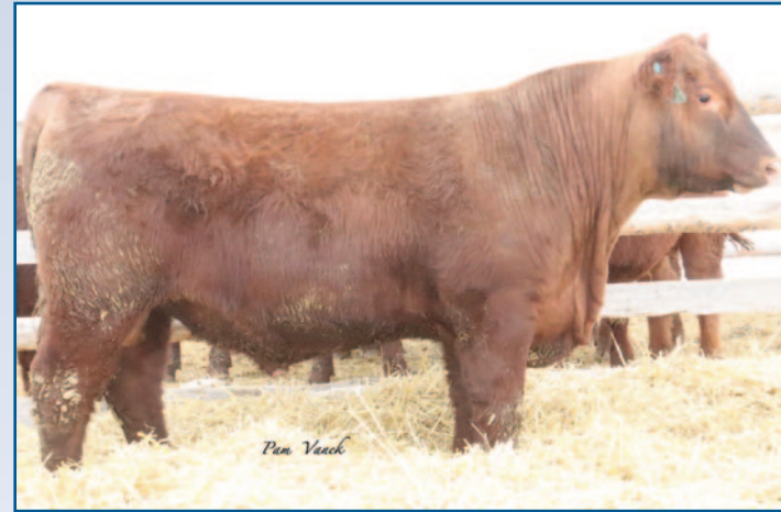
Loosli Ultimum 126 • Lot 50