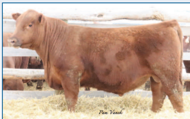
Loosli Triad 1186 • Lot 76

— EPD Averages for Non-Parents Under Two Years of Age —