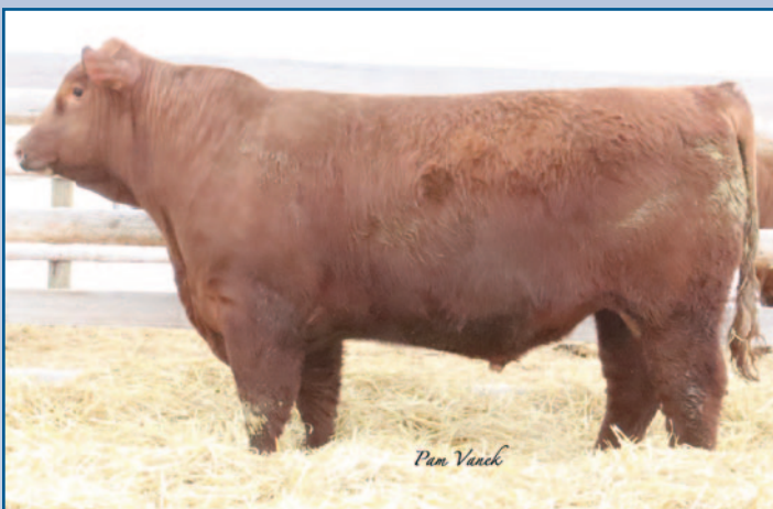
Loosli Triad 140 • Lot 58