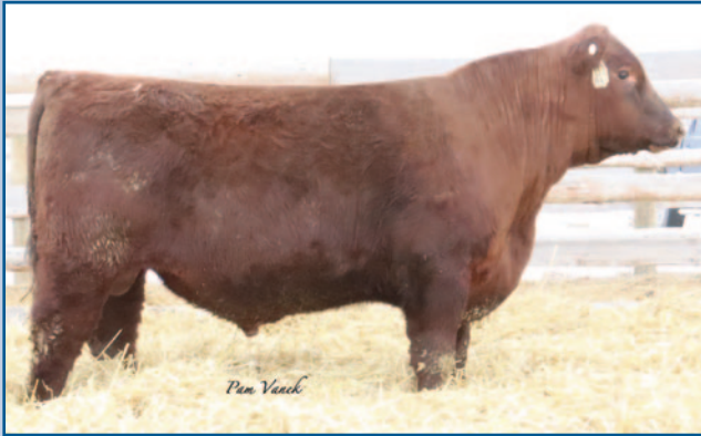
Loosli Triad 193 • Lot 67