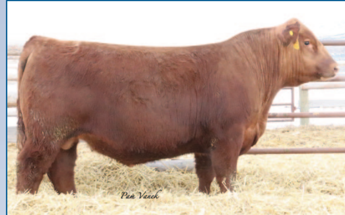
Loosli Driven 1142 • Lot 48