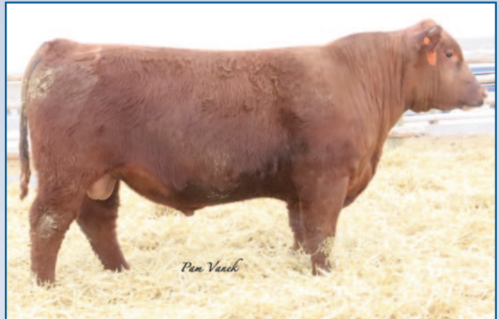
LOOSLI SPARCATUS 128 • LOT 46

This is really a nice combination of Bourne x Spartacus. We expect great progeny from this bull with his balanced EPD package.