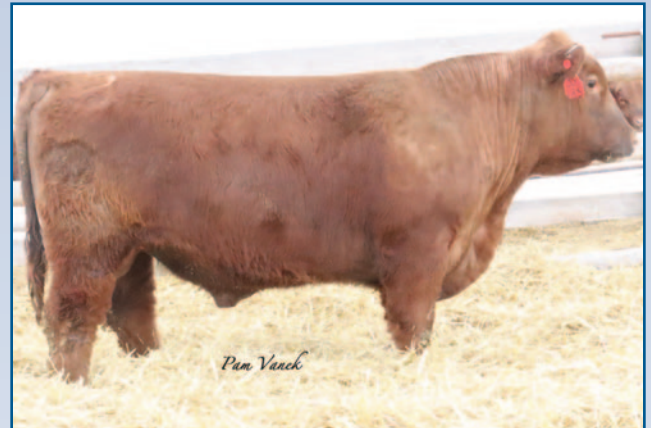
LOOSLI STILLWATER 185 • LOT 109