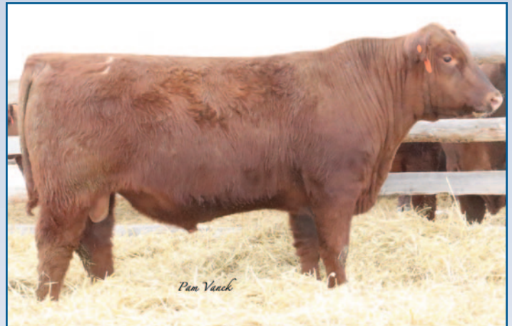
Loosli Spartacus 127 • Lot 54