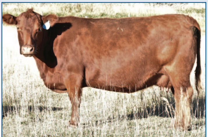
MISS LOOSLI RIGHT DESIGN 329 • DAM OF LOT 2