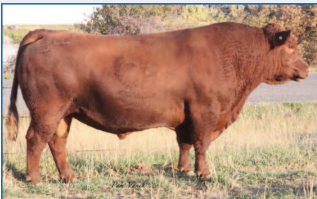
FEDDES FRONTLINE C16-8218 • REF SIRE F