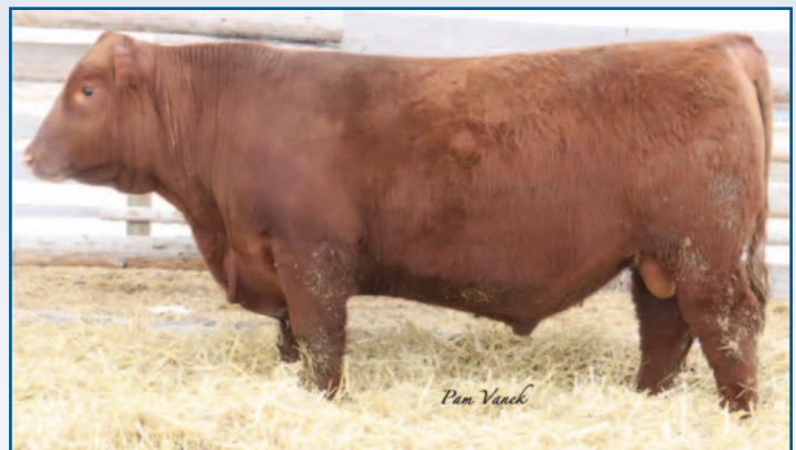
LOOSLI STILLWATER 183 • LOT 11

You will notice this bull the moment you walk into the pens. He has that total herd bull look with amazing numbers to match. Out of a 105 MPPA dam that has a perfect record on her calves and a flawless udder. Check the boxes with 10 EPDs in the top 25%. His Outstanding ProS number of top 8%, marbling 5%, ribeye 6%, and WW and YW of 5% and 6% respectively reveal the profitability this Stillwater son has.