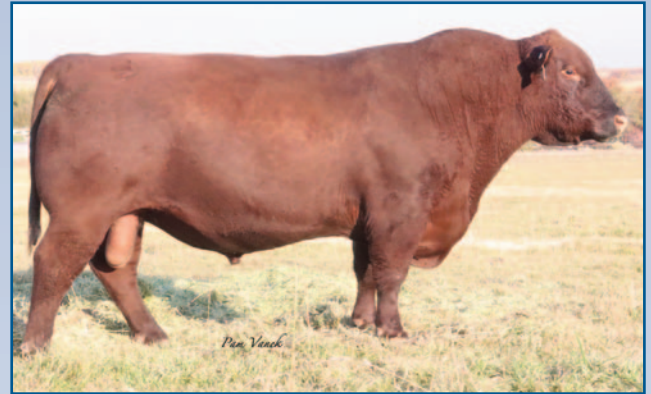
ANDRAS BOURNE SILVER E016 • REF SIRE G