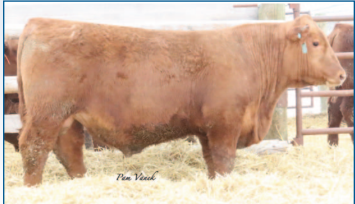
LOOSLI ULTIMATUM 1179 • LOT 65

— EPD Averages for Non-Parents Under Two Years of Age —