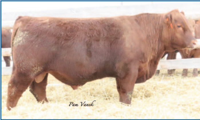
Loosli Frontline 1150 • Lot 77