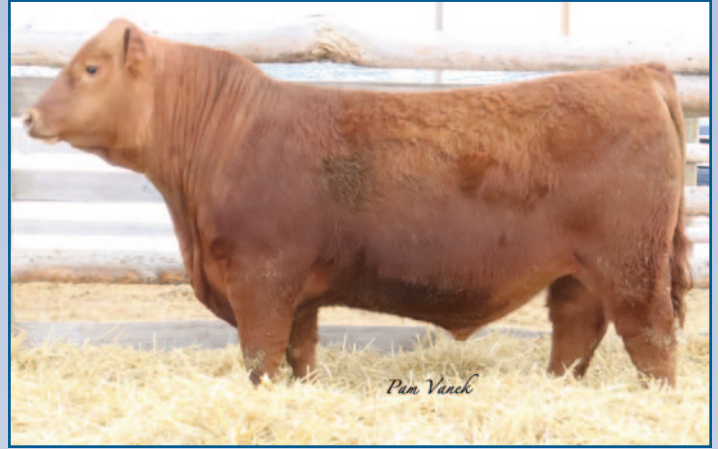
LOOSLI TRIAD 1168 • Lot 31

This is a really nice bull with exceptional length. You will want to keep all of his daughters with his 18 STAY EPD. His indices for ProS and HerdBuilder are a top 5% and 4% respectively.