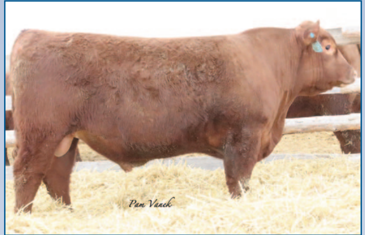
Loosli Summit 163 • Lot 53