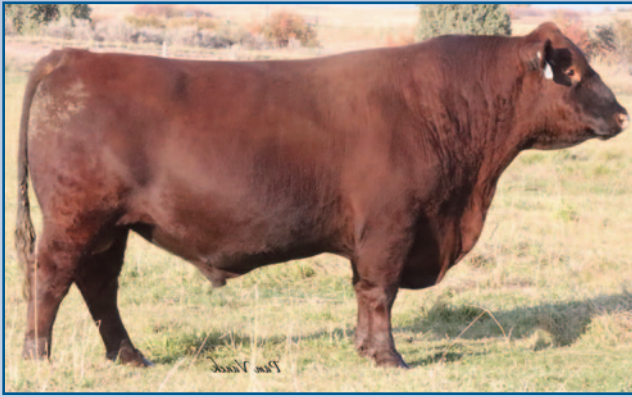
5L ULTIMATUM 3004-442F • REF SIRE C