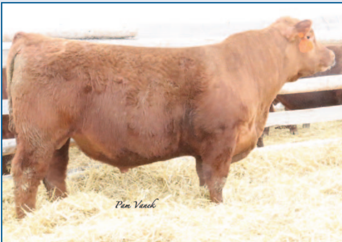
LOOSLI SPARTACUS 103 • LOT 43

Triad bulls are becoming known as calving-ease specialists. This bull will maintain that tradition with both a top CED and BW EPD in that single digit status. He also adds great merit to his profile with strong growth EPDs. If you want something to moderate your birth weight and frame scores plus add some length, take a look here.