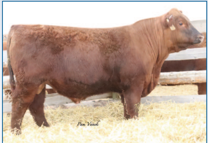
LOOSLI TRIAD 132 • LOT 47

This bull is a half-brother to Lot 45 with 8 EPDs in the top 15% of the breed. Out of a 105 MPPA dam. He is another spread bull with a -4 BW EPD to 114 YW EPD. With his top 5% marbling EPD, his steers will be in great demand.