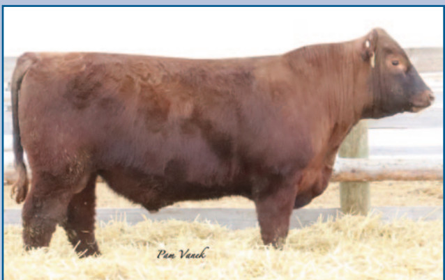
Loosli Triad 105 • Lot 96