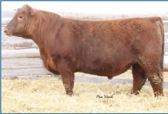
LOOSLI SHADE 1106 • LOT 34