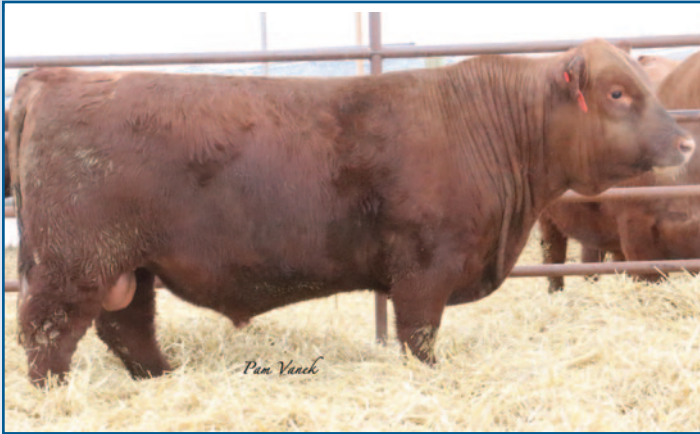
Loosli Stillwater 1131 • Lot 80