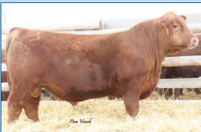
Loosli Spartacus 150 • Lot 59