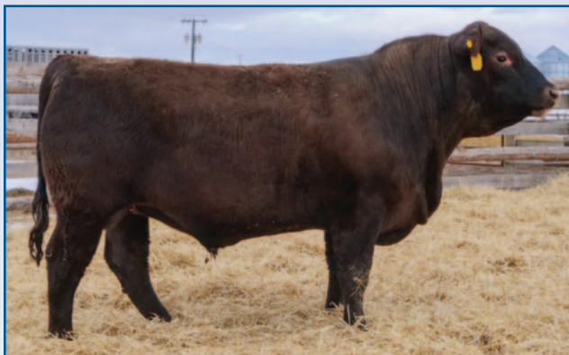
LOOSLI SUMMIT 956 • REF SIRE A