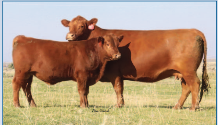
LOOSLI SPARTACUS 175 WITH DAM • Lot 39

You can see why this bull will add pounds to your calf crop. He has tremendous growth and carcass numbers. His performance ratios of 109 weaning and 115 yearling are a good sign of how his progeny will perform.