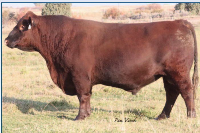
5L ULTIMATUM 3004-442F • PATERNAL BROTHER TO LOT 3

Big-time herd bull prospect with great data and excellent phenotype to back it up. He has been a favorite all summer long and continues to check every box along the way. His dam is a great cow out of the Loosli Riverside 414 bull. His sire is the popular 5L Ultimatum 1893-03C that has produced excellent cattle throughout the country. We are currently using two Ultimatum sons that are producing some of our very best cattle. This bull might be the best son yet! He is loaded with growth EPDs and carcass traits that every packer will want. Top that off with a set of maternal traits that will let you keep every female.