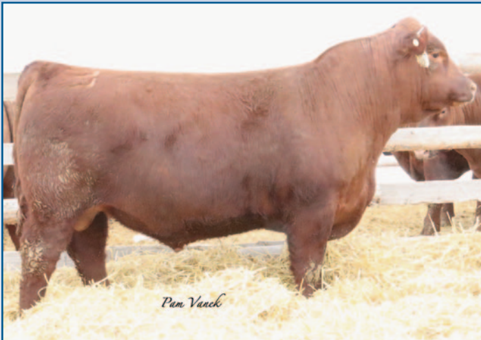
LOOSLI TRIAD 122 • LOT 42

We really like the look and quality of our Stillwater calves. We are calving his first daughters now and they are great mothers with excellent udders. This bull is out of a 12-year-old Hobo Design cow with a perfect caving interval of 366 days on her 10 calves. This bull ranks in that elite status for both ProS and HerdBuilder with indices of 1% and 2% respectively. Perfect EPDs for making replacement daughters and prime quality steers.