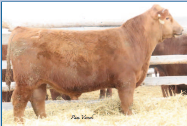
Loosli Triad 1162 • Lot 89