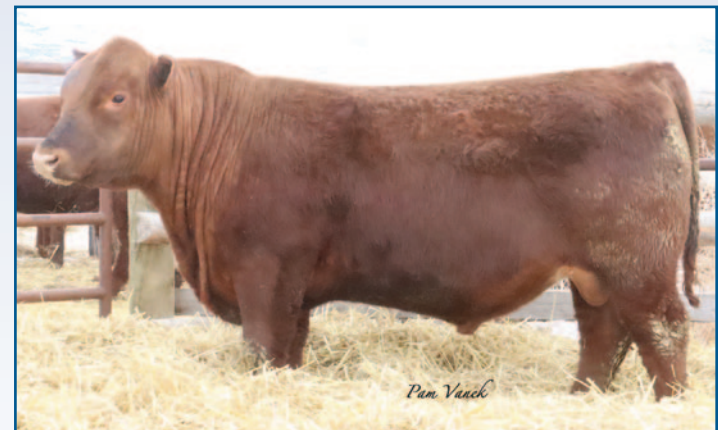
Loosli Spartacus 110 • Lot 56