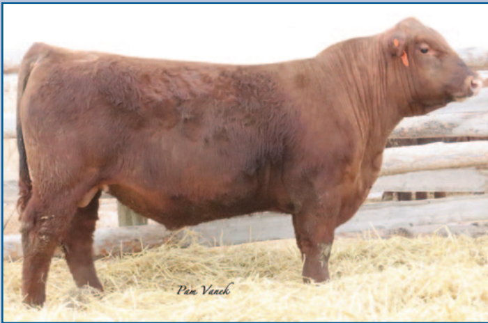
LOOSLI SPARTACUS 139 • LOT 28