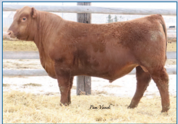
LOOSLI SPARTACUS 106 • LOT 10

Full flush brother to Lot #2 and has the lightest birth weight of the entire flush. Has a great phenotype. He could be the most complete heifer bull out of this mating with outstanding maternal traits as well as carcass to improve the entire cow herd.