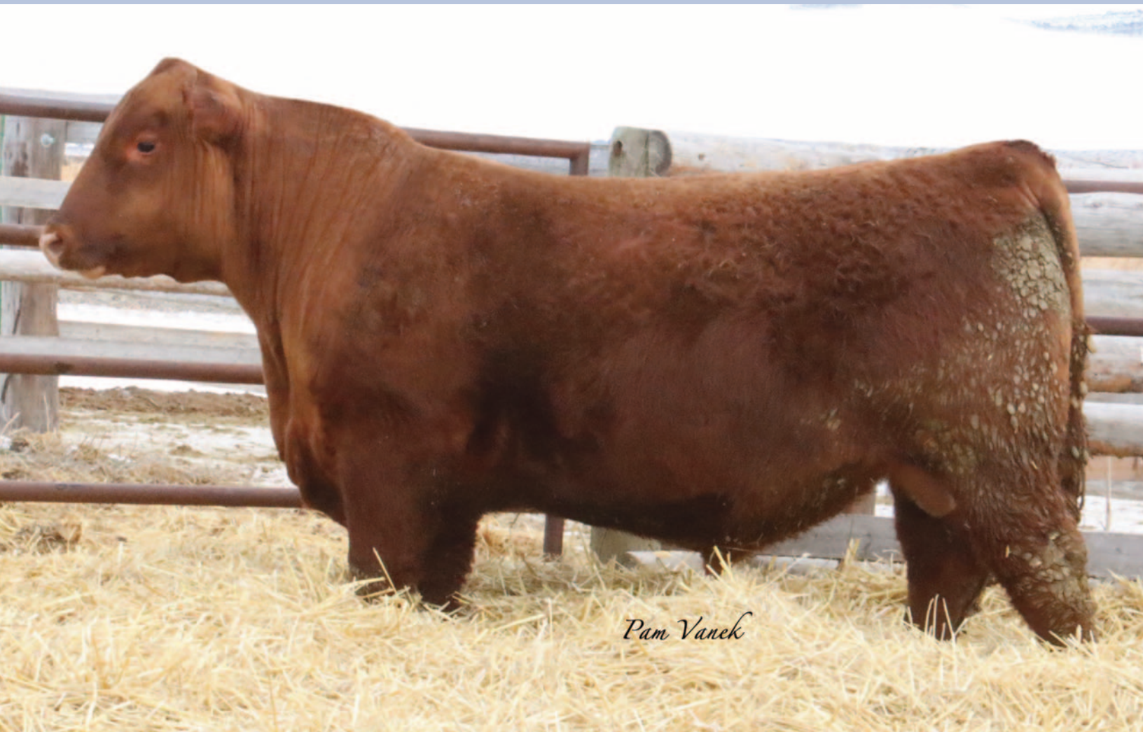
LOOSLI SPARTACUS 102 • LOT 2