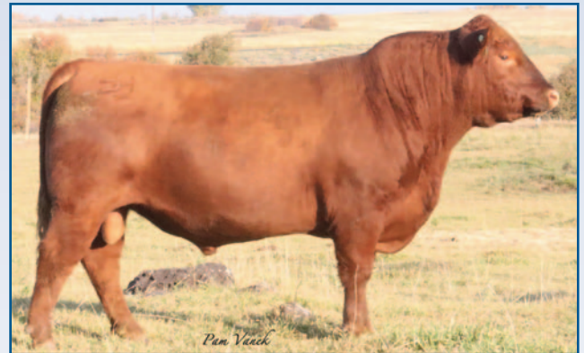
5L PROFITEER 1117-15G • REF SIRE I