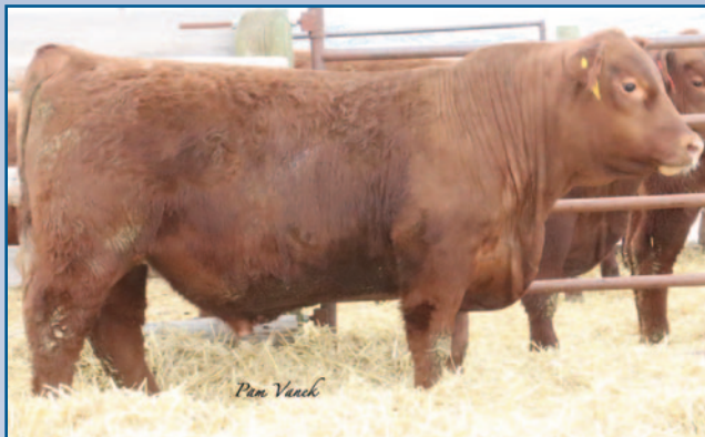
Loosli Porter 1108 • Lot 73