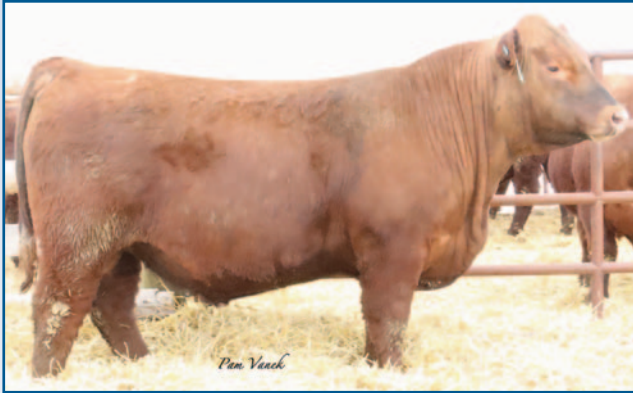
Loosli Ultimatum 1154 • Lot 69