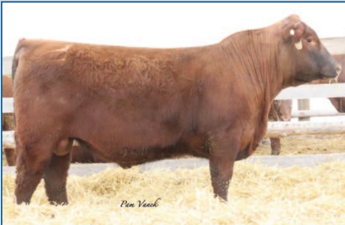
LOOSLI TRIAD 195 • LOT 13

This deep made bull offers one of the most balanced EPD tabulations of the entire sale. Out of one of our best cow families. He offers such great mating flexibility whether you need calving ease, growth, or carcass. In our books, this 107 MPPA dam has started out her career at elite status.