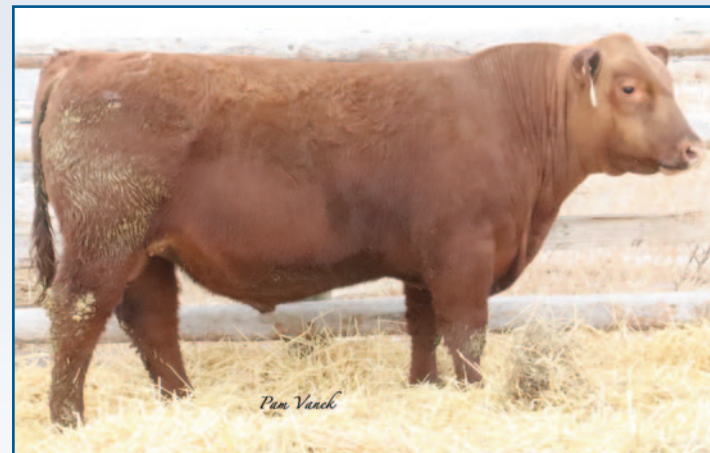
LOOSLI CAMBRIDGE 155 • Lot 23

You will like everything you see in this stout-made bull. He is solid from head to tail with plenty of length, thickness, and depth in-between. He comes from a top end cow line with his maternal granddam being one of the most consistent cows we have ever owned.