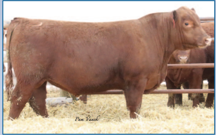
LOOSLI SUMMIT 1107 • Lot 37

This might be the most complete Summit bull to sell today... a great herd builder! His EPD profile indicates that he is balanced in every trait and is the type of bull the industry is looking for. He has the right mix of carcass trait with marbling and ribeye. And the maternal traits of Stay, CEM, HPG and Milk that allows for a well-balanced herd.