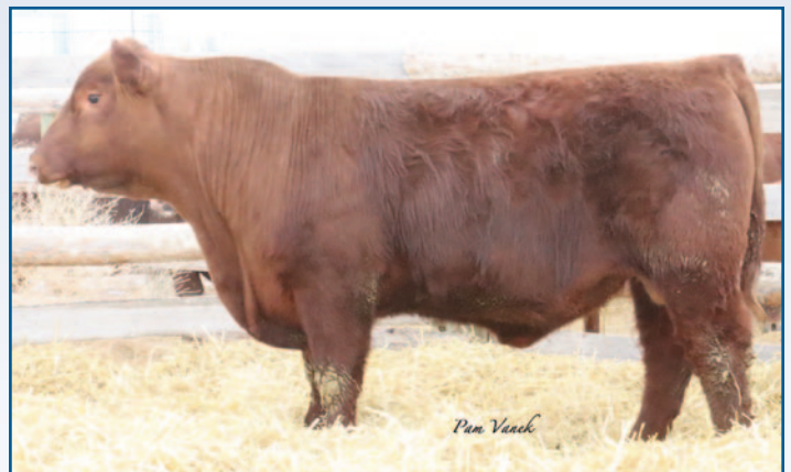
LOOSLI ULTIMATUM 1111 • Lot 33

A really nice, low birth weight bull. Should work well on heifers and produce some exceptional females. Outstanding EPDs for STAY, CEM, HPG, and Milk. HerdBuilder Index in the single digits.