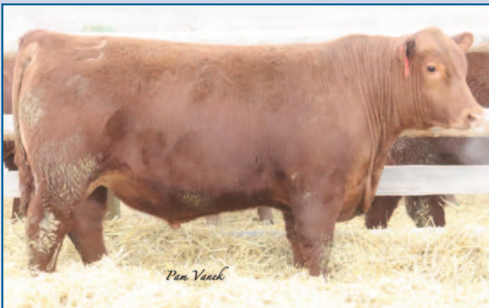
LOOSLI SILVER 1110 • LOT 35

Another solid heifer bull with the same traits as Lot 33 with added Growth EPDs of WW and YW. He also has a good mix of marbling to add to all those balanced traits.