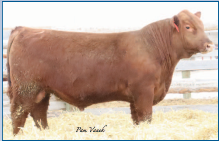
LOOSLI STILLWATER 159 • LOT 61