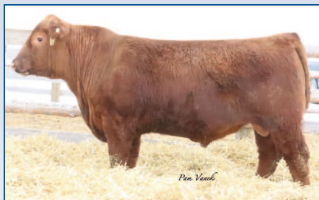
Loosli Triad 149 • Lot 75