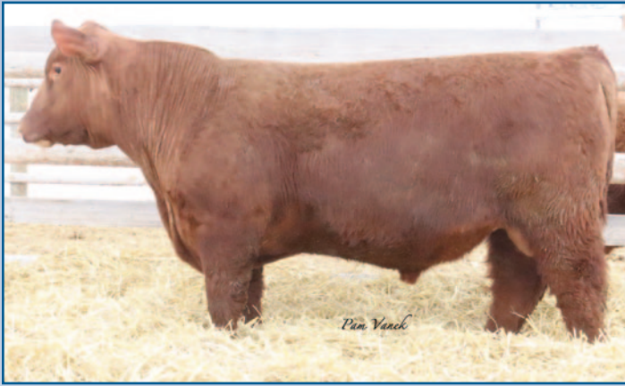
LOOSLI STILLWATER 118 • LOT 41