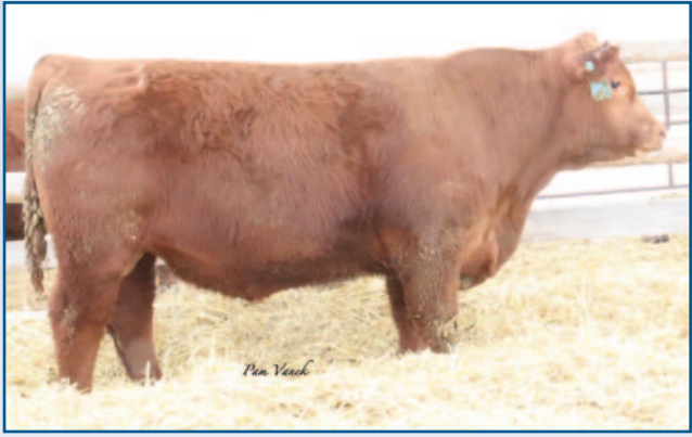
Loosli Profiteer 1182 • Lot 99