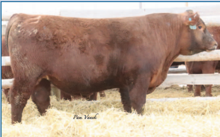
LOOSLI SUMMIT 177 • LOT 7

You will like the looks of this combination of Spartacus and Riverside. A great pairing. Note the tremendous length and style in this bull. The single digit carcass weight EPD and a host of great carcass EPDs will demand premiums at the sale ring.