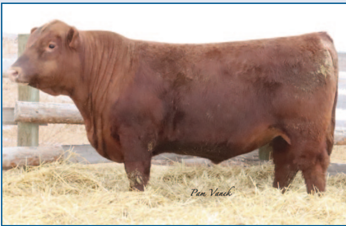
LOOSLI SPARTACUS 100 • LOT 14

Here is one of the best heifer bulls to be offered today. Complete calving-ease with that special curve bender growth. You get it all with top CED, WW, YW, ADG, Milk, and CEM with the added bonus of a 62-pound birth weight and single digit ranking for BW. Rarely do you have 11 traits in the top 25% of the breed.