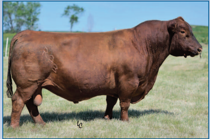
BIEBER SPARTACUS A193 • SIRE OF LOT 15

A long and deep Spartacus son out of a great cow family. Calving ease is highly visible with the Single digit CED, BW, and CEM all at the top 1%. Not to mention the above breed average growth for both WW and YW EPDs.