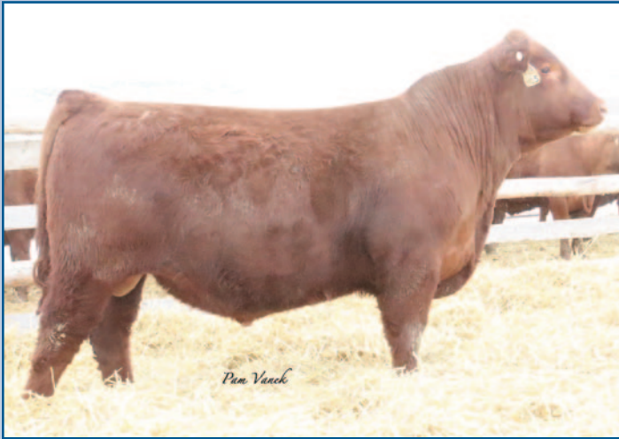
LOOSLI TRIAD 1105 • LOT 12