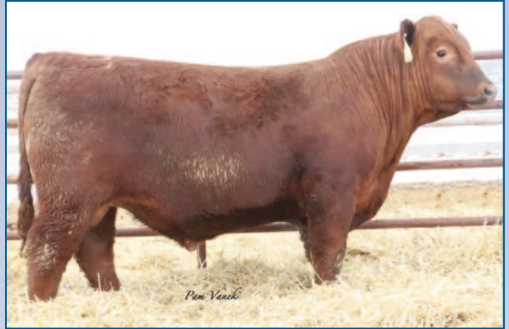
LOOSLI TRIAD 112 • Lot 24

This herd bull is at the top of his class with both ProS and HerdBuilder indexes at a top 2% ranking. He doesn't just stop there with single digit growth traits, single digit fertility and a complete balanced package with a single digit marbling. The performance numbers of this dark red bull are just as good with a 114 Weaning ratio, starting out with a 76-pound birth weight. This explains his top ranking for both WW and YW EPDs. Out of a solid 106 MPPA Ultimatium daughter.