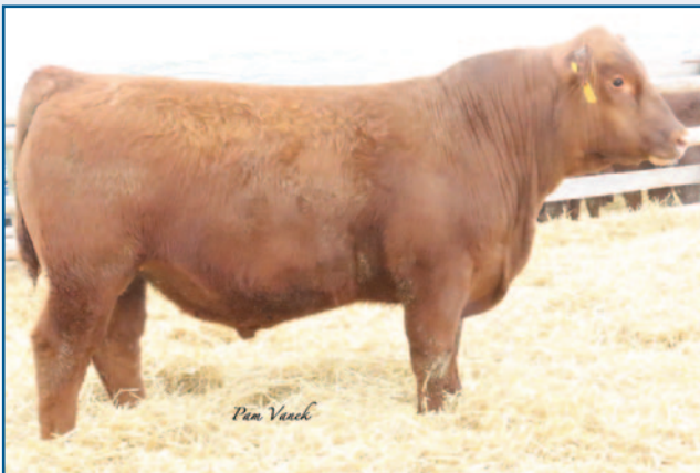
Loosli Porter 1174 • Lot 106