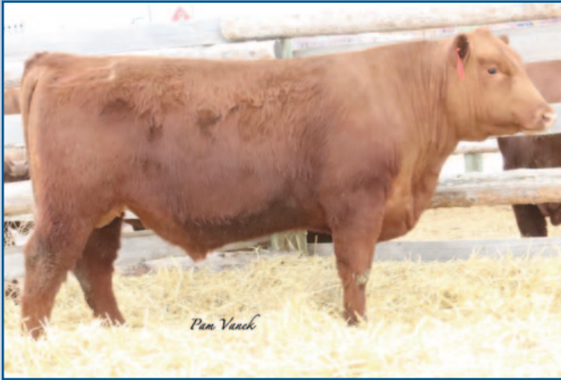
Loosli Stillwater 1127 • Lot 103