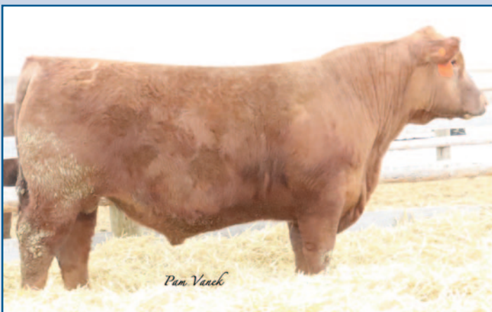
LOOSLI SPARTACUS 161 • LOT 29

We hear so many comments about the great disposition of our cattle. This is one of those bulls that wants to be scratched and patted. He will actually find you when you step into his pen. He has a great pedigree coming from one of our best lines of cattle with the 4 generations of dam's MPPA's of 102, 107, 105, 103. A balanced set of EPDs go with this pedigree.