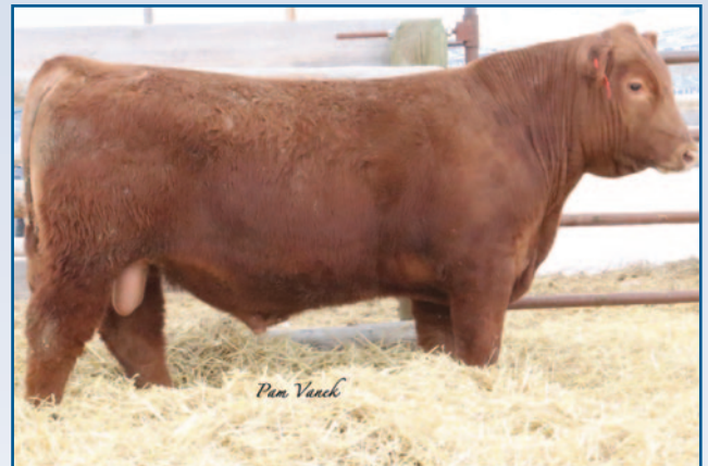
LOOSLI STILLWATER 1158 • LOT 110