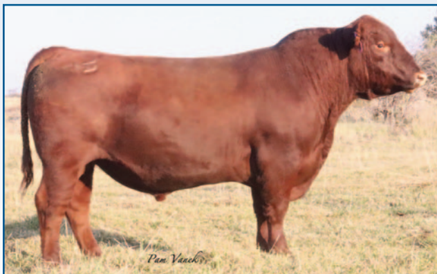
LSF SRR X-PORTER 9129G • REF SIRE B