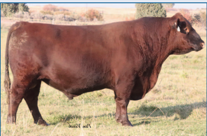
5L Ultimum 3004-442F • SIRE OF LOT 60