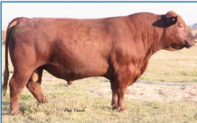
FEDDES STILLWATER B70-8233 • REF SIRE E