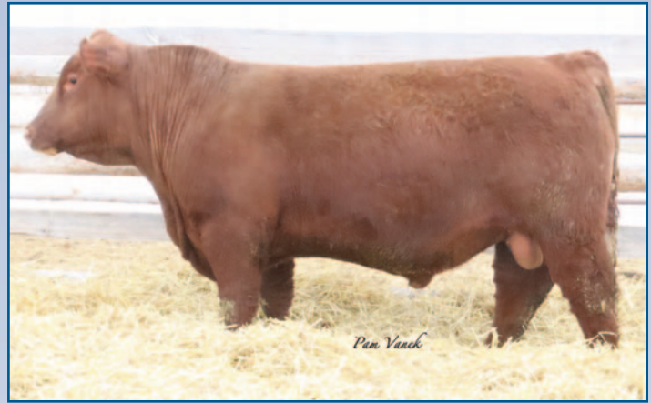
LOOSLI STILLWATER 130 • LOT 9

Check out these numbers! This bull could be the lead-off bull for many sales throughout the country. He has both the look and numbers to rank as one of the top Red Angus sons to sell this season. There is probably not a better EPD package that will sell today. Out of one of our best females that has a solid 104 MPPA on her first 3 calves. This combination of Born and Stillwater is exactly what we expected with 10 EPD's in the top 16% of the breed. A stunning phenotype matches his data to make him a bull we are breeding for.