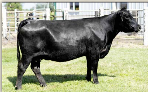
Meadow Acres 0235