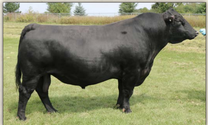
Mohnen Substantial 272