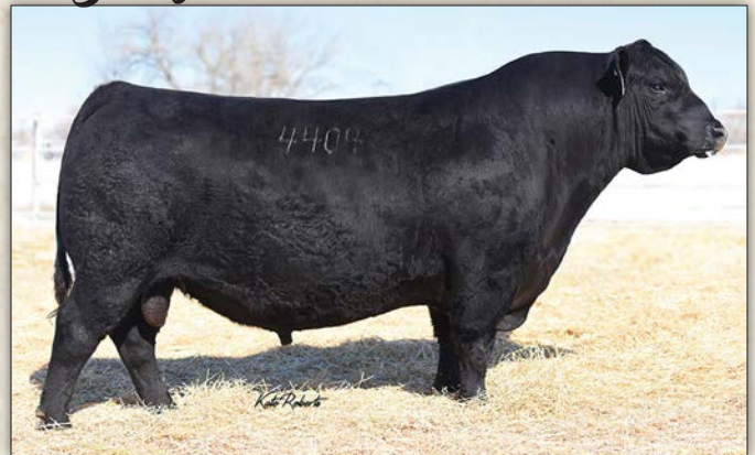
Basin Rainmaker 4404