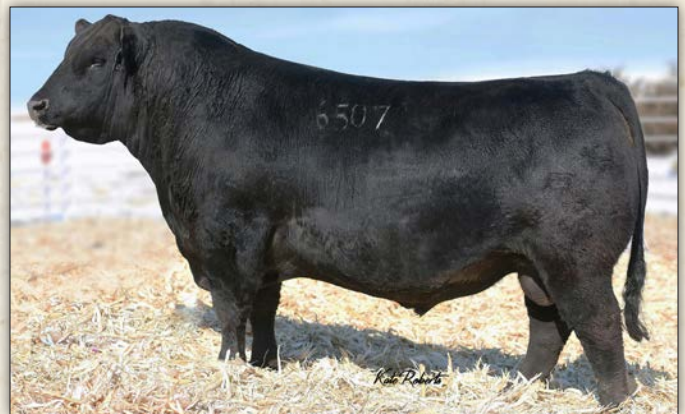
ZWT Summitt 6507