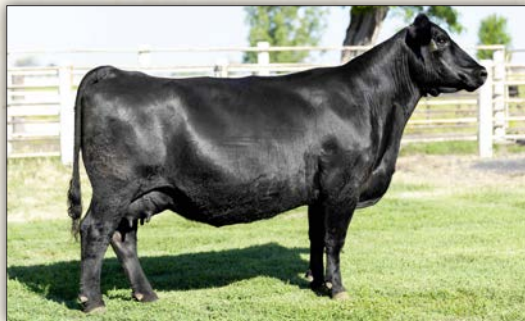
Meadow Acres Blackcap 210