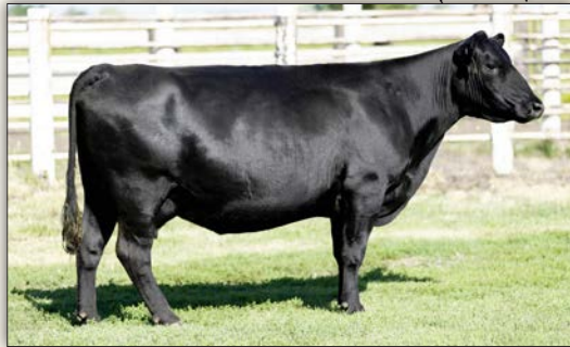
Meadow Acres Blackbird 719