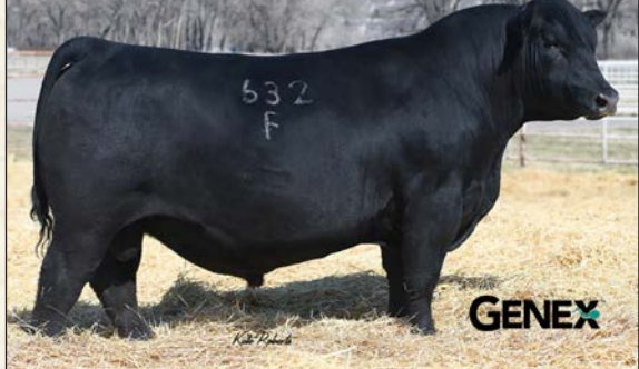
Sitz Barricade 632F