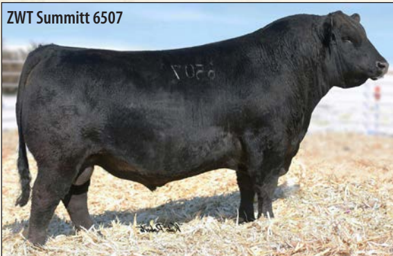
ZWT Summitt 6507