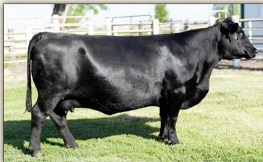
Meadow Acres Miss 8222