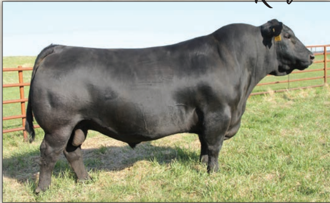
SAV Resource 1441