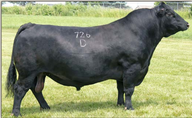
Sitz Stellar 726D