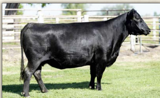
Meadow Acres Formera 8202