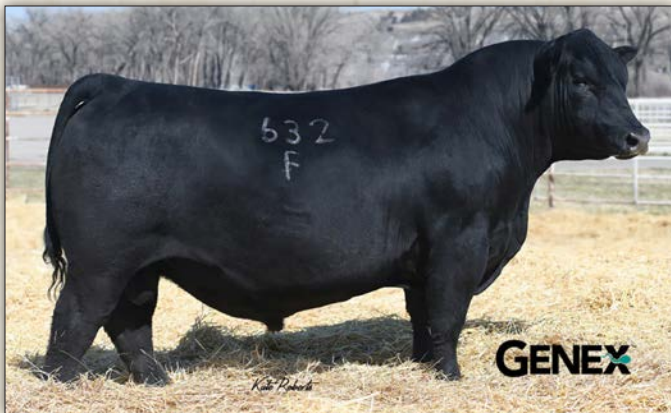
Sitz Barricade 632F