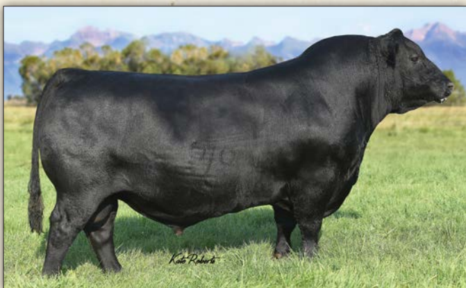
Coleman Bravo 6313