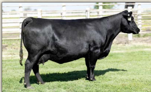
Meadow Acres Blackbird 3112