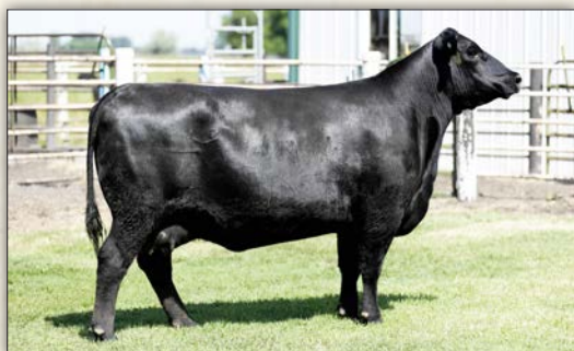
Meadow Acres Blackcap 968