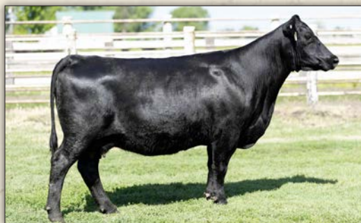
Meadow Acres Erica 2248 7200