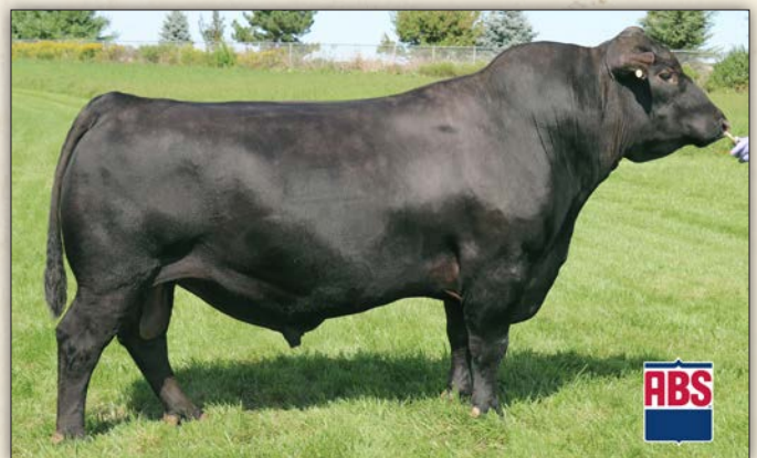
Spring Cove Crossbow