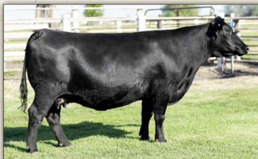
Meadow Acres Lass 665