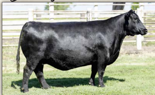
Meadow Acres Pride 810