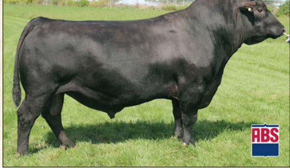
Spring Cove Crossbow