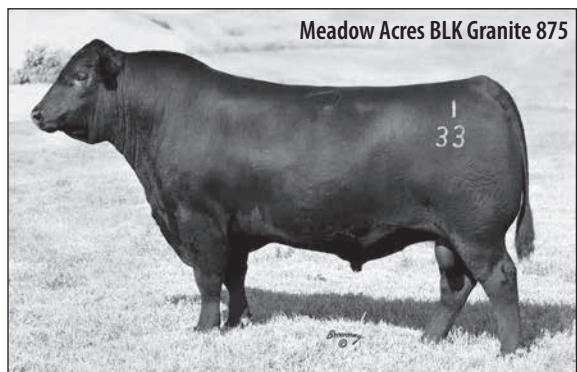
Meadow Acres BLK Granite 875