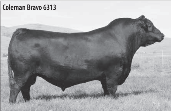
Coleman Bravo 6313