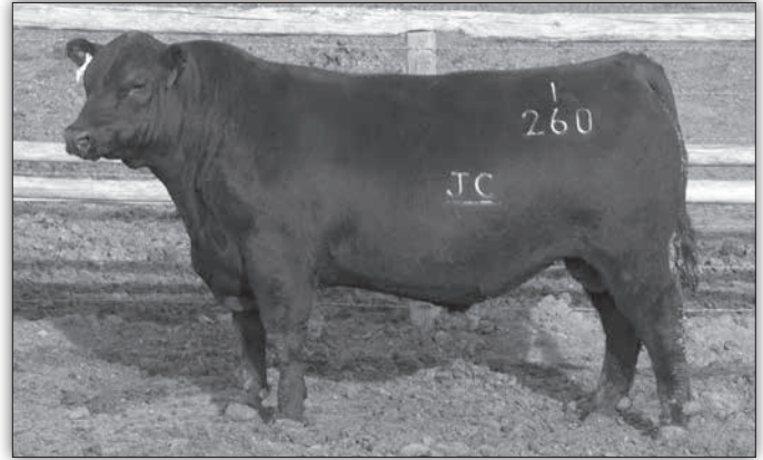
MEADOW ACRES SUMMITT 1260 - Lot 15