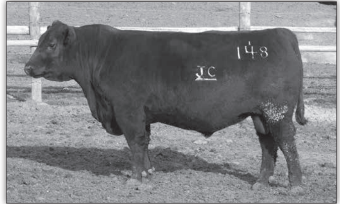
MEADOW ACRES CEDAR 1148 - Lot 81