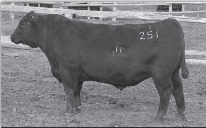
MEADOW ACRES SUMMITT 1251 - Lot 13