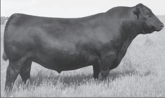
S A V Rainfall 6846