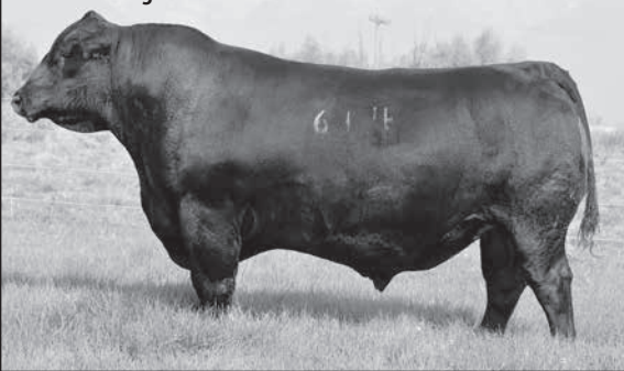
Coleman Navigator 614