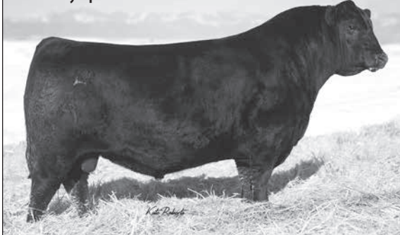
HA Cowboy Up 5405