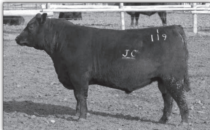
MEADOW ACRES BRAVO 1119 - Lot 3