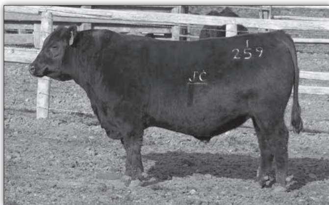
MEADOW ACRES BRAVO 1259 - Lot 9