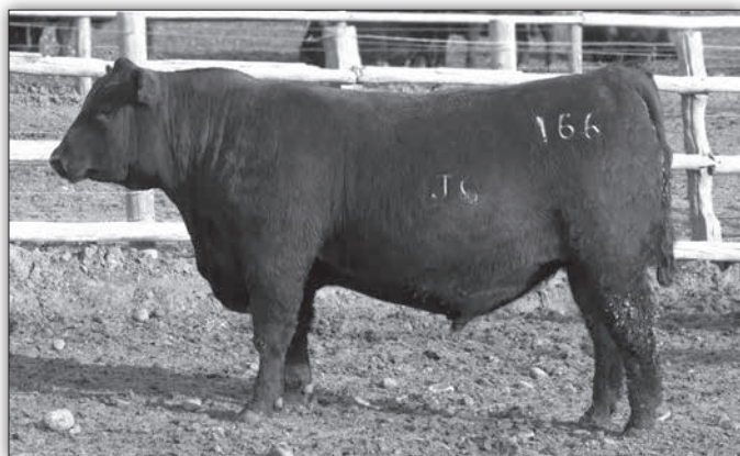
MEADOW ACRES BRAVO 166 - Lot 2