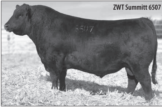
ZWT Summitt 6507