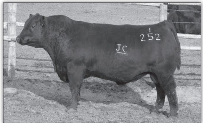
MEADOW ACRES SUMMITT 1252 - Lot 14