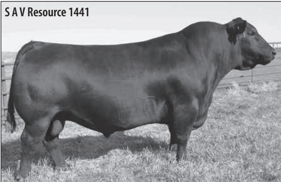
S AV Resource 1441