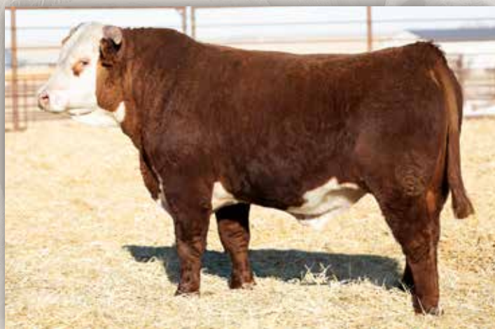
MH 0052 QUINTER 2130