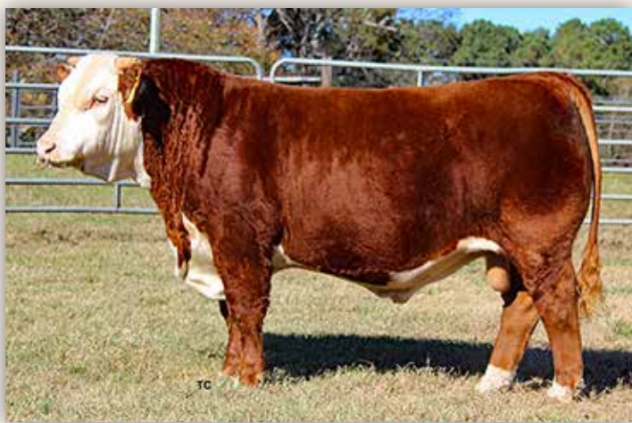
WHR 290E B901 BEEFMAKER 250GET