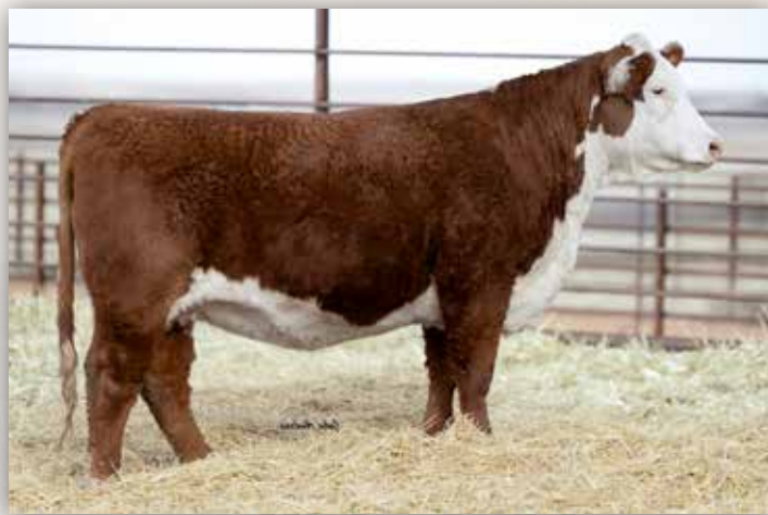
MH MISS 711 COMET 2191