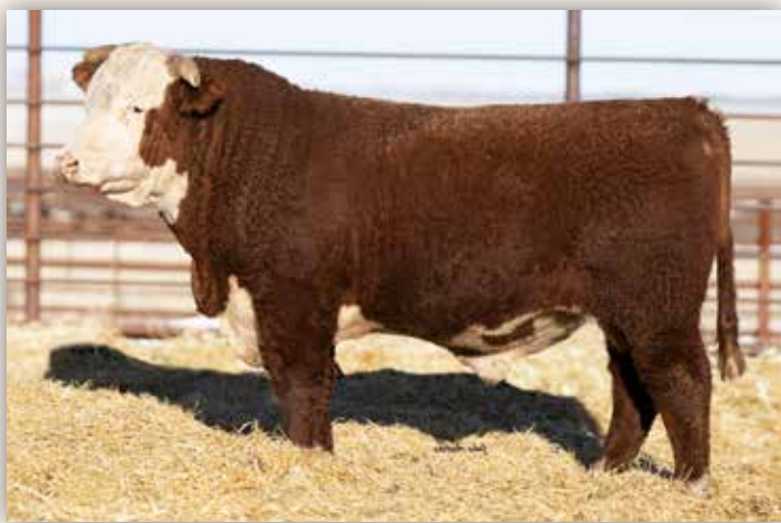
MH 7491 DOMINO 2189 — SON OF MH 587 DOMINO 7491 — SELLS AS LOT 79