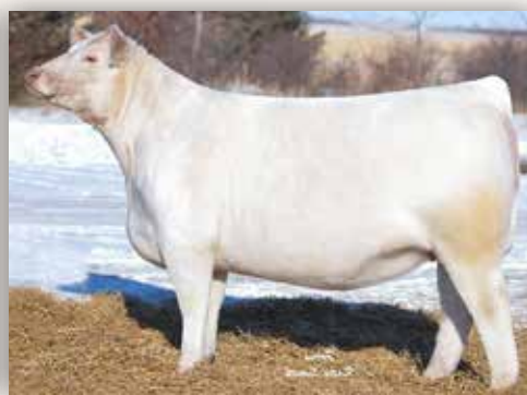
"FIREFLY" — TR PZC NC FIREFLY 1746ET