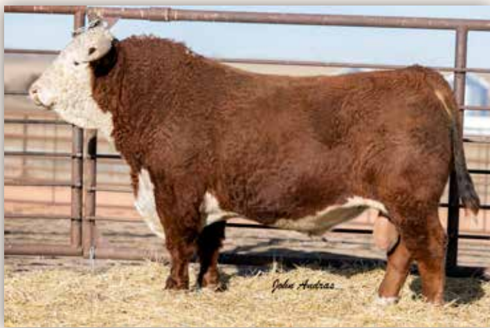
SR DS DOMINATOR 718F