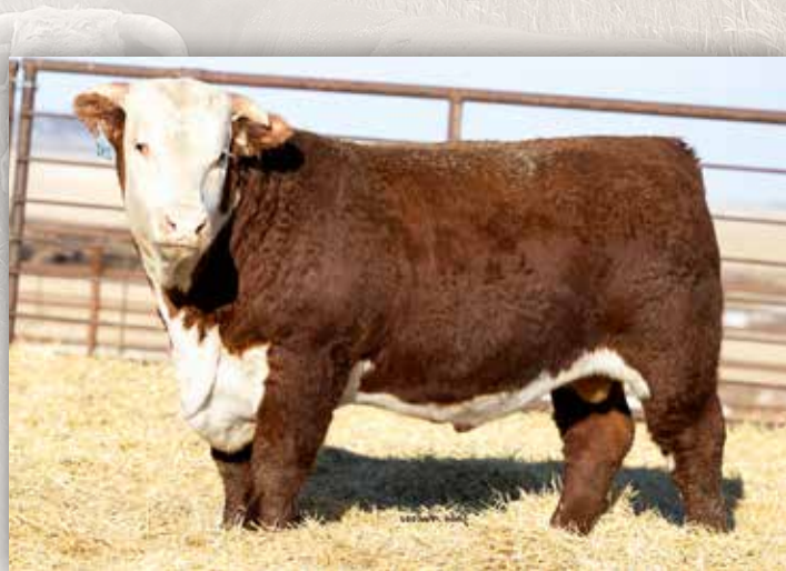
MH 250G BEEFMAKER 241