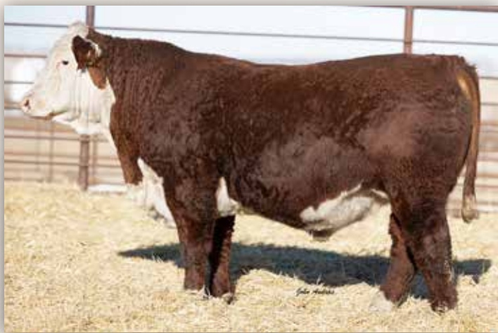
MH BN 729 SLINGSHOT 2764