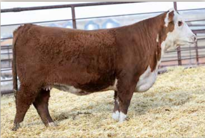
MH MISS 0504 BRITISHER 216

Outlined below are the eight elite females that epitomize the pinnacle of the Mrnak Maternal program. Each of these individuals can be traced back to the most distinguished cows in our program, including the 551, 0142, and 9122 donors. Collectively, this group possesses a combination of structural soundness and broody maternal excellence, with generations of stacked maternal genetics in their pedigrees.