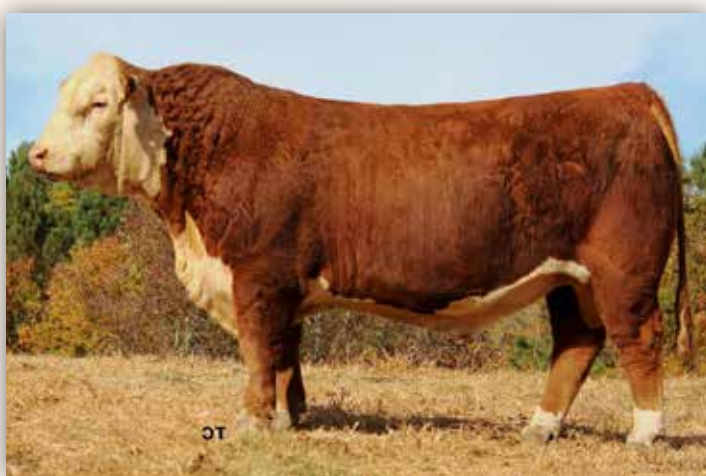
INNISFAIL WHR X651/723 4013 ET