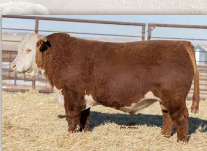
MH 0052 QUINTER 2519 1ET