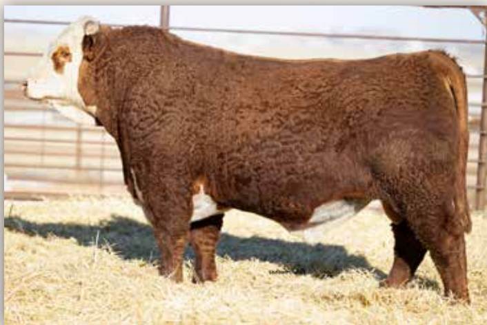
MH 0052 QUINTER 2113