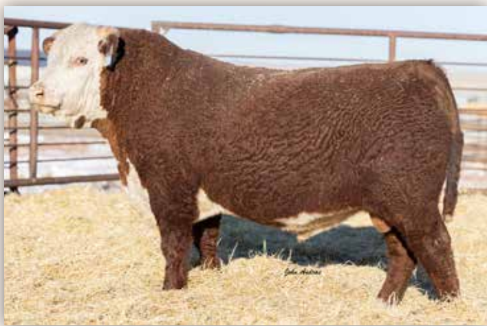
MH 0504 BRITISHER 212 — SON OF MH 6038 BRITISHER 0504 1ET — SELLS AS LOT 22