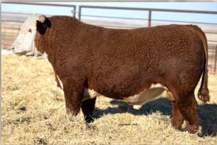
MH 711 COMET 280