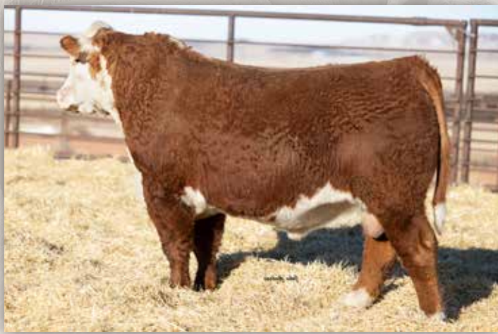
MH 4013 INNISFAIL 2518 1ET