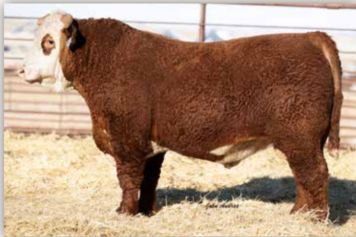
MH 0506 BRITISHER 237