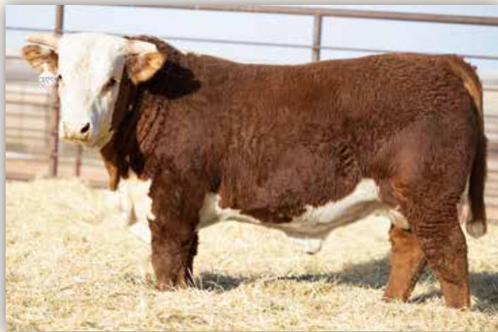
MH 708 RED TIME 275