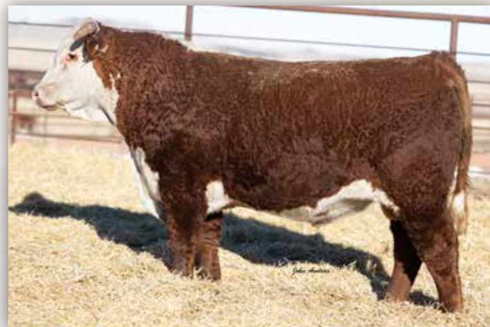
MH 824F DOMINATOR 2152