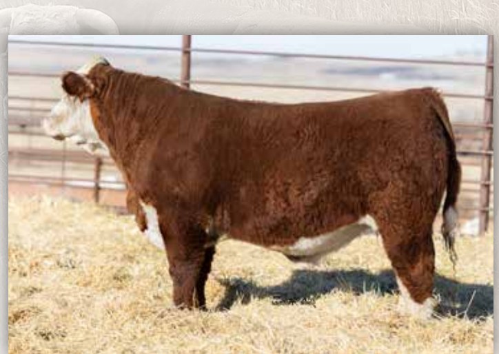
MH BN 729 SLINGSHOT 2775