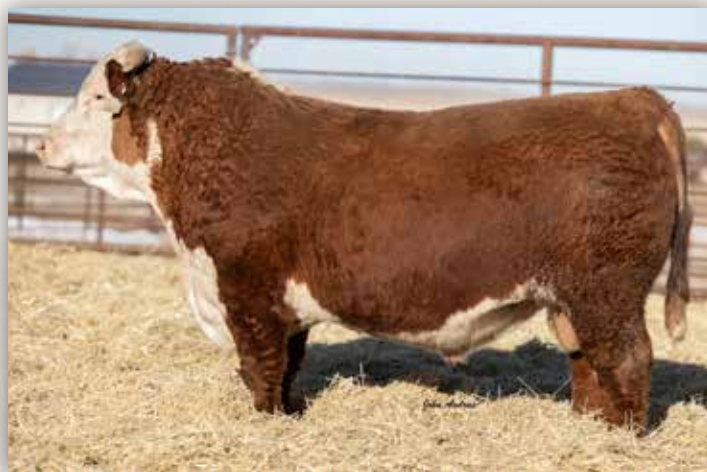
MH 718 DOMINATOR 264