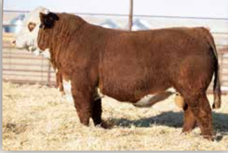
MH 708 RED TIME 2230