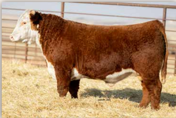
MH 250G BEEFMAKER 2542 1ET