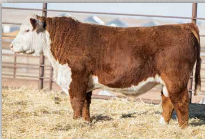
MH 4013 INNISFAIL 2512 1ET