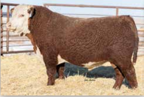
MH 0504 BRITISHER 212