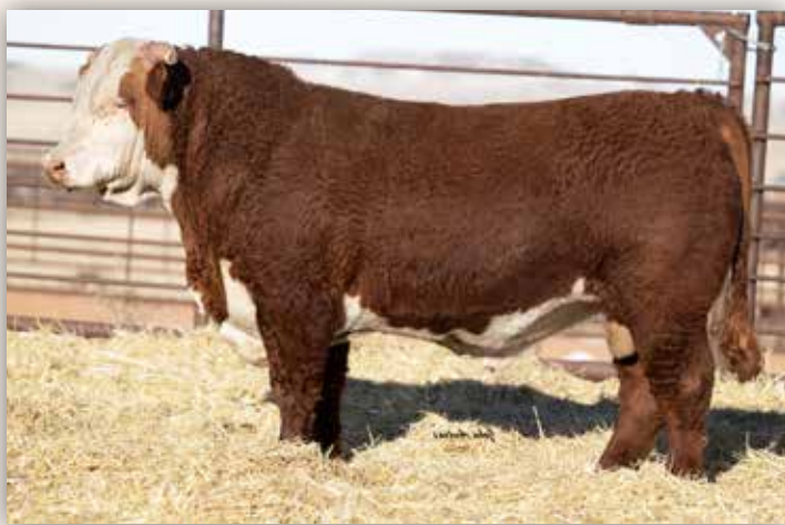
MH 0052 QUINTER 2272