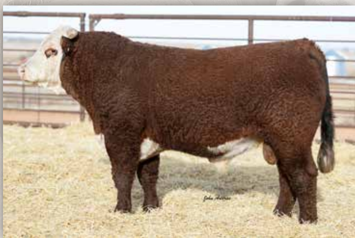
MH 599 SUSTAIN 2139