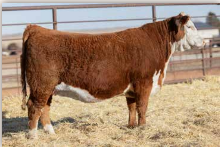
MH MISS BEEFMAKER 2622 1ET