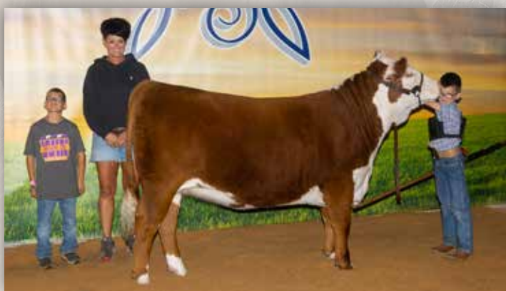
MH MISS TRAVIS 2520 1ET - FULL SISTER TO LOT 1