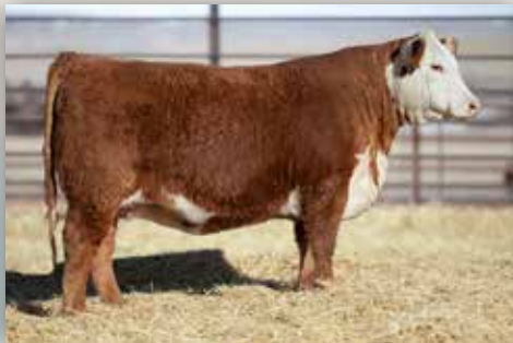
MH MISS INNISFAIL 2546 1ET