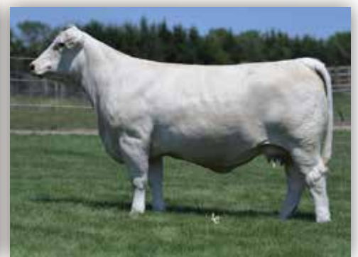
"JASMINE" — RBM JASMINE F251