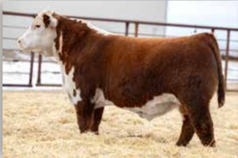
MH RINGO 2624 1ET