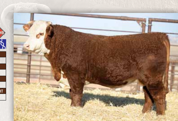
LOT 62 — MH 711 COMET 2279