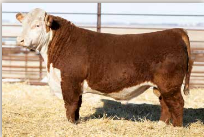
MH BEEFMAKER 2540 1ET