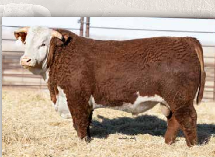
MH 718 DOMINATOR 225