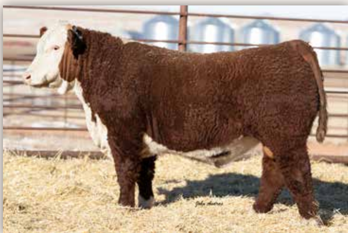
MH BN 729 SLINGSHOT 2756 — SON OF NICHOLS SLINGSHOT 729 ET — SELLS AS LOT 96