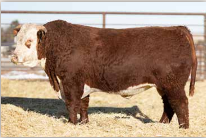
MH 0504 BRITISHER 248