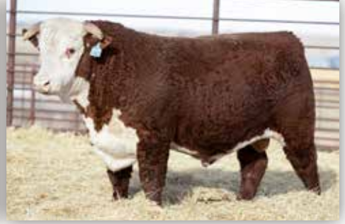
MH 599 SUSTAIN 2262