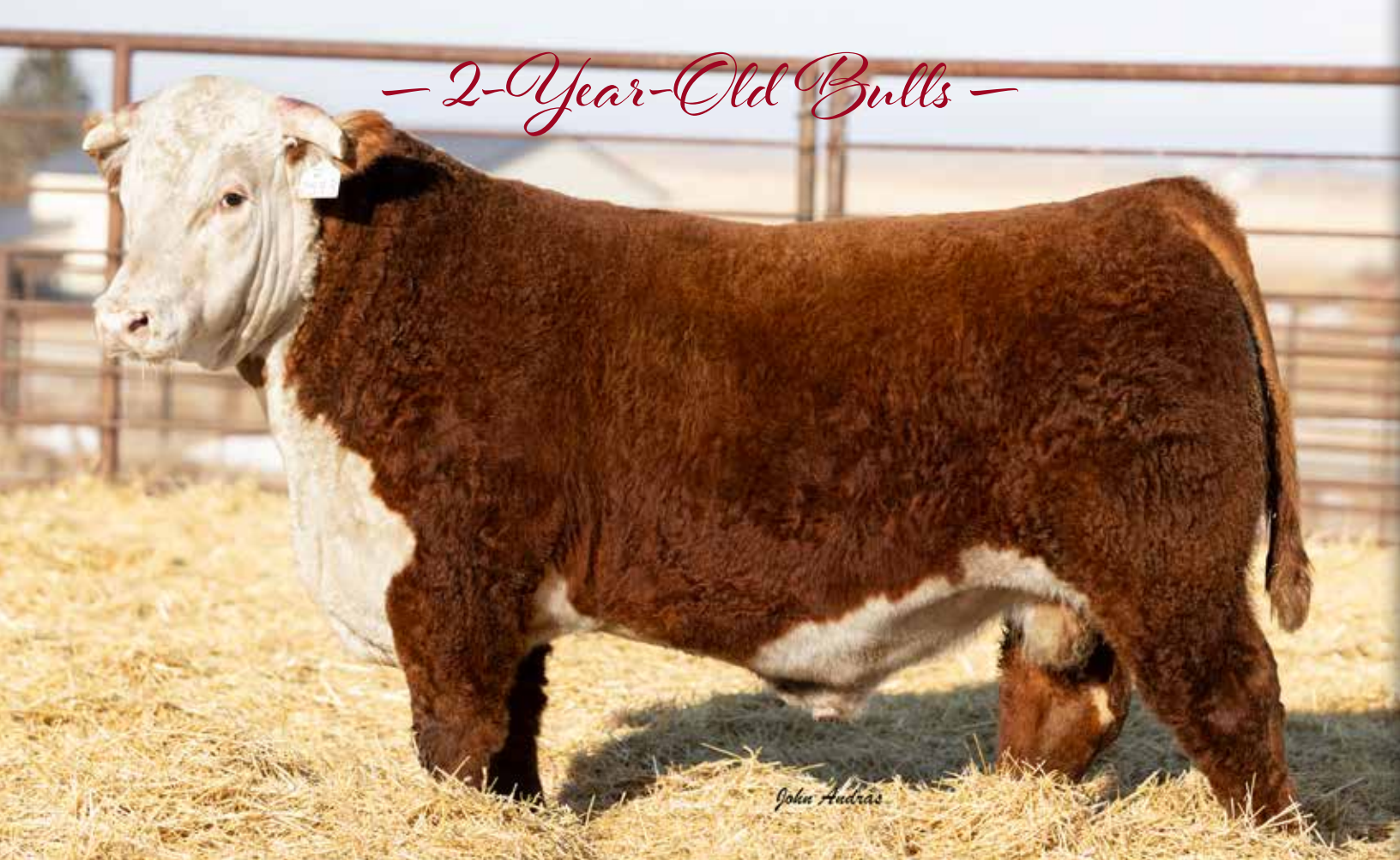
MH TRAVIS 2543 1ET