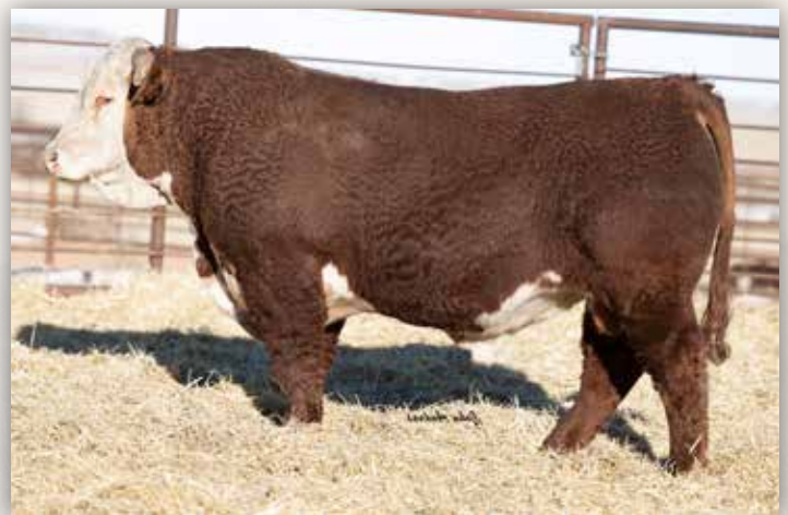
MH 0052 QUINTER 278