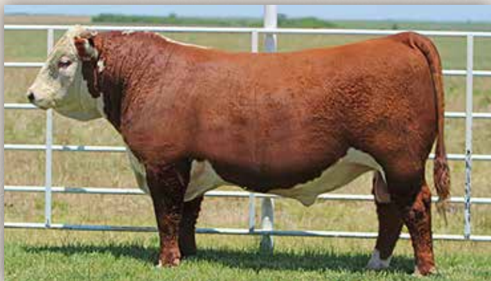
BR 124Y TRAVIS E132 ET - SIRE OF LOT 1