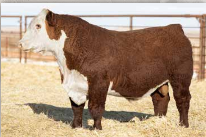
MH BN 729 SLINGSHOT 2142