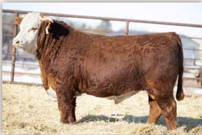
MH 7491 DOMINO 293