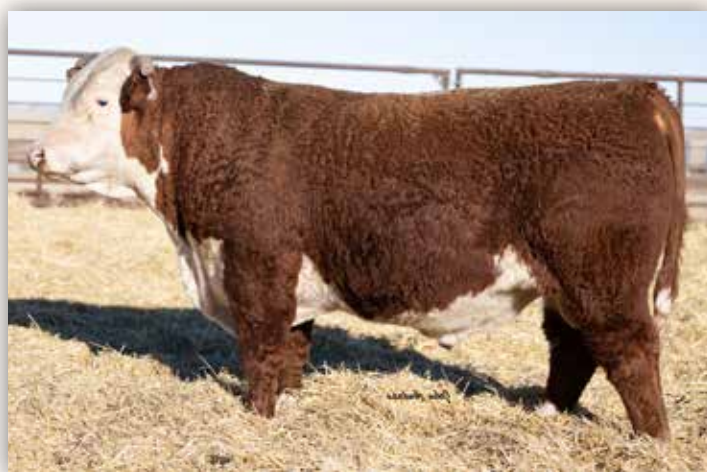
MH 824F DOMINATOR 2237 — SON OF BCC L1 DOMINATOR 824F — SELLS AS LOT 36

• Dominator 824F has consistently driven performance into his calves while maintaining moderate birth weights. He is the son of one of the highest demanded sires in the Hereford breed in 619D. 824 is selected in our program to promote carcass qualities, femininity and performance. He ranks in the top 15% in the breed for $CHB and 3% in Udder quality. 8 Sons Sell.