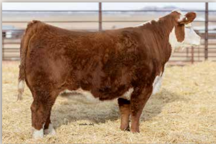
MH MISS REVERE 2629 1ET