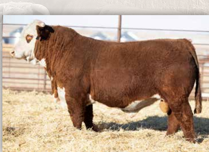
MH 708 RED TIME 2230