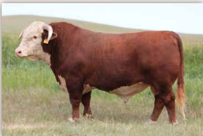
BCC COMET 711E