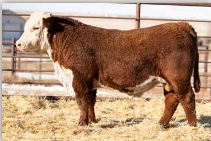
MH 708 RED TIME 2245