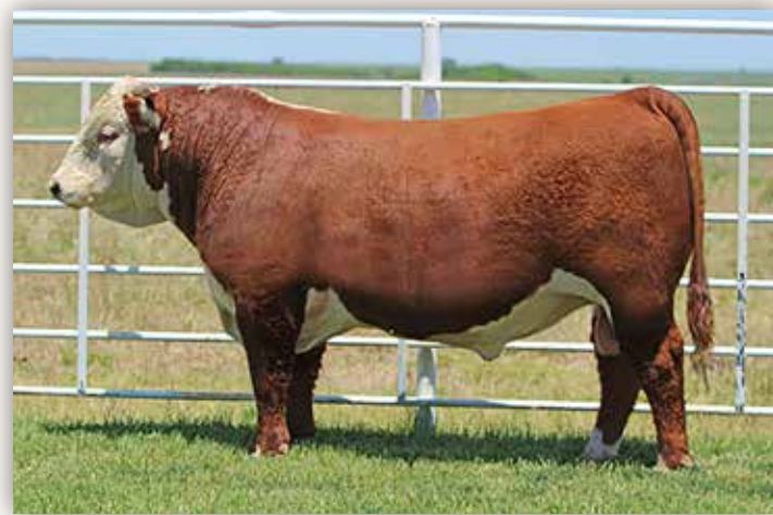
BR 124Y TRAVIS E132 ET