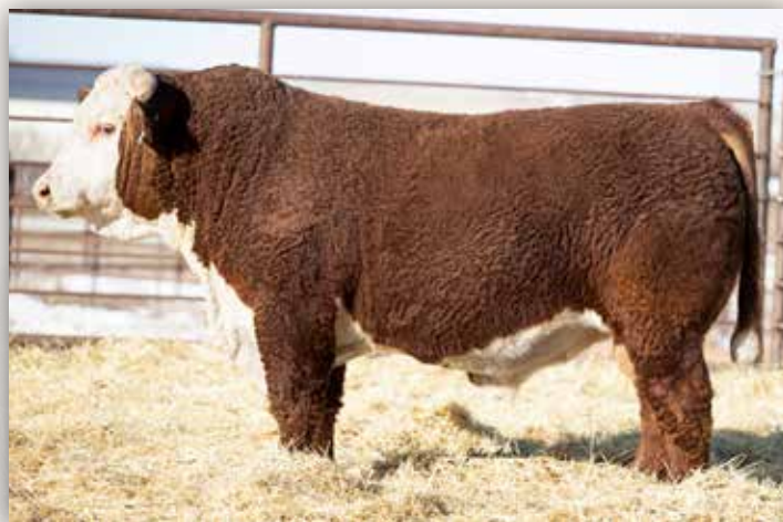
MH 0510 BRITISHER 2119