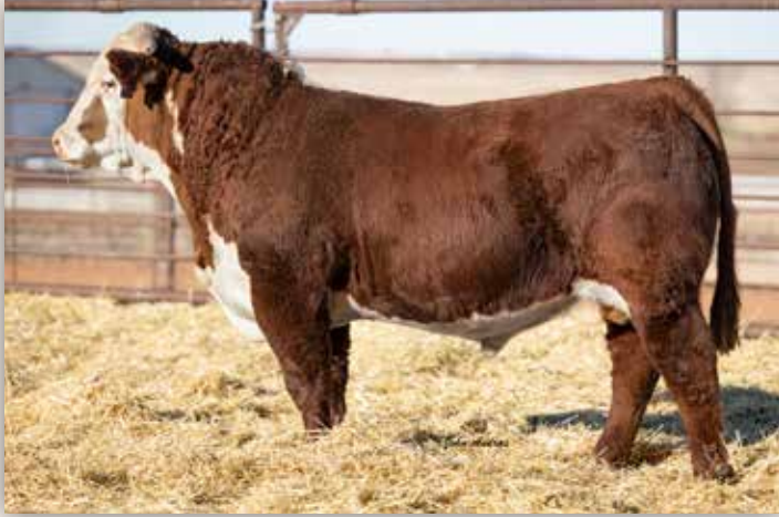
MH 708 RED TIME 2330