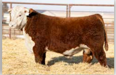
MH TRAVIS 2543 1ET