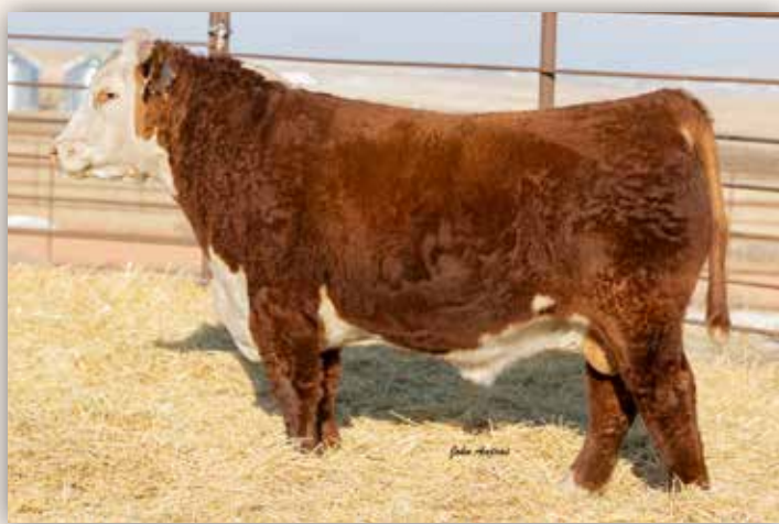
MH TRAVIS 2523 1ET