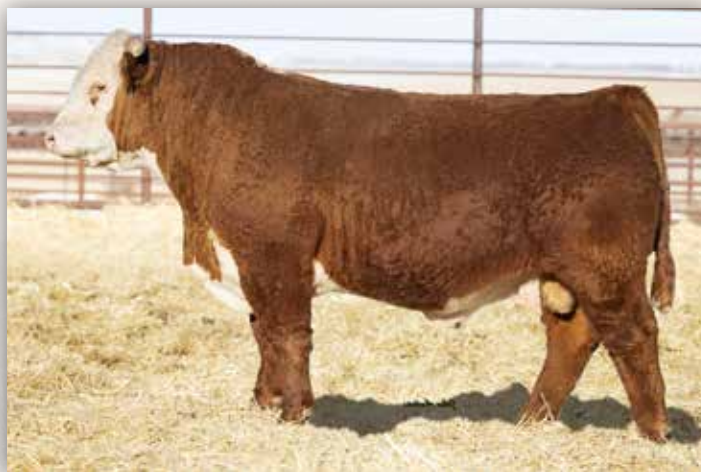
MH BEEFMAKER 2547 1ET