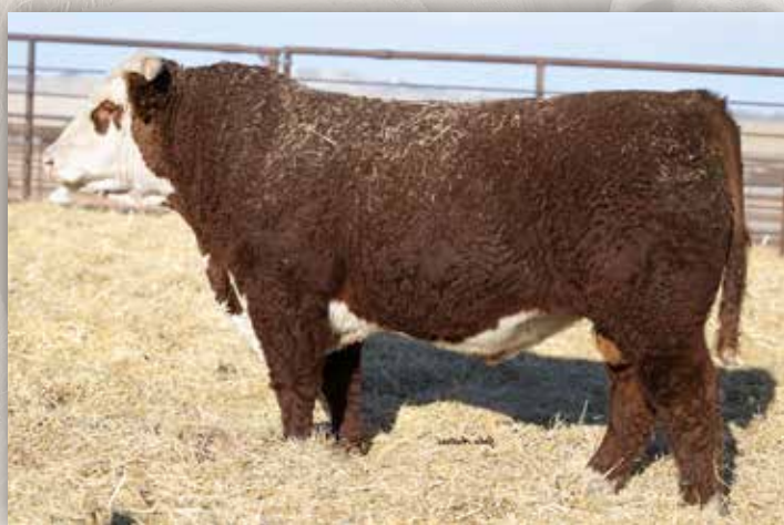
MH 7491 DOMINO 2158