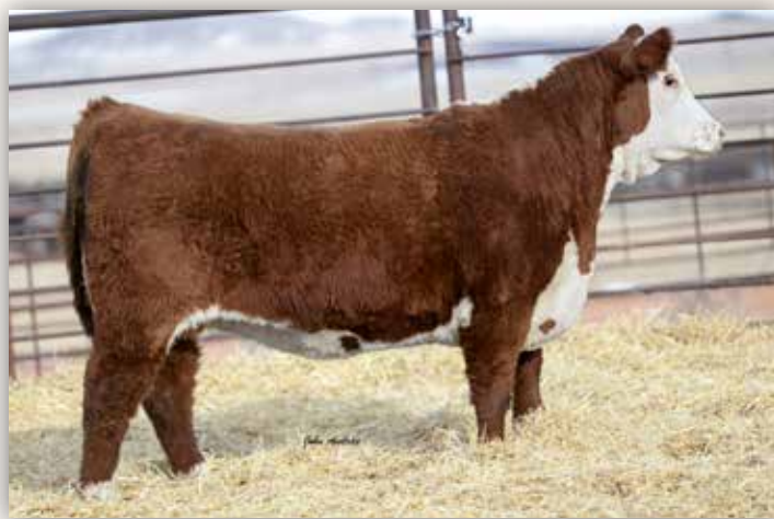
MH MISS 718 DOMNET 257