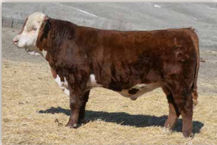
UU QUINTER 0052H