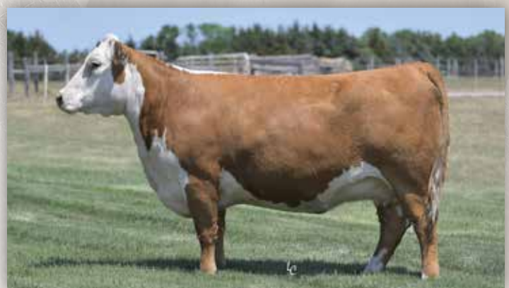
MH MISS REE HEIGHTS 551 1ET — DAM OF LOT 2