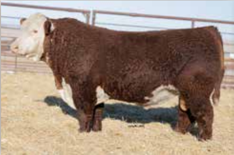
MH RINGO 2606 1ET