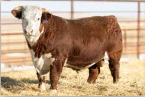
MH COMET 2303