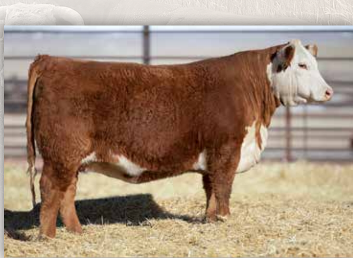
MH MISS INNISFAIL 2546 1ET