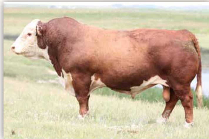
MH KMK HOMETOWN 524 1ET