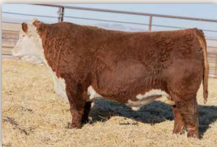
MH INNISFAIL 2555 1ET