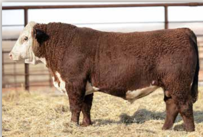
MH 711 COMET 2246