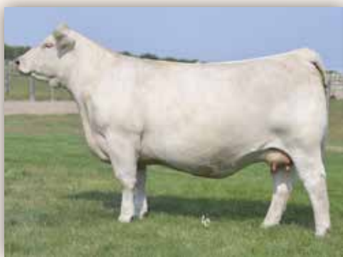
"CECE" — CAG GARW FIREFLY 9637G

As in the Hereford breed we believe great bulls are backed by great cows. We believe we have some of the best cows in the Charolais breed producing some great Charolais bulls. Either before or after the sale we invite you to stop by the ranch to view our Private-Treaty Charolais bull offering.