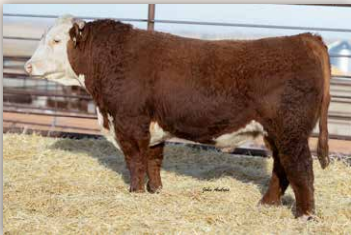
MH 250G BEEFMAKER 2304