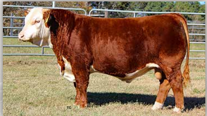
WHR 290E B901 BEEFMAKER 250GET — SIRE OF LOT 2