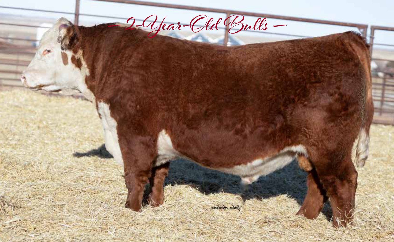
MH 250G BEEFMAKER 2541 1ET