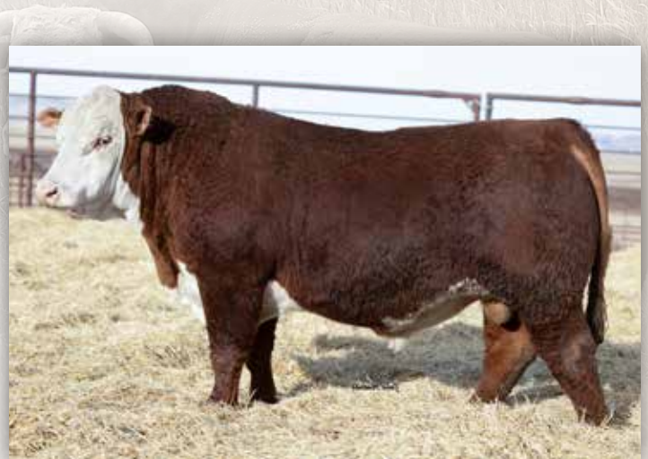
MH 0502 BRITISHER 2308