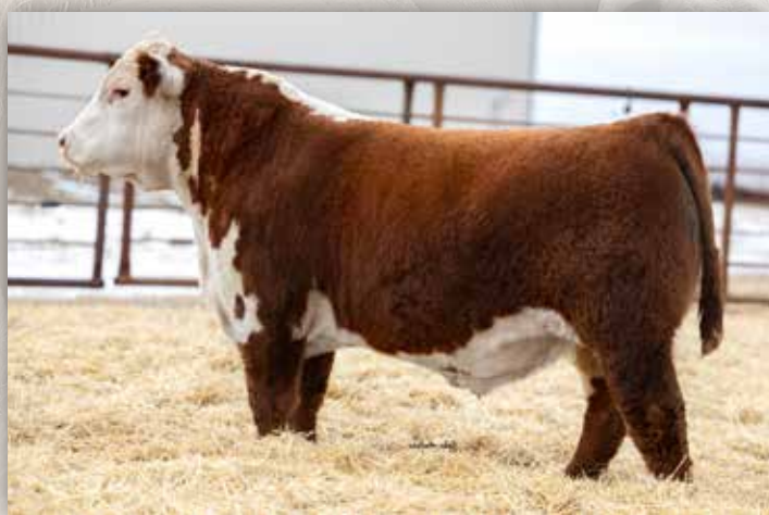
MH RINGO 2624 1ET