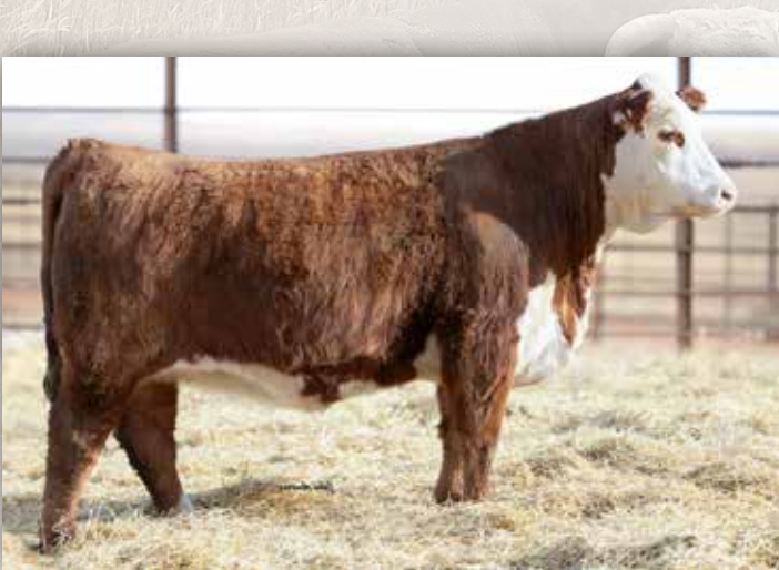
MH MISS BEEFMAKER 249