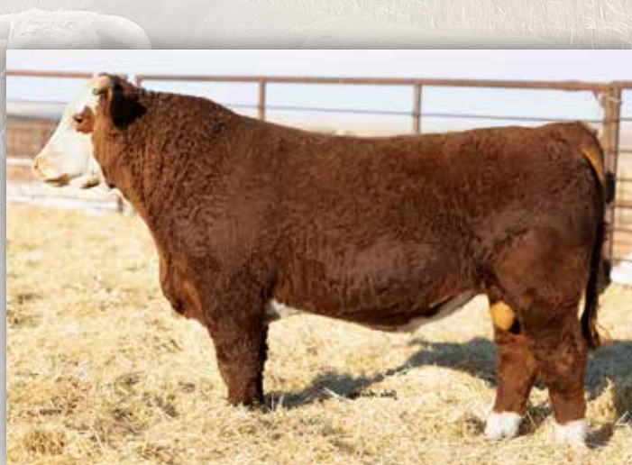
MH BEEFMAKER 2294