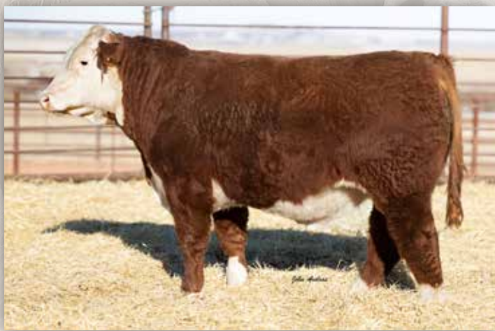
MH BN 729 SLINGSHOT 2752