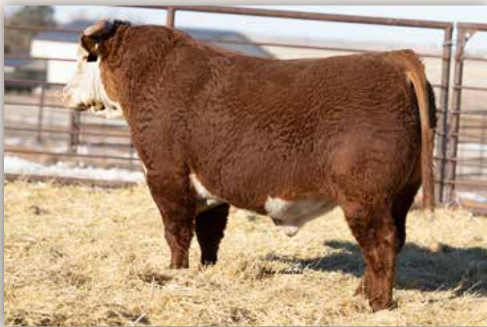
MH 0052 QUINTER 2522 1ET