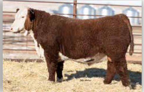
MH BN 729 SLINGSHOT 2756