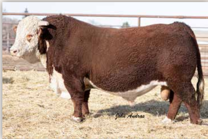
7MI 4151 RED TIME 708

• Red Time 708 really caught our eye at the Black Hills Stock Show in 2019. He is a Bohannon son that 7M Ranch in Nebraska raised. Red Time is long bodied, deep ribbed, and stands on extra bone. We have been excited about this group of bulls since birth, and we are excited that he is part of our breeding program. His sons are deep bodied, stout made and very correct in their structure. We feel there could be some top Herd Bull prospects in this sire group. 8 Sons Sell.