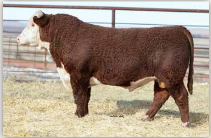
MH 824F DOMINATOR 2112