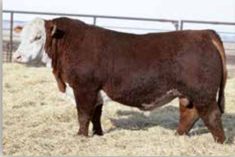
MH 0502 BRITISHER 2308