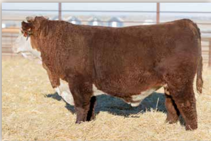
MH BN 729 SLINGSHOT 2763