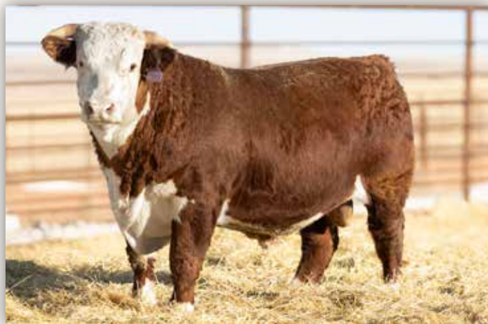
MH COMET 2303