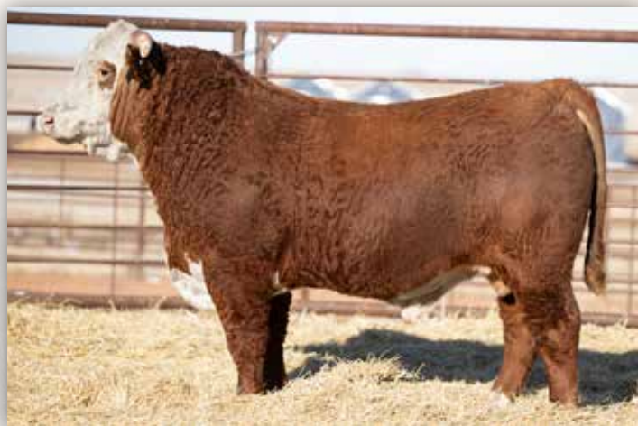
MH 0506 BRITISHER 235