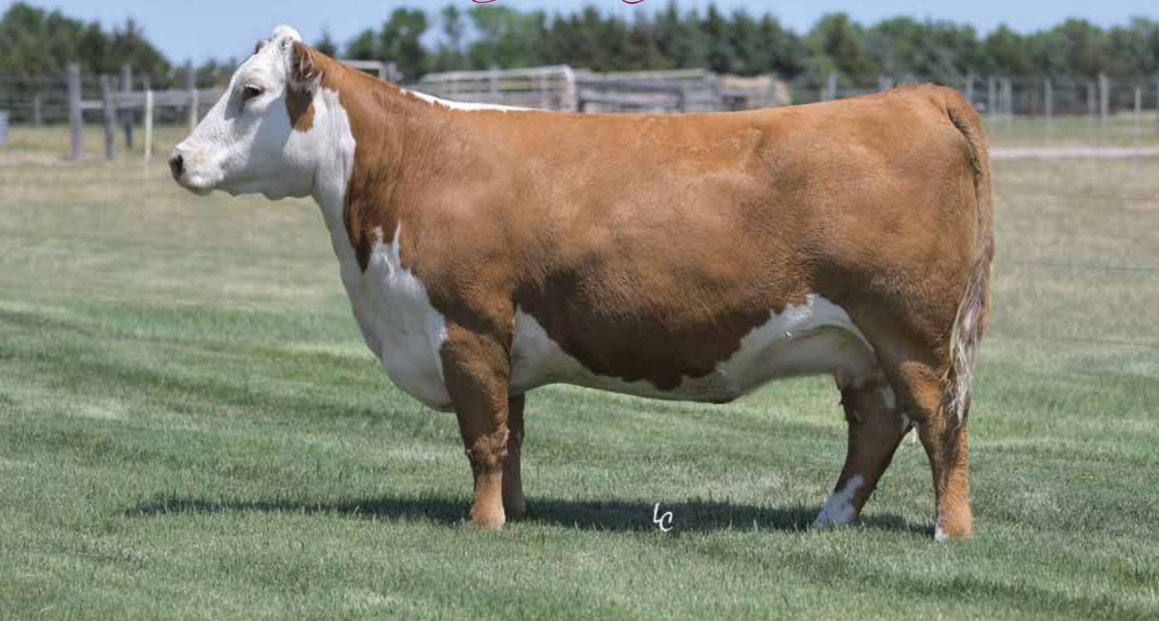
MH MISS REE HEIGHTS 551 1ET