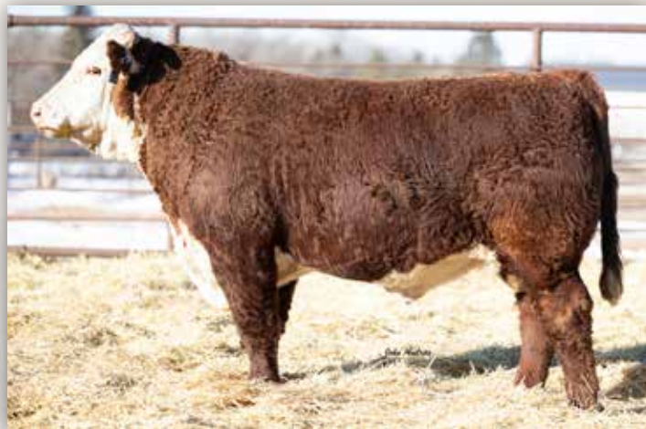
MH 711 COMET 2168