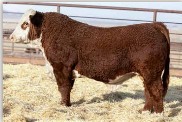
MH 708 RED TIME 2258