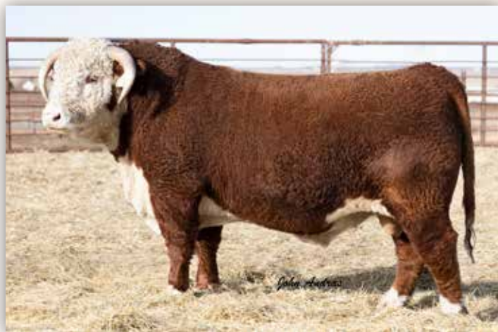
BR 69D GUNSMOKE ET 126G