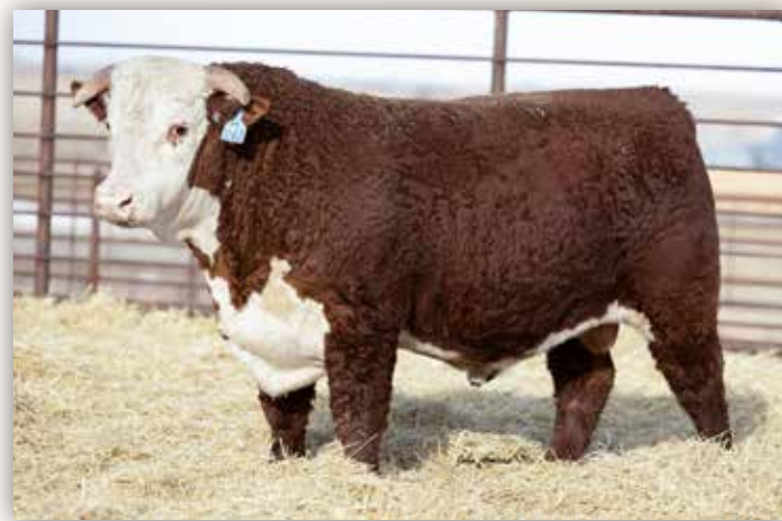
MH 599 SUSTAIN 2262 — SON OF SR SUSTAIN 599G — SELLS AS LOT 40