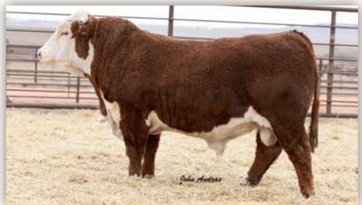
MH 708 RED TIME 042 — 2022 MRNAK HIGH SELLER — OWNED BY CK CATTLE, HIGHMORE, SD — SON OF 551