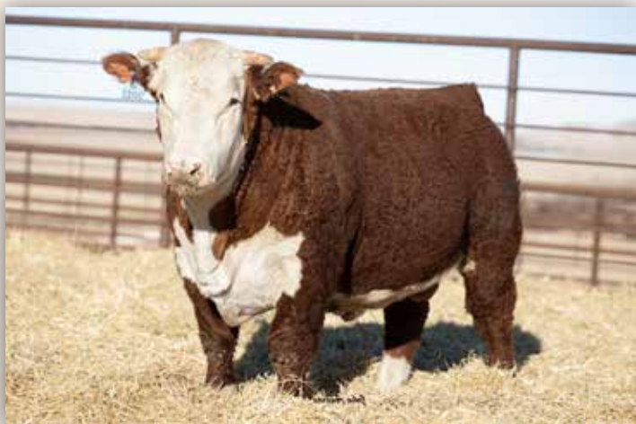
MH BN ROCK 2012