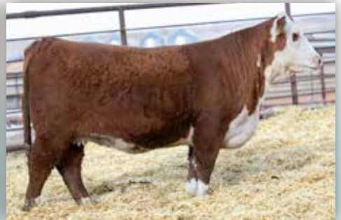
MH MISS 0504 BRITISHER 216