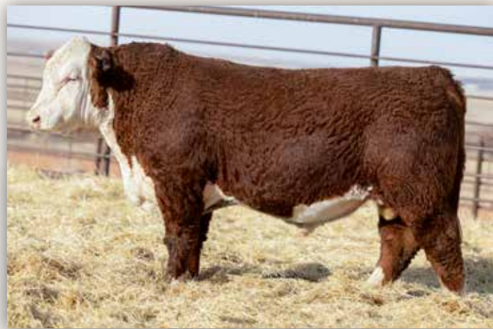
MH 524 HOMETOWN 277