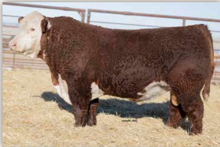
MH RINGO 2606 1ET