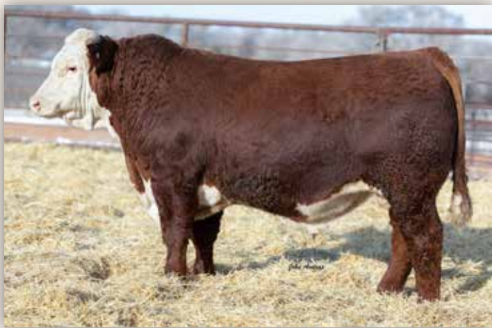
MH 250G BEEFMAKER 2302