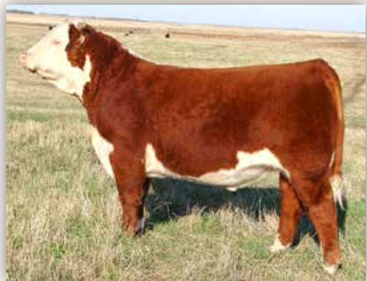
ECR AL REE HEIGHTS 3003 ET — SIRE TO 551