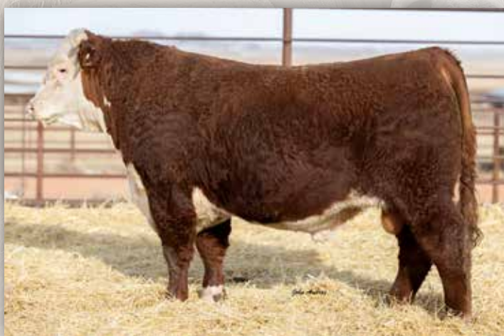
MH 250G BEEFMAKER 2298