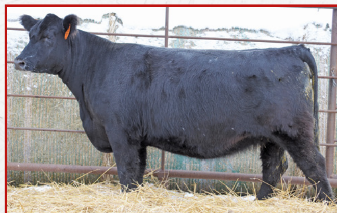
LOT 6 – AAR MADAME PRIDE 337