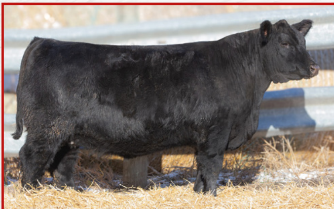
LOT 27 – HARDING LASS ET 409