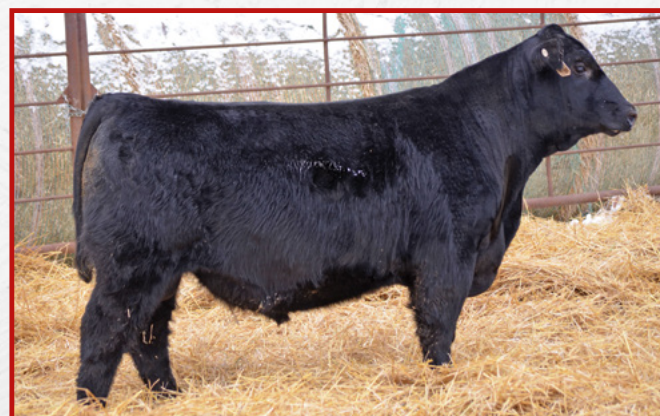
LOT 3 – AAR REGIMENT 412