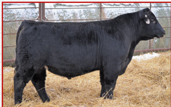
LOT 2 – AAR GIBSON 460

Act 10/12 weight 990lbs. Herd Bull Alert. Wow, check out this awesome job this first calf heifer produced. The docility in this bull, nice and calm. WDA 3.99 lbs.