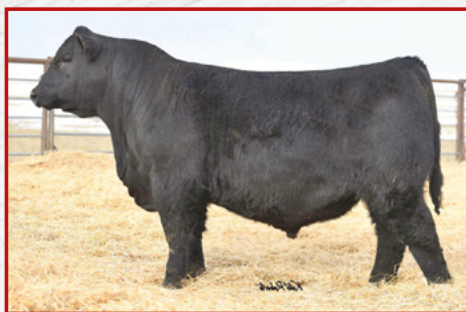
» LOT 63'S SIRE – DEEP CREEK SQUARE DEAL

Travis Bruner 4049 12th Ave NE Drake, ND 58736 701-626-2070 brunerangusranch@gmail.com