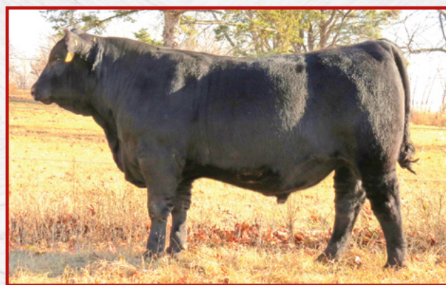
LOT 46 – RFA DYNAMIC 426

Truly a unique herdsire prospect in a variety of ways. On hoof, this elite calving ease Dynamic son carries a ton of body shape, substance, thickness, and power. Born at just 69lbs, 426 worked is way to a WW of 809 and WWR@121. On paper, he sports elite spread ranking in the top 1% CED & BW and top 5% YW. His dam, RFA Miss Wix 212, by Freys Cowboy Logic, ranks as one of the top young cows in our herd and did an outstanding job raising her first! She's elegant in her build, nice uddered, with plenty of thickness and bone. His granddam RFA Miss Wix 012 by Musgrave Stunner, ranks a cornerstone donor in our herd and is unmatched for her power, body shape, and fertility with a calving interval 3@363. A bull backed by a proven cow family, elite data, and quality look.