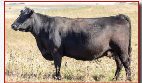
LOT 58'S DAM – FLYING V PRIMROSE LADY 43G