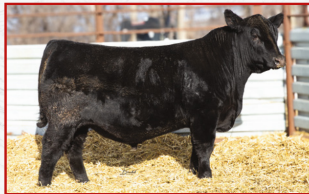
LOT 24 – HCC FOOT LBS 4912

Bull calf that is very stout, complete, stylish with maternal excellence! Dam has produced sale toppers for HCC. Dam is going into donor pen(3 generations of Donors). Angus GS test will be available. Retainign 1/3 semen interest.