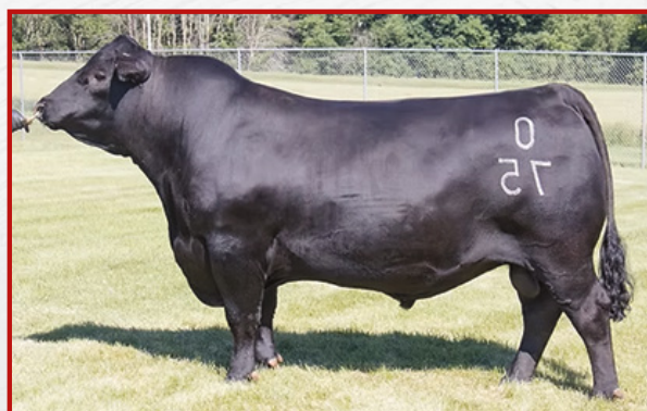
LOT 51 & 53'S SIRE - LAR MAN IN BLACK