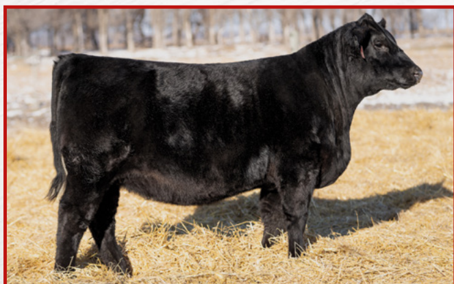
LOT 55 – TOPP BARBARA 4079