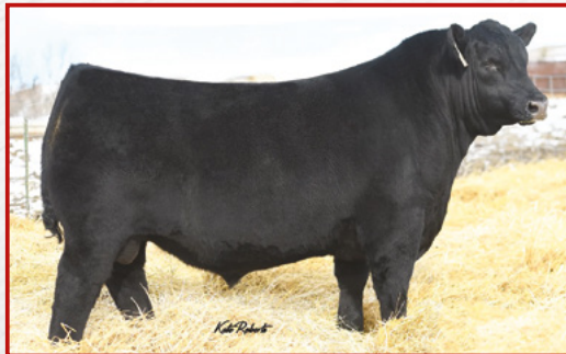
LOT 42'S SIRE - S A V RISE N SHINE 2709