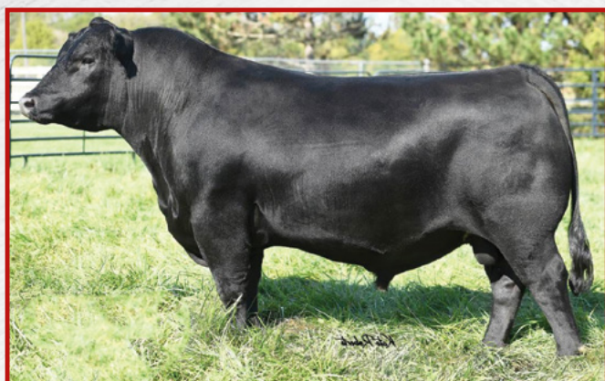
LOT 34 & 36'S SIRE – MYERS FAIR-N-SQUARE M39