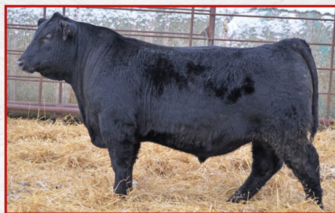
LOT 4 – AAR TAHOE 45