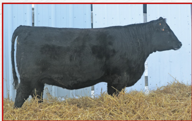
LOT 51 – TNT BLACKBIRD 329