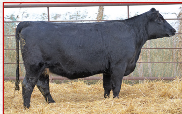
LOT 7 – AAR QUEEN MOTHER 335