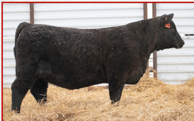
LOT 19 - FLECKS BLACK ANNIE MB 4663