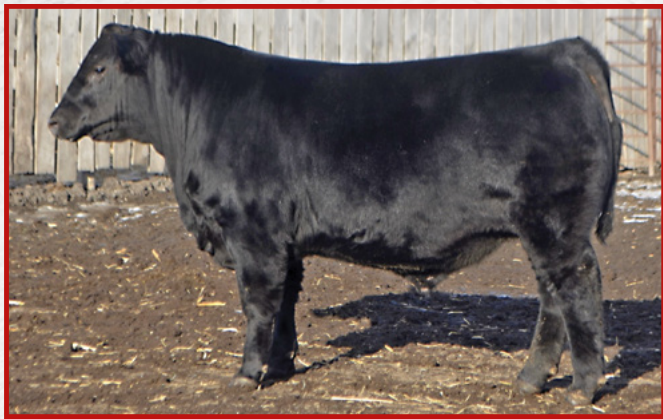
LOT 39 – NORDS EXCLUSIVE 2426