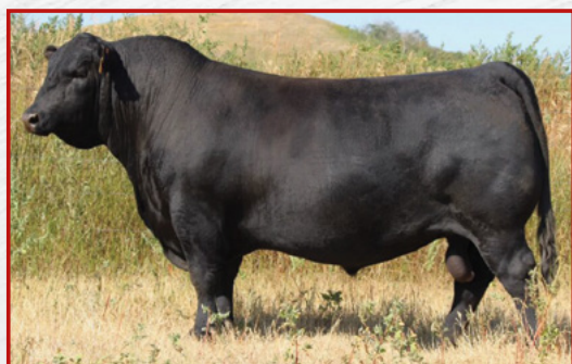
LOT 21'S SIRE – SCHIEFELBEIN GABLE 311