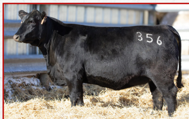
LOT 30 – HARDING MARCIA 356

An ET daughter out of my main donor cow Harding Lass 798. Harding Lass ET 362 is big, broody, and long just like her mother. Sired by the great, S Architect 9501, and bred up to calf to the popular Connealy Craftsman with a bull calf. A heifer that's hard to let go so I will be retaining the right to a future flush. Genomics available sale day.