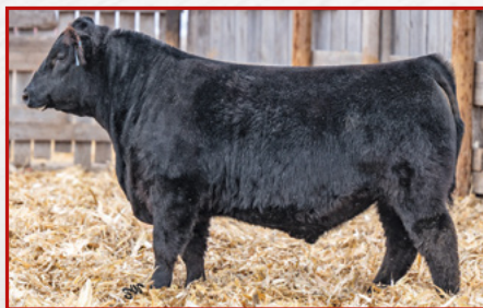
LOT 40'S SERVICE SIRE – MUSGRAVE SOUL 137-1433