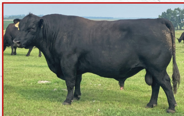
LOT 56 & 57'S SIRE – S 316 CAPITALIST 0108