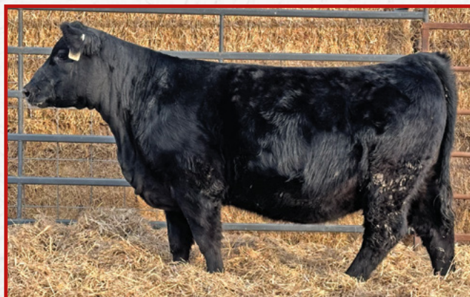
LOT 49 - A & M NORA 126