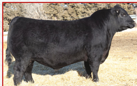
LOT 61'S SIRE – S A V COURAGE 3003