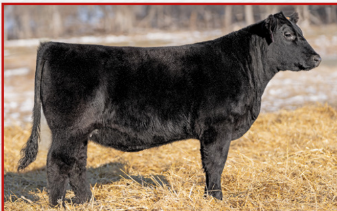
LOT 59 –WL DELIA 4062

Bodie Winters PO Box 114 Binford, ND 58416 406-861-4040 bodiewinters1@gmail.com