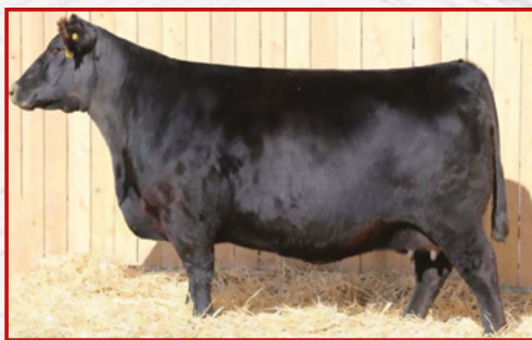
LOT 39'S DAM – MUSGRAVE QUEEN 1433