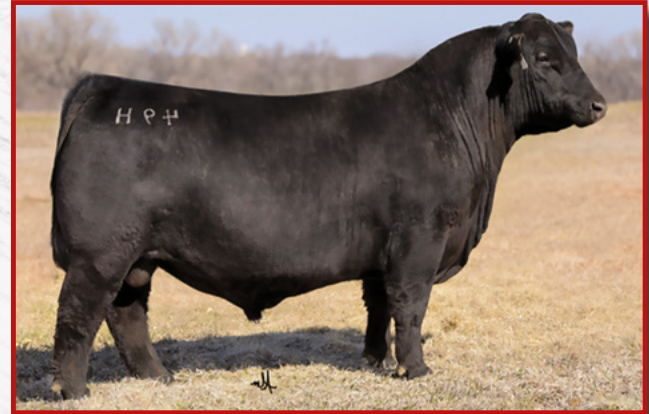
LOT 37'S SIRE - RIVERSTONE VEGAS 49H

Long sided, smooth made calving ease Vegas son from a nice young Incredible daughter.