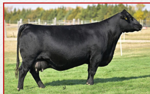
LOT 62'S DONOR – SAV BLACKCAP MAY 0589