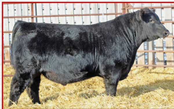
LOT 8 – BSF ALL NATURAL 2415

Tom Becker 8861 11th Ave SE Minot, ND 58703 Tom-701-720-2299 Garrett- 701-721-9400 becker@minot.com