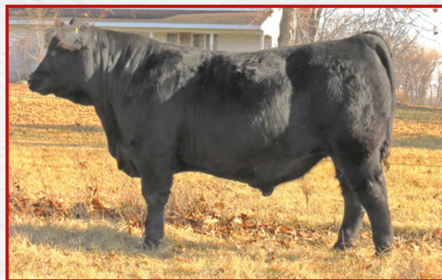
LOT 48- RFA RAWHIDE 410Å