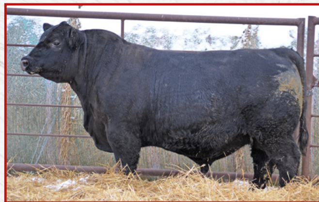
LOT 57 – VVF CAPITALIST 0423