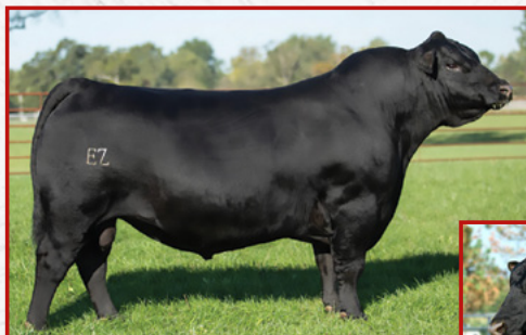
« LOT 16'S SIRE – EZAR STEP UP 9178