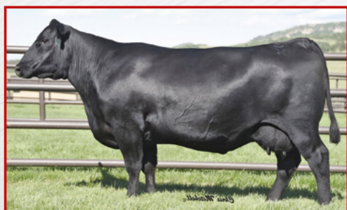
LOT 64'S DAM – SPRING COVE LIZA 754