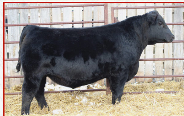
LOT 9 – BSF RING THE BELL 2402