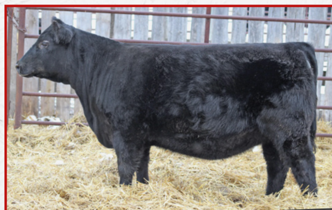
LOT 12 – BSF B BELL MISS HOPE 2417

Show Heifer deluxe. First female out of this Southern Charm daughter that we picked up from Rock Creek. We should not be selling this one because I am positive this one will be a model cow after who ever is done having fun showing her.