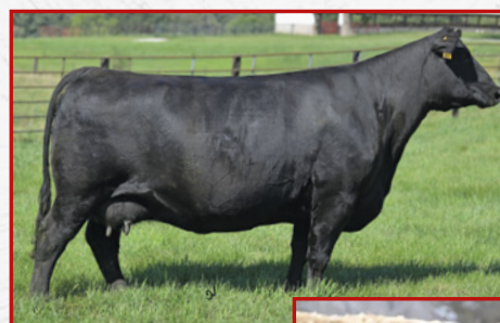
LOT 67'S DAM – JANSSEN BLACKCAP MAY 7079