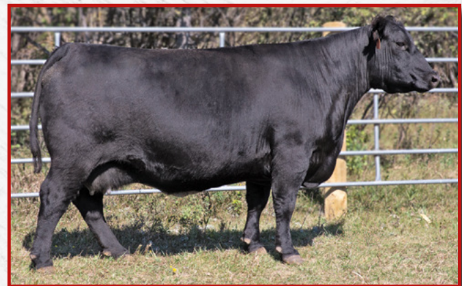
LOT 26 – HARDING LASS 798

I decided to flush Harding Lass 798 when she became a pathfinder dam, I'm glad I went that direction with her, the example of her daughters and what she can do will sell right along side her. The large number of cows, bred heifers and heifer calves in my herd, although young, look the part and are on the right track to follow in her footsteps. A granddaughter had the highest weaning weight bull calf on my place this fall. 798 had six flush brothers sired by S Architect 9501 that were a feature in my 2024 bull sale. She is still in her prime and can do a lot for anyone interested in her. She has been flushed 5 times and has averaged 14.8 viable embryos per flush.