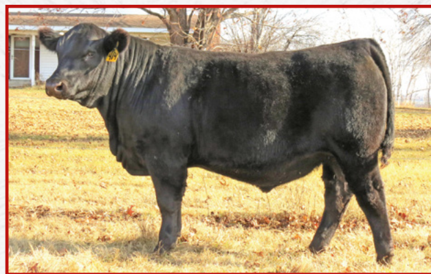
LOT 47 – RFA PROLIFIC 414