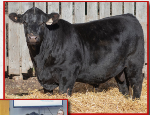
LOT 58 – FLYING V VIROQUA 113L