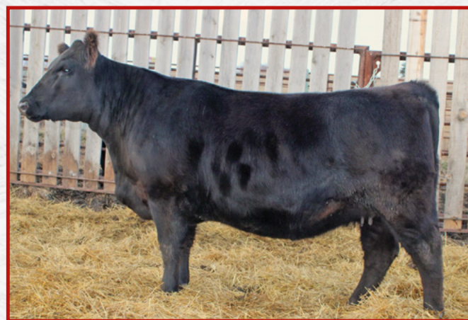
LOT 10 – BSF 2016 HOPE QUALITY 2318

This one might not be donor material but I bet you 6 months after she calves to Duke you call me and say thank you for selling her. I am that confident in this female. Buy her and lets see what happens.