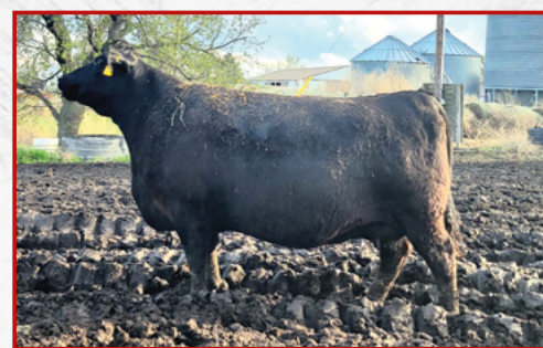
DONOR GRANDDAM OF RFA DYNAMIC 426