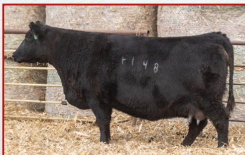
LOT 22'S DAM – NSF CRYSTAL F148