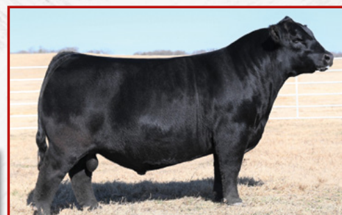
LOT 54'S SIRE – HUMMEL ARGENTINE

Topp Eriskay 4168 is an outcross to our program. In an effort to bring the Coleman Eriskay family into our program we purchased a large embryo package combining the complete outcross Hummel Argentine known for functionality, great structure, & great phenotype with the incredible Eriskay 7305 (Resouce x Right Time). With many full sisters, we allowed Andrew & Logan to select their pick of the flush for this sale. We feel confident in the maternal strength, functionality, and complete soundness in Topp Eriskay 4168.