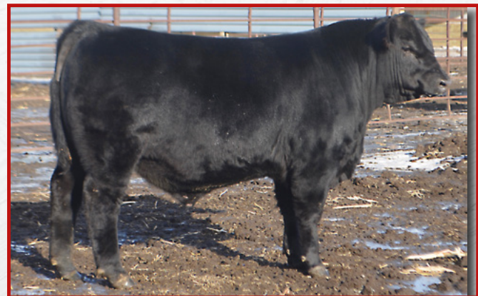
LOT 38 - NORDS REDEMPTION 2405

High performing, stretchy herd bull prospect out of a beautiful first calf Tahoe daughter.