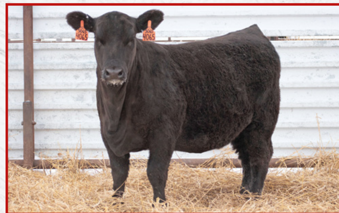
LOT 18 - FLECKS BLACK ANIE SC 4065

A top end heifer out of 5065. This is her natural calf, we also have 25 embryo calves by her Mother. Very clean fronted, correct heifer. She should make a true brood cow. Sired by Scale House, a true breeding bull. This heifer weaned at 692# with no creep, 713 adj 205.