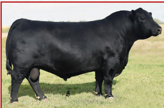
LOT 14'S SIRE – CFI PAYOUT F408