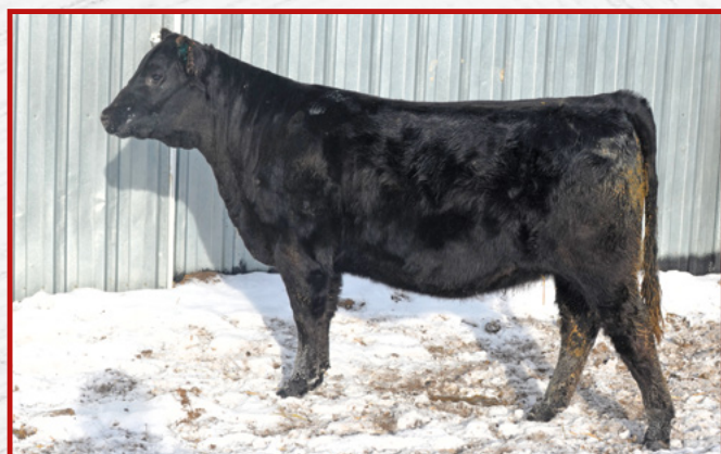
LOT 53 - TNT MARTHA 402