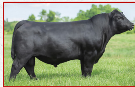
LOT 65 & 66'S SIRE – BNWZ VALIDITY 2491

Blackbird 0032 from the famed Blackbird family that has been big producers for Riverbend, Pollard, and Carlson Cattle Co. 0032 first natural calf brought $20,000 1/2 interest in the D&W Angus sale to FB Genetics. A year later she sold a package of 3 embryos to Heisman for $1100 each. She has a royal pedigree, high growth with Frame, and EPD upgrading genetics.