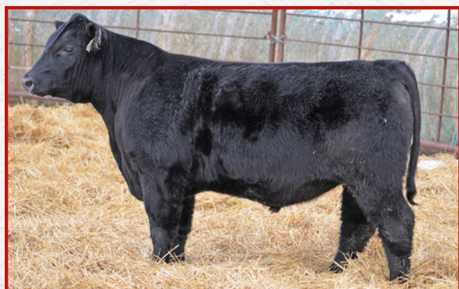
LOT 5 – AAR STEP UP 44