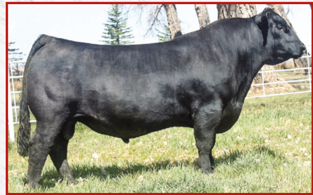
LOT 41 & 45'S SIRE - HCC WHITEWATER 9010