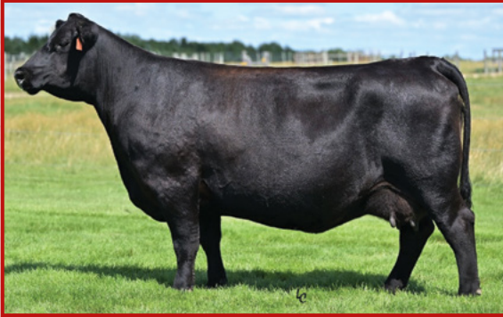
LOT 60 A & B'S DONOR DAM – FLECK'S BLACK ANNIE 5065

Les Fleck 6180 Hwy 6 Solen, ND 58570 701-391-5577 ljfranch@yahoo.com