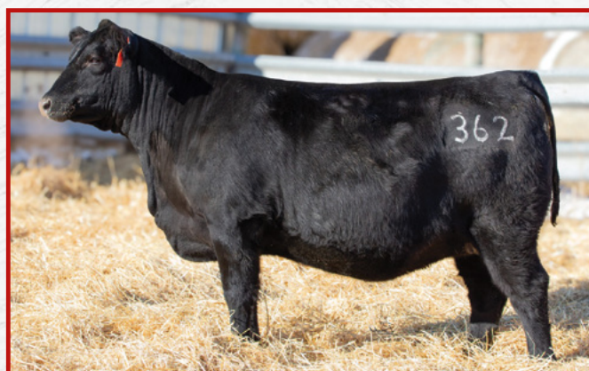
LOT 29 – HARDING LASS ET 362

Another daughter from the great donor Harding Lass 798, she is bred up with a heifer calf to Connealy Craftsman. These heifers are hard to part with. If 798 hadn't given me multiple daughters in my herd and an inventory of embryos in my tank, I don't think I would even consider letting these individuals go. Retaining the right to a future flush. Genomics available sale day.