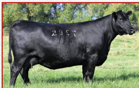
LOT 54'S DAM – COLEMAN ERISKAY 7305