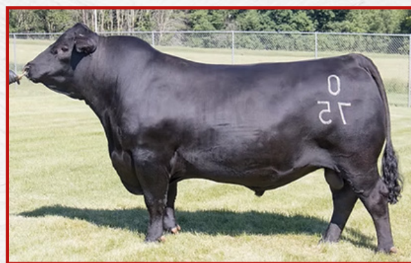
LOT 43 & 44'S SIRE - LAR MAN IN BLACK

Larger outline Man in Black that has a ton of growth and performance.