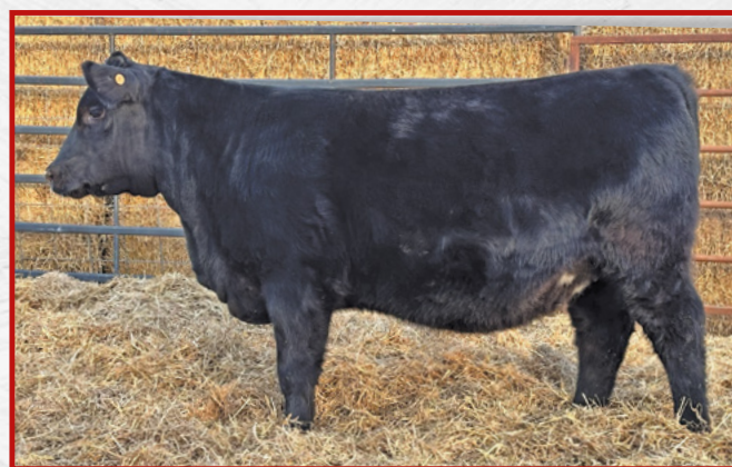
LOT 50 – 2 TEN RITA 9G90-G95