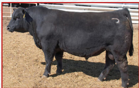
LOT 68'S SIRE – CONNEALY VALIDATION

10213 68th St SE LaMoure, ND 58458 701-710-0425 701-709-0777 smmcarr@daktel.com