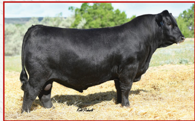
LOT 13'S SIRE – BROWN DOUBLE DECKER 0004

Dam's Production: 4@101 BWR | 4@100 WWR | 2@103 YWR | 5 calves at 369 days. A high performance scale crushing daughter of our record selling Brown Double Decker 0004. She characterizes the best of the Chloe family and has the potential to be a major asset for her new owner. We had a hard time letting this one go! She is deep ribbed, capacious, and sound structured. She stems from a fertile and productive cow family that has been a foundation cow since our inception into the registered Angus breed. Dam has a tremendous record for being highly fertile and functional. She has had 5 calves with a 369 day calving interval. Granddam is a pathfinder and still in production with 6@104 weaning ratio.