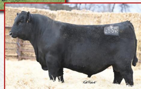
LOT 67'S SIRE – SPRING COVE GRANT 200K