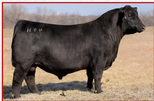
LOT 33'S SIRE – RIVERSTONE VEGAS 49H