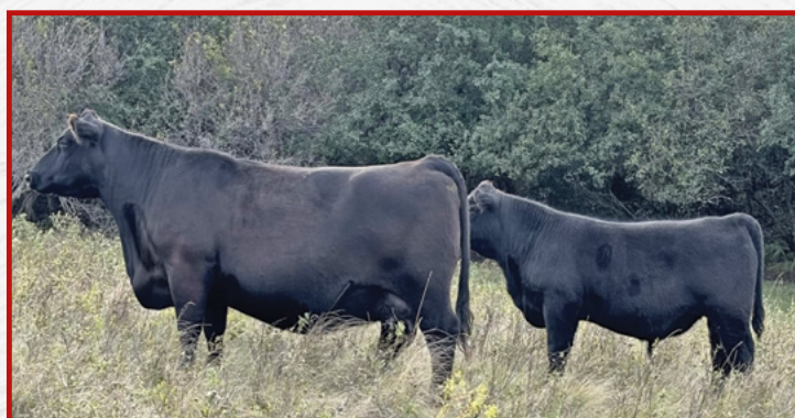
LOT 44 - PF MAN IN BLACK 484 & DAM THIS FALL