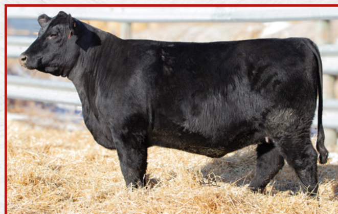
LOT 28 – HARDING LASS ET 360

When picking some bred heifers to consign to the NDAA sale, I didn't mess around and went straight to the top of my bred heifer pen. 356 is possibly my favorite heifer I have, picked from about 80 head, she is naturally an extremely thick heifer who passes a lot of power. Harding Marcia 356's dam, Harding Marcia 181, is an product of an ET mating. 356's grandam, Topp Marcia 7039 is a cow that I admired from the Topp Angus herd, I was lucky enough to get a hold of some eggs on her, and mating her with a bull who we lost to soon and had limited semen supply on, Topp Huron 8350. A maternal brother of 356 will be a highlight of my 2025 bull sale. Retaining a right to a future flush. Genomics available by sale day.