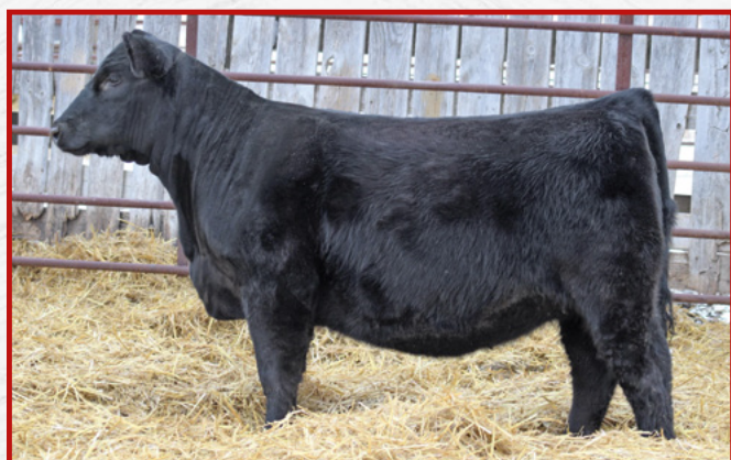
LOT 11 – BSF HVR BARB 2428