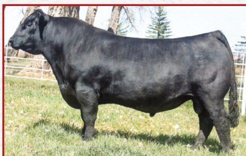
LOT 20'S SIRE – HCC WHITEWATER 9010