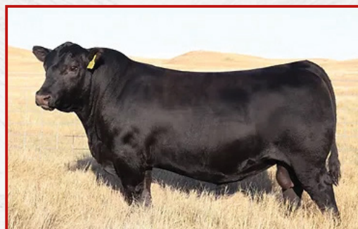
LOT 52'S SIRE - S A V GLORY DAYS 1832

Glory Days has done a phenomenal job at our place. Here is a highlight of the heifer calves sired by him. She is absolutely one of the best calves of the calf crop. Dam is another front pasture type cow with an awesome record. Maternal brother by Scalehouse was our high selling bull a couple years ago.