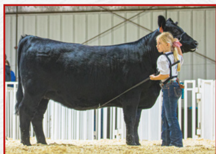
« LOT 63'S DONOR – BAR MISS NO DOUBT 0126