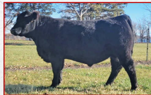
LOT 47'S MATERNAL BROTHER – RFA BROADVIEW 308