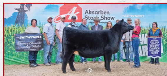
LOT 40'S MATERNAL SISTER – NORDS LUCY 9211