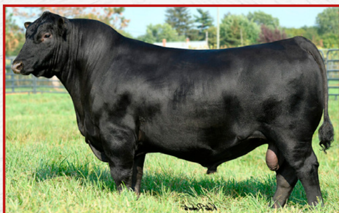
LOT 35'S SIRE – CONNEALY CRAFTSMAN