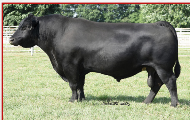
LOT 34 & 36'S GRANDSIRE – WOODHILL BLUEPRINT