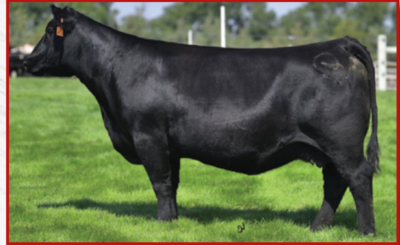
LOT 60 A & B'S MATERNAL SISTER FLECKS BLACK PRES 0656