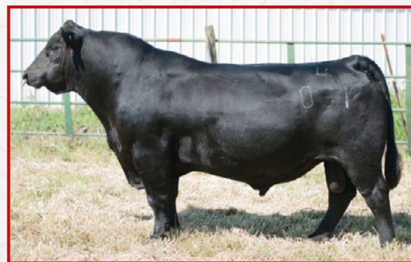
LOT 41 & 45'S GRANDSIRE - MILL BRAE IDENTIFIED 4031

Out of one of the young and upcoming cows on the place, this Man in Black son will produce highly productive daughter and sons that grow.