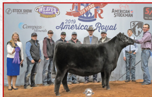
LOT 40'S MATERNAL SISTER – NORDS LUCY 8022

SON OF LOT 40'S MATERNAL SISTER NORDS LUCY 8022 & STAG FORTUNATE