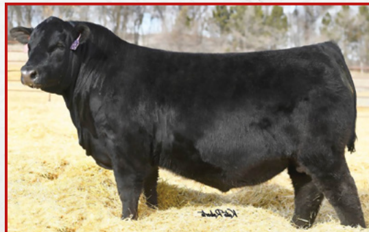
LOT 60 A & B'S SIRE – ELLINGSON PROLIFIC

Selling 3 IVF Embryos. Fleck's Black Annie 5065 is our #1 donor. There will be 12 sons features in our production sale Feb 13, 2025. We have 15 daughters working in our herd, 2 of which are also in our donor pen. True Angus genetics, balanced EPD's. beautiful udder, good feet and legs, Top 3% doc score. Top income producing cow in our herd. Mated to Ellingson Prolific. Foot improver top 1%, maternal Top 1%, loaded with muscle and depth of body. This should be an exiting mating of top Angus genetics.