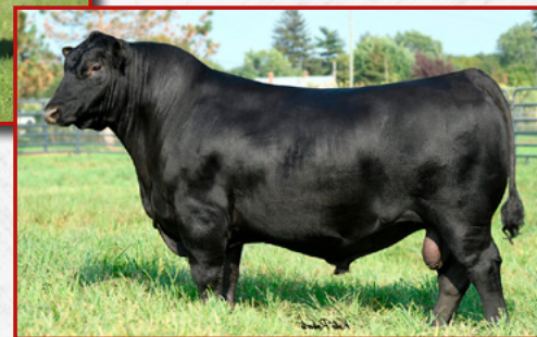
» LOT 17'S SIRE – CONNEALY CRAFTSMAN