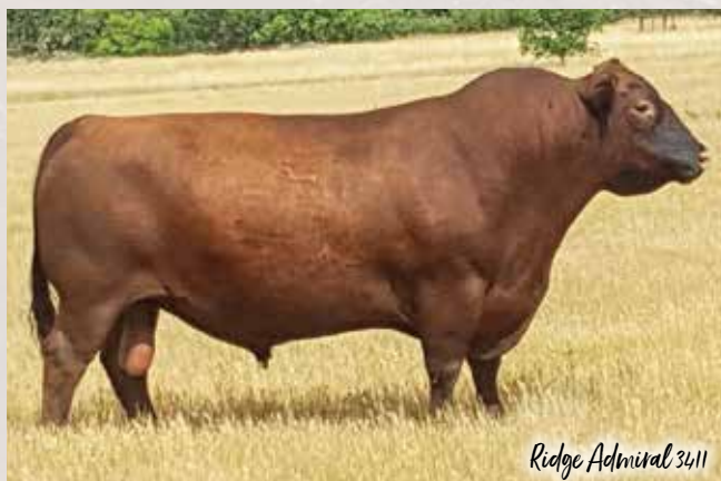
Ridge Admiral 3411

This opportunity will not come around often!! A full brother to this mating sold this spring in our bull sale for $17,500 to Watkins Cattle Co. in Arkansas and 3K Land & Cattle in Texas. Proven mating here and you can get your hands on some of the coveted Reputation progeny. Feddes Manhattan 2282 was a phenotypically flawless bull with extreme depth, dimension, muscle definition and yet had a nice front end. We used 2282 very heavily this spring and are excited to get those calves. The dam of these embryos has Red Angus royalty running through her veins with Feddes Blockana, LASO Leanna, C-T Linsey, 5L Firefly, CTDB Verdi and JYJ MS Jolene. The cow families here should say it all. 0100 carries a 117 MPPA on her first calf with BR 100, WR 129, YR 119 and IMFR 113. Cow families, growth and carcass! This mating is part of the future of Feddes Red Angus and this is the only time this mating will be offered in the near future.