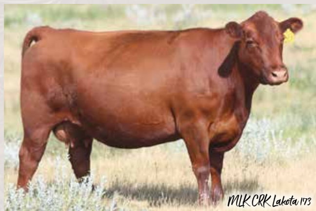
MLK CRK Lakota 173