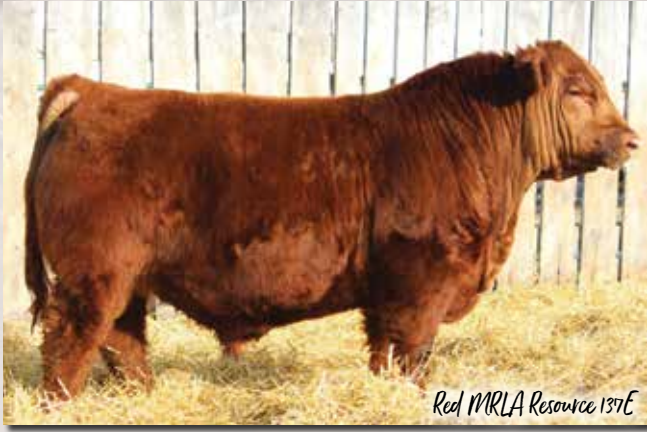
Red MRLA Resource 137E