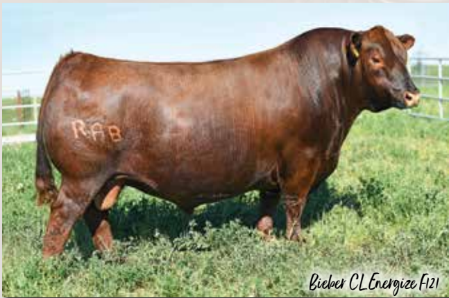
Bieber CL Energize F121

C-T Miss Pan 5091 was the high selling cow in the 2021 Big Sky Elite sale for $14,000. We chose to partner with the Hickle family because of this cows outstanding foot and leg structure, perfect udder and her production record. Combining the very best cow families from the C-T herd in Miss Pan and the Feddes herd in the Sleek cow family has proved to work very well. She boasts an MPPA of 106 and never misses. Her first son sold to Cross Canyon Ranch and was one of the top sellers that year. A full sister to these embryos was a highly talked about heifer at Bet On Red in 2022 selling to the Cox family in Washington. Resource 137E needs no introduction. His daughters are some of the top young cows in our herd and this mating could very well produce a donor cow or a herd bull. 5091 is a cow that we continue to flush and are excited to keep getting calves out of.