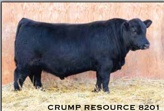
CRUMP RESOURCE 8201

95% 91% 63% 52% 40% 41% 55% 30% 15% 84% 90% 77% 61% 57% 70% 51%