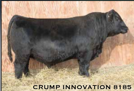
CRUMP INNOVATION 8185