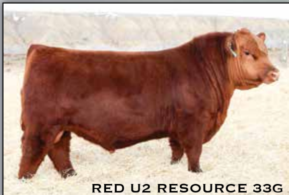
RED U2 RESOURCE 33G