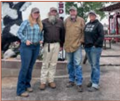
Our Aussie friends