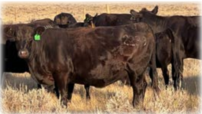
PRA Bulldogger's Dam at Age 14