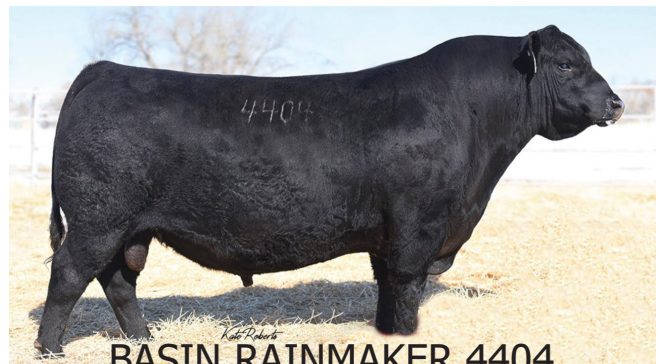
BASIN RAINMAKER 4404