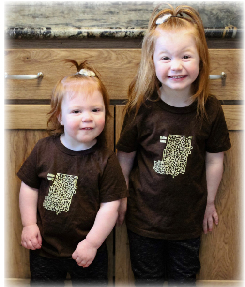
Aspen and Nova