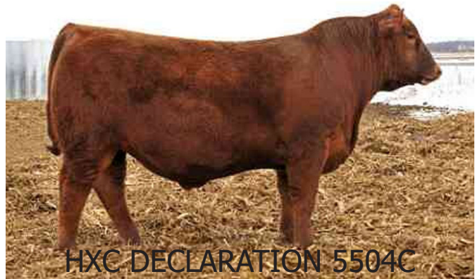
HXC DECLARATION 5504C