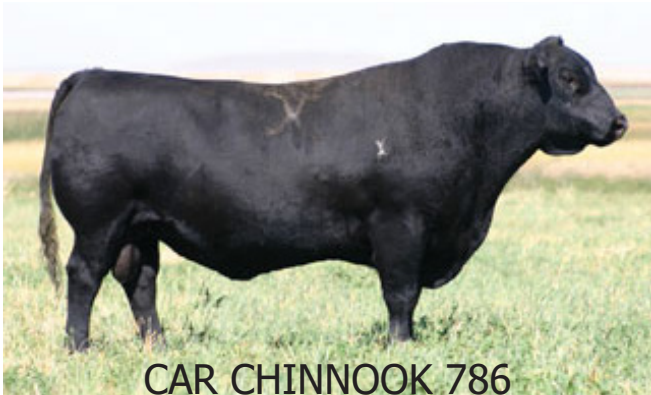
CAR CHINNOOK 786