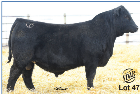
VDAR Lone Peak 2311 20150778 CE BW W/W YW SC Milk $W $F +13 -.5 +51 +94 +.82 +34 +49 +89 Sire: VDAR Lone Peak 5157 Dam: VDAR Polly 8343 MGS: VDAR Showdown 7236