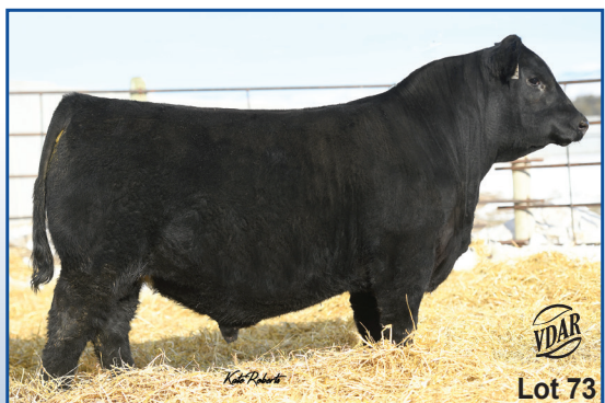
VDAR Showdown 2501 Reg. 20011354 CE BW WW YW SC Milk $W $F +2 +2.9 +70 +118 -.29 +27 +69 +85 Sire: VDAR Showdown 7236 Dam: VDAR Polly 6231 MGS: VDAR Churchill 1063