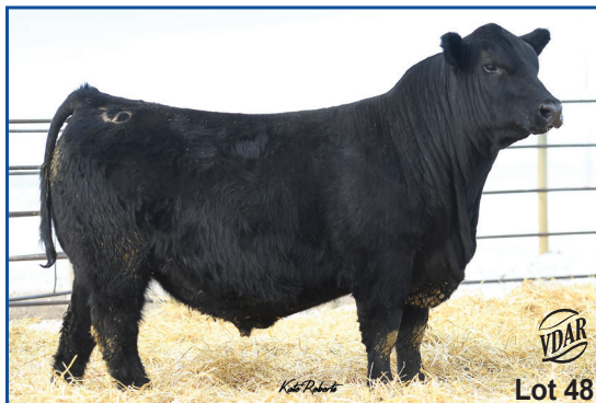
VDAR Resilient 2421 Reg. 20012573 CE BW WW YW SC Milk $W $F +8 +.8 +75 +136 +1.18 +24 +80 +95 Sire: Sitz Resilient 10208 Dam: VDAR Lass 8336 MGS: VDAR Showdown 7236