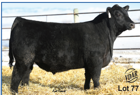
VDAR Showdown 2581 20011362 CE BW W/W YW SC Milk $W $F +9 +.5 +56 +95 +.59 +23 +59 +82 Sire: VDAR Showdown 7236 Dam: VDAR Miss Wix 4377 MGS: VDAR Game Day 7061