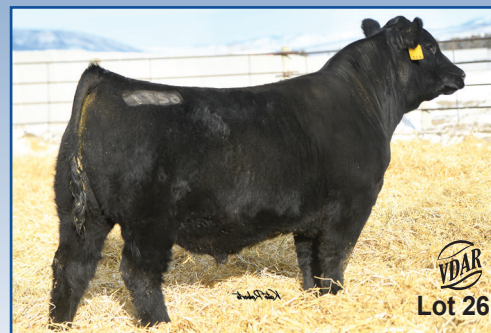
VDAR Sonny Boy 6271 20180773 CE BW W/W YW SC Milk $W $F +10 +1.3 +59 +94 +.64 +26 +68 +52 Sire: VDAR Sonny Boy 1194 Dam: VDAR Chloe 5873 MGS: VDAR Stout 1623