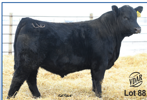
VDAR High Caliber 6291 *20185684 CE BW W/W YW SC Milk $W $F +6 +3.4 +55 +92 +1.52 +33 +61 +64 Sire: VDAR High Caliber Dam: VDAR Lass 4100 MGS: VDAR Cedar Wind 8111