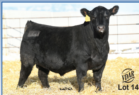
VDAR Sonny Boy 6431 20180763 CE BW W/W YW SC Milk $W $F +9 +2.9 +58 +110 +.91 +38 +67 +88 Sire: VDAR Sonny Boy 6431 Dam: VDAR Beauty 9748 MGS: Hero 6267 of RR 2418