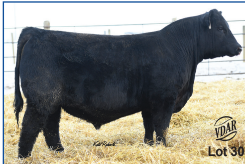
VDAR Gallatin 2181 20011333 CE BW W/W YW SC Milk $W $F +7 +1.3 +54 +96 +.74 +20 +49 +46 Sire: VDAR Gallatin 7586 Dam: VDAR Rita 6219 MGS: Ginger Hill Treasure 233