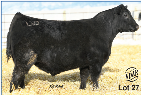
VDAR Sonny Boy 6411 20180749 CE BW W/W YW SC Milk $W $F +9 +.7 +43 +79 +.88 +24 +42 +67 Sire: VDAR Sonny Boy 1194 Dam: VDAR Elluna 5825 MGS: Wulffs Ext 6106