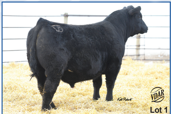
VDAR Cedar Wind 2031 Reg. 20011321 CE BW WW YW SC Milk $W $F +3 +3.8 +84 +141 +.86 +23 +77 +99 Sire: VDAR Cedar Wind 2031 Dam: VDAR Polly 9225 MGS: VDAR Showdown 7236

Great Bulls can only come from Great Cows