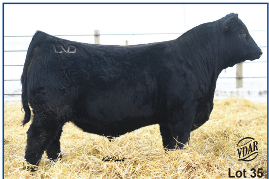
VDAR Gallatin 6511 Reg. 200180791 CE BW WW YW SC Milk $W $F +5 +2.4 +52 +100 +.17 +33 +57 +72 Sire: VDAR Gallatin 7586 Dam: VDAR Elluna 8128 MGS: VDAR Black Train 1243