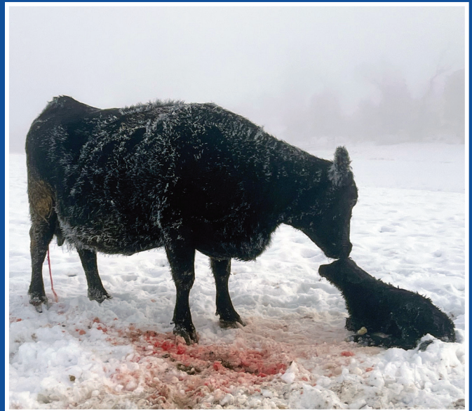
They better be able to mother calves in this environment!

The most important maternal trait of all! For over 20 years, we have eliminated all cows from our herd that do not breed in the first 42 days of the breeding season, and trust me when I say that when we