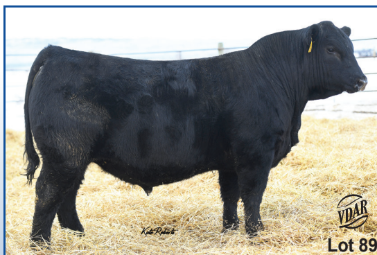
VDAR High Caliber 6001 20185585 CE BW WW YW SC Milk $W $F +6 +1.2 +57 +105 +.88 +33 +71 +99 Sire: VDAR High Caliber Dam: VDAR Lass 4100 MGS: VDAR Cedar Wind 8111