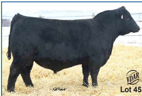
VDAR Resilient 2171 20013127 CE BW W/W YW SC Milk $W $F +9 -.4 +72 +119 +.85 +29 +88 +86 Sire: Sitz Resilient 10208 Dam: VDAR Lucy 8302 MGS: VDAR Cedar Wind 8111