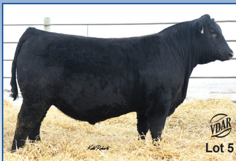
VDAR Cedar Wind 2141 20011331 CE BW W/W YW SC Milk $W $F +6 -.8 +55 +101 +.79 +33 +70 +79 Sire: VDAR Cedar Wind 5126 Dam: VDAR Rita 5313 MGS: Dars Walk On 4 Traveler 584