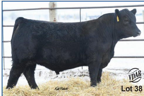
VDAR Gallatin 6591 20180803 CE BW W/W YW SC Milk $W $F +7 +1.8 +66 +119 +.07 +29 +69 +84 Sire: VDAR Gallatin 7586 Dam: VDAR Lass 8144 MGS: HA Yellowstone 4025