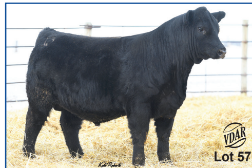
VDAR MAGA 2461 20011350 CE BW W/W YW SC Milk $W $F +7 +2.6 +54 +103 +1.27 +21 +47 +80 Sire: VDAR Maga 3068 Dam: VDAR Miss Wix 7930 MGS: VDAR Churchill 1063