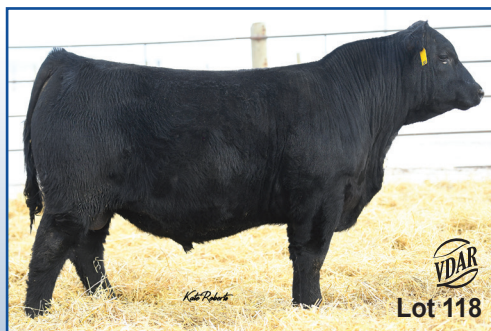
VDAR Lone Peak 6221 20180665 CE BW W/W YW SC Milk $W $F +7 +1.5 +50 +96 +1.25 +21 +43 +81 Sire: VDAR Lone Peak 2157 Dam: VDAR Lass 9016 MGS: Crook Mt Hero 116