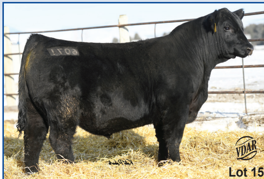
VDAR Sonny Boy 6071 Reg. 20180775 CE BW WW YW SC Milk $W $F +6 +2.6 +58 +102 +1.13 +15 +41 +74 Sire: VDAR Sonny Boy 1194 Dam: VDAR Lucy 4148 MGS: VDAR Black Cedar 8380