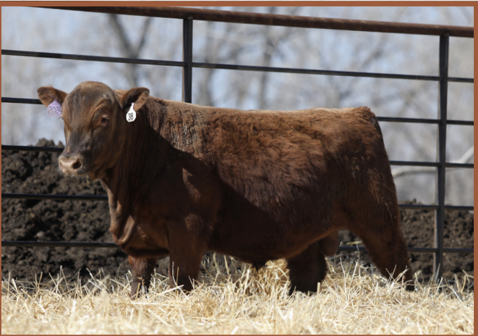
Lot 38 253K BLAZIN PROFIT 2024 DOB: 03-30-2020 REG: 4397393 TATTOO: 2024

WFL MERLIN 018A WFL PROFITMAKER E7030 WFL PROSPECT 5L HOT SHOT 2370-186A VGW HS-DORY 1543 VGW 554T-DORY 1006 LJC MERLIN T179 WFL COMMITMENT 042Y LSF PROSPECT 2035Z WFL HOB0 140Z 5L BLAZIN KIND 189-228Y 5L MARTHA 425-2370 RED SSS OLY 554T VGW RT-DORY 0822