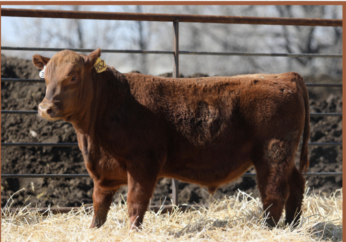
Lot 32 COMMERCIAL DOB: REG: TATTOO: 0152

BUF CRK THE RIGHT KIND U199 5L INDEPENDENCE 560-298Y 5L BLACK ADINA 525-560 LSF HERDBUILDER 1058Y TBJR MISS SENSATION 535 SRR MISS SENSATION 196 BUF CRK LANCER R017 BUF CRK SHOSHONE R353 TC STOCKMAN 365 5L ADINA 293-525 BECKTON EPIC R397 K LSF COVER GIRL S6076 W9037 BASIN EXT 7455 SRR MISS SENSATION 6002-5220