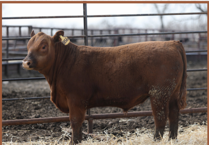
Lot 51 LIKE TAKEDOWN 0156 DOB: 02-26-2020 REG: 4398255 TATTOO: 0156

LSF TAKEOVER 9943W LSF TBJ TAKEDOWN 4857B SRR DORY-JIBA 0121-663 MUSHRUSH IMPRESSIVE CA U236 TBJR JIBA 451 LSF JIBA K1004 S6142 HXC CONQUEST 4405P LSF WIDELOAD R5014 U8061 BASIN EXT 7455 SRR DORY JIBA 663-784 BUF CRK LANCER R017 MUSHRUSH MADAM LT R265 LCC MARIO 1889J LCC JIBA K1004