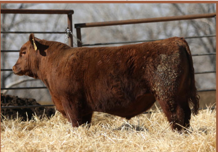
Lot 61 LIKE REDEMPTION 0131 DOB: 02-26-2020 REG: 4398225 TATTOO: 0131

BECKTON NEBULA P P707 BROWN JYJ REDEMPTION Y1334 JYJ MS JOLENE W16 LSF HERDBUILDER 1058Y TBJR GILDA 561 LSF GILDA D1017 S6016 BECKTON NEBULA M045 BECKTON LANA M809 EP LJC MISSION STATEMENT P27 HXC JOLENE R548 BECKTON EPIC R397 K LSF COVER GIRL S6076 W9037 LCC CHEYENNE B221L LCHMN GILDA D1017