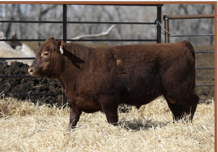
Lot 68 253K EPIC SUMMER 2011 DOB: 03-23-2020 REG: 4397381 TATTOO: 2011

BECKTON NEBULA M045 BROWN ULTIMATE X7752 BROWN MS OBJECTIVE U7837 SUM TOTAL 508 253K SUMMER JO 1742 VGW JO-MERCEDES 1572 BECKTON NEPTUNE R2 K065 BECKTON BELGA K285 JL S S OBJECTIVE T510 OT26 BROWN MS ABIGRACE L7730 BECKTON NEBULA Y066 N4 JW BAR ZIKA S446 LSF JOURNEY 1169Y VGW 819-MERCEDES 0940