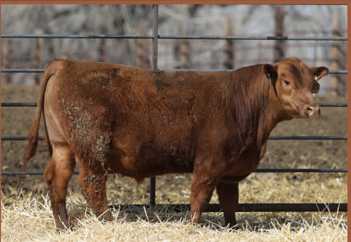
Lot 6 LIKE PLATINUM 0126 DOB: 02-26-2020 REG: 4398219 TATTOO: 0126

BROWN INCREDABULL Z7277 LSF MEW PLATINUM 5660C BROWN MS NEW STANDARD A7053 LSF JBOB EXPECTATION 6034S TBJR DELLA 326 LSF DELLA G1382 K1449 S A V FINAL ANSWER 0035 BROWN MS MISSION STMT X7559 LCC NEW STANDARD BROWN MS DESTINATION U7733 LCHMN ENTERPRISE 1370H LSF SWEETNESS J1358 P4085 LCHMN NO EQUAL 1174D PARK ROBIN HOOD G1382