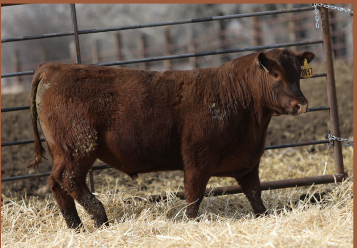
Lot 64 COMMERCIAL DOB: REG: TATTOO: 0147

LSF HERDBUILDER 1058Y TBJR JOAN 441 SRR JOAN 0131-8001 BECKTON EPIC R397 K LSF COVER GIRL S6076 W9037 LAUBACH CHALLENGER 8095 SRR JOAN 8001-501