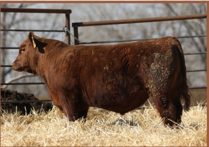
Lot 9 LIKE TABASCO 0142 DOB: 02-14-2020 REG: 4398241 TATTOO: 0142

BROWN JYJ REDEMPTION Y1334 LSF TBJ TABASCO 5830C LSF TBJ GILDA X0061 A3428 BASIN FUTURE DIRECTION 7303 SRR DORY JIBA 127 SRR DORY JIBA 5036-930 BECKTON NEBULA P P707 JYJ MS JOLENE W16 BECKTON EPIC R397 K LSF GILDA S6107 X0061 BASIN FUTURE DIRECTION 07P1 BASIN LAURIE 3021 LCC MAJOR LEAGUE A502M LARSON DORY JIBA 930