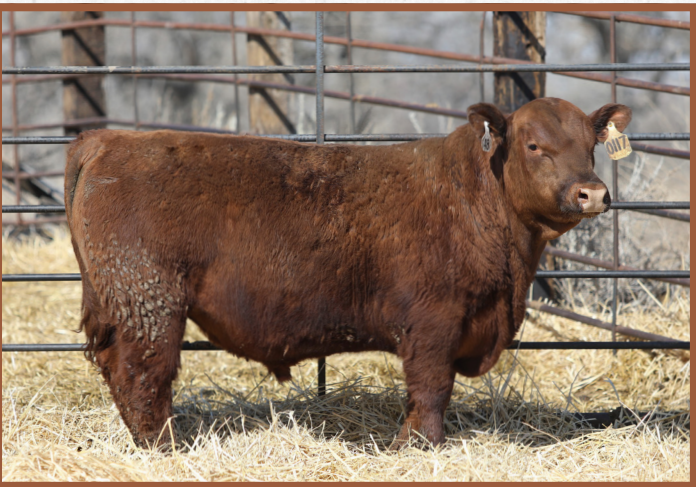
Lot 48 LIKE REDEMPTION 0117 DOB: 02-17-2020 REG: 4398205 TATTOO: 0117

BECKTON NEBULA P P707 BROWN JYJ REDEMPTION Y1334 JYJ MS JOLENE W16 MUSHRUSH IMPRESSIVE CA U236 TBJR DORY JIBA 461 SRR DORY-JIBA 0121-663 BECKTON NEBULA M045 BECKTON LANA M809 EP LJC MISSION STATEMENT P27 HXC JOLENE R548 BUF CRK LANCER R017 MUSHRUSH MADAM LT R265 BASIN EXT 7455 SRR DORY JIBA 663-784