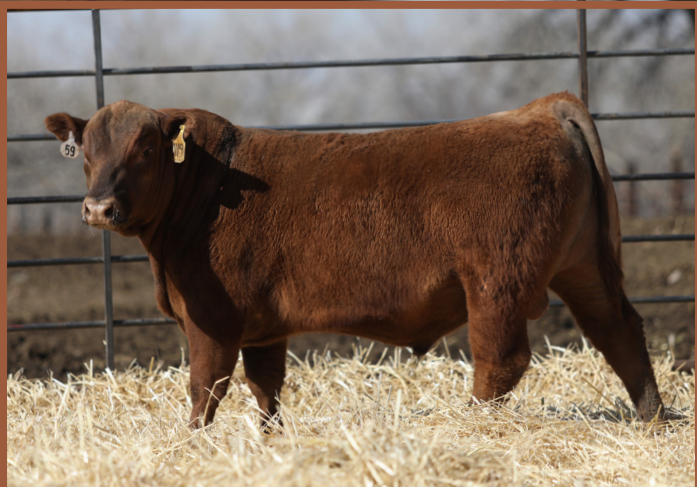
Lot 59 COMMERCIAL DOB: REG: TATTOO: 0119

BHR KING 167 BCRR BLOXY 3202A BCRR BLOXY 967W BAR M MR KING 9002 MISS BHR GALAXY 8229 ROY ROGERS 5604 LCC BLOXY NA590