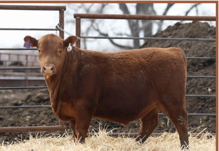
Lot 26 253K EPIC TANK 2015 DOB: 03-24-2020 REG: 4397383 TATTOO: 2015

BECKTON EPIC K F075 BECKTON EPIC R397 K BECKTON KIT F468 JL LARSON PALADIN 238 VGW PAL-FIREFLY 1588 VGW 396V-FIREFLY 1085 BECKTON EPIC D404 BECKTON BELGA D483 KR BECKTON JULIAN GG B571 BECKTON KIT A517 NP LARSON HIGH NOON 881 LARSON TAMARACK 839-609 5L RED TRADER 1416-396V VGW 819-FIREFLY 0505