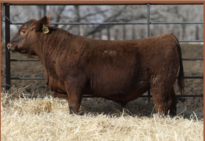
Lot 2 LIKE RANCHBUILDER 0150 DOB: 02-21-2020 REG: 4398247 TATTOO: 0150

LSF SRR TYSON 3025A TBJR RANCH BUILDER 5775D TBJR LANA 403 BECKTON EPIC R397 K LSF TBJ CRYSTAL R5145 A3430 LSF CRYSTAL LA394 R5145 MUSHRUSH IMPRESSIVE CA U236 LSF JIBA R5009 W9247 LSF HERDBUILDER 1058Y KCC LANA Z2 BECKTON EPIC K F075 BECKTON KIT F468 JL LCC RIBEYE A133L LSF CRYSTAL G1382 LA394