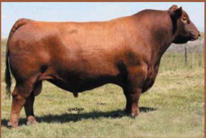
RED FINE LINE MULBERRY 26P REG: 1151261