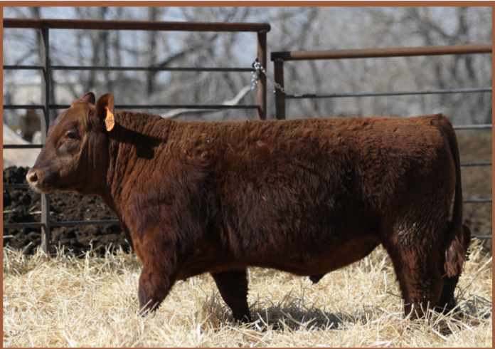
Lot 36 LIKE PLATINUM 0186 DOB: 02-20-2020 REG: 4398289 TATTOO: 0186

BROWN INCREDABULL Z7277 LSF MEW PLATINUM 5660C BROWN MS NEW STANDARD A7053 TBJR REAL TIME 390Z LIKE IT LAKOTA 667 TBJR LAKOTA 423 S A V FINAL ANSWER 0035 BROWN MS MISSION STMT X7559 LCC NEW STANDARD BROWN MS DESTINATION U7733 AHL ABOUT TIME 113Y SRR KIMA 0185-627 LSF REQUEST 2015Z SRR LAKOTA 120