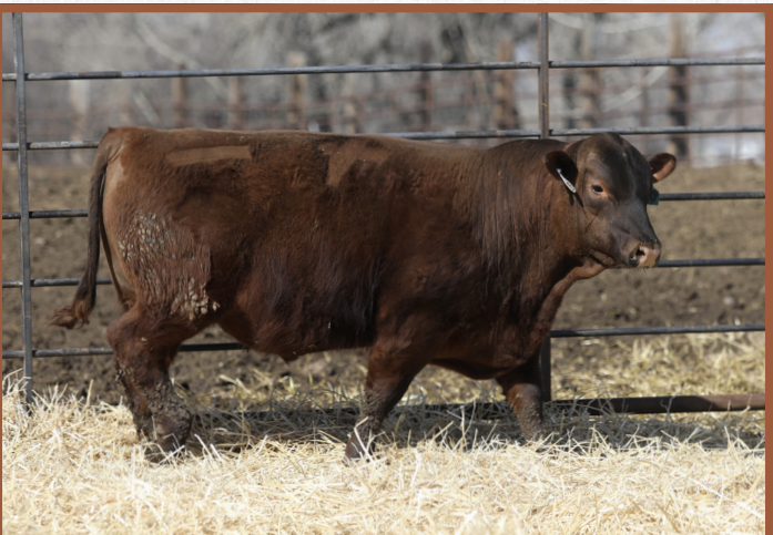
Lot 25 FCR MATT DILLON 040 DOB: 03-13-2020 REG: 4401891 TATTOO: 040

PIE ONE OF A KIND 510 FEDDES ONE KIND D39-8210 FEDDES BLOCKANA A30-D39 LSF WIDE SPREAD 0052X RAISLAND REDBIRD 246-007 RAISLAND ROBLOW 007-501 PIE ONE OF A KIND 352 GEF CUTTING QUEEN 354A BROWN JYJ REDEMPTION Y1334 FEDDES BLOCKANA Y25 A30 MESSMER PACKER S008 LSF DINA C1001 S6099 LEACHMAN ROB LOW 1115G KRN RED HEAVEN 501-113