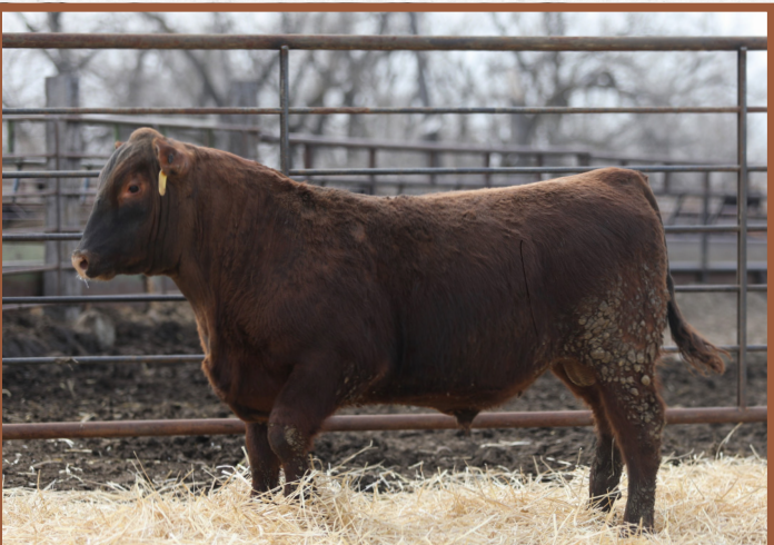
Lot 14 LIKE RANCH BUILDER 0123 DOB: 02-13-2020 REG: 4398213 TATTOO: 0123

LSF SRR TYSON 3025A TBJR RANCH BUILDER 5775D TBJR LANA 403