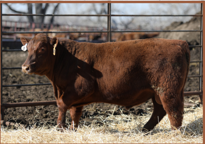
Lot 5 LIKE RANCHBUILDER0187 DOB: 02-13-2020 REG: 4398291 TATTOO: 0187

LSF SRR TYSON 3025A TBJR RANCH BUILDER 5775D TBJR LANA 403 RED BRYLOR WEST JET 69W RED BRYLOR ANNIE 240U-220Z RED BRYLOR ANNIE 240U MUSHRUSH IMPRESSIVE CA U236 LSF JIBA R5009 W9247 LSF HERDBUILDER 1058Y KCC LANA Z2 RED FLYING K AMBUSH 6T RED FLYING K LASSIE 3T RED BRYLOR BODASIUS 79K RED CRESCENT CREEK ANNIE 1G