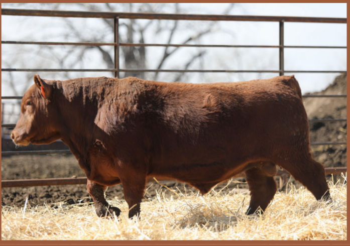
Lot 43 COMMERCIAL DOB: REG: TATTOO: 0177

BUF CRK THE RIGHT KIND U199 5L INDEPENDENCE 560-298Y 5L BLACK ADINA 525-560 LCC NEW CHAPTER A705L LSF CRYSTAL LA394 S6144 LSF CRYSTAL G1382 LA394 BUF CRK LANCER R017 BUF CRK SHOSHONE R353 TC STOCKMAN 365 5L ADINA 293-525 BFCK CHEROKEE CNYN 4912 MISS LL ROB LOW 929 LCHMN TOP BRASS 1049H PARK ROBIN HOOD G1382