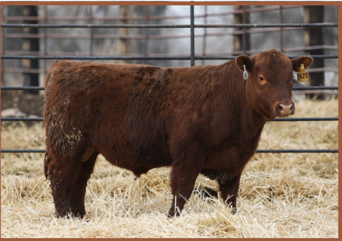
Lot 45 LIKE REDEMPTION 0122 DOB: 02-14-2020 REG: 4398211 TATTOO: 0122

BECKTON NEBULA P P707 BROWN JYJ REDEMPTION Y1334 JYJ MS JOLENE W16 DUNN SLEEP EASY A520 TBJR DELLA 552 FEDDES BLOCKANA Z75 BECKTON NEBULA M045 BECKTON LANA M809 EP LJC MISSION STATEMENT P27 HXC JOLENE R548 BROWN ALLIANCE X7795 DUNN REBALAS 1003 BECKTON EPIC R397 K LSF DELLA P4078 U8051