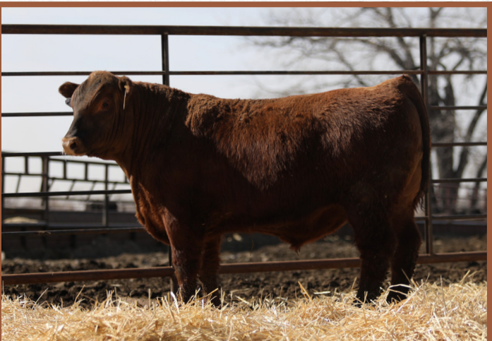
Lot 24 LIKE IT HI LINE 0124 DOB: 04-07-2020 REG: 4398215 TATTOO: 0124

5L DEFENDER 560-30Z LIKE IT HI LINE 7239 LSF CRYSTAL LA394 S6144 5L INDEPENDENCE 560-298Y LIKE IT JIBA 6140 LSF JIBA K1004 S6142 5L ADVOCATE 817-14W 5L BLACK ADINA 525-560 LCC NEW CHAPTER A705L LSF CRYSTAL G1382 LA394 BUF CRK THE RIGHT KIND U199 5L BLACK ADINA 525-560 LCC MARIO 1889J LCC JIBA K1004