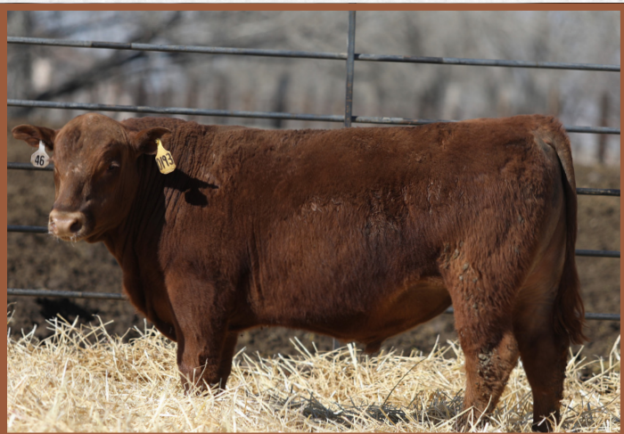
Lot 46 LIKE PLATINUM 0193 DOB: 02-25-2020 REG: 4398197 TATTOO: 0193

BROWN INCREDABULL Z727 LSF MEW PLATINUM 5660C BROWN MS NEW STANDARD A7053 BCRR SUMMIT 925W BCRR WINDSONG 3234A PAULS WINDSONG 055 S A V FINAL ANSWER 0035 BROWN MS MISSION STMT X7559 LCC NEW STANDARD BROWN MS DESTINATION U7733 RED FINE LINE MULBERRY 26P BCRR OPAL 6130S PAULS CHIEFLINE 5140 PAULS WINDSONG 4110