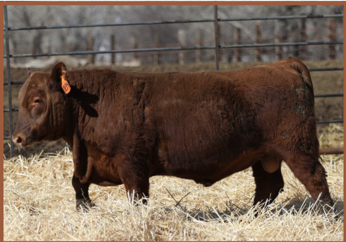
Lot 11 LIKE RANCH BUILDER 0134 DOB: 02-16-2020 REG: 4398229 TATTOO: 0134

ANDRAS NEW DIRECTION R240 FLATIRON NEW DIRECTION 622 FLATIRON NATIVE FOX 260