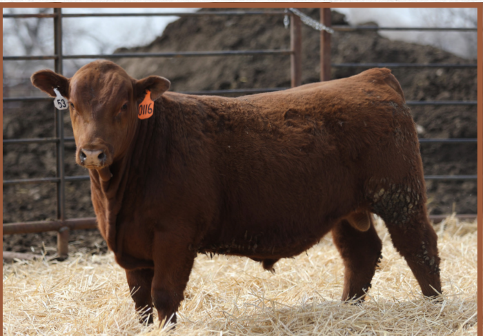
Lot 53 LIKE DBL UP 0116 DOB: 03-11-2020 REG: 4398203 TATTOO: 0116

FISCHER DBL CHECK 427 FISCHER DBL UP 746 SUTH ALLI SPECS 9046 LSF RHO TITONKA Z721 LIKE IT LARKABA 764-524 TBJR LARKABA 524 FISCHER C'MON MAN 152 FISCHER DESTINY 2755 FISCHER MEETS SPECS 7540 5C SPECIAL ALLI 657S BUF CRK THE RIGHT KIND U199 MONTVUE 10K RACHILLE U393 LSF PROSPECT 2035Z LSF LARKABA F1288 R5135