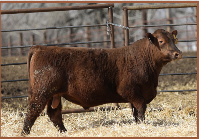
Lot 18 COMMERCIAL DOB: REG: TATTOO: 0192

PIE ONE OF A KIND 352 LIKE IT LAKOTA 611 TBJR LAKOTA 414