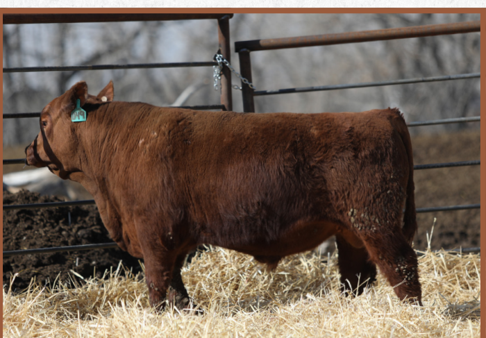
Lot 52 FCR DOC HOLIDAY 049 DOB: 03-30-2020 REG: 4394945 TATTOO: 049

ANDRAS NEW DIRECTION R240 FLATIRON NEW DIRECTION 622 FLATIRON NATIVE FOX 260 RED NORTHLINE FAT TONY 605U OWNG ANNABELLE 1513 ECHO CLENE 6503 ANDRAS IN FOCUS B152 ANDRAS KURUBA B111 BECKTON EPIC R397 K BCRR NATIVE FOX 031X RED SVR GANGSTER 14S RED NORTHLINE RUBY 0305N GLACIER LOGAN 210 ECHO PRENTISS 9522