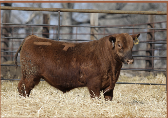
Lot 3 LIKE TAKEDOWN 0185 DOB: 02-26-2020 REG: 4398287 TATTOO: 0185

LSF TAKEOVER 9943W LSF TBJ TAKEDOWN 4857B SRR DORY-JIBA 0121-663 SUTH UNLEADED 140X TBJR BLOCKANA 338 SRR BLOCKANNA 197 HXC CONQUEST 4405P LSF WIDELOAD R5014 U8061 BASIN EXT 7455 SRR DORY JIBA 663-784 SIX MILE UNLEADED 561U SUTH CANYON SKY 7043 VGW WARRIOR 969 SRR BLOCKANA,179