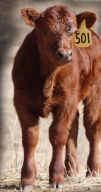
Stout – Healthy Calves

Cows like this... offered "only in a dispersion"