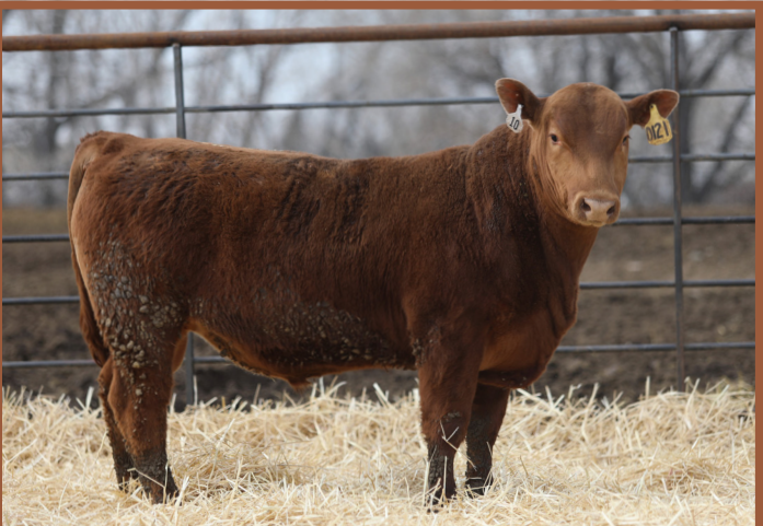
Lot 10 LIKE REDEMPTION 0121 DOB: 02-26-2020 REG: 4398209 TATTOO: 0121

BECKTON NEBULA P P707 BROWN JYJ REDEMPTION Y1334 JYJ MS JOLENE W16 LSF PROSPECT 2035Z TBJR RAINDANCE 5129 LSF RAINDANCE H1387 R5169 BECKTON NEBULA M045 BECKTON LANA M809 EP LJC MISSION STATEMENT P27 HXC JOLENE R548 LSF NIGHT CALVER 9921W LSF BLACKBIRD N3080 X0406 BROWN VACATION H7106 LSF ON TARGET H1387