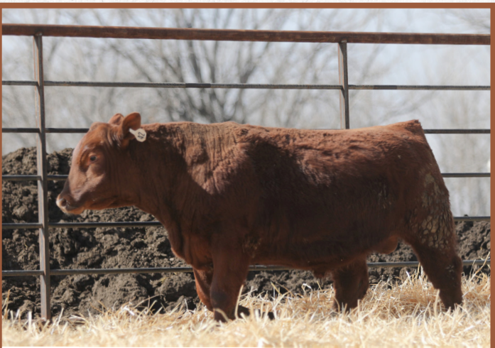
Lot 42 FCR GRAND DECLARATION 031 DOB: 02-25-2020 REG: 4394939 TATTOO: 031

LEACHMAN PLEDGE A282Z HXC DECLARATION 5504C HXC190Y BROWN JYJ REDEMPTION Y1334 C-T MISS PAN 5003 C-T MISS PAN 3006 LSF NEXTPECTION 0083X LCOC ZARA TG004 BECKTON NEBULA P P707 HXC ELLIE MAY MA638 BECKTON NEBULA P P707 JYJ MS JOLENE W16 C-T GRAND STATEMENT 1025 C-T MISS PAN 0922