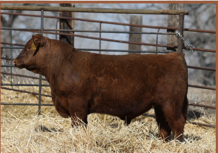
Lot 16 LIKE TAKEDOWN 0100 DOB: 02-02-2020 REG: 4398183 TATTOO: 0100

LSF TAKEOVER 9943W LSF TBJ TAKEDOWN 4857B SRR DORY-JIBA 0121-663