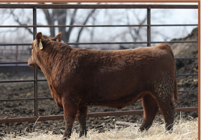
Lot 66 LIKE REDEMPTION 0176 DOB: 02-20-2020 REG: 4398277 TATTOO: 0176

BECKTON NEBULA P P707 BROWN JYJ REDEMPTION Y1334 JYJ MS JOLENE W16 FED FLIKK MULBERRY X648 FEDDES BLOCKANA Z75 FEDDES BLOCKANA 9134 BECKTON NEBULA M045 BECKTON LANA M809 EP LJC MISSION STATEMENT P27 HXC JOLENE R548 RED FINE LINE MULBERRY 26P MEADO-WEST STELLA FEDDES BIG SKY R9 FEDDES BLOCKANA 7112