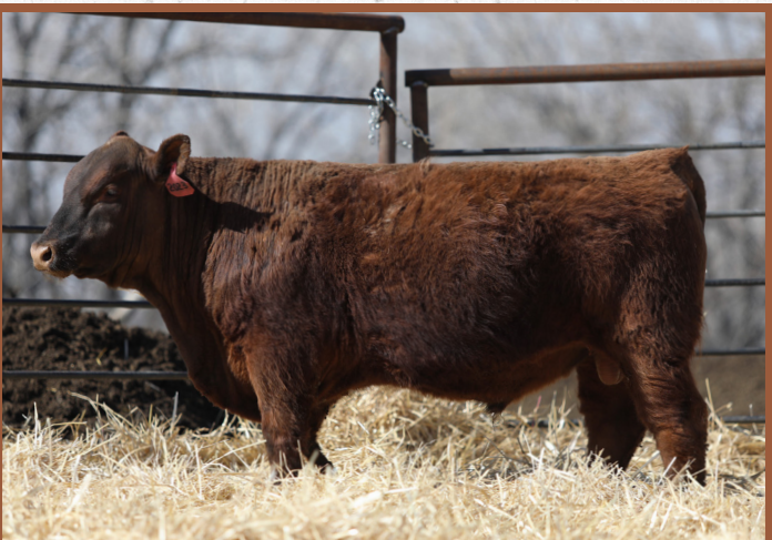
Lot 63 253K ULTIMATE ZEUS 2023 DOB: 03-28-2020 REG: 4397391 TATTOO: 2023

BECKTON NEBULA M045 BROWN ULTIMATE X7752 BROWN MS OBJECTIVE U7837 RED SIX MILE SAKIC 832S 253K BERRY 501C 83X MATTIE 305A BECKTON NEPTUNE R2 K065 BECKTON BELGA K285 JL S S OBJECTIVE T510 OT26 BROWN MS ABIGRACE L7730 RED SIX MILE AVIATOR 217P RED SIX MILE SIERA 257P J5 MAESTRO 83X J5 913 BECKY 109Y