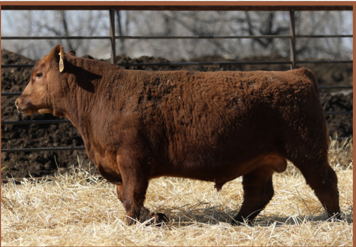
Lot 22 LIKE PLATINUM 0136 DOB: 02-22-2020 REG: 4398233 TATTOO: 0136