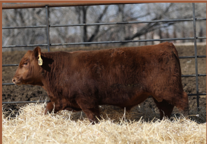
Lot 58 LIKE MULBERRY 0169 DOB: 02-25-2020 REG: 4398267 TATTOO: 0169

RED COMPASS MULBERRY 449M RED FINE LINE MULBERRY 26P RED DUS FAYETTE 8G RED HR RAMBO ET 91K RED BRYLOR MISS ROC 20H SILVEIRAS REDFORD RED MC DOUGALL FAYETTE 59A PIE ONE OF A KIND 352 LIKE IT CRYSTAL 6100 LSF CRYSTAL LA394 R5145 BUF CRK THE RIGHT KIND U199 PIE FAYETTE 1160 LCC RIBEYE A133L LSF CRYSTAL G1382 LA394