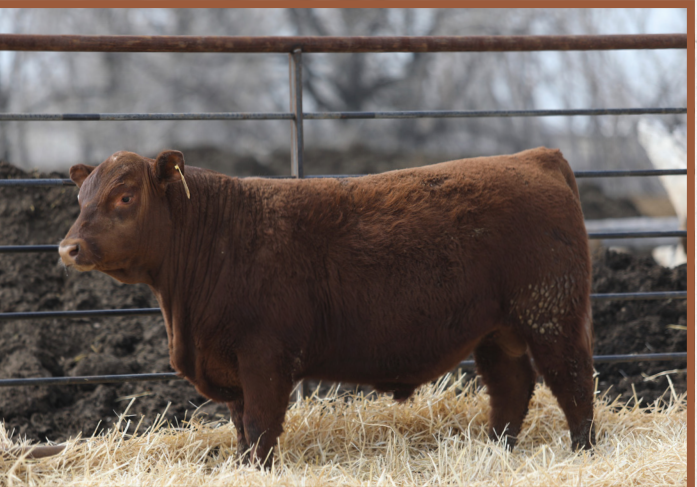
Lot 35 LIKE HI LINE 0108 DOB: 03-08-2020 REG: 4398193 TATTOO: 0108

5L DEFENDER 560-30Z LIKE IT HI LINE 7239 LSF CRYSTAL LA394 S6144 LSF PROSPECT 2035Z TBJR DINA 508 TBJR DINA 328 5L ADVOCATE 817-14W 5L BLACK ADINA 525-560 LCC NEW CHAPTER A705L LSF CRYSTAL G1382 LA394 LSF NIGHT CALVER 9921W LSF BLACKBIRD N3080 X0406 A A R TEN X 7008 S A LSF DINA N3033 R5028