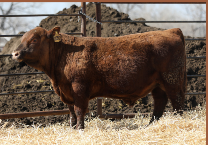
Lot 31 COMMERCIAL DOB: REG: TATTOO: 0120

TBJR BEEF4DINNER 3850A LIKE IT DELLA 645 LSF TBJ DELLA U8051 A3433 LSF BOXED BEEF 9063W SRR KIMA 0185-627 BECKTON EPIC R397 K LSF DELLA P4078 U8051