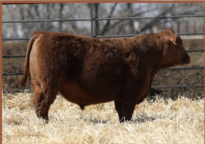
Lot 28 LIKE CERTIFIED BEEF 0181 DOB: 02-25-2020 REG: 4398283 TATTOO: 0181

LSF SRR TYSON 3025A TBJR CERTIFIED BEEF 5781B LSF LARKABA 59J R5195 BASIN FUTURE DIRECTION 7303 SRR LAKOTA 17 SRR LAKOTA 9163-792 MUSHRUSH IMPRESSIVE CA U236 LSF JIBA R5009 W9247 LCHMN ENTERPRISE 1370H CV 6384 LARKABA 59J BASIN FUTURE DIRECTION 07P1 BASIN LAURIE 3021 BASIN EXT 7455 SRR LAKOTA 792-201