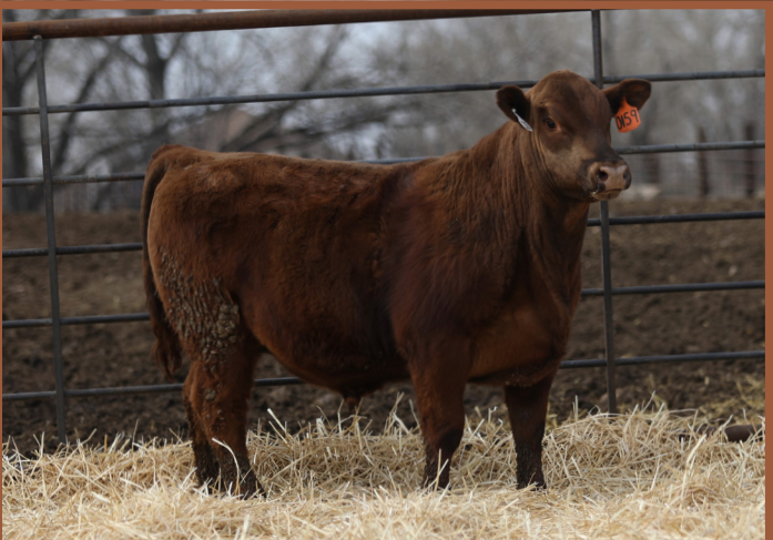
Lot 33 COMMERCIAL DOB: REG: TATTOO: 0159

BROWN JYJ REDEMPTION Y1334 LIKE IT JOAN 708-441 TBJR JOAN 441 BECKTON NEBULA P P707 JYJ MS JOLENE W16 LSF HERDBUILDER 1058Y SRR JOAN 0131-8001