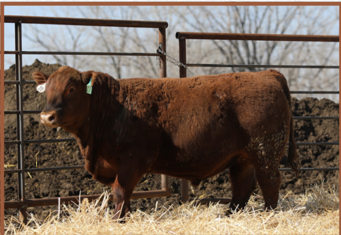
Lot 20 FCR HOSS 027 DOB: 02-23-2020 REG: 4394937 TATTOO: 027

LEACHMAN PLEDGE A282Z HXC DECLARATION 5504C HXC190Y LSF SRR TYSON 3025A RAISLAND LAKOTA 715-261 RAISLAND LAKOTA 261-650 LSF NEXTPECTION 0083X LCOC ZARA TG004 BECKTON NEBULA P P707 HXC ELLIE MAY MA638 MUSHRUSH IMPRESSIVE CA U236 LSF JIBA R5009 W9247 SUNR GRAVITY FORCE 755W RAISLAND LAKOTA 650-541