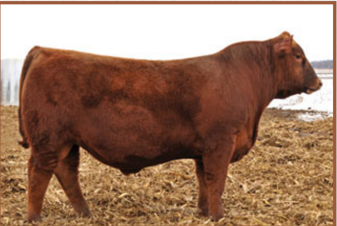
HXC DECLARATION 5504C REG: 3494198