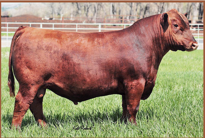
LSF MEW PLATINUM 5660C REG: 1751232