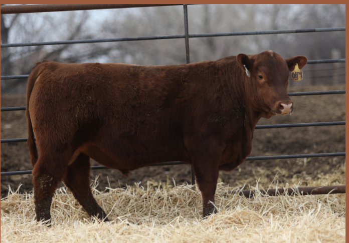
Lot 15 LIKE RANCH BUILDER 0114 DOB: 02-26-2020 REG: 4398201 TATTOO: 0114

LSF SRR TYSON 3025A TBJR RANCH BUILDER 5775D TBJR LANA 403