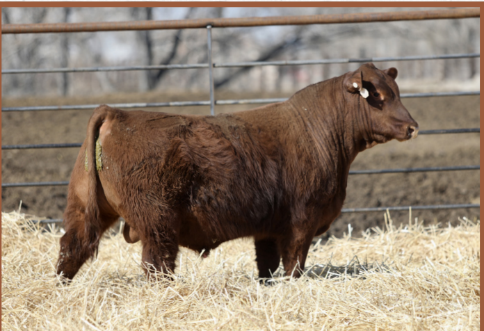
Lot 30 FCR CARTWRIGHT 043 DOB: 03-24-2020 REG: 4394947 TATTOO: 043

ANDRAS NEW DIRECTION R240 FLATIRON NEW DIRECTION 622 FLATIRON NATIVE FOX 260 RED NORTHLINE FAT TONY 605U SUTH FAT HAWKEYE 1009 SUTH DREAMER HAWKEYE 7076 ANDRAS IN FOCUS B152 ANDRAS KURUBA B111 BECKTON EPIC R397 K BCRR NATIVE FOX 031X RED SVR GANGSTER 14S RED NORTHLINE RUBY 0305N FRITZ DREAMER 4070 SUTH HEAVENLY HAWKEYE 101N