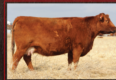
Cow herd is under a strict health program