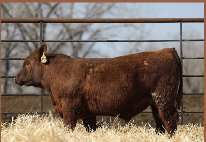
Lot 4 LIKE TAKEDOWN 0144 DOB: 02-15-2020 REG: 4398245 TATTOO: 0144

LSF TAKEOVER 9943W LSF TBJ TAKEDOWN 4857B SRR DORY-JIBA 0121-663 LAUBACH CHALLENGER 8095 SRR LAKOTA 1136 SRR DINA 928-656 HXC CONQUEST 4405P LSF WIDELOAD R5014 U8061 BASIN EXT 7455 SRR DORY JIBA 663-784 FORSTER CHALLENGER 5022 LAUBACH LARKABA 402 SRR NORSKI 723 SRR LAKOTA 656-100