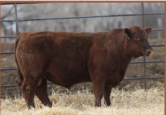
Lot 23 FCR FLAT DIRECTION 048 DOB: 03-29-2020 REG: 4394935 TATTOO: 023

ANDRAS NEW DIRECTION R240 FLATIRON NEW DIRECTION 622 FLATIRON NATIVE FOX 260 ANDRAS NEW DIRECTION R240 DKK PEACE 7075 DKK PEACE 9070 ANDRAS IN FOCUS B152 ANDRAS KURUBA B111 BECKTON EPIC R397 K BCRR NATIVE FOX 031X ANDRAS IN FOCUS B152 ANDRAS KURUBA B111 MESSMER PACKER S008 DKK PEACE 991