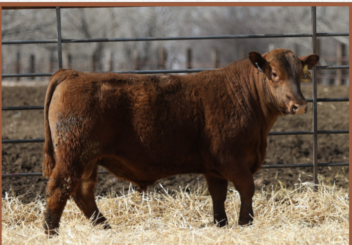
Lot 17 LIKE TAKEDOWN 0106 DOB: 02-27-2020 REG: 4398191 TATTOO: 0106

LSF TAKEOVER 9943W LSF TBJ TAKEDOWN 4857B SRR DORY-JIBA 0121-663