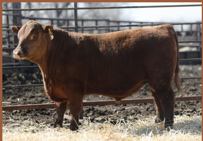
Lot 13 LIKE TAKEDOWN 0135 DOB: 02-26-2020 REG: 4398231 TATTOO: 0135

LSF TAKEOVER 9943W LSF TBJ TAKEDOWN 4857B SRR DORY-JIBA 0121-663