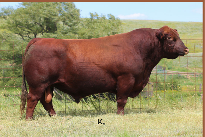
SIXMILE WARcraft 254Z REG: 2459027