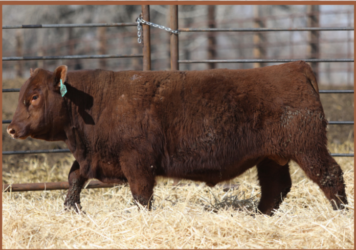
Lot 37 FCR FLAT DIRECTION 048 DOB: 03-29-2020 REG: 4223832 TATTOO: 048

ANDRAS NEW DIRECTION R240 FLATIRON NEW DIRECTION 622 FLATIRON NATIVE FOX 260 ANDRAS NEW DIRECTION R240 DKK PEACE 7075 DKK PEACE 9070 ANDRAS IN FOCUS B152 ANDRAS KURUBA B111 BECKTON EPIC R397 K BCRR NATIVE FOX 031X ANDRAS IN FOCUS B152 ANDRAS KURUBA B111 MESSMER PACKER S008 DKK PEACE 991