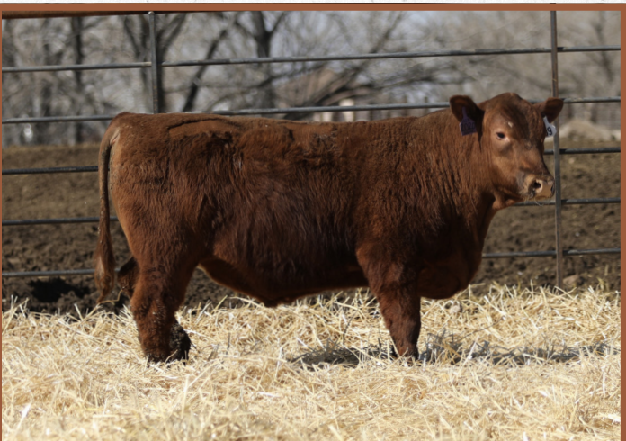
Lot 39 253K PRIME LEGEND 2020 DOB: 03-26-2020 REG: 4397389 TATTOO: 2020

BECKTON EPIC R397 K BROWN BLW LEGEND A1965 HXC PATRICIA ROSE 102Y PCHFRK PRIME 1323 VGW PRIME-RED P1523 VGW GP-RED P0704 BECKTON EPIC K F075 BECKTON KIT F468 JL BECKTON NEBULA P P707 HXC 502R BROWN ALLIANCE X7795 PCHFRK CRYSTAL PACKER R5179 VGW GAME PLAN 508 VGW NC-RED P0512