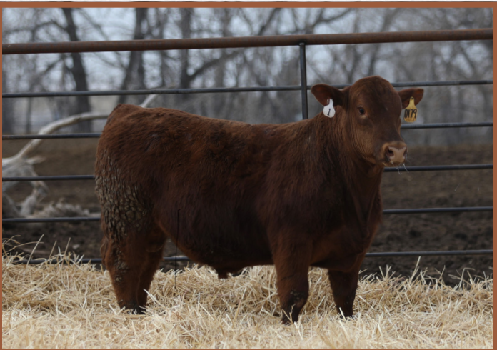
Lot 1 LIKE PLATINUM 0179 DOB: 02-16-2020 REG: 4398279 TATTOO: 0179

BROWN INCREDABULL Z7277 LSF MEW PLATINUM 5660C BROWN MS NEW STANDARD A7053 LSF HERDBUILDER 1058Y TBJR FLORA 411 MFIN MISS LOGAN S30 S A V FINAL ANSWER 0035 BROWN MS MISSION STMT X7559 LCC NEW STANDARD BROWN MS DESTINATION U7733 BECKTON EPIC R397 K LSF COVER GIRL S6076 W9037 GLACIER LOGAN 210 MFIN FINCH'S FLORA G6