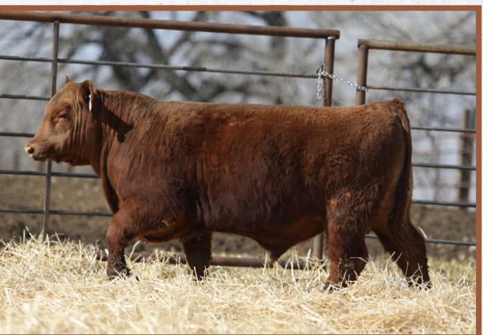
Lot 27 253K ARES 2017 DOB: 03-23-2020 REG: 4397385 TATTOO: 2017

RED SIXMILE TRAVELOCITY 318X RED SIX MILE WARCRAFT 254Z RED SIX MILE PRIDE 902S BECKTON NEBULA Y066 N4 RED ROSE SUM ROSE 201 A1 RED SIX MILE SAKIK 832S RED SIX MILE DUCHESS 739S RED TOWAW INDEED 104H RED PTTV PRIDE 1703 BECKTON NEBULA W065 C3 BECKTON COCA W061 N LJC MISSION STATEMENT P27 DKK ROSE P07