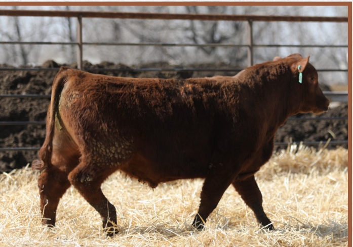
Lot 34 253K ULTIMATE COPPER 2011 DOB: 03-23-2020 REG: 4397379 TATTOO: 2012

BECKTON EPIC K F075 BECKTON EPIC R397 K BECKTON KIT F468 JL SSIX MAJOR SACKETT 0214 SSIX COPPERLASS 0537 SSIX NRTHN COPPERLASS 0038 BECKTON EPIC D404 BECKTON BELGA D483 KR BECKTON JULIAN GG B571 BECKTON KIT A517 NP RED SIX MILE SAKIC 832S SRR JOAN 511-898 SSIX JAV MOONLIGHT 0807 3HRT NORTH COPPERLASS 220