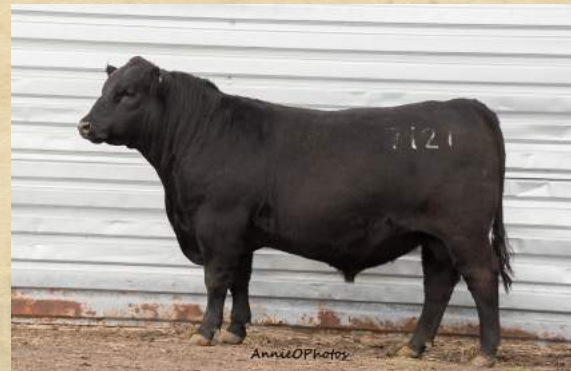
MCCUMBER INFLUENCE 7121 REG #18844405