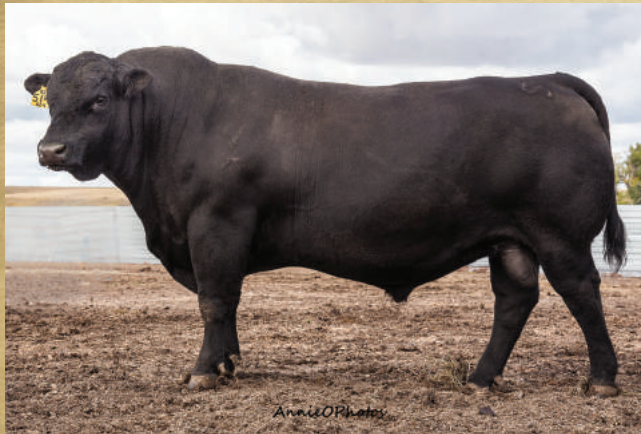
SR DAKOTA 514 REG #18351824