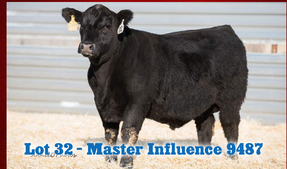
Lot 32 - Master Influence 9487