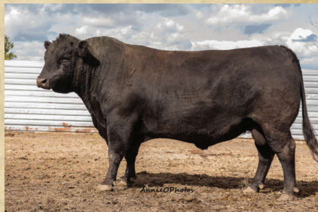
NEEL'S POWER 512 REG #18331603