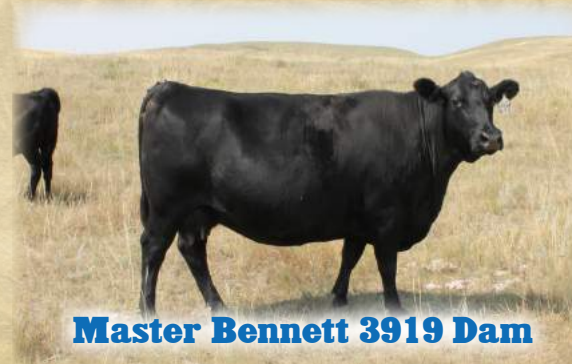
Master Bennett 3919 Dam

MA Blackcap 9919 maternal grand dam to Lot 8. Also dam to Master Bennett 3919, high selling bull in 2014 to GDAR and dam to MA Blackcap 69 lot 8's dam.