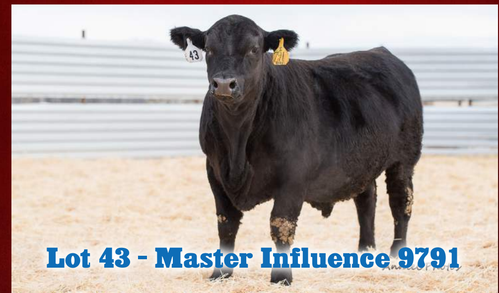
Lot 43 - Master Influence 9791