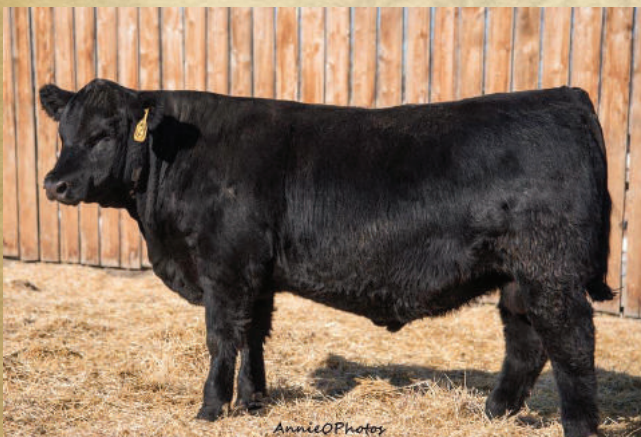
MASTER KEYSTONE 7129 REG #18856975