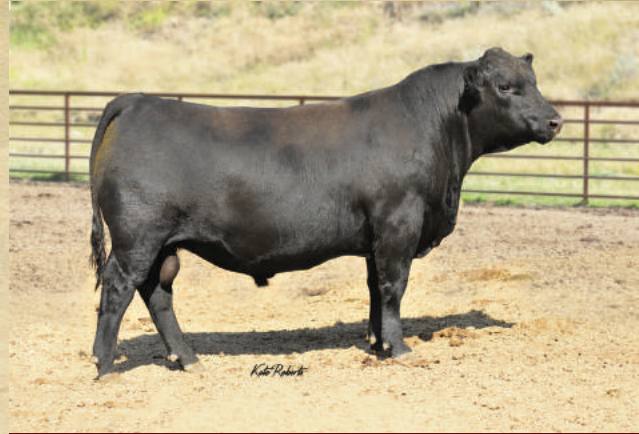
MYTTY LEGEND 5062 REG #18214111