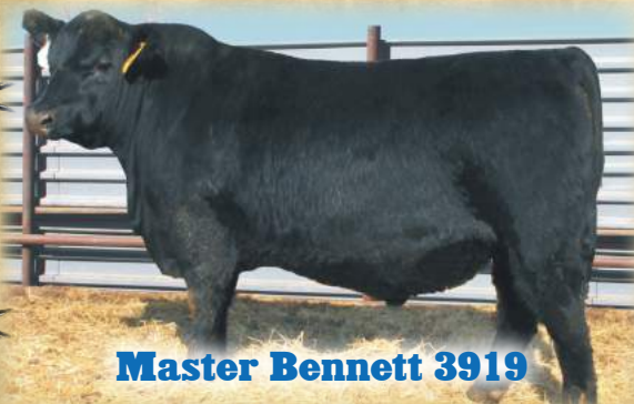
Master Bennett 3919

Projected sale day wt 1541. Gained over 4lbs/day. His dam is full sister to the Bennett bull GDAR bought a couple years ago. This cow family has really performed well for us. 969 is a real herd bull prospect! SC 37.5