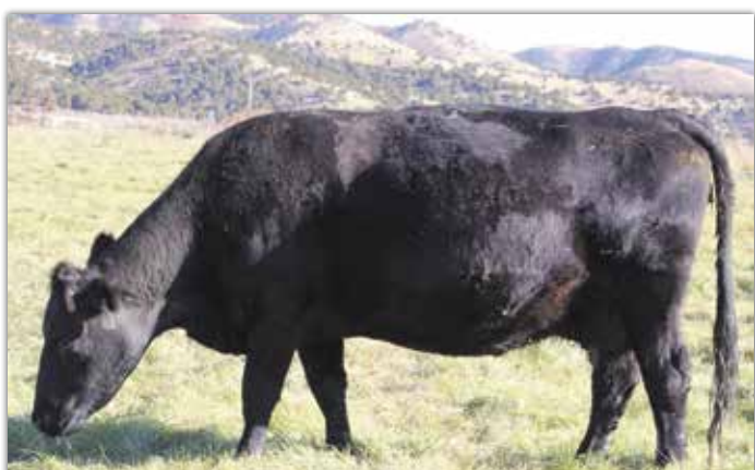
VE 3X Halo 250Z - Dam of Lot 22, pictured at 11-years-old

Purebred Angus. We used 783H on our replacement heifers. We should have a calving report by sale day.